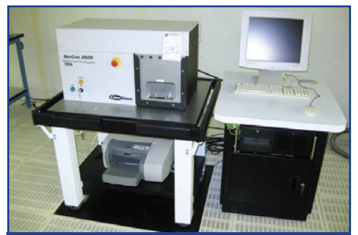
Nor Com 2020-12 Optical Leak Test System