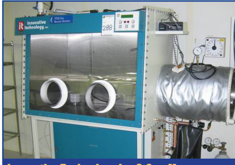
Innovative Technology Inc S-One-