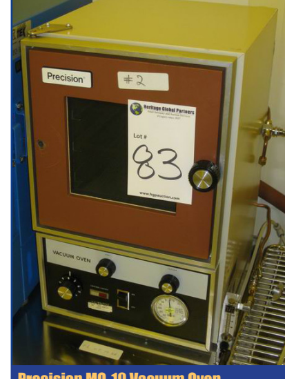
Precision MO-19 Vacuum Oven

Fisher Scientific 93-609Q Safety-Flow Fume Hood