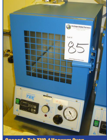
Cascade Tek TVO-1 Vacuum Oven