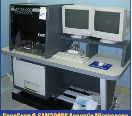
SonoScan C-SAM300DX Acoustic Microscope