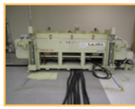
NPC Automated Photovoltaic Module Laminator Model LM-SA-170x370S. QTY:2