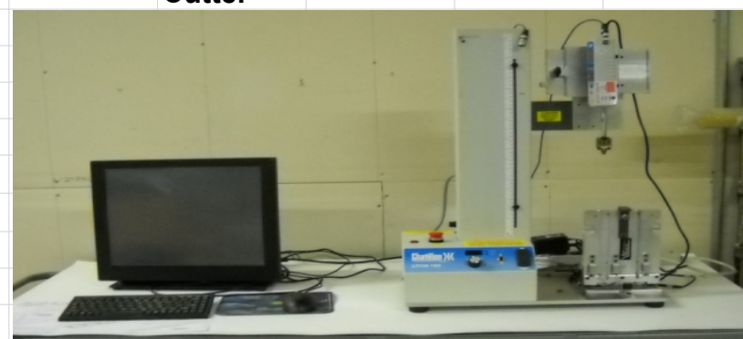
8 Ribbon Pull Tester (Double)