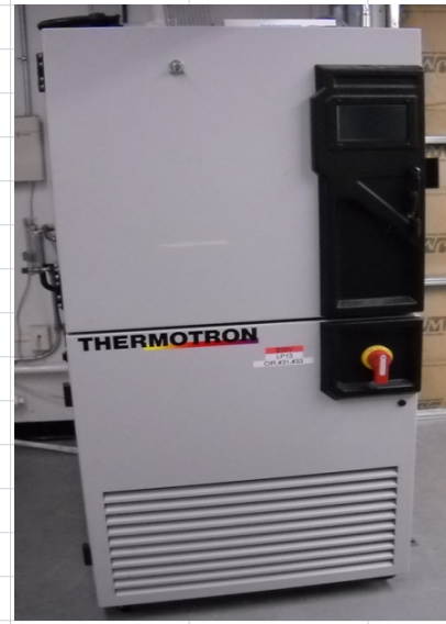
2 Thermotron SM-8-8200 Thermal Chamber