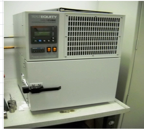
4 Test Equity Half Cube Benchtop Thermal Chamber