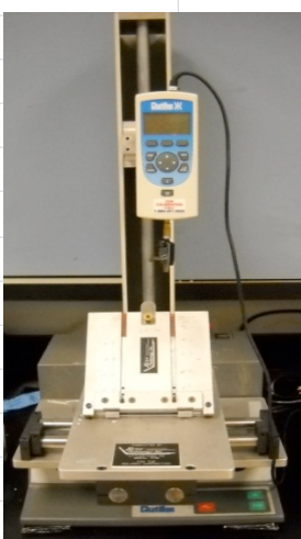
7 Ribbon Pull Tester (Single)