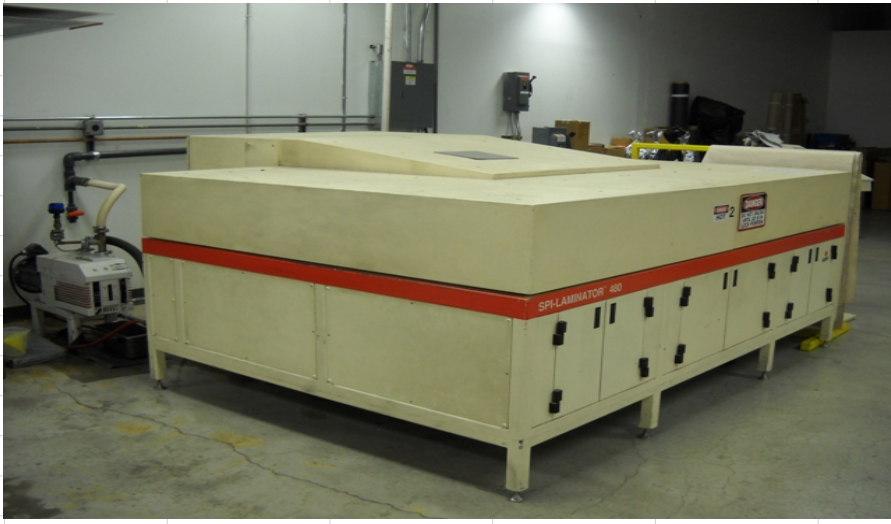
1 Spire 480 Laminator