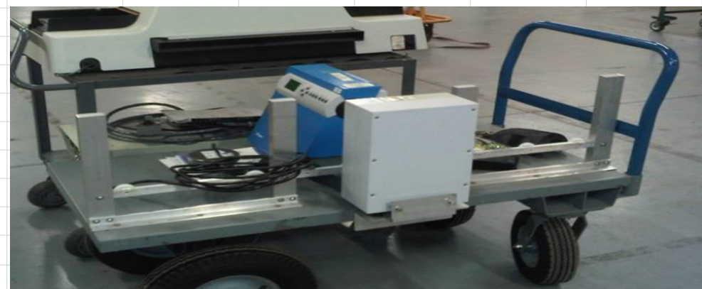
9 byk-Gardner Hazegard Light Transmission instrument