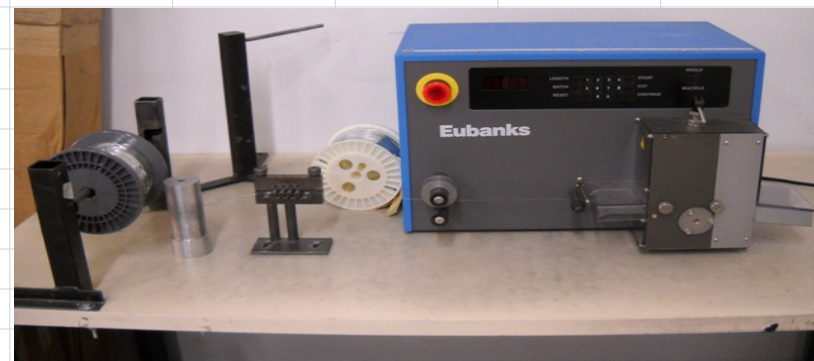
6 Eubanks Busbar/Interconnect Cutter