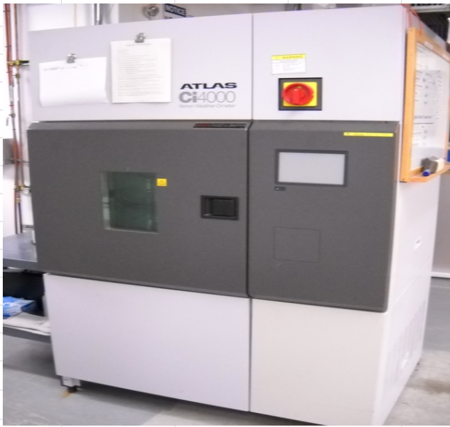
3 Atlas Ci4000 Weatherometer UV Chamber