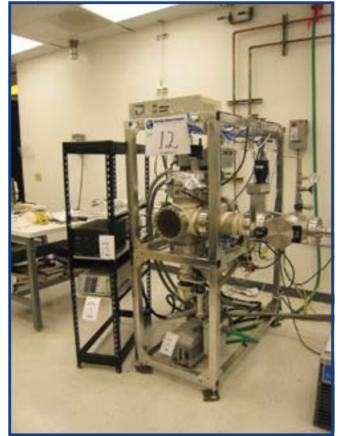
Custom Sputtering System

CVD system w/ RF Generator Mod. T-20-3-KC-TL (450 KHz). Includes glassware, 2 gas cabinets, Leybold Trivac vacuum pump, and Neslab RTE-220 chiller