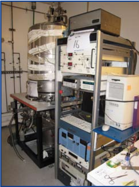
Controlled Environment Process Furnace

Includes Varian 3120 3" x 5" S-Gun Sputtering Syst., with power supplies & controls, Osaka TC1300 Turbomolecular Pump, (2) Granville Phillips Wide Range Controllers, Granville Phillips 270 Vac. Gauge Controller, Granville Phillips Mod. 316 Vac. Gauge Controller, (2) Granville Phillips Mod. 360 Vac. Gauge Controllers, Lambda ESS power supply.