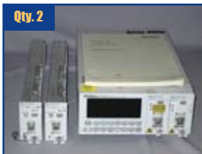
Anritsu MT9810 Optical Test Kit