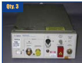
Agilent 83433A Lightwave Transmitter, 10Gb/s