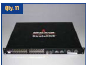
Qty. 11 Broadcom BCM9569R24X2S-02 Strata XGS Network Switch