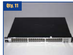
Qty. 11 D-Link DGS-1248T Web Smart Gigabyte Switch