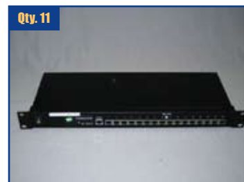
Qty. 11 Digi PortServer TS16 Console Server

To View A Complete listing of Equipment and Full Sale Terms and Conditions, Log onto www.hgpauction.com