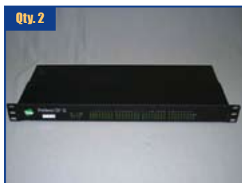
Qty. 2 Digi PortServer CM-32 Console Server