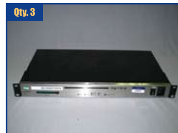
Qty. 3 Digi ConnectWare CM-48 Console Server