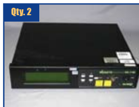
Burleigh WA-1100 Wavemeter Optical Channel Analyzer