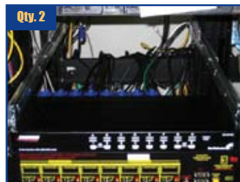
Star Tech SV1631HD