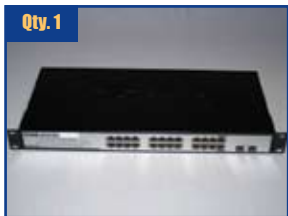
Qty. 1 D-Link Web Smart Gigabyte Switch