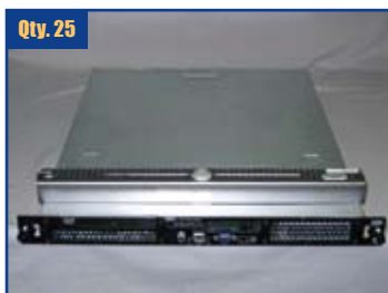
Qty. 25 Dell R200 2U PowerEdge Xeon Server