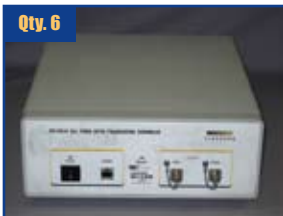
Fiberpro PS-155-A All Fiber Optic Polarization Scrambler