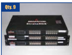
Qty. 9 Broadcom Strata XGS Network Switches