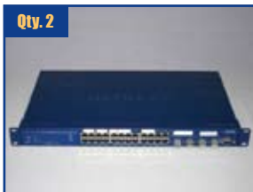
Qty. 2 Netgear GSM7224 Gigabit Switch