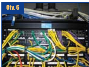
Qty. 6 Dell 6248 PowerConnect Gigabyte Switch