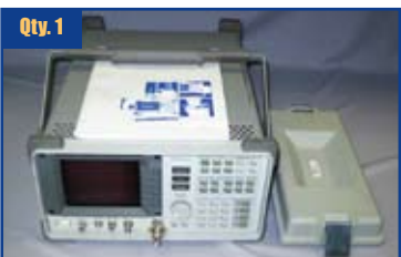
Hewlett Packard 8592A

InfiniiMax 5GHz Active Probe Amplifier Unit