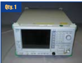
Anritsu MG9638A Tunable Laser Source