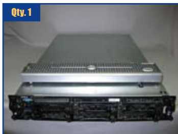
Qty. 1 Dell 2850 2U PowerEdge Dual Xeon Server