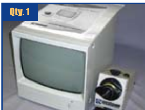
Westover FV-200 Video Fiber Microscope