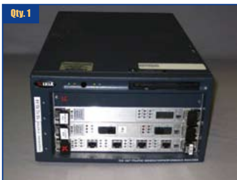
Ixia 400T Traffic Generator / Performance Analyzer