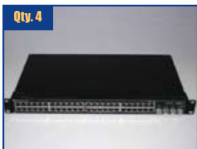
Qty. 4 Dell 2748 PowerConnect Gigabyte Switch