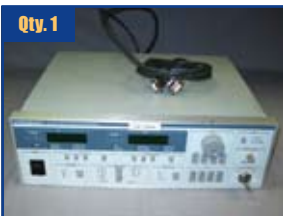
ILX Lightwave LDC-3900 Modular Laser Diode Controller