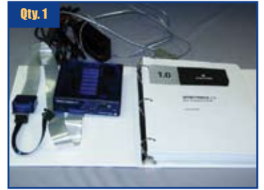
Wind River PowerICE