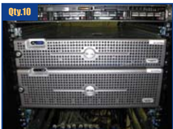
Qty. 10 Dell 2950 2U PowerEdge Dual Xeon Server & Storage Quad Xeon Array