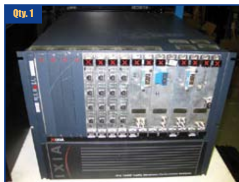
Ixia 1600T Traffic Generator / Performance Analyzer