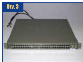
Qty. 3 D-Link DXS-3350SR xStack Gigabyte Switch