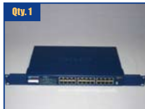
Qty. 1 Netgear GS524T Gigabit Switch