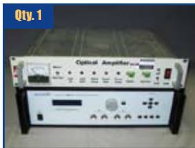
General Photonics ODG-101 TimeRite Programmable Optical Delay Generator