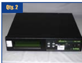
Burleigh WA-1600 Wavemeter Optical Channel Analyzer