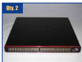
Qty. 2 Broadcom BCM956624K49S-02 Network Switch