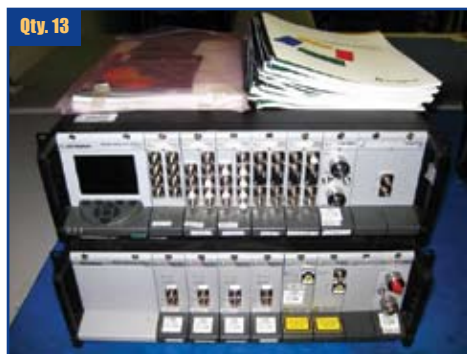
JDS Uniphase MAP Multiple Application Platform