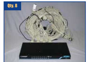
Black Box KV108A-R2