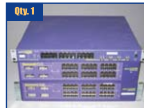
Qty. 1 Extreme Networks Network Switches