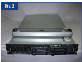
Qty. 2 Dell 2650 2U PowerEdge Dual Xeon Server