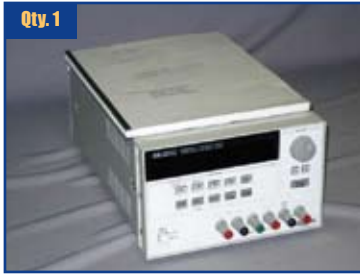
Hewlett Packard E3631A