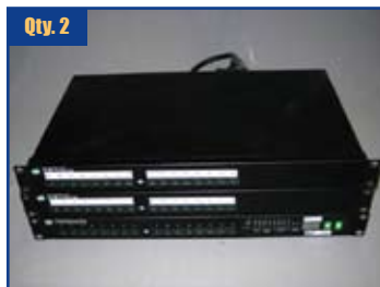
Qty. 2 Digi PortServer II16 Console Server