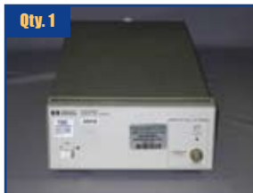
HP 83438A Erbium ASE Source