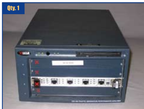
Ixia 400T Traffic Generator / Performance Analyzer