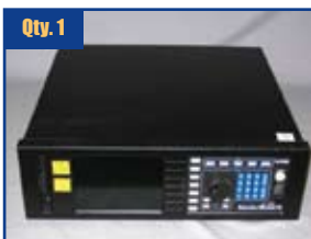
Burleigh WA-7100 Wavemeter Optical Channel Analyzer