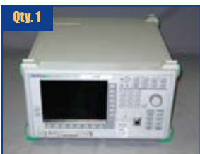
Anritsu MS9710B Optical Spectrum Analyzer