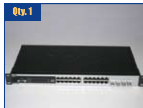
Qty. 1 D-Link DGS-3324SR xStack Gigabyte Switch