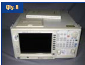
Ando AQ6317B Optical Spectrum Analyzer