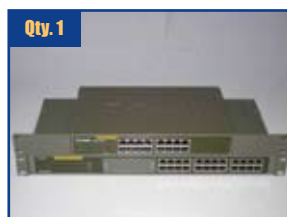
Qty. 1 D-Link Network Switches