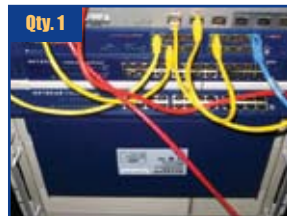
Qty. 1 Netgear Network Switches