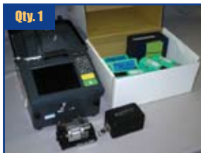
Fitel S175 Optical Fiber Fusion Splicer