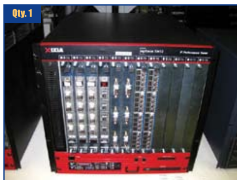
Ixia XM12 Optixia IP Performance Tester