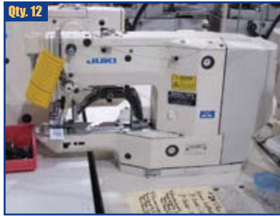
Qty. 12 Juki LK-1900 Electronic Bartacker