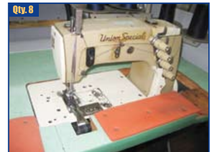
Qty. 8 Union Special 56500 Two Needle Chainstitch