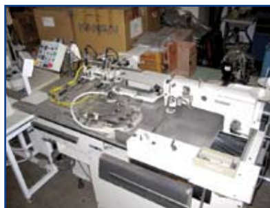
Brother BAS-760 Automatic Pocket Setter