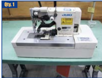
Qty. 1 Juki MBH-180 Chainstitch Buttonhole