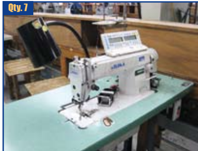
Qty. 7 Juki DDL-5550-7 Single Needle Lockstitch