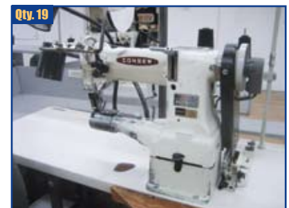
Qty. 19 Consew 223 Single Needle Lockstitch, Cylinder Arm