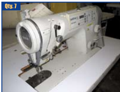
Qty. 7 Brother LZ-B856E Automatic Zig Zag Machine