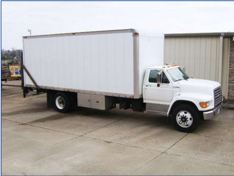
1995 Ford Truck