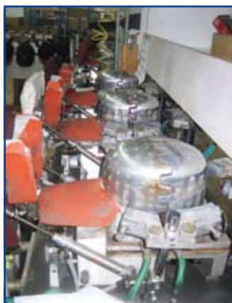
HK-601 / HK-302-S