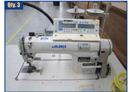
Qty. 3 Juki DDL-8500-7 Single Needle Lockstitch