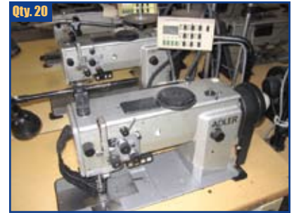
Qty. 20 Durkopp Adler 767 Single Needle Walking Machines