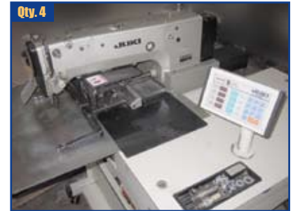
Qty. 4 Juki AMS-220A Programable Trackers