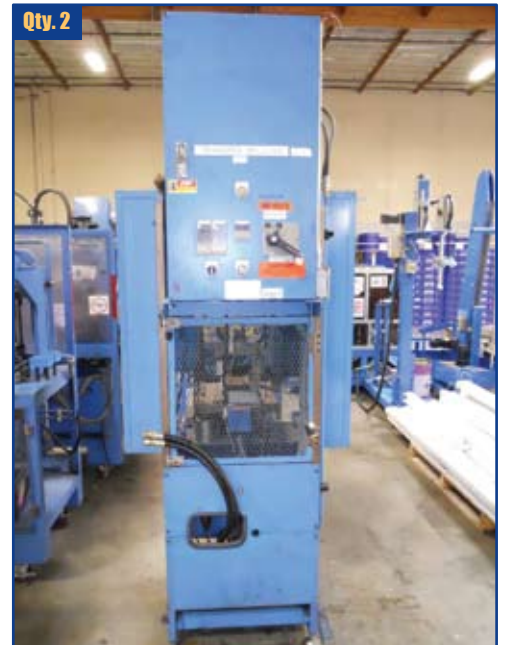
Toyoda Gosei Glass Run Transfer Molding

4-Ton Pneumatic Transfer Molding Press, Top Clamp / Bottom Injection ,480V, 50/60Hz, 1ph, 10.3A, W/ Tokimec Directional Flow Valve Model # COM-33C-70-SH-11-S4, Tokimec Directional Valve Model # DG4V-3-2C-M-D7-H-7-S2, (2) TAIYO 140H-8R (UPPER & LOWER) Hydraulic Cylinder, and Light Curtain Safety Sensors, (2) Omron E5EN Upper/Lower Mold Temperature Control, (2) OMRON H3CA Upper/Lower Mold Timers. (hydraulic pumps not included).