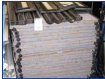
Steel Frame Office Cubicles