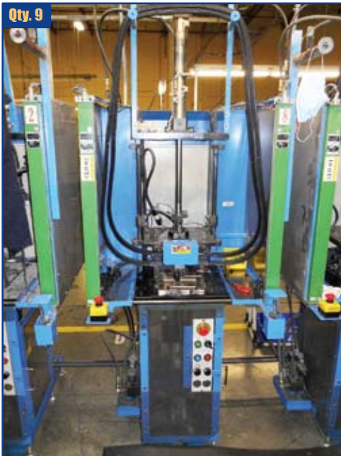
Shinyo Koki 1.4 Ton Press

1.4 Ton Pneumatic Transfer Molding Press, Top Clamp / Bottom Injection, 480V, 50/60Hz, 1ph, 3.1A, MFG 2001, W/ Tokimec Valve Model # COM-33C-30-SH-1-S4, SunX-SB40-20M5P Light Curtain, Taiyo 70H-8R Upper Hydraulic Cylinder, CKD SCA2-00-100B-100 Lower Hydraulic Cylinder, (2) Omron E5EN Upper/Lower Mold Temperature Controllers, (2) Omron H3CA Mold Timers. (hydraulic pumps not included).