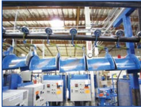
Steel Roller Hangers