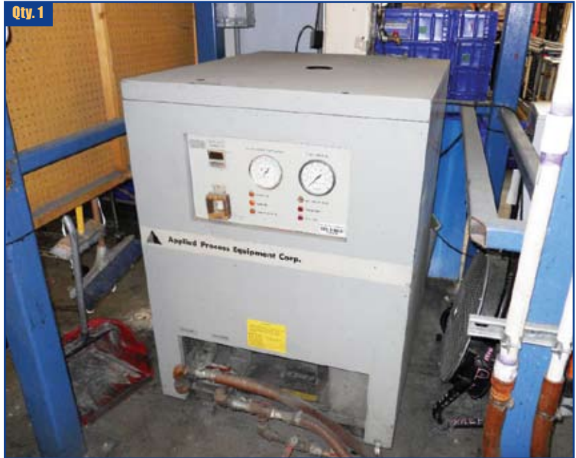
Applied Process Equipment Corporation