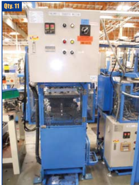
Shinyo Koki 4 Ton Press

1.4 Ton Pneumatic Transfer Molding Press, Top Clamp / Bottom Injection, 480V, 50/60Hz, 1ph, 3.1A, MFG 2001, W/ Tokimec Valve Model # COM-33C-30-SH-1-S4, SunX-SB40-20M5P Light Curtain, Taiyo 70H-8R Upper Hydraulic Cylinder, CKD SCA2-00-100B-100 Lower Hydraulic Cylinder, (2) Omron E5EN Upper/Lower Mold Temperature Controllers, (2) Omron H3CA Mold Timers. (hydraulic pumps not included).