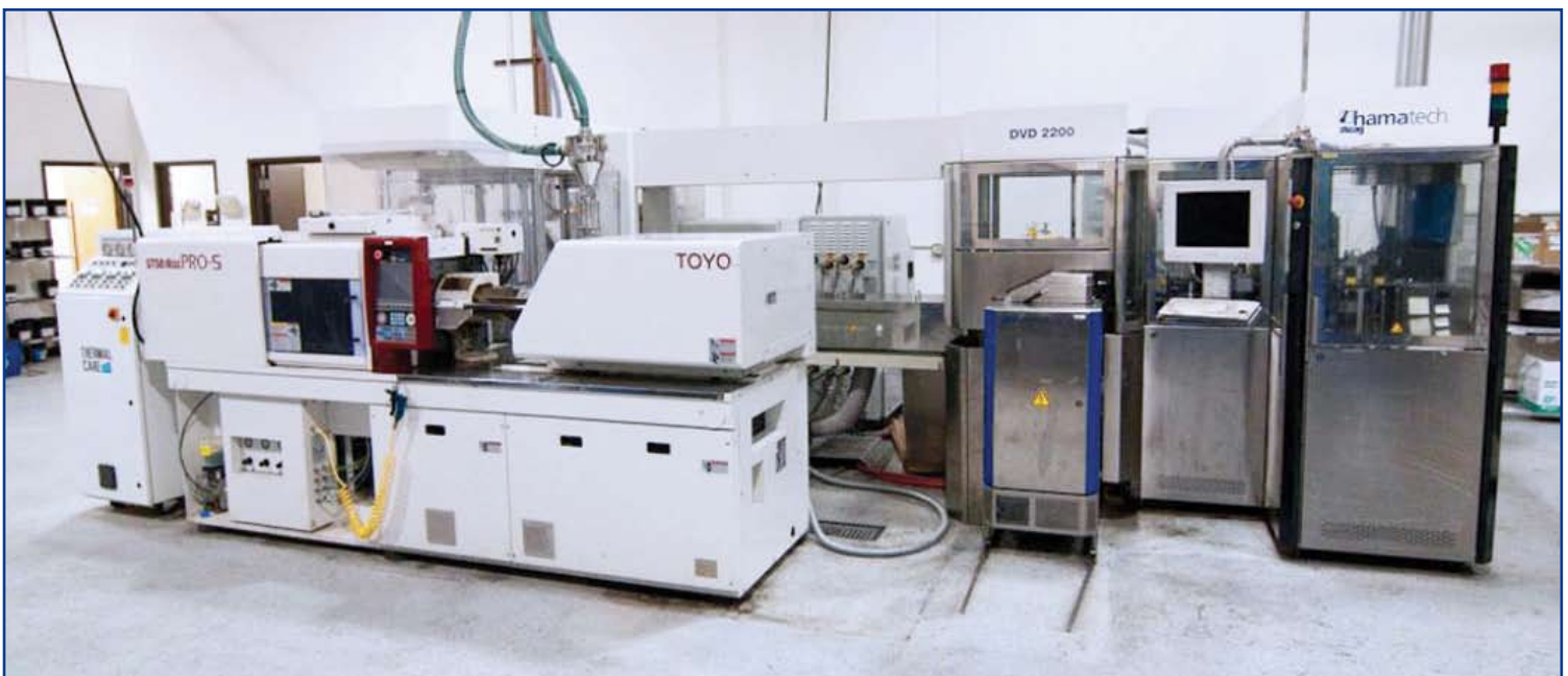
Steag Hamatech - DVD 2200 III

DVD/CD replication line, (2) Toyo ST50 Plastar PRO-S plastic injection molders. Includes Conair feeder hopper, robotic unloading, lacquer application, dual sputter/ metalizing stations, dual scanner station, UV flash cure unit, cooling unit, and (2) ThermalCare temperature controllers, mfg. 2004