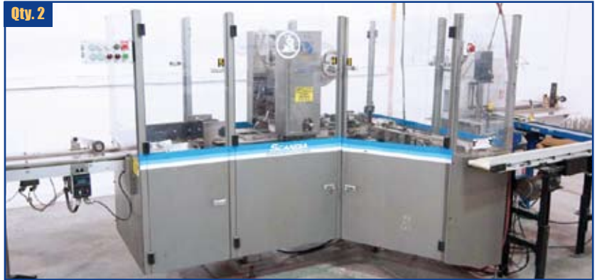
Scandia - 626