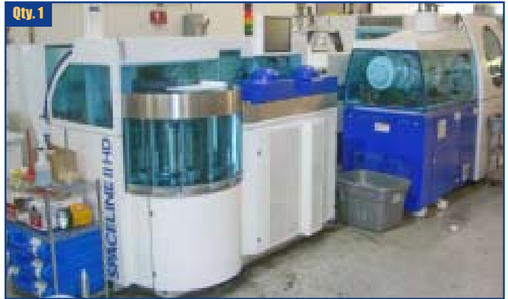
Singulus Spaceline II

Hd Dvd/cd Replication Line, (2) Moldpro Plastic Injection Molders (2005)