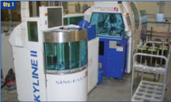
Singulus Skyline II

Cd Replication Line, Moldpro Plastic Injection Molder (2005)