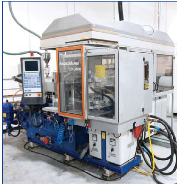
Kraus Maffei - 80/190

Cd Replication Line, Plastic Injection Molding. Conair Feeder Hopper, Robotic Unloading, Lacquer Application, Sputterer/ Metalizing Station, Single Scanner Station, Uv Flash Cure Unit, Cooling Unit, and Pfeiffer Tcp 121 Vacuum Pump/ Power Supply, Qty 3