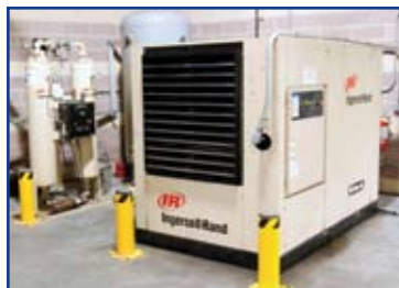
Ingersoll Rand - Sierra H60A

Hopper, Steel, Conical Bottom, ~75 Cubic Ft. Includes Pneumatic Conveying Equipment and Piping, Dryer Control System