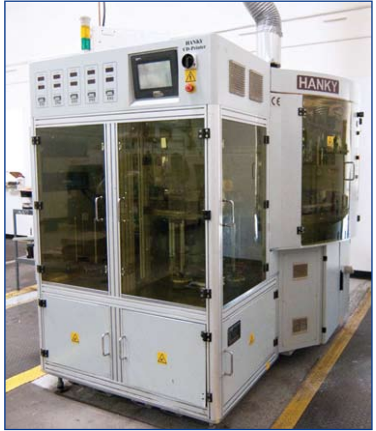
Hanky - CD-5000HV

CD/DVD printer, (5) station screen printing, UV curing, rotary carousel, mfg. 2005