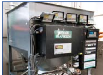
Conair - CD200/D1040/ Hopper

Hopper, Steel, Conical Bottom, ~75 Cubic Ft. Includes Pneumatic Conveying Equipment and Piping, Dryer Control System