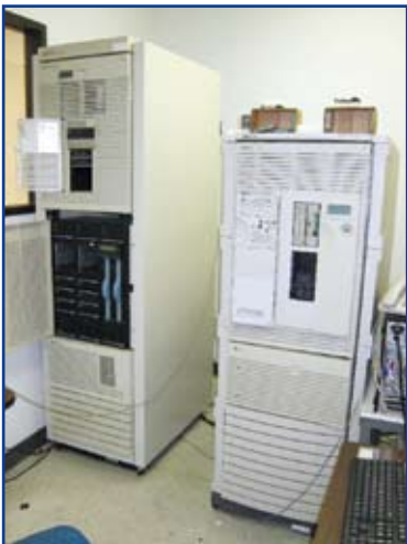
HP - K 570

K Class Server Rack, product #A3641A. Includes (1) A3715A / S865B10027B fast CD ROM drive; (1) A3542A GB00901187, 12 GB DDS 3 DAT tape drive