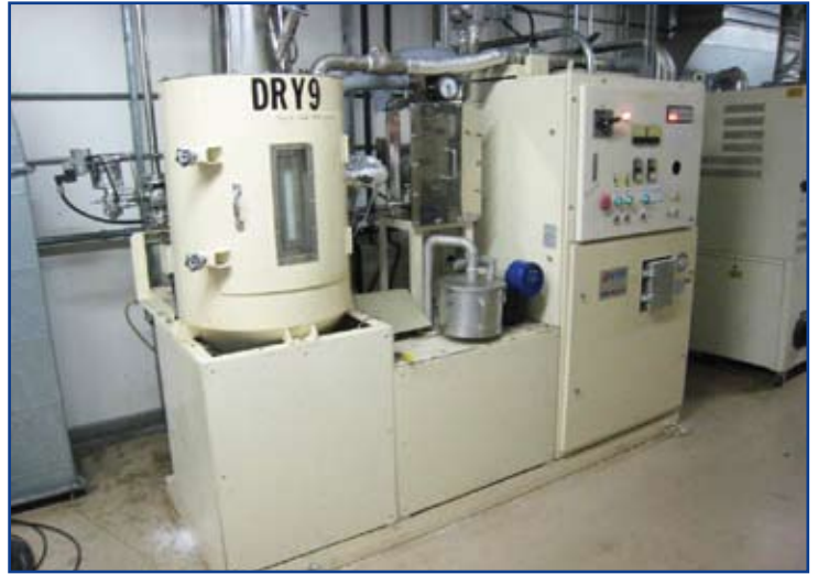
Kawata - System D-100

Lot: 3 Dryers with central feeding system. Includes: (2) 300 liter tanks, (1) 200 liter tank; Piovan CD200 Dual system central feeder (2006)