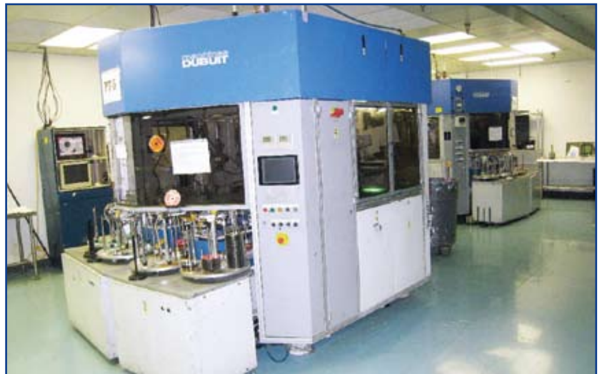
Dubuit - 468DP (Quantity 3)