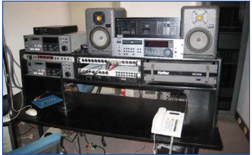
Hafler, Sadi E, and Sony

Disk Editor, Audio Processors, Audio Editor, Tape Analyzers, Digital Master Recorder, Digital Audio Recorder and BSL Spindle Motor