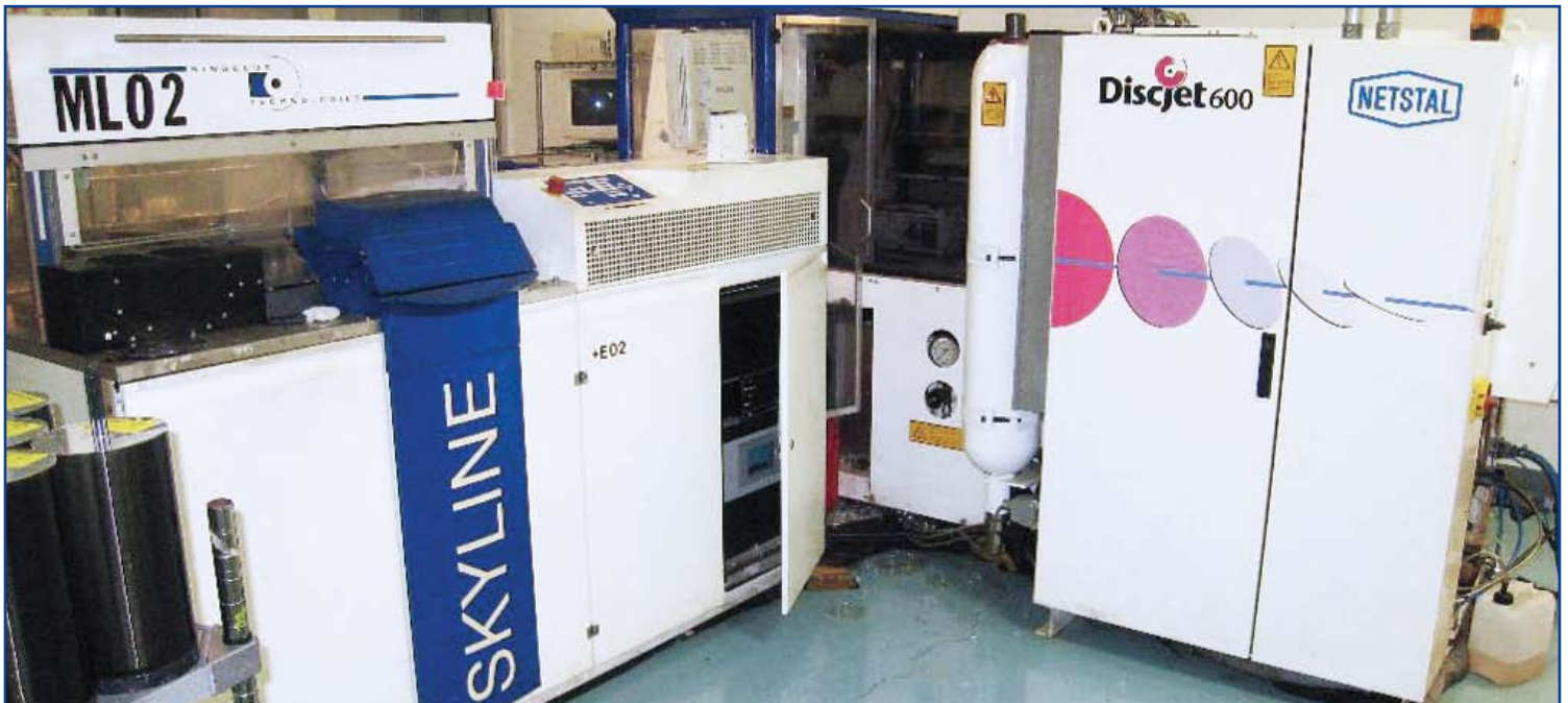
Singulus - Skyline (Quantity 4)

Speedline Integrated Dual Line CD replication. Includes 2 Nestal Discjet 600 presses with Axxicon molds, Singulus metalizer, UV coat, and Dr. Schenk inspection unit