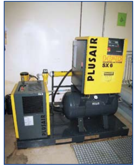
Kaeser - Pulsair SX 6

75 HP Air Compressor, rotary screw, oil free, 2 stage, Includes Zurn model # R-65W air dryer