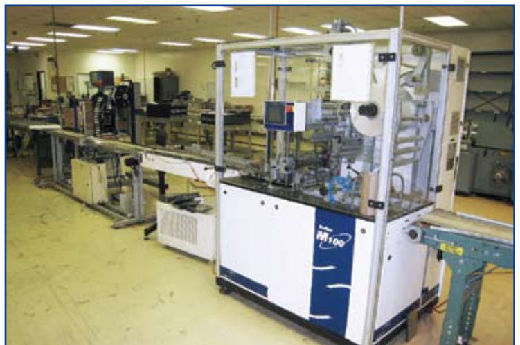
Sollas - M-100

Shrink Wrapper Machine with side sealer.