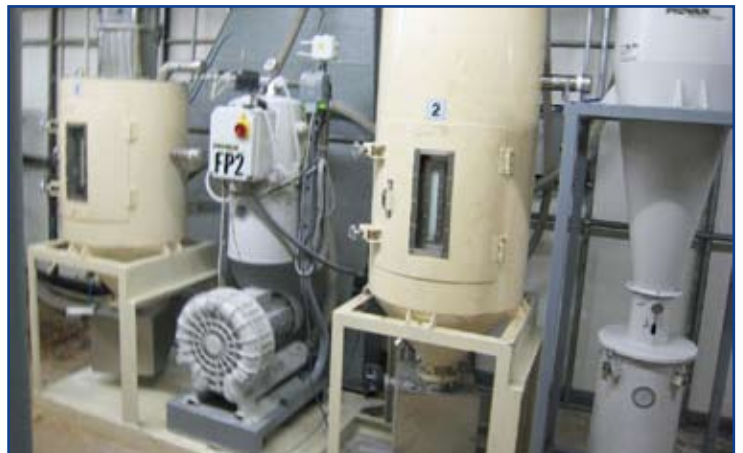
Piovan - CDN 1/2

Lot: 3 Dryers with central feeding system. Includes: (2) 300 liter tanks, (1) 200 liter tank; Piovan CD200 Dual system central feeder (2006)