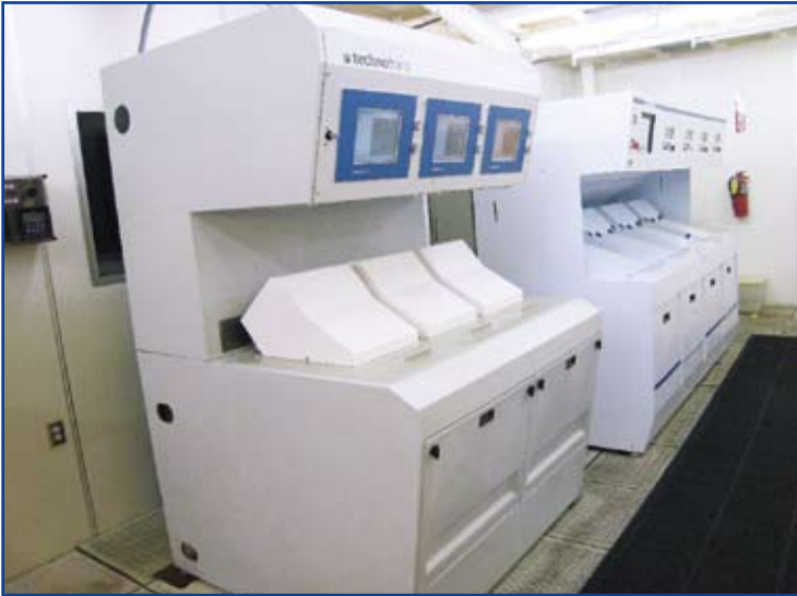
Technotrans - 691.02.0001