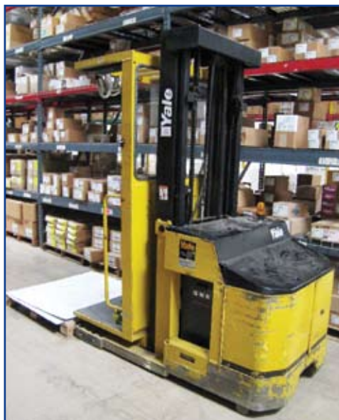
Yale - OSO30EAN24TE095

Stand up electric forklift, 3250 lb. max cap.