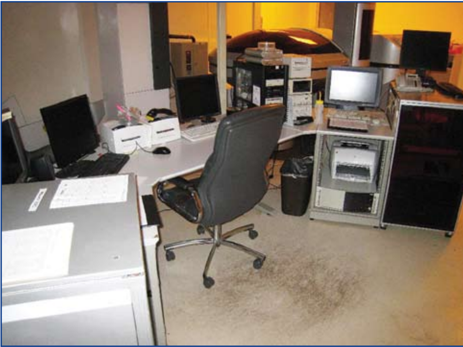
Nimbus - Pi (Quantity 2)

Mastering System CD and DVD (Central Console)