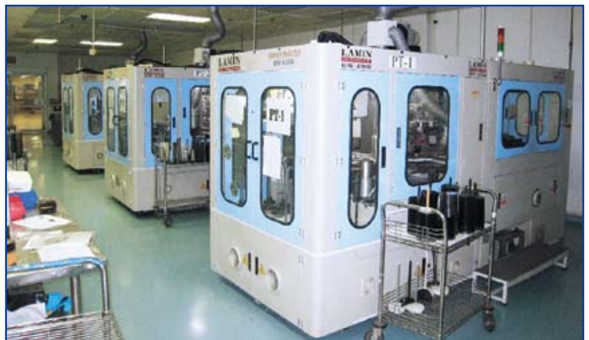
Lamin - HW-430M (Quantity 3)

CD/ DVD Offset Printing Machine, 6 color, prints both 80mm and 120mm