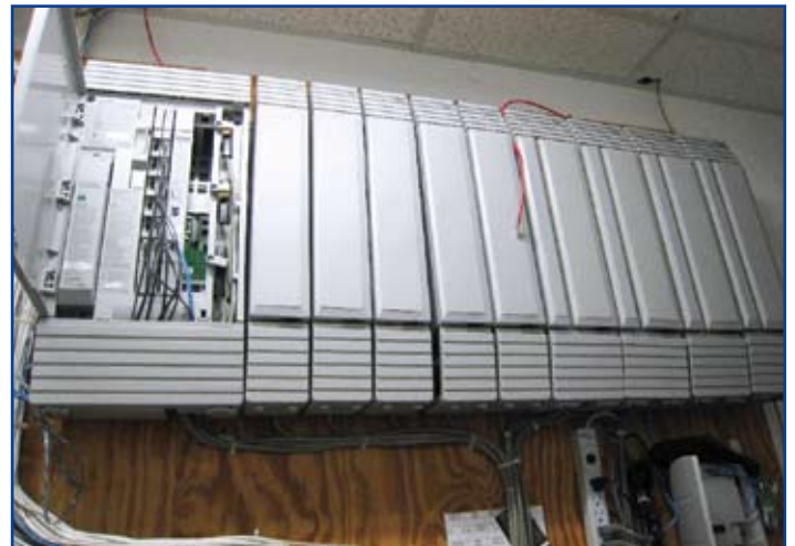
Nortel - Nortel Plus

Phone system. Modular ICS cabinet. 2 cabinets, (1) main module, (9) modules. Includes Call Pilot 150/ Mini, 100+ Nortel Platinum model T7316 #NT8B27AABB digital handsets