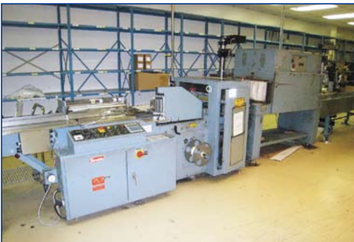
Shanklin - F5A

Shrink Wrapper Machine with side sealer.