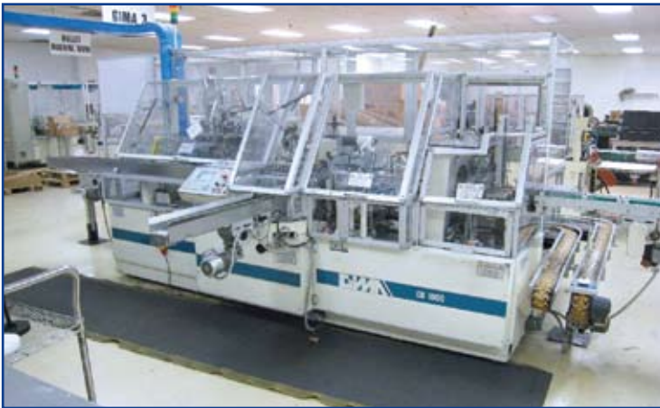
Gima - CD 811 (Quantity 2), CD 822 and CD 840 (Quantity 1)

Gima CD 811 Piccola Packaging Machines, jewel case packaging, (qty 2)/ Gima CD 840 and CD 822 Wallet Case Packaging Machines (qty 1)