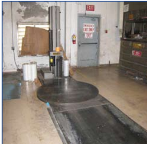
Liberty - 4 Series