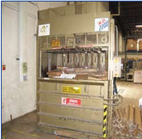
Piqua - HD 2200

HPC air compressor system, Pulsair TA5 dryer unit