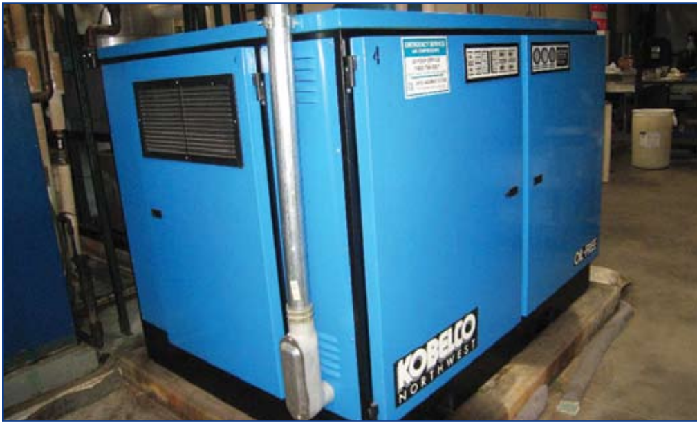
Kobelco - KNW O-W/H

75 HP Air Compressor, rotary screw, oil free, 2 stage, Includes Zurn model # R-65W air dryer