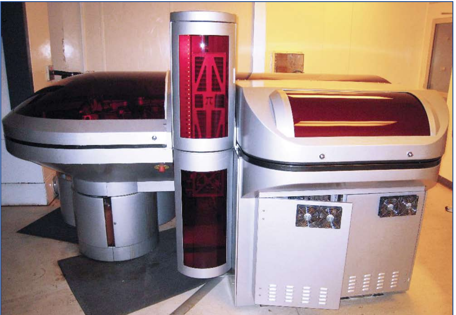
Nimbus - Pi (Quantity 2)