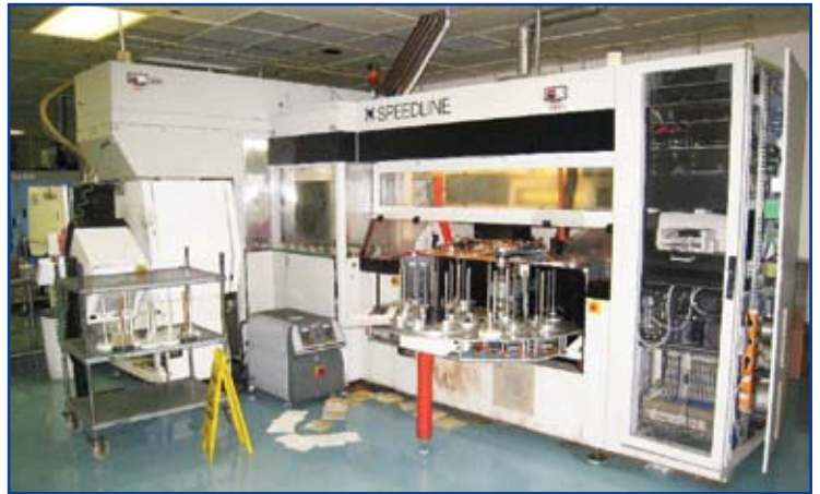
Leybold(Singulus) - Speedline (Quantity 3)

Speedline Integrated Dual Line CD replication. Includes 2 Nestal Discjet 600 presses with Axxicon molds, Singulus metalizer, UV coat, and Dr. Schenk inspection unit