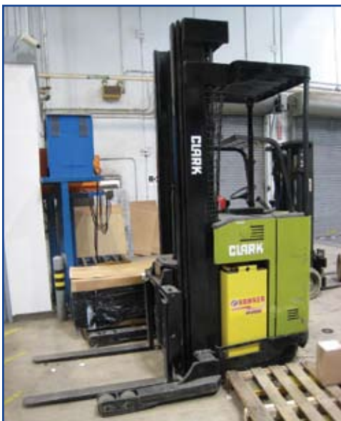
Clark - NPR 20

Stand up electric forklift, 3250 lb. max cap.