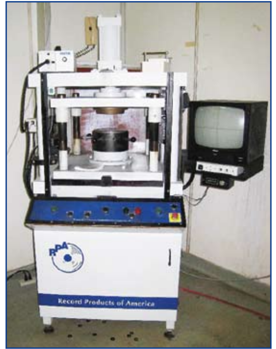
RPA - P-114

Mastering System CD and DVD (Central Console)