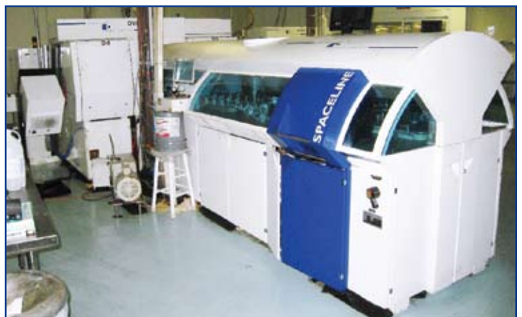
Singulus - Spaceline (Quantity 2) and Spaceline II (Quantity 1)

Spaceline II DVD Mfg. Line: Includes (2) Nestal E-Jet Presses with Axxicon molds, (2) Singulus metalizers, bonding station, and inspection unit, Both 5 & 9 formats