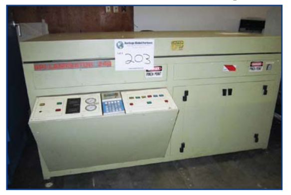
Spire Laminator 240