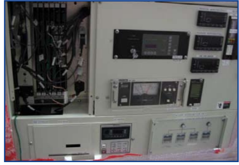
Semes / KDNS KSpin 8 DUV