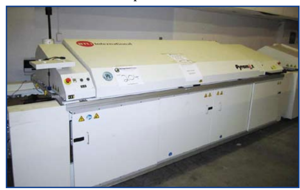
BTU Pyramax 98 Series