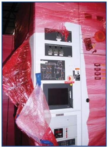
TEL Tokyo Alpha 8S