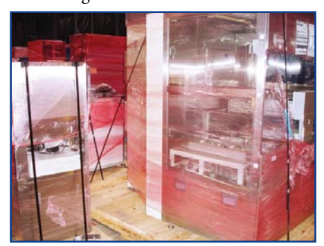
PSK Ashing Ultima III