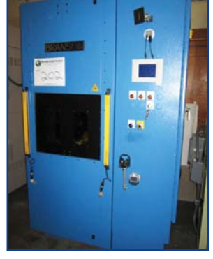
Branson IRAM 200