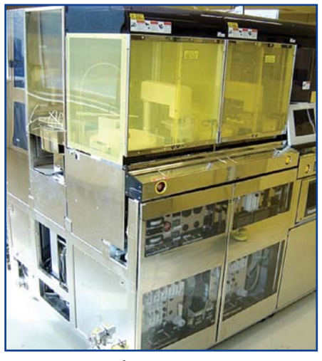
KLA-Tencor Thermawave OP-2600