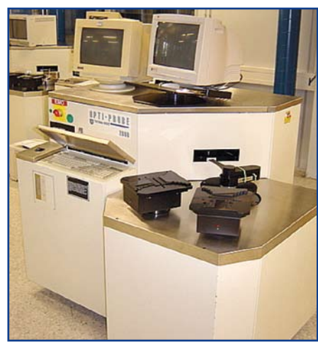
KLA-Tencor Thermawave OP-2600