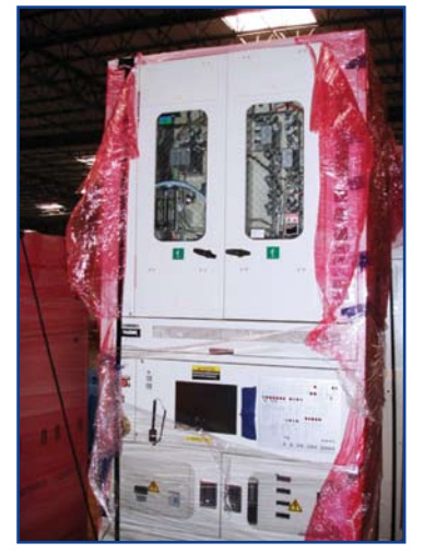
TEL Alpha 8SE BPSG