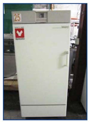
Yamato DKN 812