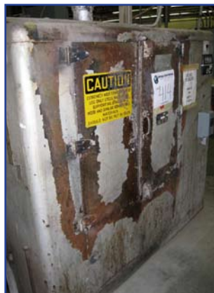
Despatch CF-32 Curing Oven