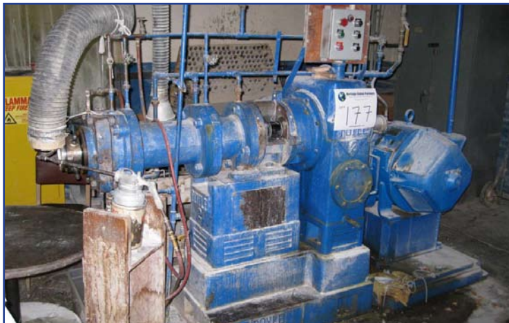
Royle 2 Extruding Machine