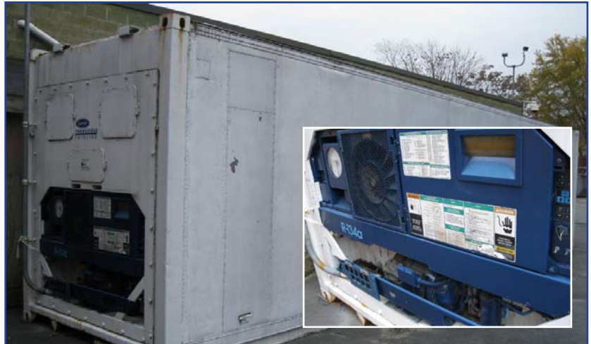
Carrier Transicold Thinline Walk-in Cooler, 40' x 8' x 9.5'