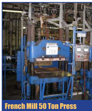
French Mill 50 Ton Press