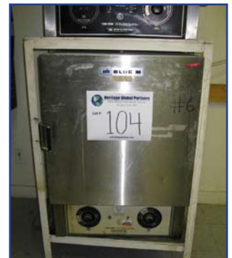
Blue M OV-520C-2 Oven