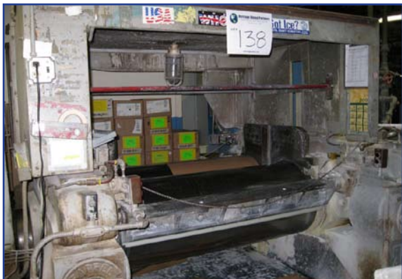
Farrel 2 Roll Mill, 60" x 22"