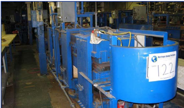
French Mill Machinery Co. 330 Ton Vertical Press - Qty 5

Full Sales Catalog Available online @ www.HGPauction.com