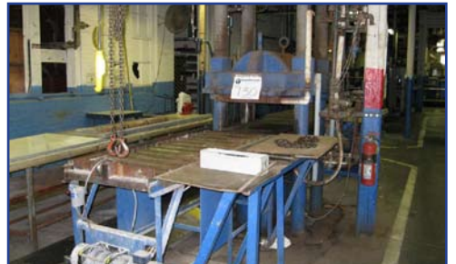
170 Ton Vertical Hydraulic Through Feed Press