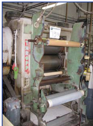
Thropp 3 Roll Calendar, 36"