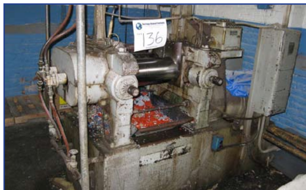
Thropp 2 Roll Calendar, 18" x 8"