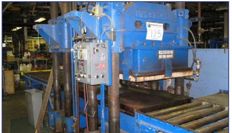
Birdsboro 380 Ton Vertical Through Feed Press