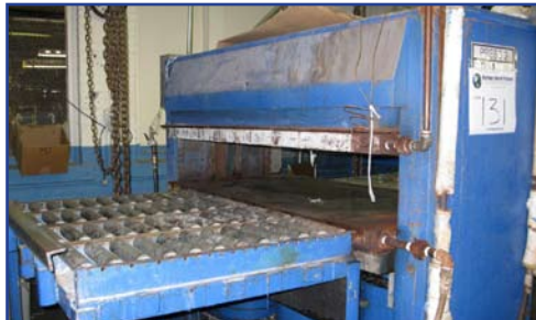
85 Ton Vertical Hydraulic Through Feed Press