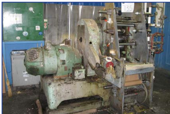
Thropp 3 Roll Calendar, 16" x 6"