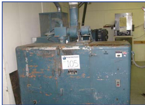
Despatch CF-26 Electric Oven