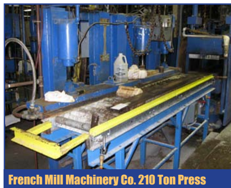
French Mill Machinery Co. 210 Ton Press