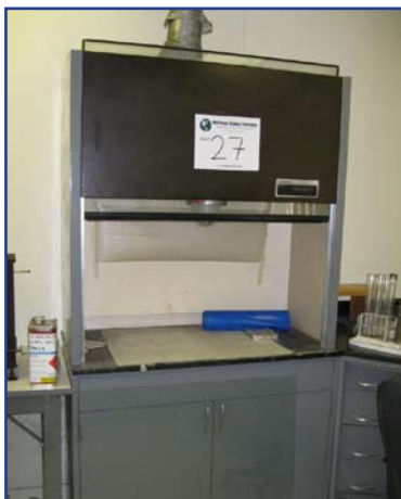
Labconco Fume Hood - 4 ft.