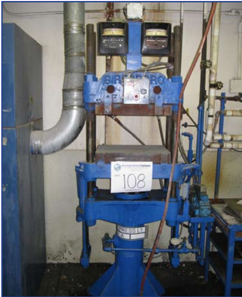
Birdsboro 15 Ton Vertical Press - Qty 2