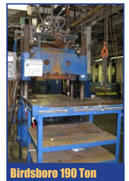
Birdsboro 190 Ton