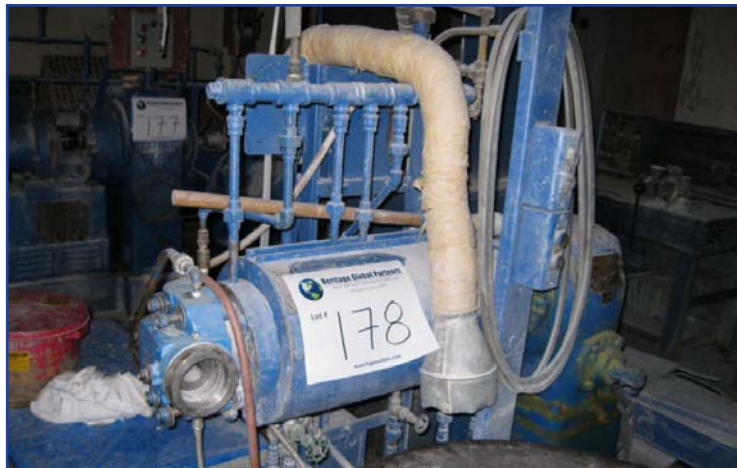
Royle 1 Extruding Machine