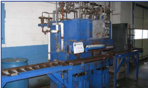
French Mill Machinery Co. 75 Ton Vertical Press