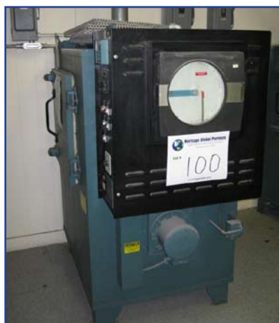
Grieve HA-650 Electric Oven