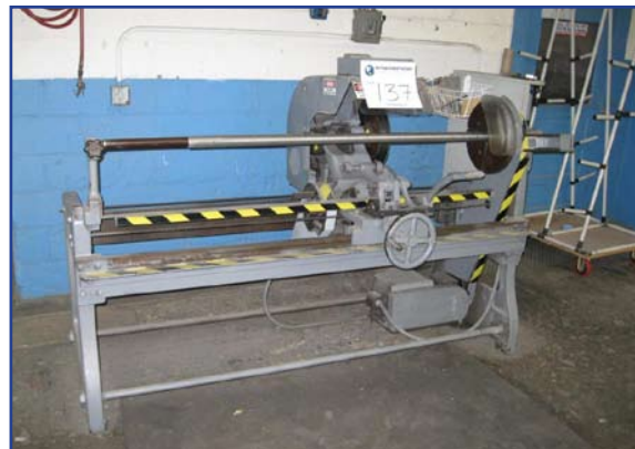
Judelshon Slitter, 15"