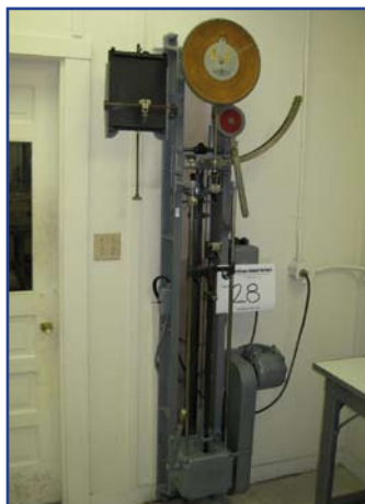
Scott Testers, Inc. Tester