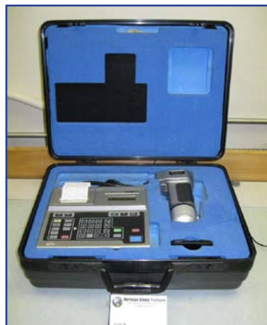
Minolta CR 200 Meter