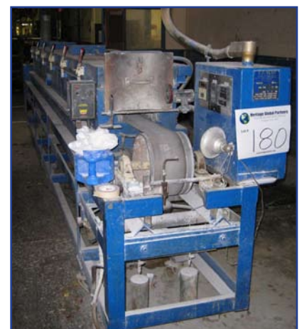
E. B. Blue Curing Oven