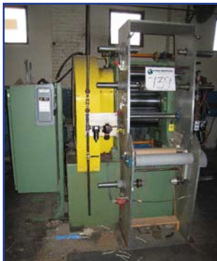
Bolling 3 Roll Calendar