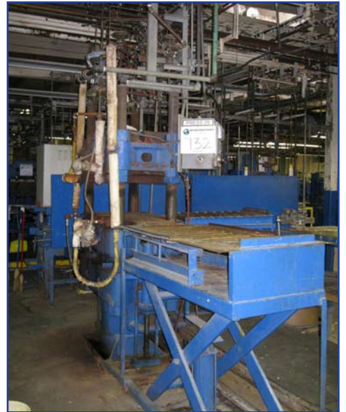
Birdsboro 85 Ton Vertical Press

Full Sales Catalog Available online @ www.HGPauction.com