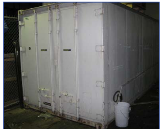
Fruehauf Walk in Cooler, 20' x 7.5' x 8'