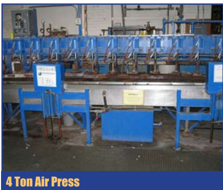
4 Ton Air Press