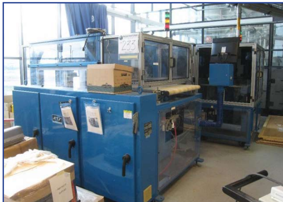
Roth & Rau Silicon Nitride Line