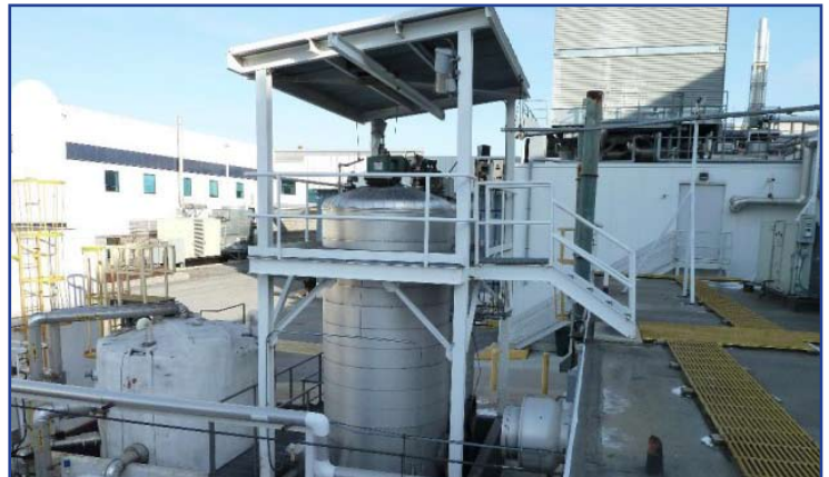
Stainless Steel Jacketed Slurry Tanks