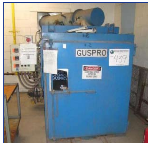
Guspro Burn Off Oven, Dual Stage