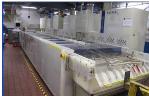
Rena InWaClean Wafer Cleaner, 12 Module