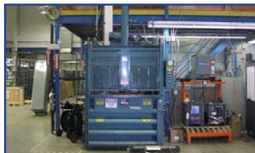
Philadelphia Tramrail 3400 HD