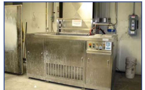
Crest OC1-4020 Ultrasonic Washer