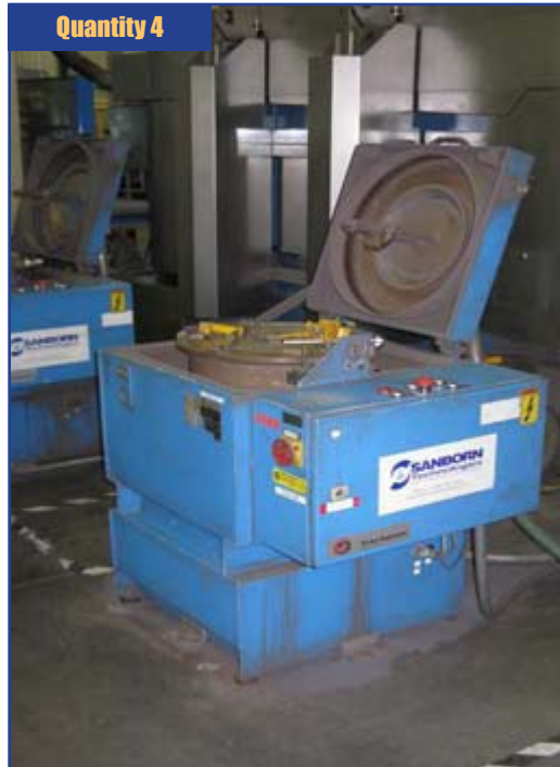
Sanborn Technologies MZF T22 Turbo Separator