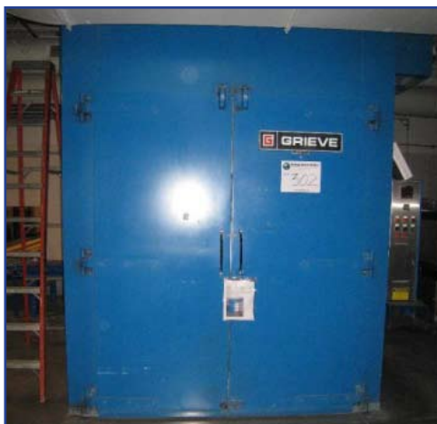
Grieve Special Walk In Oven