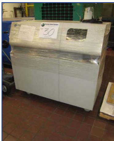
Thermo Jarrell Ash Iris 1000