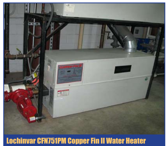
Lochinvar CFN751PM Copper Fin II Water Heater