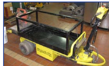
DJ Products Inc. Wagon Caddy