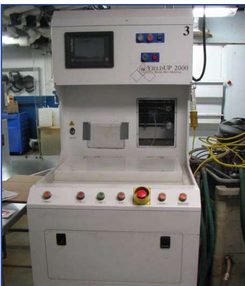
FSI/ Yield Up Immersion 2000 Wafer Dryer