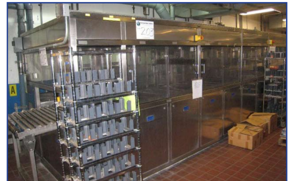
Elma HS350/1100/300/6-ABS-WLT Wafer Cleaner