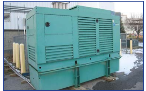
Cummins DFAB-5563454 Generator