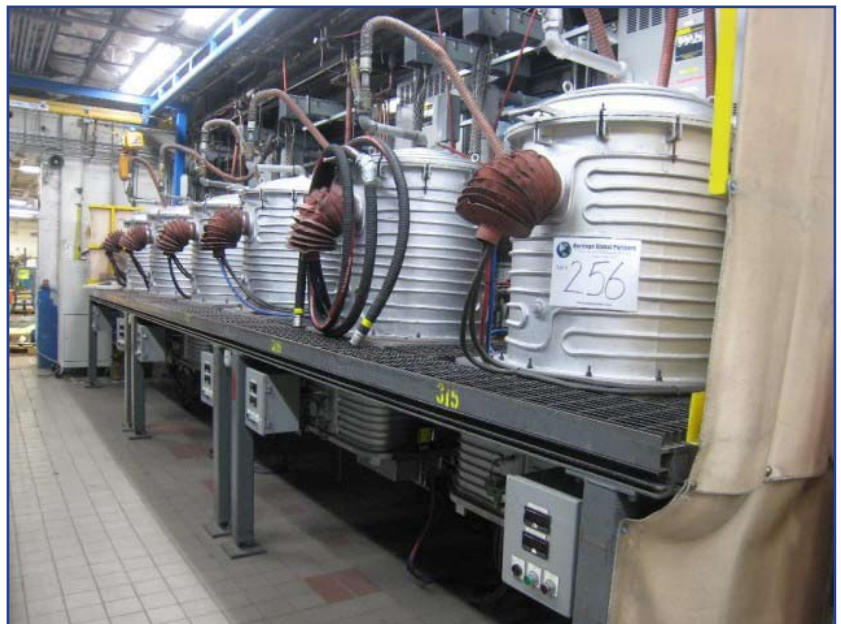
BP Solar 66 Kg Lot: Contents of Room consisting of 20 Stations