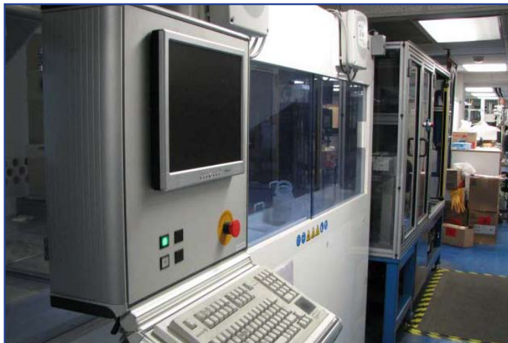
Roth & Rau Silicon Nitride Line