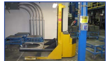
Jungheinrich EJC 14 HCT Spool Lift