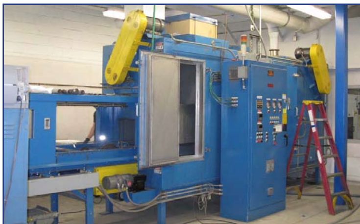
Lanty 7432 RMP Conveyor Dryer, 18" belt. 40 x 10