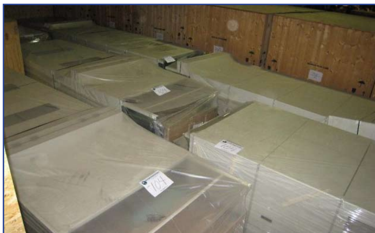
BTU Conveyor Furnace, New in Crate