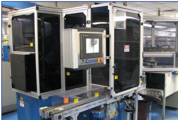
Rena InOx Side Etch Tool for PSG Removal and Junction Isolation