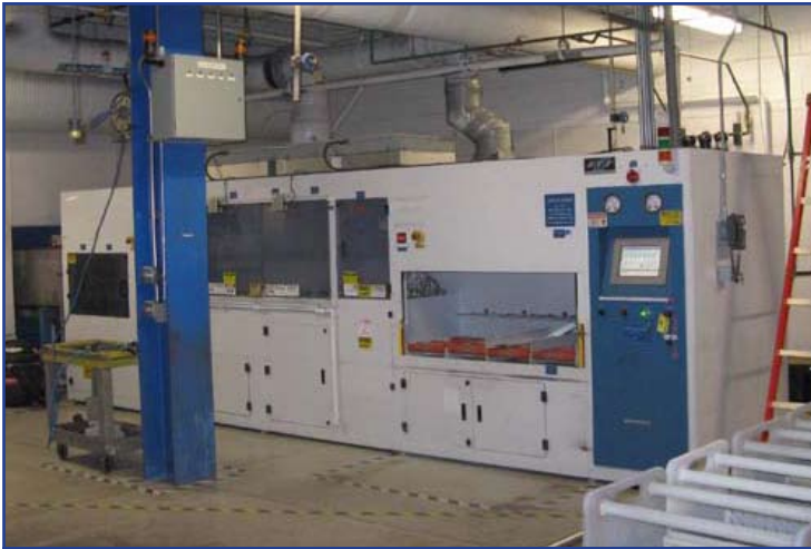
AFS 1240 RMP Wet Bench, 12 stations