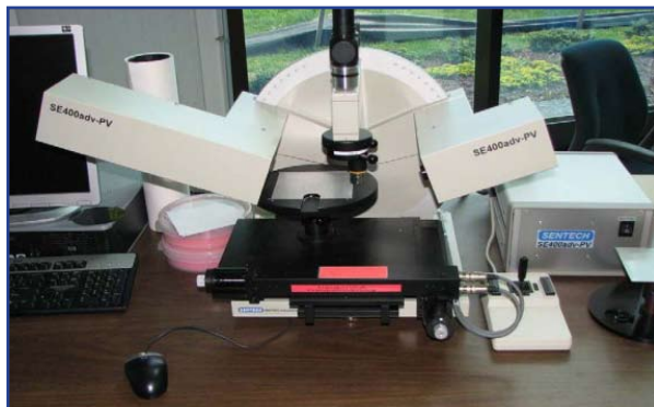
SenTech SE400 Ellipsometer