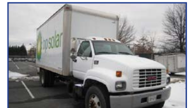
GMC C-6500, 1999