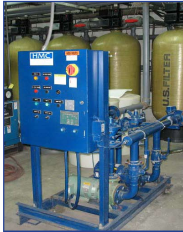
HMC CE1507 Booster Pumps