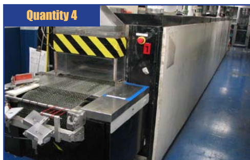
BTU T0161-8-240N48S Diffusion Furnace