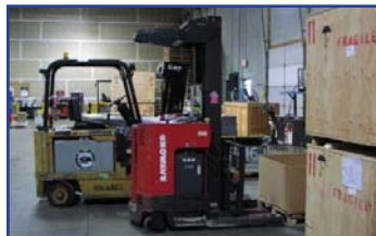
Raymond and Yale Forklifts