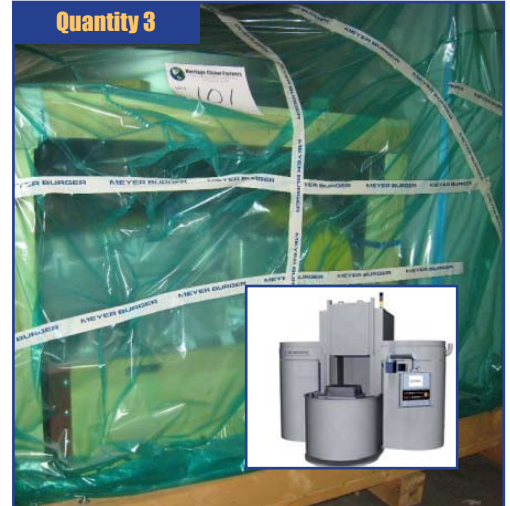
Meyer Burger BS 805 Band Saw, New (Crated)

Full Sales Catalog Available online @ www.HGPauction.com