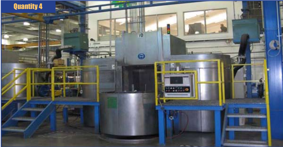
Meyer Burger BS800 Band Saw #2: Sizing/ Blocking Saw w/ Siemens Simatic OP 27 Controller