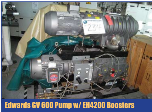
Edwards GV 600 Pump w/ EH4200 Boosters