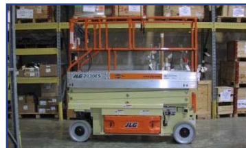
JLG Scissor Lift