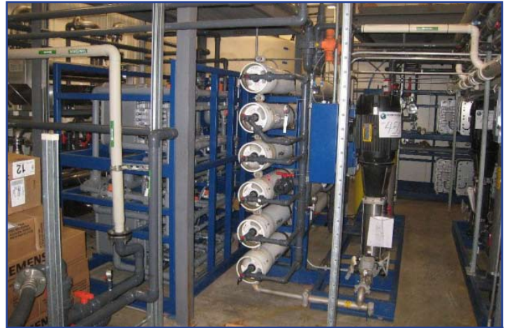
Complete DI/RO Water Treatment System, 200 GPM