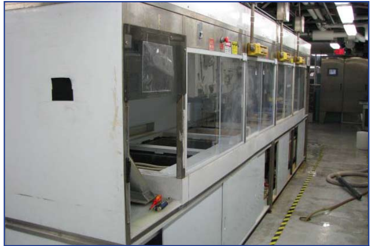
Rena PreWaClean Wafer Pre-Cleaner, 8 module