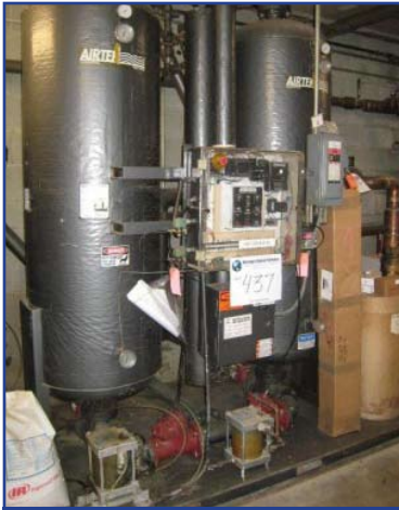
Airtek TWP-1200 Twin Tower Dryer