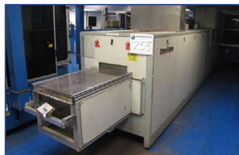
Sierra Therm 7K15-112C98-LIR Furnace