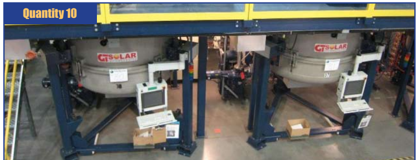
GT Solar DSS 270 Silicon Casting Furnace, Directional Solidification System