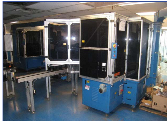
Komax Front/ Back Print Machines