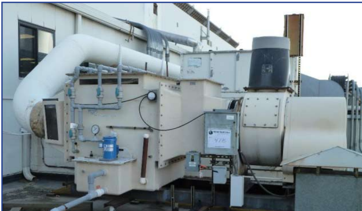
Harrington HPH 34-3 North Fume Scrubber

Full Sales Catalog Available online @ www.HGPauction.com