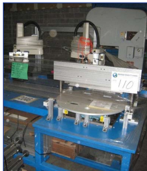
ATS Lot: (4) New Loaders