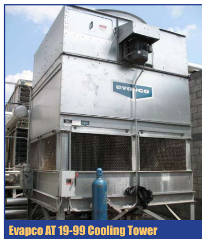
Evapco AT 19-99 Cooling Tower