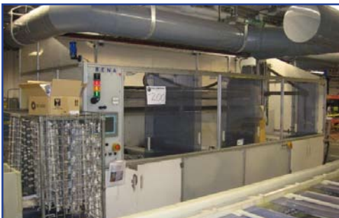
Rena PreWaClean Wafer Pre-Cleaner, 8 module