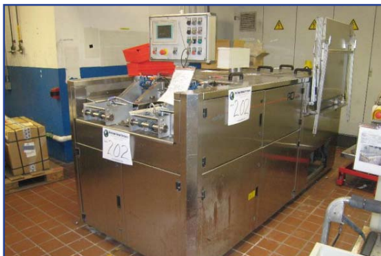
ACI Ecotech ecoSplit-I Wafer Singulator