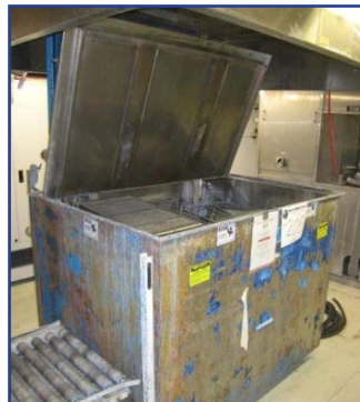
Ramco Lot: Wafer Precleaner