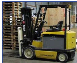
Hyster E60XL-33 Forklift