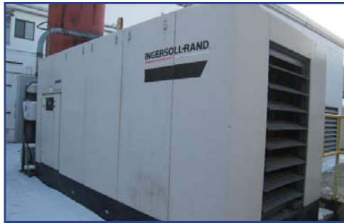
Ingersoll Rand SSR-EPE250-2S Air Compressor