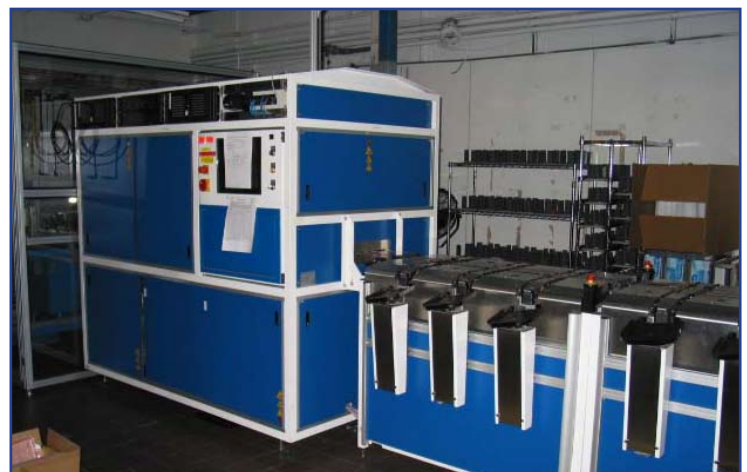
Roth & Rau Silicon Nitride Line