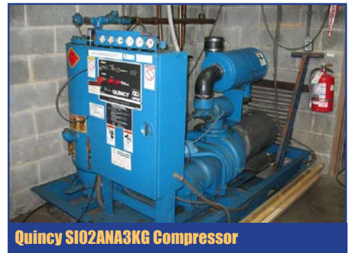
Quincy S102ANA3KG Compressor

Full Sales Catalog Available online @ www.HGPauction.com