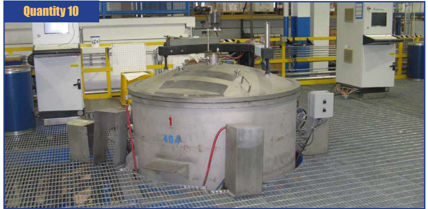
GT Solar GT MX 225 HEM Silicon Casting HEM Furnace