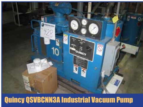
Quincy QSVBCNN3A Industrial Vacuum Pump