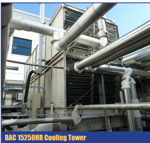
BAC 15250HR Cooling Tower