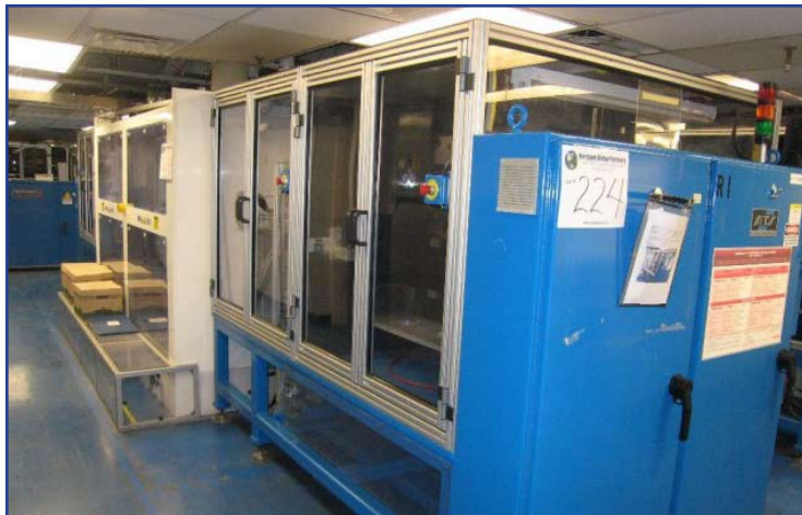
Rena InOx Line; InOxSide Etch Tool for PSG Removal / Junction Isolation