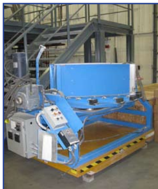
MHS 265 Crucible Rotator