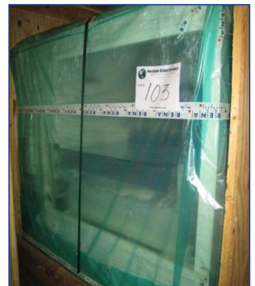
Rena Process Type- ICT, New in Crate