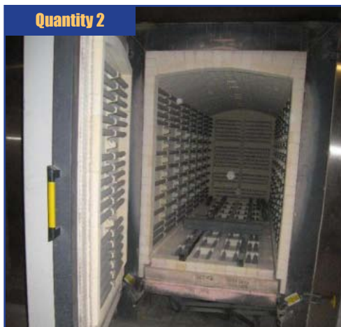
Nabertherm W 5000/H Ceramics Kiln