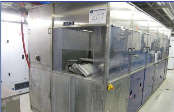
Crest Wafer Cleaner, 9 stations, 19'L x 6.5'W x 7.5'H