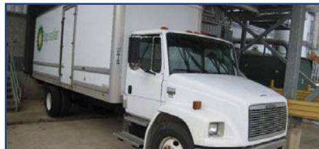
Freightliner FL70, 1995