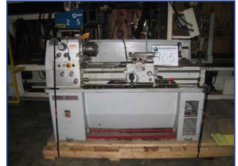
MSC 951735 Machine lathe, 6 x 48