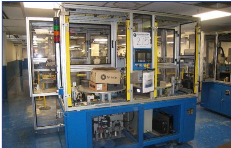
ATS 2047 Doper Loader