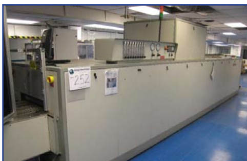
Sierra Therm 7K24-144C131-8LIR Furnace