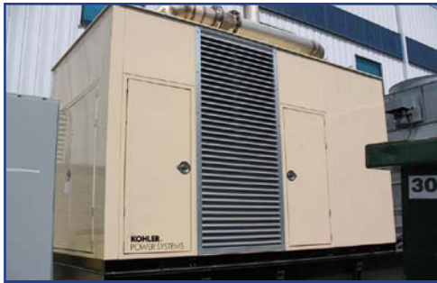
Kohler Power Systems