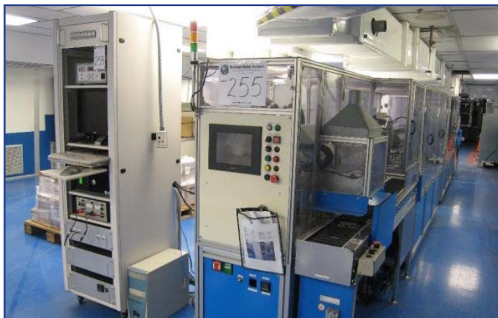
NPC NCT 150 Cell Test 5, Tester w/ 10 Station Module, Autoload and PC