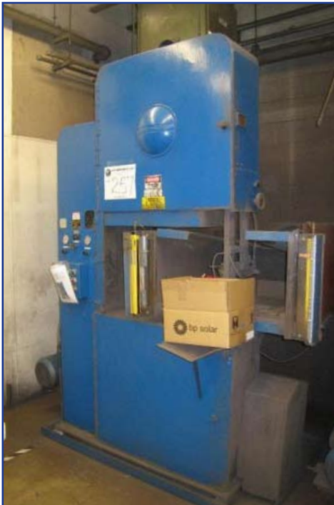
Tannewitz G1NE Brick Cropping Saw

Full Sales Catalog Available online @ www.HGPauction.com