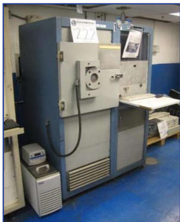
Plasma Etch, Inc. BT1