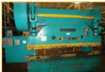
CINCINNATI MECHANICAL PRESS BRAKE