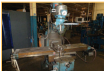
ALLIANT MDL. 42-VC VARI SPEED VERT. MILL