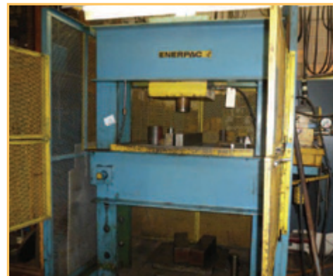
ENERPAC 200 TON "H" FRAME PRESS