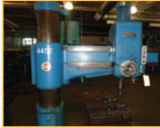
IKEDA MDL. RM1300, 4' RADIAL ARM DRILL