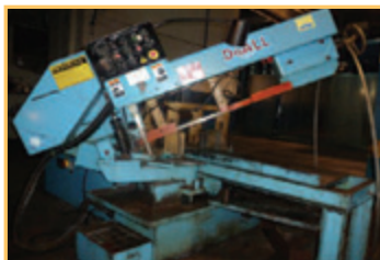
DO-ALL MDL. C916SA HORIZ. BAND SAW