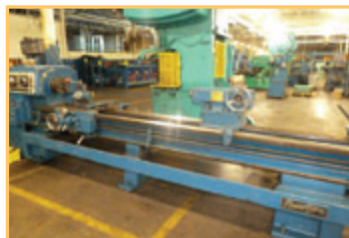
LODGE AND SHIPLEY ENGINE LATHE