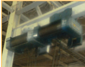
(2) SHAW BOX 3 TON HOISTS