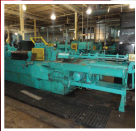
LEWIS MACHINERY CO. MDL. 11-FA, TRAVEL CUT WIRE STRAIGHTENER/ CUT-OFF MACHINE