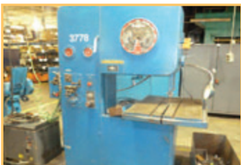
DO-ALL MDL. 2612-H VERT. BAND SAW