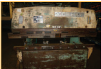
COULTER PROMECAM HYD. PRESS BRAKE