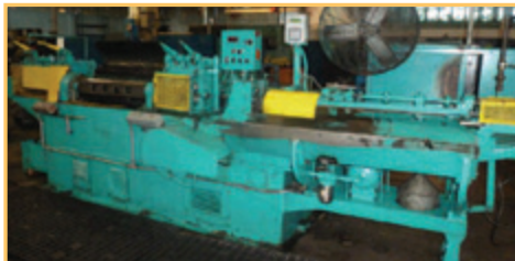
LEWIS MACHINERY CO MDL. 10-F, TRAVEL CUT WIRE STRAIGHTENER/CUT-OFF MACHINE