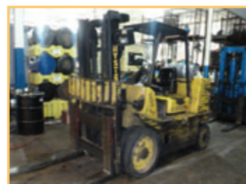
HYSTER MDL. S155XL, 15,500 LB LPG FORKLIFT