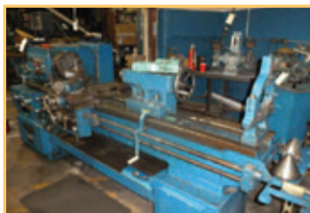
AMERICAN MDL. HMT ENGINE LATHE