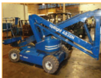
GENIE MDL. UPRIGHT AB38N, 38' AERIAL MANLIFT