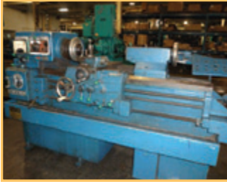
IKEDA MDL. 1300, 4' RADIAL ARM DRILL