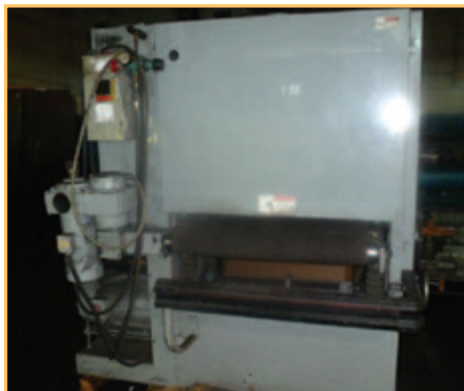
TIMESAVERS MDL. 137-1HPM75