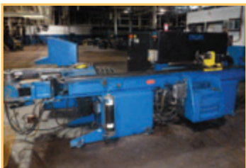
EAGLE MDL. EPT40 CNC TUBE BENDER