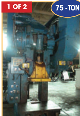
1 OF 2