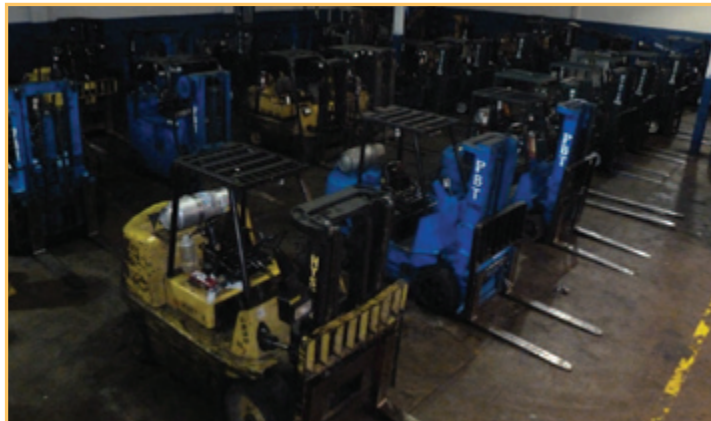
IKEDA MDL. 1300, 4' RADIAL ARM DRILL