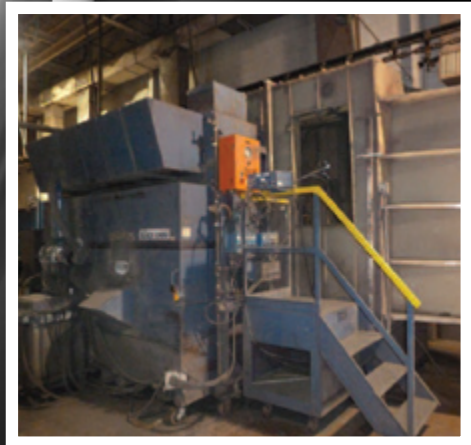
PAINT, WASH LINES & OVENS