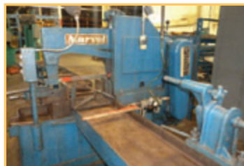
MARVEL MDL. 9/M6 HORIZ. BAND SAW