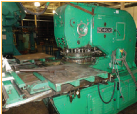
BEHRENS 18 STATION TURRET FABRICATOR

DIAMOND DRILL GRINDER • (12) STRONG HOLD DOUBLE DOOR GLASS TYPE STORAGE CABINETS • (3) TOOL PARTS CABINETS • OLIVER 10" TABLE SAW • DEWALT RADIAL ARM SAW • SPEEDAIRE 5 HP AIR COMPRESSOR • (2) TABLES AND VISES • WILTON MDL. VSC20, PEDESTAL DRILL PRESS • (6) PEDESTAL DRILL PRESSES • (7) RYMON 2" BELT SANDERS • GOVRO AUTO HORIZONTAL DUAL END DRILL • BURGMASER 6-POSITION TURRET DRILL, S/N ID2673 • (2) 4' X 10' STEEL TABLES, W/HEAVY DUTY VISES • RIDGID MDL. 545, PIPE THREADER • (2) ACETYLENE UNITS • (3) FLAMMABLE STORAGE CABINETS • DAKE ARBOR PRESS • DELPARK FILTER, 7' x 60' x 10' • (3) METTLER TOLEDO DIGITAL FLOOR SCALES • DALLAS UNCOILER • (20) STEEL STORAGE CABINETS • (2) PEDESTAL DRILL PRESSES, S/N 44810-83068 • (20) SMOKE EATERS • LYON 9 DRAWER TOOL CABINET • (2) VIDMAR 8 DRAWER TOOL CABINETS • LISTA 15 DRAWER TOOL CABINETS • ATLAS COPCO MDL. TENSOR DS7, TORQUE TESTER • 4' MANUAL BENDING ROLLS • NEW AGE INDUSTRIES, ROCKWELL HARDNESS TESTER • DIGITAL FLOOR SCALE • LARGE QUANTITY OF STEEL TOTES/BINS (1,400) • LARGE QUANTITY SHOP FANS THROUGHOUT BUILDING • MISCELLANEOUS CONVEYOR STANDS THROUGHOUT BUILDING • MISCELLANEOUS CONVEYOR THROUGHOUT BUILDING • MISC. TESTING EQUIPMENT • MISC. MOTORS AND DRIVES • MISC. ELECTRICAL • MISC. LUNCHROOM AND FURNITURE