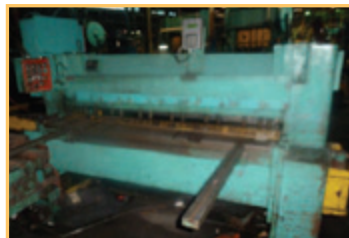
NIAGARA MECHANICAL SHEAR