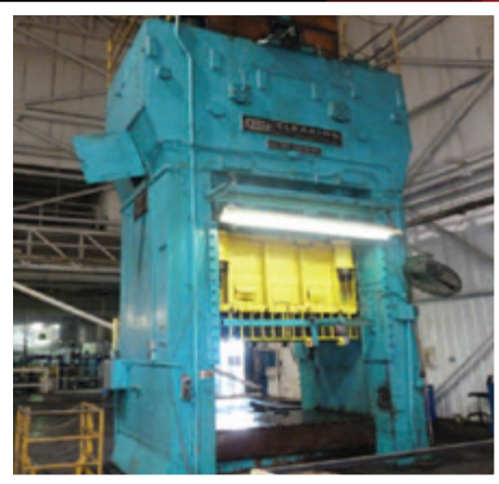
CLEARING MDL. D2-1000-108-72, 1000/600 TON DOUBLE ACTION PRESS

1.5 MILLION SQ.FT. PLANT • OVER 1000 LOTS • SOMETHING FOR EVERYONE