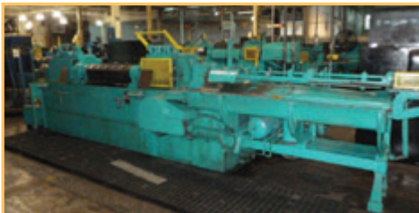
LEWIS MACHINERY CO. MDL. 11-FA, TRAVEL CUT WIRE STRAIGHTENER/CUT-OFF MACHINE