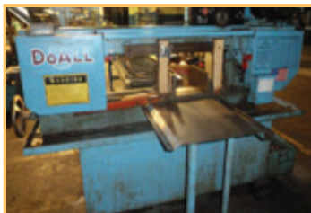
DO-ALL MDL. C916M HORIZ. BAND SAW