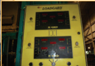
CLEARING MDL. D2-700-350-96-60, 700/350 TON DOUBLE ACTION PRESS