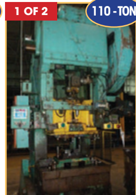
1 OF 2