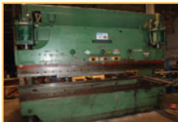
CINCINNATI HYD. POWER PRESS BRAKE