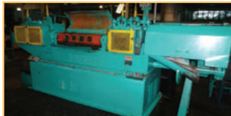
LEWIS MACHINERY CO. MDL. 10-C, TRAVEL-CUT WIRE STRAIGHTENER/CUT-OFF MACHINE