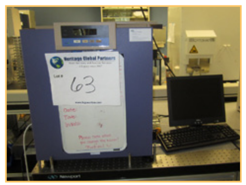
MOLECULAR DEVICES ANALYST GT MULTIMODE MICROPLATE READER

1 – Beckman Coulter 041-03-00100 Tip Lift, Option for Biomek