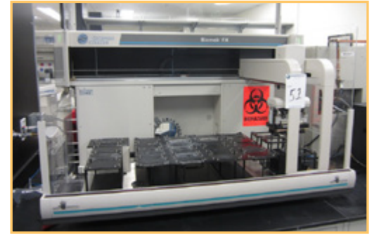
BECKMAN COULTER BIOMEK FX LIQUID HANDLING ROBOT

1 – Consolidated Autoclave, Sterilizer, with the following accessories: Steromaster Mark II Digital Automatic Controls, Four Color Coded Push button Selector Switches, Controlling, Recording, & Indicating Thermometer, Stainless Steel Cart