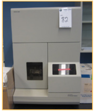
ABI PRISM GENETIC ANALYZER