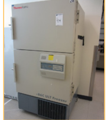
FORMA SCIENTIFIC 917 MINUS 86 FREEZER