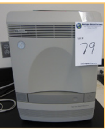
SDC SIMPLICITY GAS PANEL AUTO GAS SWITCHER