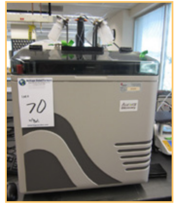
BECKMAN COULTER BIORAPTR FRD 1B