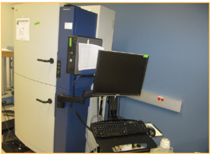
MOLECULAR DEVICES FLIPR TETRA CELLULAR SCREENING SYSTEM