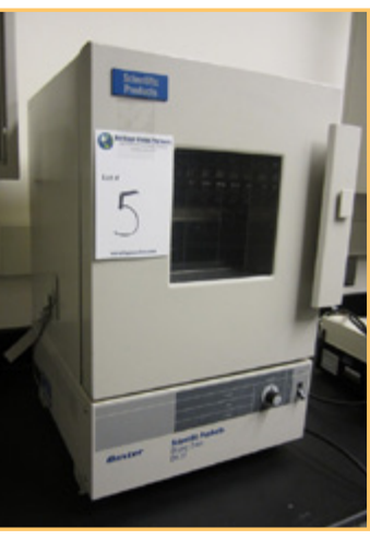
BAXTER SCIENTIFIC DX-31 GRAVITY OVEN