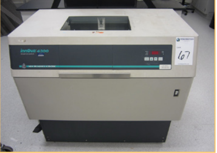
NEW BRUNSWICK SCIENTIFIC INNOVA 4300 INCUBATOR SHAKER