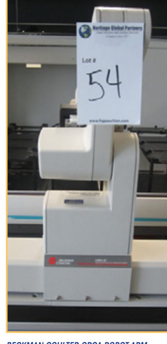
BECKMAN COULTER ORCA ROBOT ARM