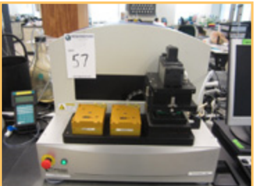
CARTESIAN TECHNOLOGIES HUMMINGBIRD 384 XL THERMO SCIENTIFIC MATRIX WELLMATE