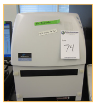
PERKIN ELMER ENVISION 2104 MULTILABEL PLATE READER