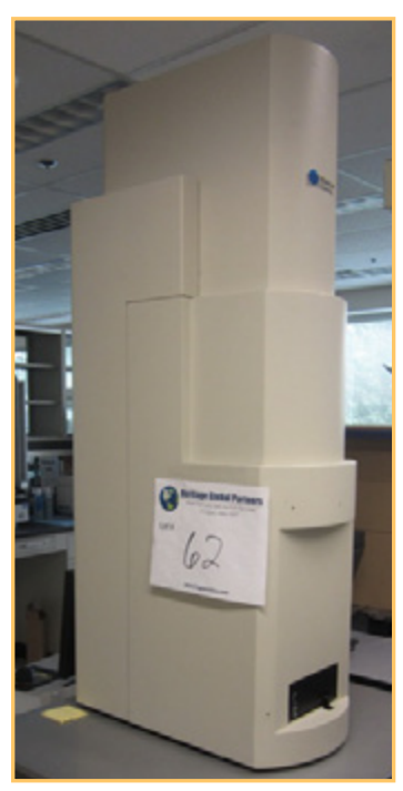
CHEMILUMINESCENCE IMAGING SYSTEM PLATE READER

1 – Perkin Elmer 310 ABI Prism Genetic Analyzer, with Accessories, Software, Manuals