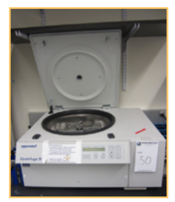
SPTS 2011 PLASMA CHEMICAL VAPOR AUTO LOAD ETCHER