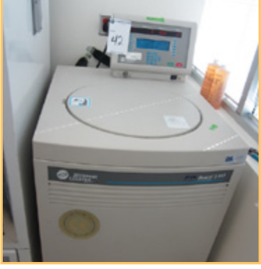
2007 STS PLASMA CHEMICAL VAPOR AUTO LOAD

Multi-Lot - VWR Galaxy, (2) Mini Centrifuges, Kinetic Energy 26 Joules