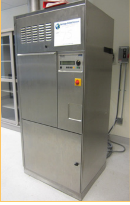
MIELE PROFESSIONAL G7825 GLASS WASHING SYSTEM