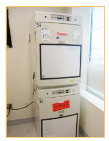
THERMO FORMA 370 STACKED STERI-CYCLE CO2 INCUBATORS