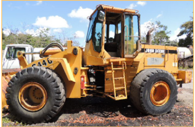
JOHN DEERE 644H 4 WHEEL LOADER