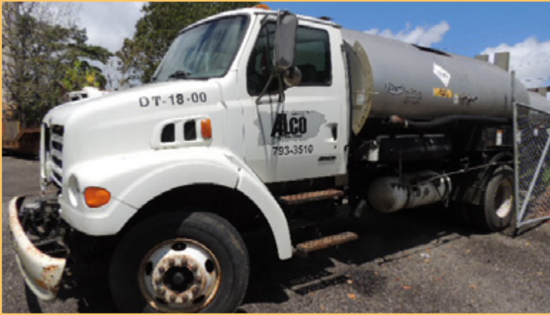
FORD / STERLING, ETYNRE L-7501, SHOOT DISTRIBUTION TRUCK, MFG. DATE 1999