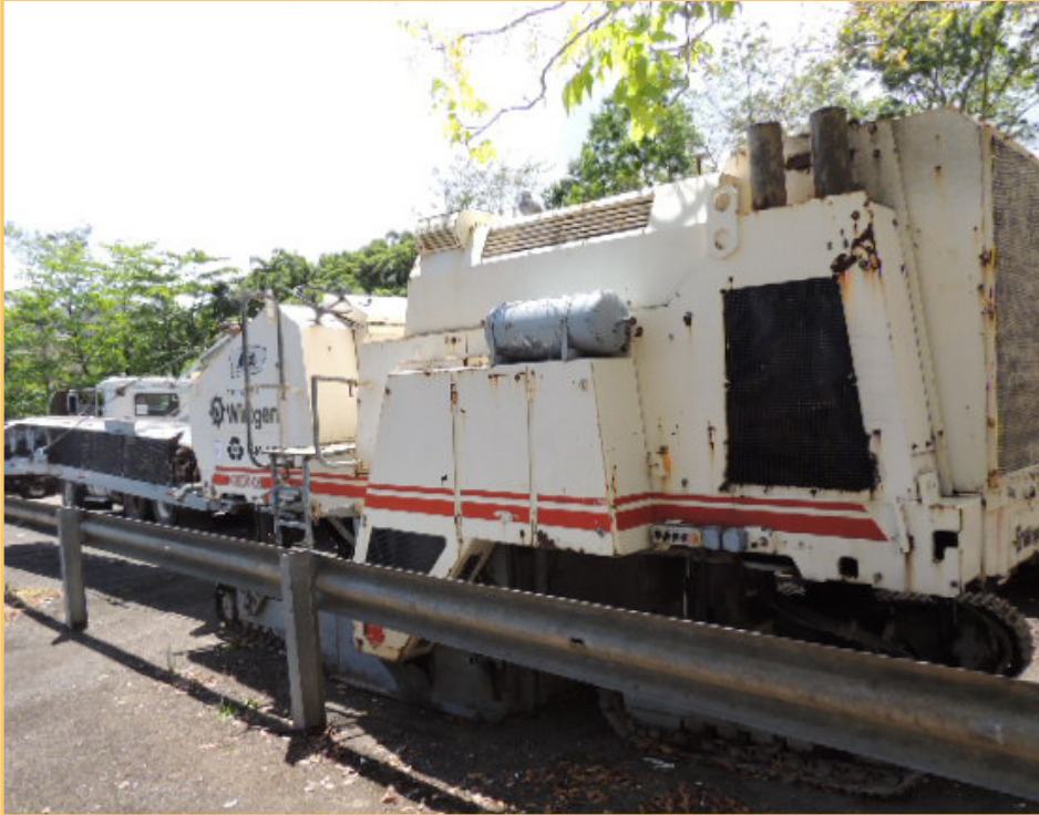
WIRTGEN 2000DC COLD MILLING MACHINE