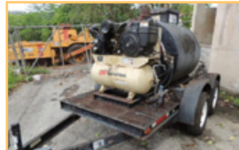
HUSKY 1040 SEALER TRAILER