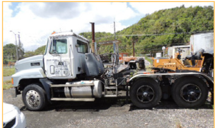
MACK CH613 TRACTOR TRUCK