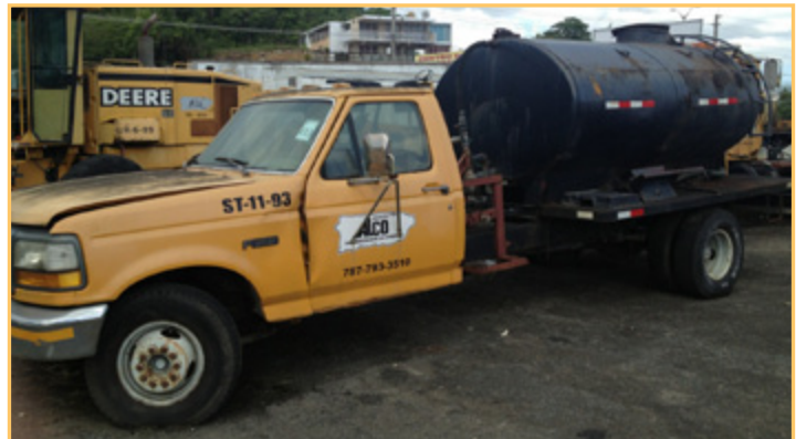
FORD SUPERDUTY XL PRIMER TRUCK, 1993

1 – International 4900 / DT466E 1997 Service Truck , GVRW 22,500lbs, 11 R 22.5 budd wheels, 4 lube tanks, IR air compressor, 1 diesel tank, 9 retractable hose reels.