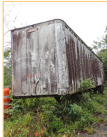
TRAILMOBILE A31AISAW 40' STORAGE VAN