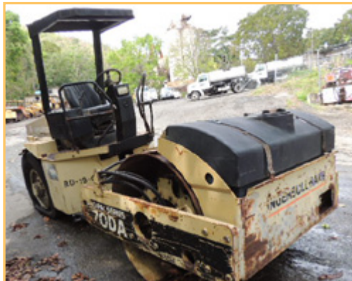
INGERSOLL RAND DD-90/110 TANDEM VIBRATORY ROLLER