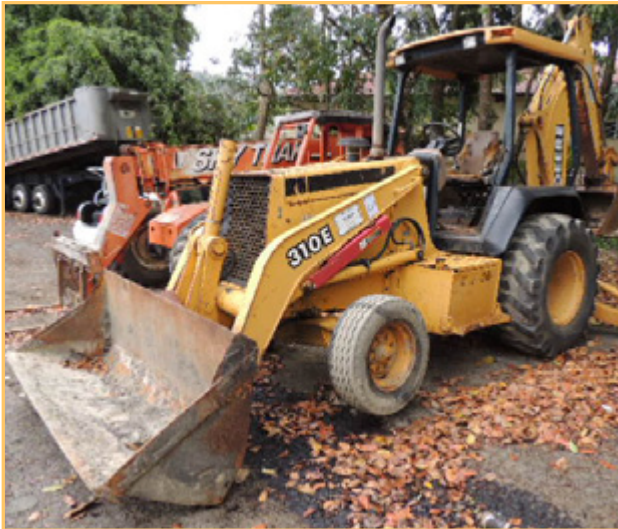
JOHN DEERE 310E BACKHOE / LOADER