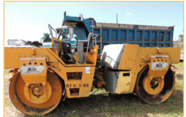
BOMAG BW161AD DUAL DRIVE, TANDEM VIBRATORY ROLLER