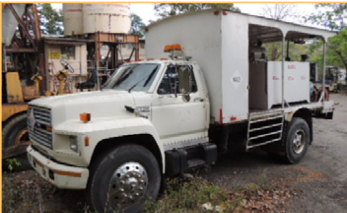
FORD F-700 SERVICE TRUCK

1 – Ford F-800 Water Truck , powered by Cummins, 5 speed transmission, 2000gal tank w/ pump and 5.5 hp gas motor, 200gpm