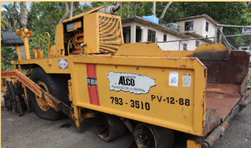
(8) BLAW KNOX PF-180H PAVER DUAL DRIVE, 8' SPREADER