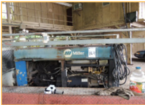
MILLER BIG 40 WELDERA