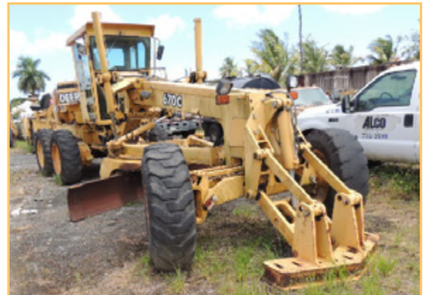
JOHN DEERE 670C GRADER