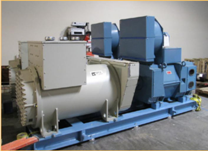
(2) ABB TYPE DMI400T GENERATOR, MFG. 2009, NEVER BEEN USED.