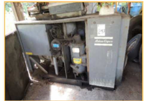
ATLAS COPCO GA-37 AIR COMPRESSOR