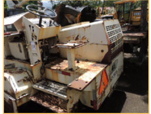
ROADTEC RX-10 COLD MILLING MACHINE