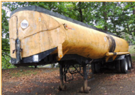
OIL TRAILER, 500GAL