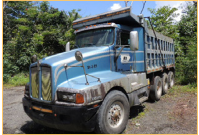
KENWORTH 3 AXLE DUMP TRUCK