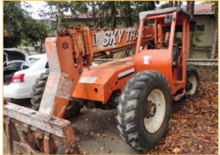
SKYTRAK 6036C POWERED BY CUMMINS, TELESCOPIC FORKLIFT 36'