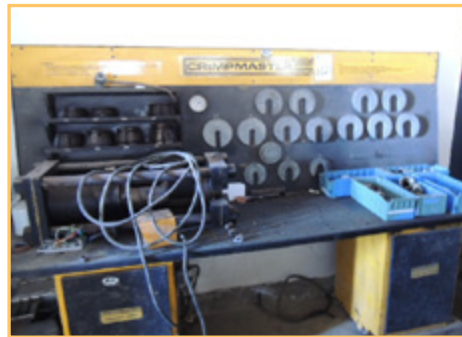
CRIMPMASTER HYDRAULIC HOSE CRIMPING STATION, 2"