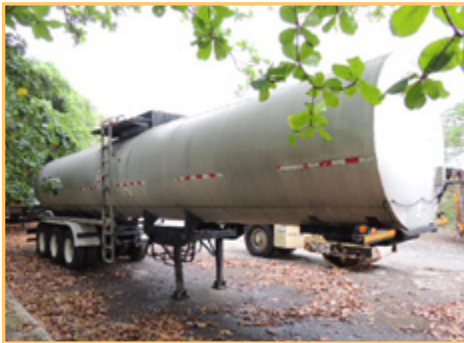
ETNYRE 1999 HOT TRAILER, 9000GAL