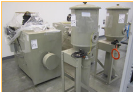
CONAIR POLYCARBONATE MATERIAL DELIVERY SYSTEM