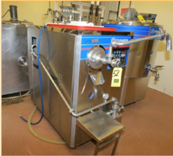
2006 FRISHER SINGLE BARREL ICE CREAM FREEZER