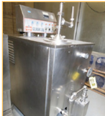
SANI MARK GELMARK 300 ICE CREAM FREEZER