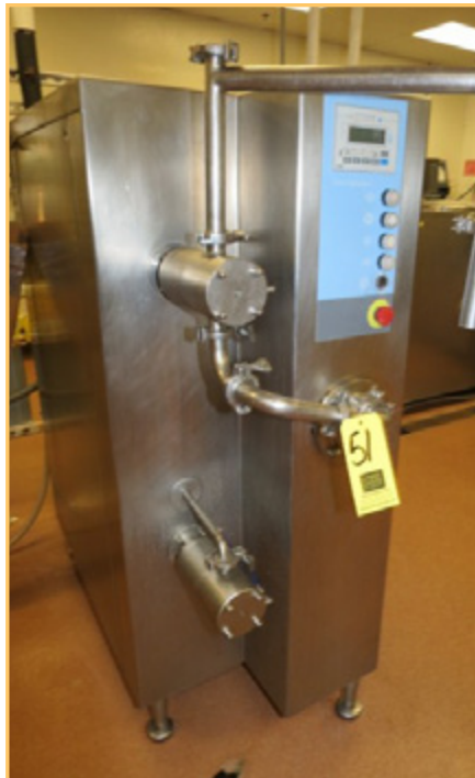
2003 GRAM SINGLE BARREL ICE CREAM FREEZER