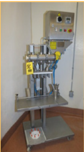
2007 GRAM 15-HEAD FILLER