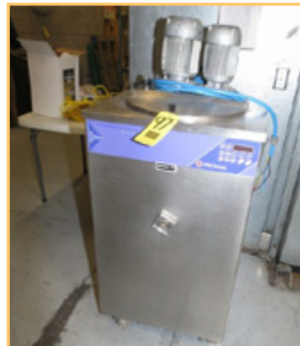
STARMIX PROMAG MODEL: STARMIX/55/F