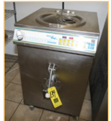
CARPIGANI PASTA CHEF 32 MIXER