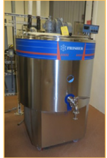
PACKETSTORM 1800E IP EMULATOR