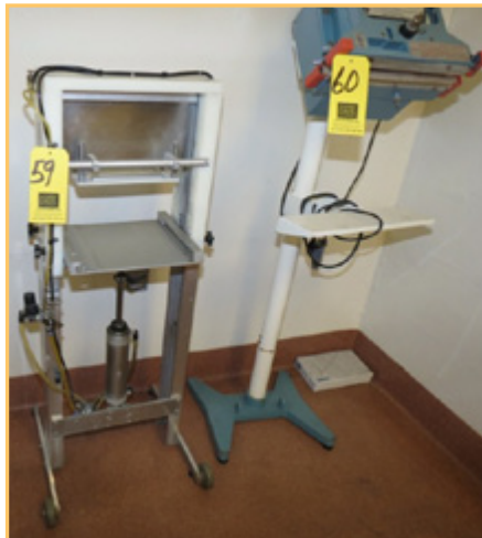
FOOD TOOLS, MODEL: C5-1A, S/N: 2738 CAKE/PIE SLICER