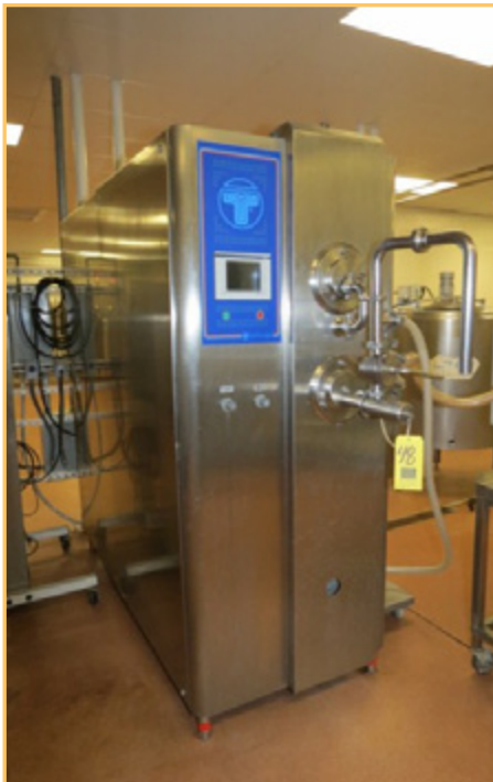
2007 TECHNOGEL 2-BARREL ICE CREAM FREEZER 1500