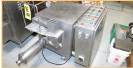
GRAM INGREDIENT FEEDER, MODEL: FN 400