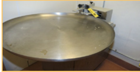
SANI-MARK S/S FANCY DESSERT TARTUFO PACK OFF TABLE