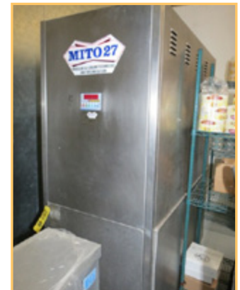
MITO 27 CHILLER + PUMPS/COMPRESSORS