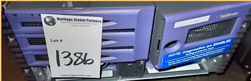
SUN MICROSYSTEMS SUNFIRE V490 SERVER