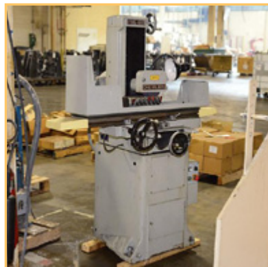
CHEVALIER FSG618 SURFACE GRINDER