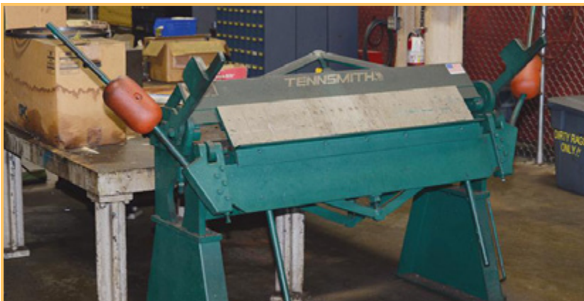
TENNSMITH 48" X 12-GA. FINGER BRAKE