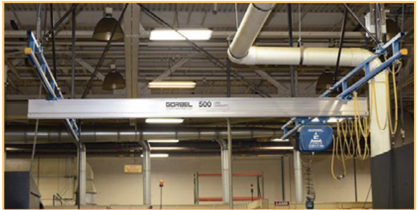
GORBEL 500-LB. CEILING MOUNT BRIDGE SYSTEM