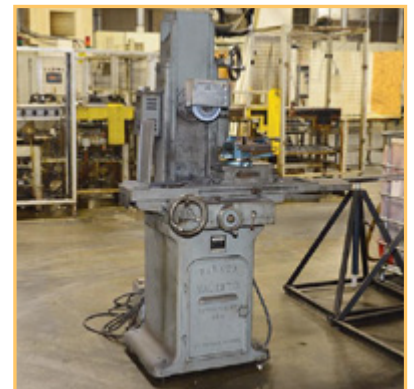
PARKER MAJESTIC #2