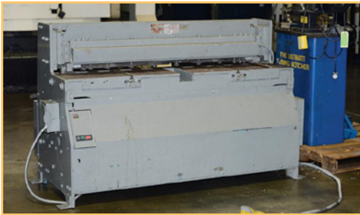
ROPER WHITNEY PEXTO 52" X 12-GA. POWER SQUARING SHEAR