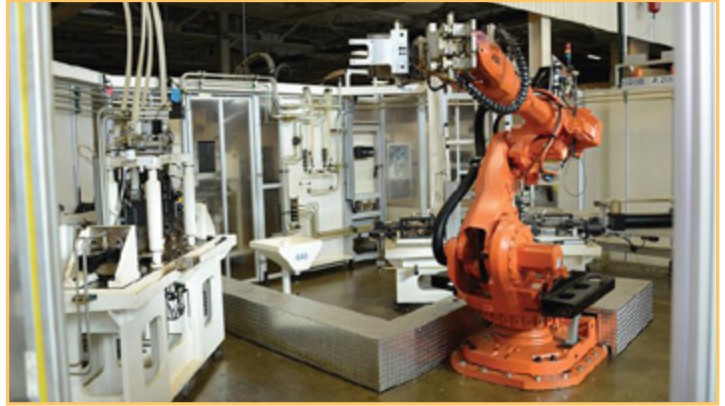
(14) ABB ROBOTS W/TEACH PENDANTS