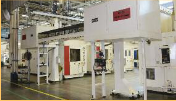
GSA CYLINDER HEAD PART TRANSFER SYSTEM