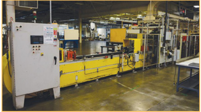
LAMB 4.6L & 5.4L FORD 4-VALVE CYLINDER HEAD ASSEMBLY & TEST AUTOMATION LINE