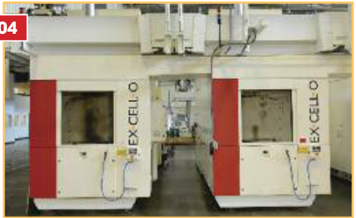
(11) EX-CELL-O XHC241 CNC HORIZONTAL MACHINING CENTERS