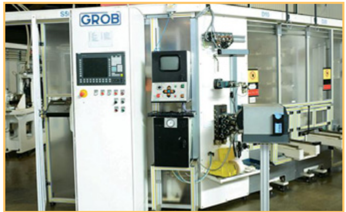
GROB CYLINDER HEAD ASSEMBLY & TEST CELL INCLUDING LEAK TEST STATION