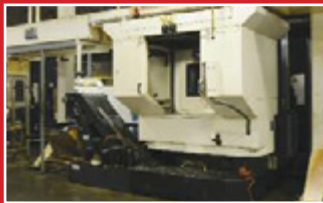
(7) MAKINO A88 CNC HMC'S