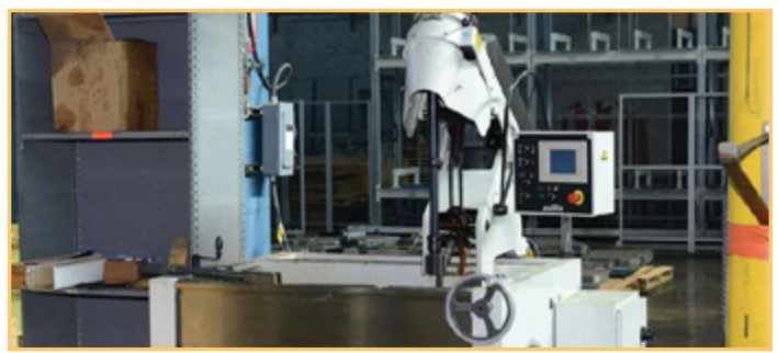
SUNNEN SV-10D CYLINDER HONE

JET 13" x 40" Gap Bed Lathe, Model GH-1340A, S/N 806W424, 6" 3-Jaw Chuck, 18" Swing Over Gap, 13" Swing Over Bed, 6" Swing Over Carriage, 40" Between Centers, 1-1/2" Thru Spindle, 45-1800 RPM, Threading, Foot Brake, Removable Chip Pan BRIDGEPORT ROMI 13" x 56" Engine Lathe, Model Tormax 13-5, 6" 3-Jaw Chuck, 13" Swing Over Bed, 6" Over Carriage, 56" Between Centers, 80-2500 RPM, 1-5/8" Thru Spindle, Threading, Foot Brake CHEVALIER FSG618 Surface Grinder, S/N 02B-4700, Hand Feeds PARKER MAJESTIC #2 Surface Grinder, Hanchett 612 Electromagnetic Chuck, Hand Feeds KBC 3-HP Vertical Mill, Model TUM-1, 9" x 42" T-Slot Table w/AL-300S Power Feed, 60-4200 RPM, Mitutoyo 2-Axis DRO BRIDGEPORT 2-HP Vertical Mill, 9" x 48" Table, AL 400S Table Feed, 60-4200 RPM SUNNEN Cylinder Hone, Model SV-10D, Siemens Simatic Controls DAKE JOHNSON Vertical Band Saw, Model