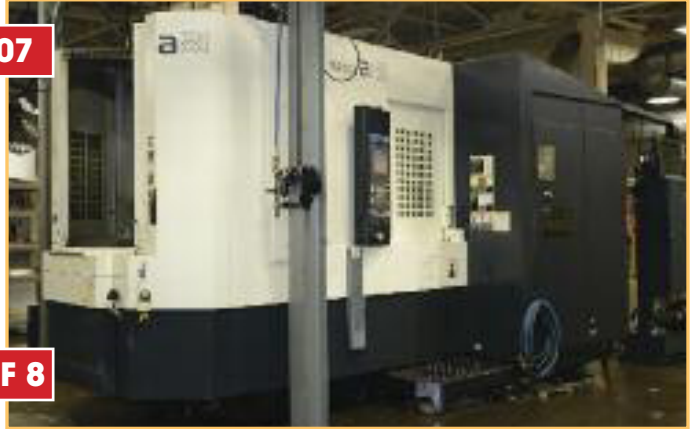
(8) MAKINO A81 CNC HORIZONTAL MACHINING CENTERS