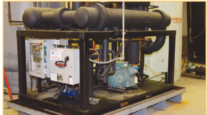
AIR TEK MSC4000-W4 REFRIGERATED AIR DRYER