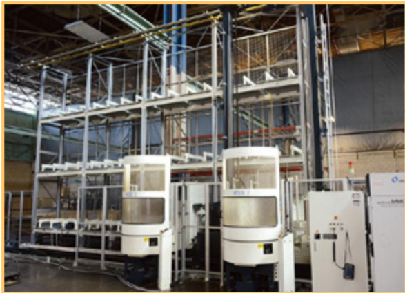
MAKINO MM2 24-STATION PALLET RETRIEVAL SYSTEM