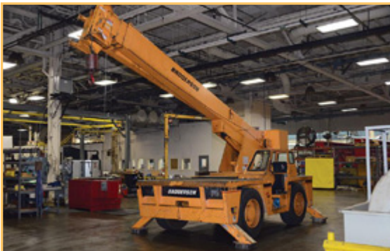
BRODERSON 1C-200-213 CARRY DECK CRANE