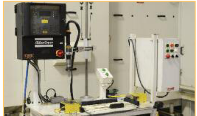
ATLAS COPCO TENSOR DIGITAL TORQUE SYSTEM