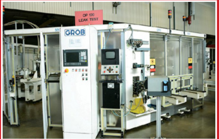
GROB CYLINDER HEAD ASSEMBLY & TEST CELL INCLUDING TEST STATION