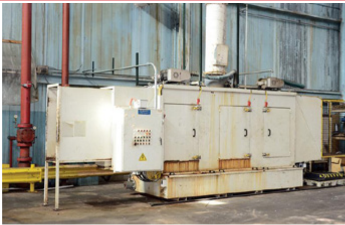
REINHART 3234 AUTOMATED PARTS WASHER