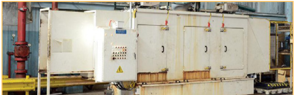
REINHART 3234 AUTOMATED PARTS