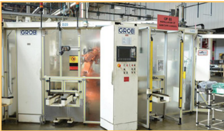
GROB SEAT & GUIDE INSTALL CELL