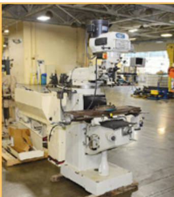
KBC TUM-1 3-HP VERTICAL MILL