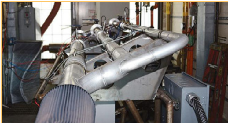
FLOW DYNAMICS TEST CELL W/FLOWMAXX VENTURI