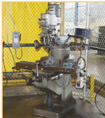
BRIDGEPORT 2-HP VERTICAL MILL