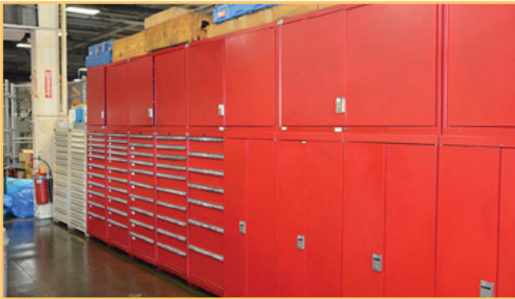
MODULAR STORAGE CABINET SYSTEM FOR PERISHABLE TOOLING