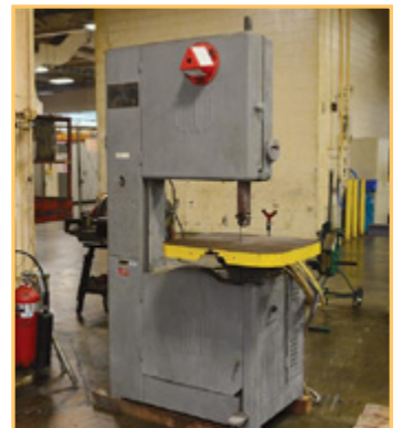
GROB NS-24 VERTICAL BAND SAW