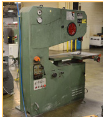
DAKE JOHNSON V-40 VERTICAL BAND SAW