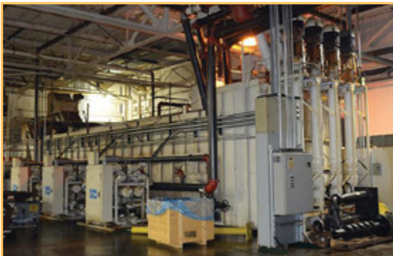
HENRY COOLANT FILTRATION SYSTEMS