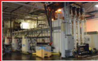
HENRY COOLANT FILTRATION SYSTEM