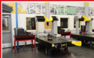
2 OF 4 BROWN & SHARPE CNC CMM'S