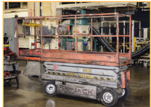
SKYJACK SJ3220 PLATFORM SCISSOR LIFT