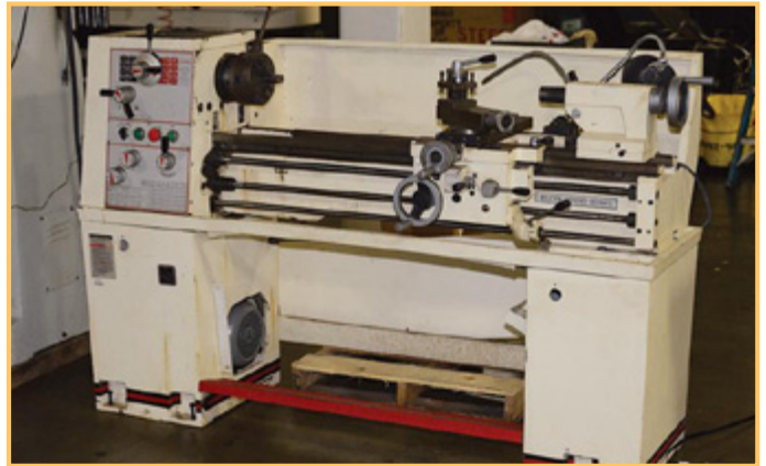
JET GH-1340A 13" X 40" GAP BED LATHE