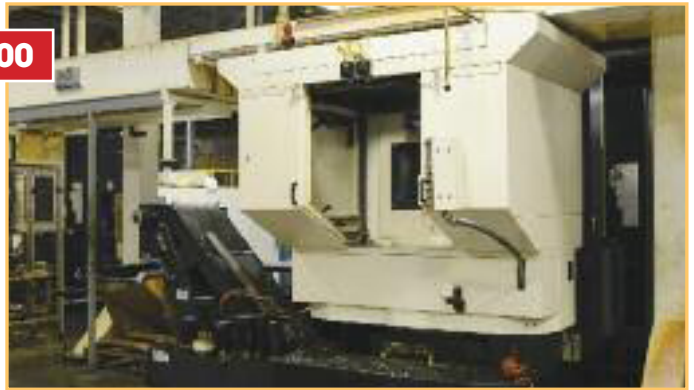
(7) MAKINO A88 CNC HORIZONTAL MACHINING CENTERS