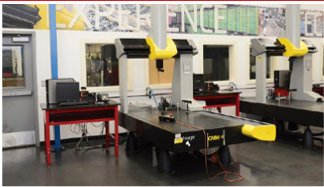
(4) BROWN & SHARPE GLOBAL IMAGE 9.15.8 & EXCEL 9.15.9 CNC CMM'S

Liquidation of Assets of: POWER-TEC MANUFACTURING LLC 5550 S Occidental Rd, Tecumseh, Michigan WEDNESDAY, APRIL 17th Starts at 10AM INSPECTION: Day prior from 9AM - 4PM