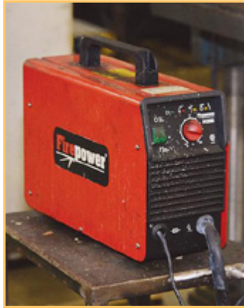
FIRE POWER PC250 BENCH TOP TIG WELDER