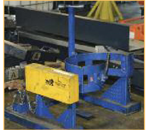
VESTIL FORKLIFT ATTACHING DRUM LIFT