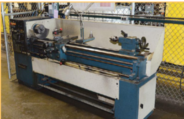
BRIDGEPORT ROMI TORMAX 13-5 13" X 56" ENGINE LATHE