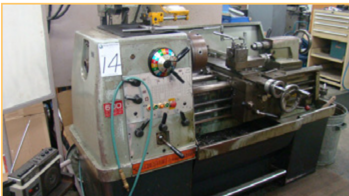
COLCHESTER TRIUMPH 2000 LATHE, W/ SONY LH32 CONTROLS, 10" CHUCK