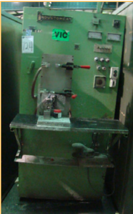
INDUCTOHEAT INDUCTION HEATING MACHINE