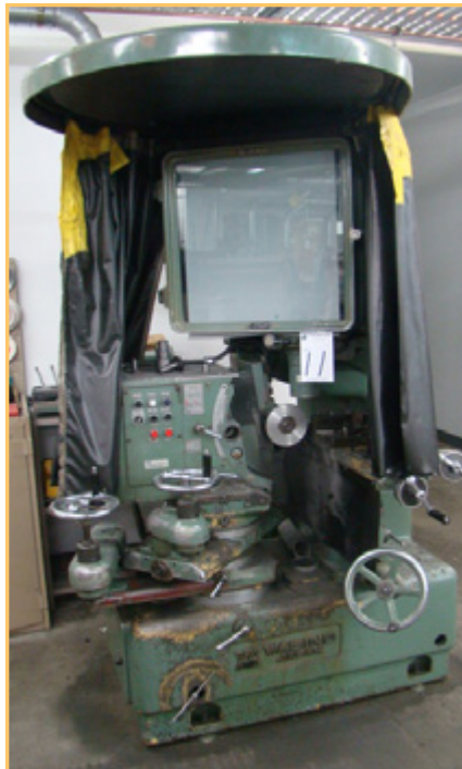
WASINO GLS-80A OPTICAL PROFILE GRINDER