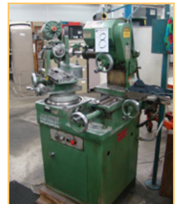
CINCINNATI MILACRON MONOSET TOOL