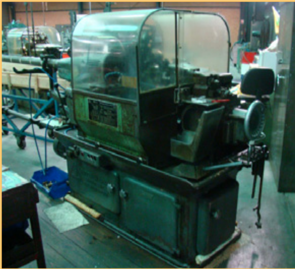
INDEX-WERKE B60 SINGLE SPINDLE AUTOMATIC BAR MACHINE