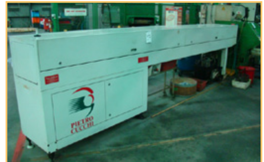
PIETRO CUCCHI MCC AUTOMATIC BAR LOADER, YR: 1995