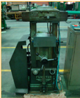
FUNDITOR 5518 MARKING MACHINE