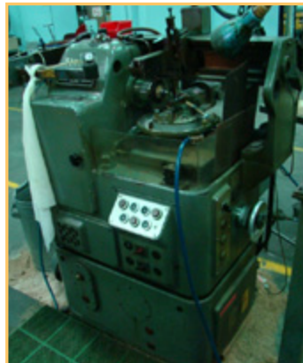
KOEPPER 136 GEAR HOBBER MACHINE