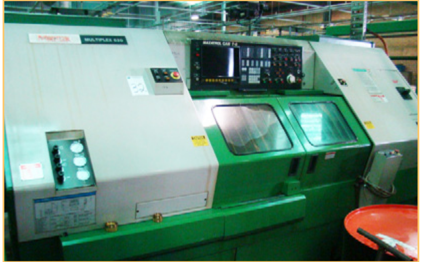
MAZAK MULTIPLEX 620 CNC TURNING CENTER, MAZATROL CAM T-6 CONTROLS