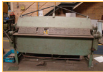
72" MANUAL SHEAR