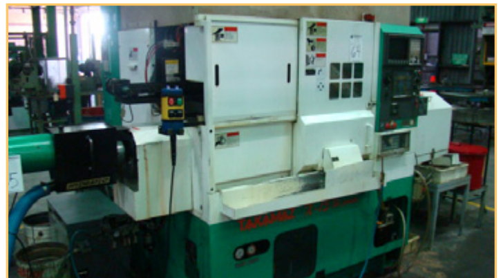
TAKAMATSU X-15 CNC TURNING CENTER