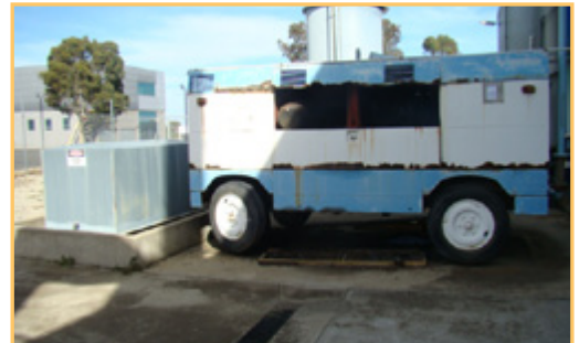
ATLAS COPCO PTHS1200DD MOBILE SCREW TYPE AIR COMPRESSOR

1 – Nederman Filtermax Dust Collector, yr: 2000