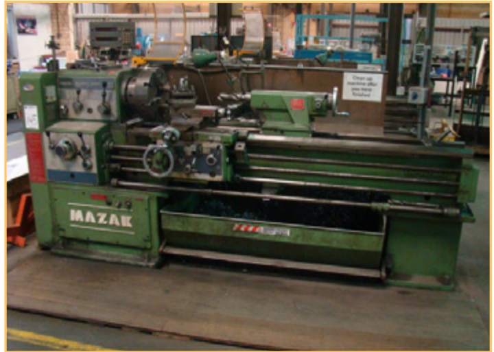
MAZAK 2F07 ENGINE LATHE