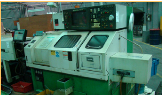
MAZAK TURN 8N CNC TURNING CENTER

2 – Hydraflo 652 Automatic Bar Loader, W/ Pendant Controls 2 – Pietro Cucchi MCC Automatic Bar Loader, yr: 1995