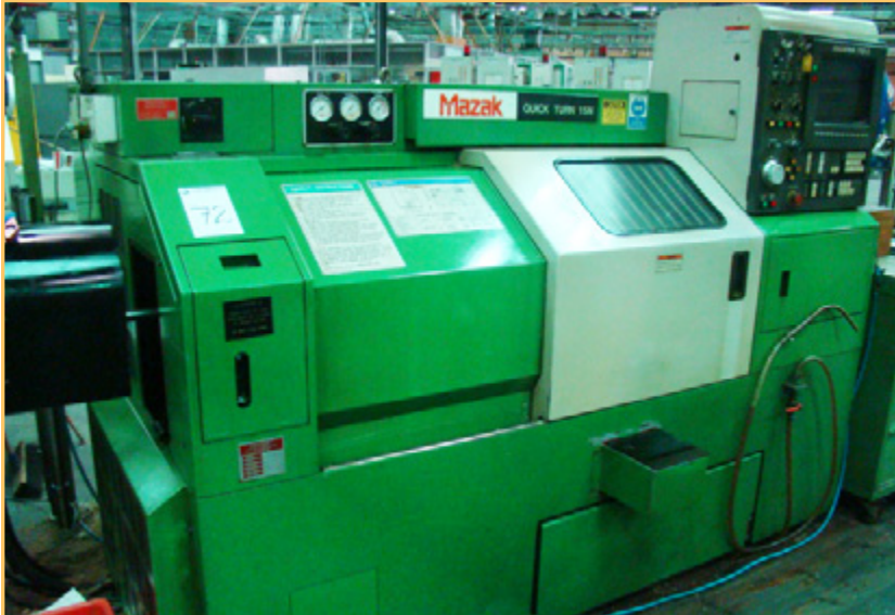
MAZAK TURN 15N 2-AXIS CNC TURNING CENTER