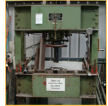
PACIFIC FU-1600 UNIVERSAL MILLING MACHINE SERVEX HP.100P3 HYDRAULIC SHOP PRESS