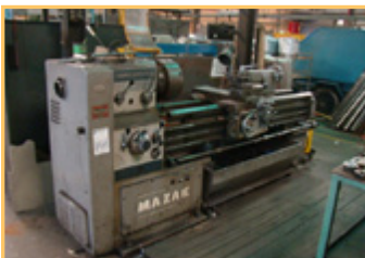
MAZAK SF28 ENGINE LATHE