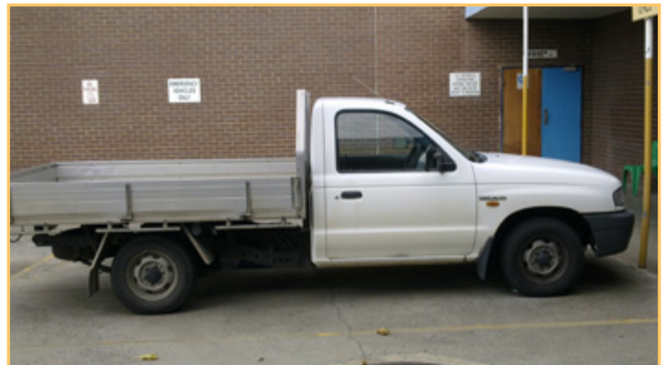
MAZDA BROVO PICKUP TRUCK, YR 2000