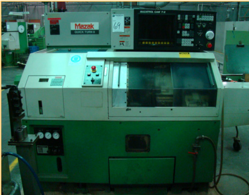
MAZAK QT-8 CNC TURNING CENTER

1 – Citizen L16 CNC Lathe, Concom L16 Citizen Controls, 5/8", yr: 1988 1 – Mazak QT-8 CNC Turning Center, Mazatrol Cam T-2 CNC Controls, 280mm Max Swing, 50mm Spindle Bore, 254mm Cutting Length, 4500 RPM Spindle Speed, 10-HP Motor. 2 – Mazak Turn 15N 2-Axis CNC Turning Center, Max Swing 17.32, Swing Overhead 10.00, Max Length 19.69, Travel X-Axis 7.09, Z-Axis 20.08, Spindle Bore 2.44, Bar Cap 1.96, Spindle Speed 4520 RPM, 8-Position Turret 2 – Mazak Quick Turn 8G M/C CNC Turning Centers 2 – Mazak Quick Turn 8 & 8N CNC Turning Centers 1 – Takamatsu X-15 CNC Turning Center, Mazatrol Cam T-2 CNC Controls, yr 1997