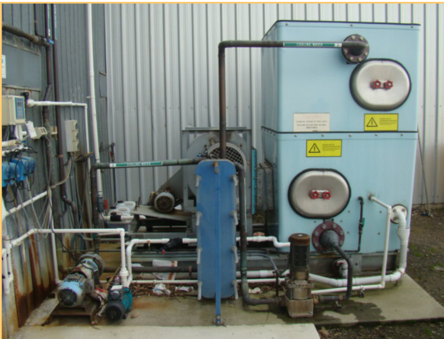
SUPERCHILL EWK-D144 COOLING TOWER