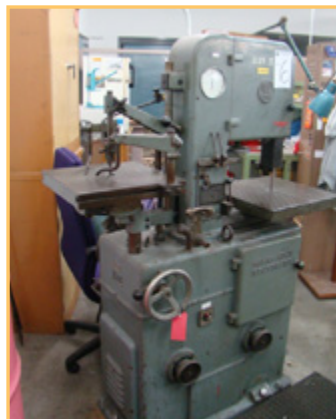
APV CREPACO PLATE & FRAME HEAT EXCHANGER