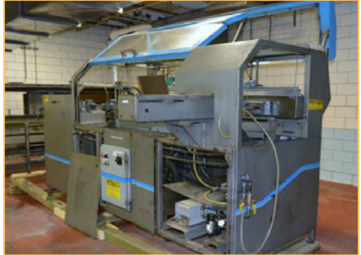
ABC PACKAGING MACHINE 230HM CASE ERECTOR

1 – Fowler 12 Head Rotary Capper. Approximate 5-1/2" centers. Includes a cap chute, no feeder.