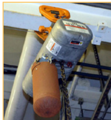
LODESTAR 1/2 TON HOIST