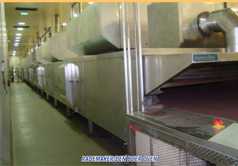
RADEMAKER/DEN BOER OVEN

Surplus to the Ongoing Operations of the Iconic Foods Brand. Including a Rademaker / Den Boer Gas Powered, Stainless Steel, Ten (10) Zone Oven.