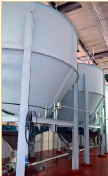
ASSORTED LARGE STORAGE TANKS