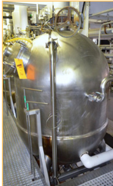
HAMILTON HV VACUUM COOKER KETTLE, 250 GAL.