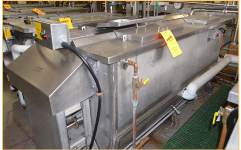
GROEN PADDLE MIXER, APPROXIMATE 350 GALLON (46 CUBIC FEET), STAINLESS STEEL