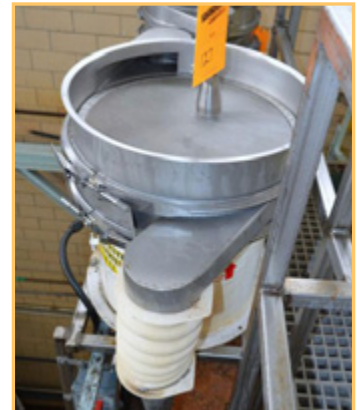
MIDWESTERN SCREENER, MODEL MR24S4-4