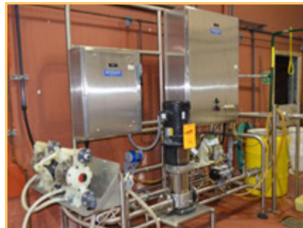
ECOLAB INLINE CIP CLEAN IN PLACE SYSTEM