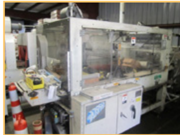
ARPAC MODEL CM60-28A