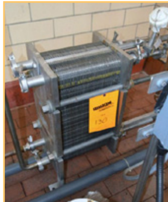
APV CREPACO PLATE & FRAME HEAT EXCHANGER