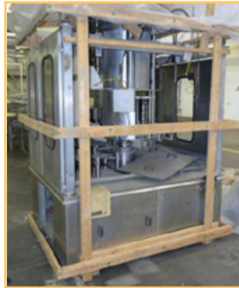
BECKMAN COULTER ORCA ROBOT ARM