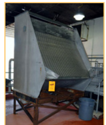
SPROUT-BAUER HS HYDRASIEVE

PLEASE NOTE: You Must Be Registered For The Auction Prior To and In Order To Gain Access To Smuckers' Facilities.