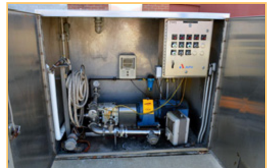
APV CREPACO ROTARY POSITIVE DISPLACEMENT PUMP

4 – Tri-Clover Tri-Flo Centrifugal Pump, Model C114-D56T-S, Stainless Steel. Driven by a 1hp motor.