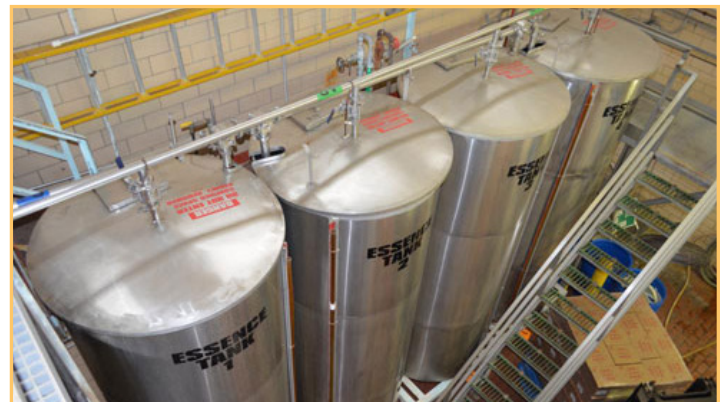
TANKS, 825 GALLON, STAINLESS STEEL, VERTICAL