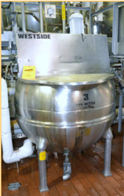
SUN ULTRA 450 SERVER