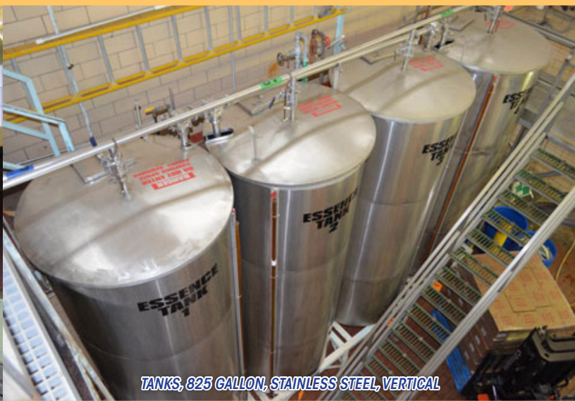
TANKS, 825 GALLON, STAINLESS STEEL, VERTICAL