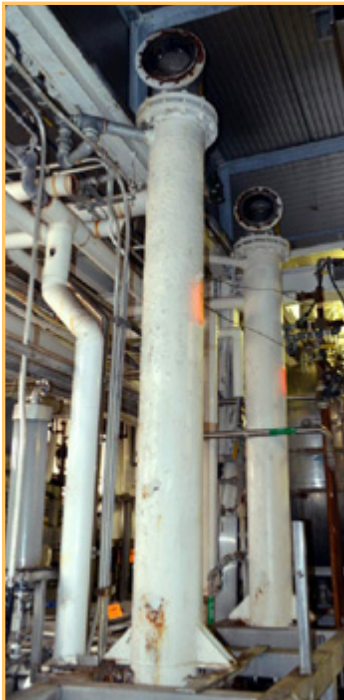
(5) SHELL & TUBE HEAT EXCHANGER