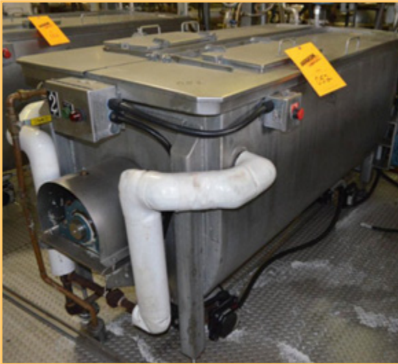
DOUBLE SPIRAL RIBBON BLENDER, APPROXIMATE 250 GALLON