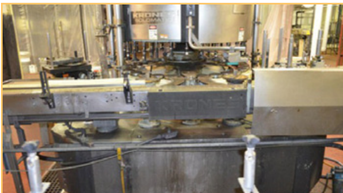
KRONES SOLOMATIC 30 STATION GLUE LABELER