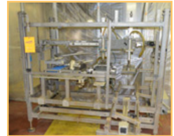
DIVILVISS DROP CASE PACKER