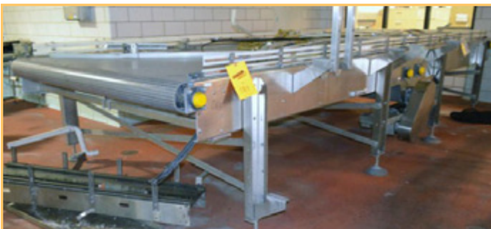
FLEETWOOD ACCUMULATION TABLE, APPROXIMATE 96" WIDE X 240"