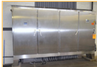
(2) STAINLESS STEEL CONTROL PANEL