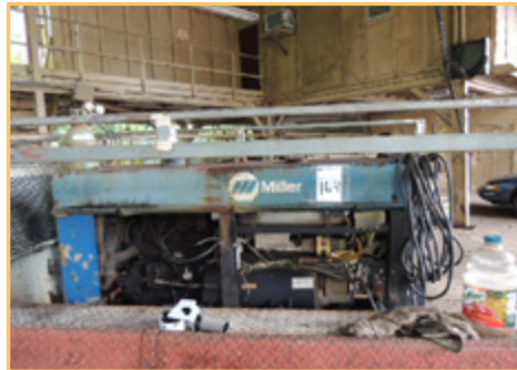
MILLER BIG 40 WELDERA