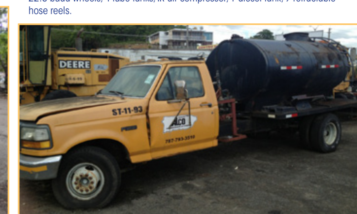
FORD SUPERDUTY XL PRIMER TRUCK, 1993

1 - International 4900 / DT466E 1997 Service Truck, GVWR 22,500lbs, 11 R 22.5 budd wheels, 4 lube tanks, IR air compressor, 1 diesel tank, 9 retractable hose reels.