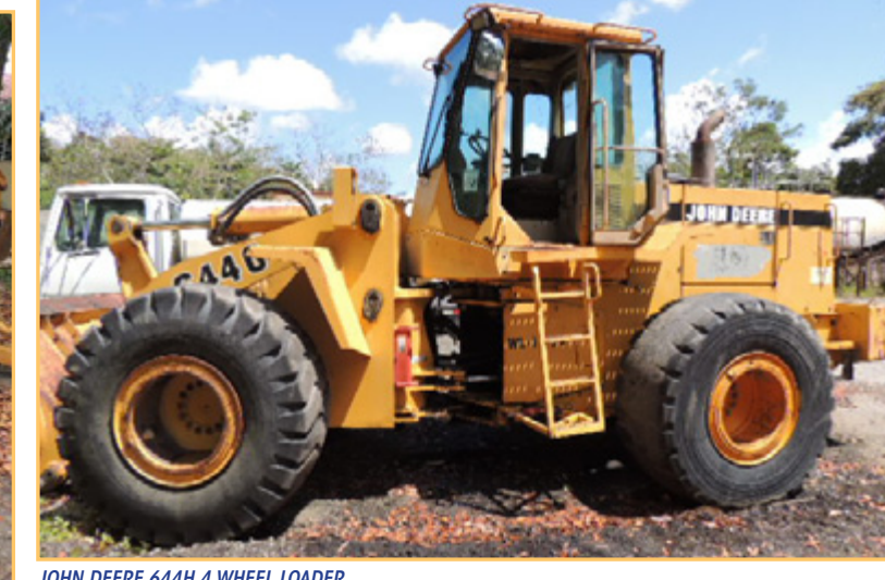
JOHN DEERE 644H 4 WHEEL LOADER