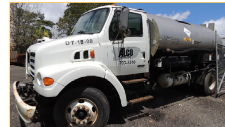
FORD / STERLING, ETNYRE L-7501, SHOOT DISTRIBUTION TRUCK, MFG. DATE 1999