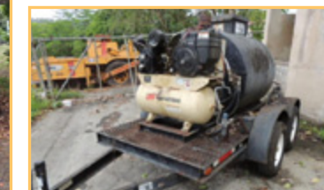
HUSKY 1040 SEALER TRAILER