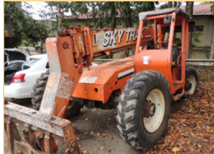
SKY TRAK 6036C POWERED BY CUMMINS, TELESCOPIC FORKLIFT 36'