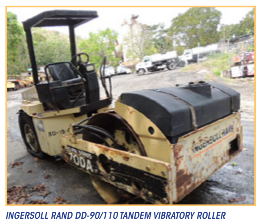
INGERSOLL RAND DD-90/110 TANDEM VIBRATORY ROLLER