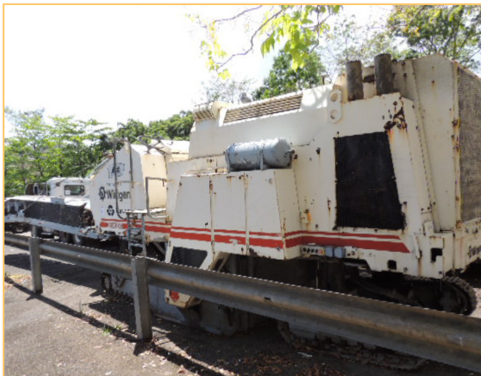
WIRTGEN 2000DC COLD MILLING MACHINE