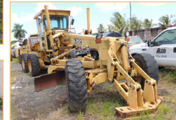
JOHN DEERE 670C GRADER