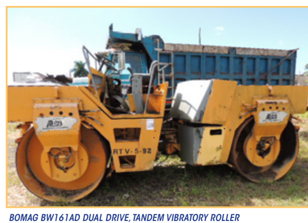
BOMAG BW161AD DUAL DRIVE, TANDEM VIBRATORY ROLLER