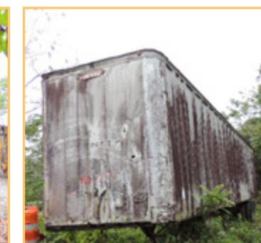
TRAILMOBILE A31AISAW 40' STORAGE VAN