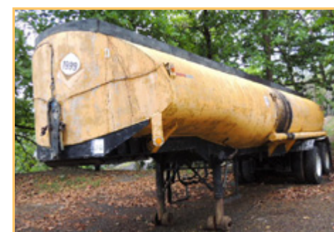
OIL TRAILER, 500GAL