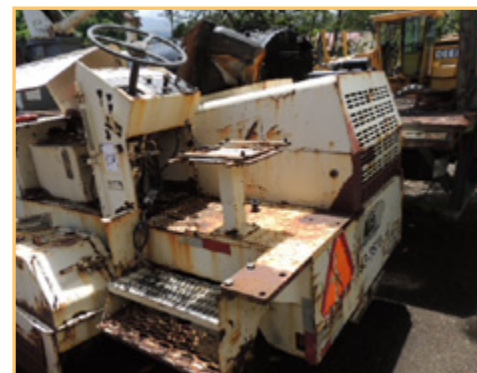
ROADTEC RX-10 COLD MILLING MACHINE