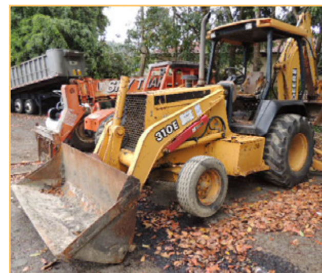
JOHN DEERE 310E BACKHOE / LOADER