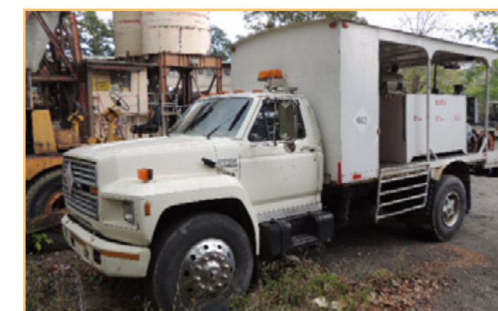
FORD F-700 SERVICE TRUCK

1 - Ford F-800 Water Truck, powered by Cummins, 5 speed transmission, 2000gal tank w/ pump and 5.5 hp gas motor, 200gpm