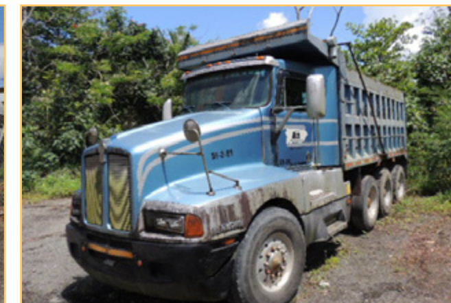
KENWORTH 3 AXLE DUMP TRUCK