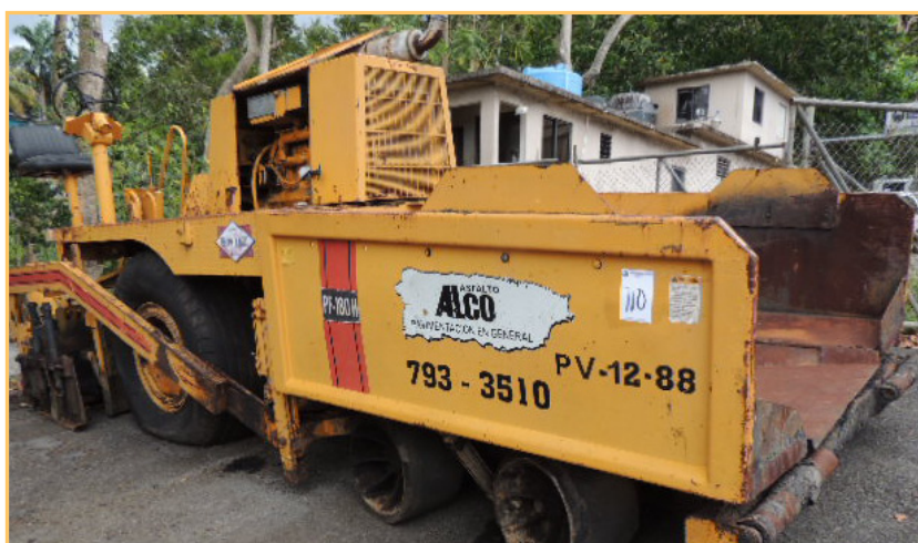
(8) BLAW KNOX PF-180H PAVER DUAL DRIVE, 8' SPREADER