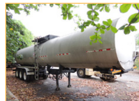
ETNYRE 1999 HOT TRAILER, 9000GAL