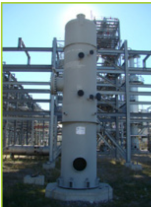
ARROW TANK SURGE DRUM, 4' X 20'