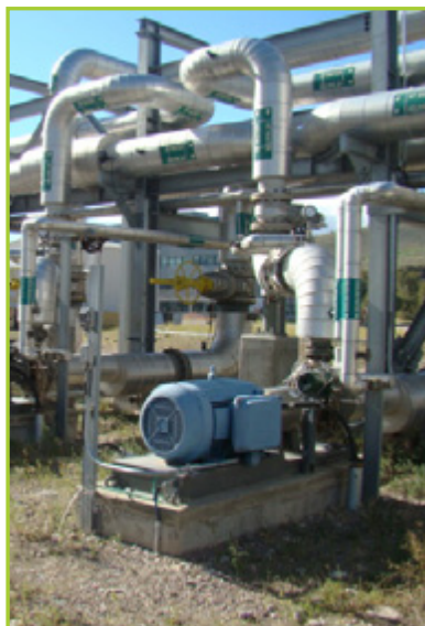
LOT (6) CENTRIFUGAL CIRCULATING PUMPS

Large Quantities of Raw Materials Including: Cabling, Wiring, and Scrap Metal.