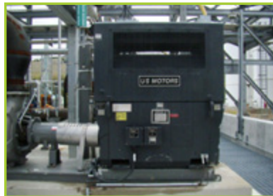
U.S. MOTORS 300-HP RECIRCULATING PUMP

1 – Arrow Tank Expansion Tank, 5' X 10', Carbon Steel Construction, Insulated, 280-PSI at 400 to -30-Degree F MAWP