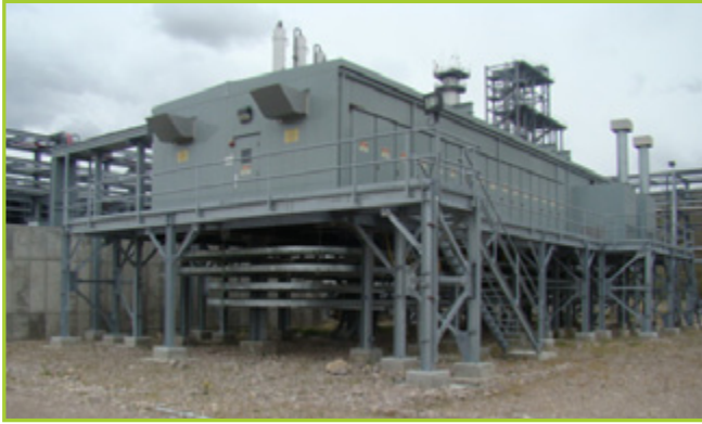
ABB POWER DISTRIBUTION CENTER, W/ SWITCHGEAR