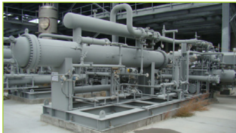
GEA FES REFRIGERATION SKID

8 – Keen 2-HP Grinding Pump, , 36" Aluminum Lid, (UNINSTALLED)