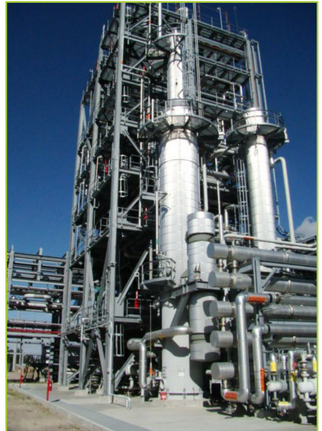
EATON DISTILLATION COLUMN, 7' DIA AT BOTTOM, 3' DIA AT TOP, 17' 6" TOP HEIGHT