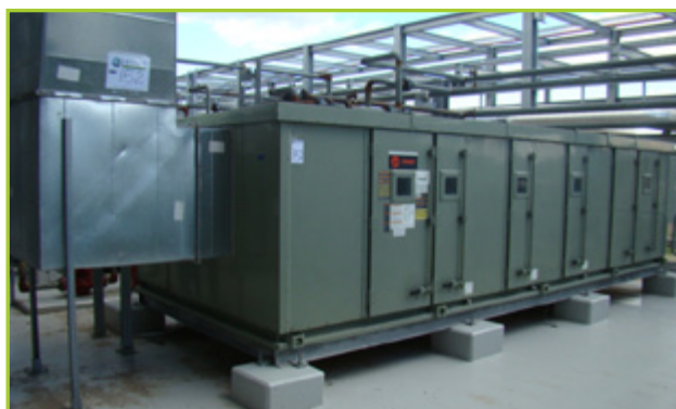
TRANE T-SERIES CLIMATE CHANGER AIR HANDLER

Large Quantities of Power Distribution Equipment and Electrical Distribution Panels, from: ABB, General Electric, Siemens, and Others.