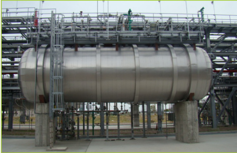
AMERICAN FABRICATION NB937 TCS DISTRIBUTION TANK, 10' X 40'