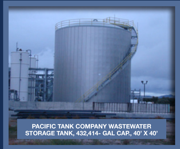
PACIFIC TANK COMPANY WASTEWATER STORAGE TANK, 432,414- GAL CAP., 40' X 40'

This sale features an amazing inventory of brand new and never used equipment, and consists of assets to suit a host of industries. Please refer to the online catalog for up to the minute lot sequencing. Please refer to the key assets online for preliminary asset related details. A complete listing of assets can be found online as well.