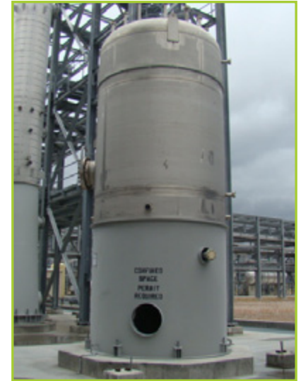
HARRIS THERMAL TRANSFER PRODUCTS MB3630 STORAGE TANK, 10' X 20'