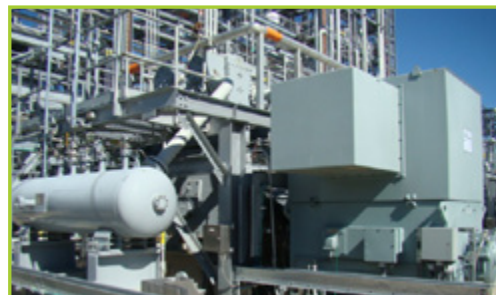
NEUMAN & ESSER 1T2S190 GAS COMPRESSOR