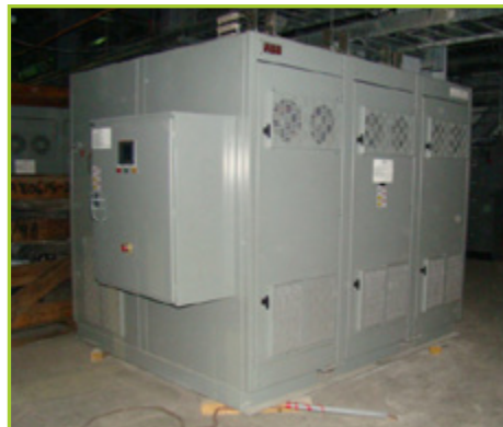
ABB THYRISTOR CONTROLLED POWER SUPPLY

8 – Russelectric RTBDNB-12004CEF Automatic Transfer Switch Control System, Type 3 Enclosure. Mfg. Year 2008.