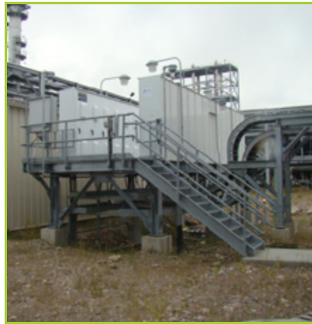
ALLEN-BRADLEY CENTERLINE 2100 MOTOR CONTROL CENTER