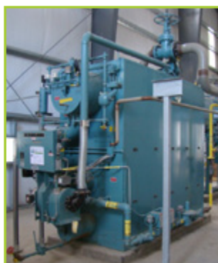
CLEAVE-BROOKS FLX700-800-150ST WATER TUBE BOILER