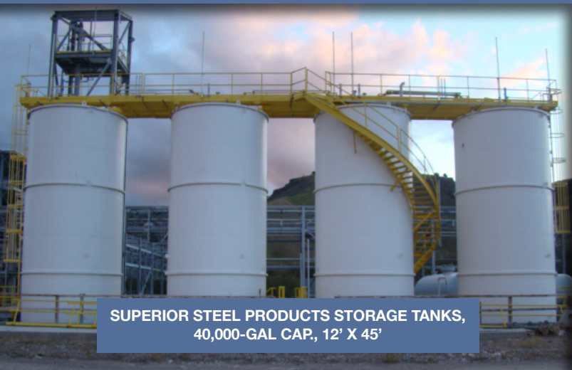
SUPERIOR STEEL PRODUCTS STORAGE TANKS, 40,000-GAL CAP., 12' X 45'

The site is approximately 67 acres and comprised of over 35,400 cubic yards of concrete, 9,488 tons of steel, 246,894 lineal feet of process and utility piping.