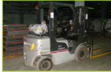
NISSAN MU1F2A25LV FORK TRUCK