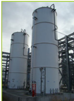
SUPERIOR STEEL PRODUCTS STORAGE TANKS, 60,000-GALLON CAP , 15' X 46"