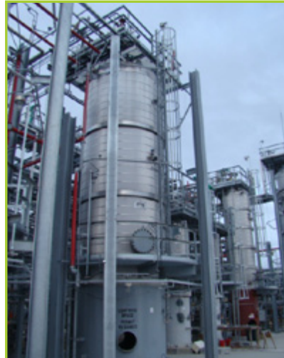
SMITH NB2 STORAGE TANK, 9' X 30"