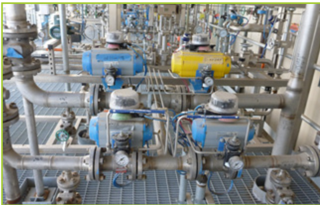
GEC GAS CONSOLE