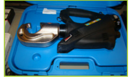
THOMAS & BETTS BATTPAC LT CRIMPING GUN