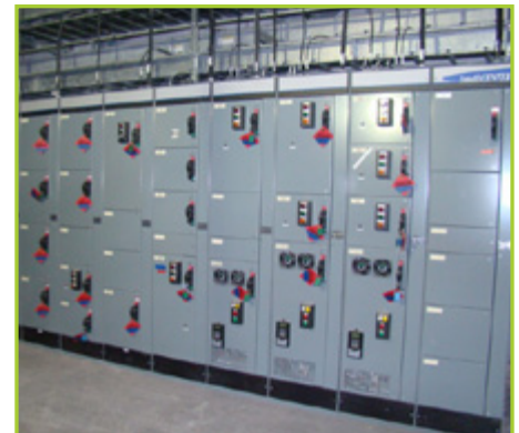
ALLEN-BRADLEY CENTERLINE 2100 MOTOR CONTROL CENTER