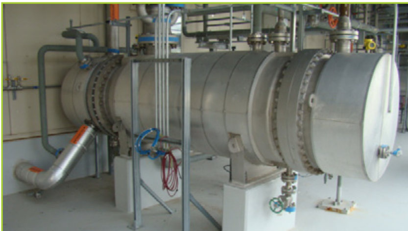
G & R VAPOR CONSOLE