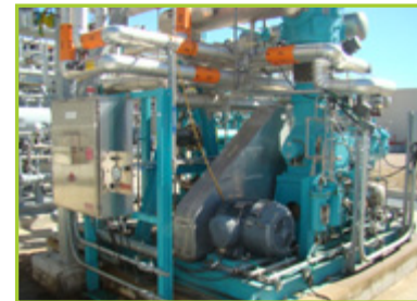
HOWDEN P123LG280/17 REGENERATION GAS