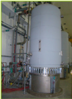
GEC HER 12 CHEMICAL VAPOR DEPOSITION REACTOR, 24-ROD