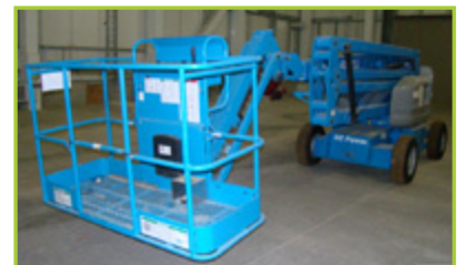
GENIE Z-45/25J AERIAL LIFT, 500LB CAP