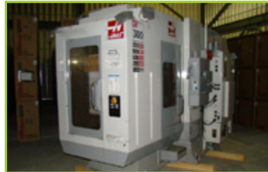
HAAS EC300 CNC HORIZONTAL MACHINING CENTER