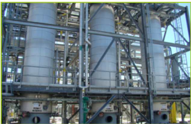
ARROW TANK ADSORBERS, 6' X 30'