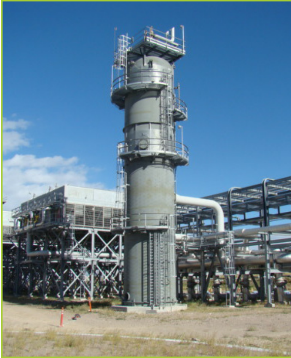
MIDWEST IMPERIAL STEEL FAB. INC SURGE DRUM, 15' X 60'