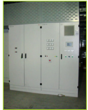
AEG THYROBOX THYRISTOR POWER CONTROLLER