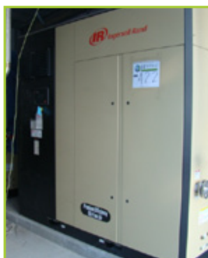
INGERSOLL-RAND IRN150H-OF AIR COMPRESSOR