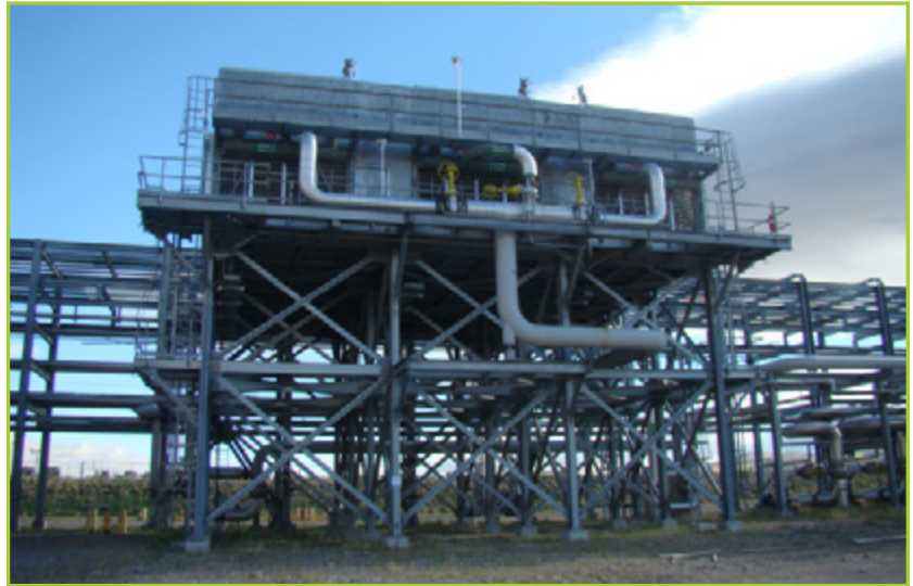
SMITHCO 9-FAN AIR EXCHANGER

1 – Steeltex Hot Oil Cooler, 12" X 24', Carbon Steel Construction, Shell and Tube Heat Exchanger, 550-PSI at 300 to -20-Degree F Shell Side, 550-PSI at 550 to -20-Degree F Tube Side, Insulated