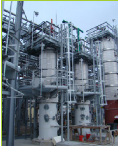
INDUSTRIAL PIPING NB349 STORAGE TANK, 4' X 18'

Large Quantity of Heat Exchangers and Tanks from: Armstrong, Batiisti, Fabsco, Flowserve, Harris Thermal Transfer Products, Perry, Steeltek, Thompson, and Others.