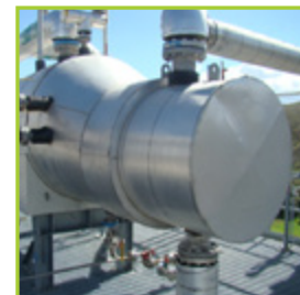
LIUIC HYDROCHLORIC ACID COLUMN CONDENSER