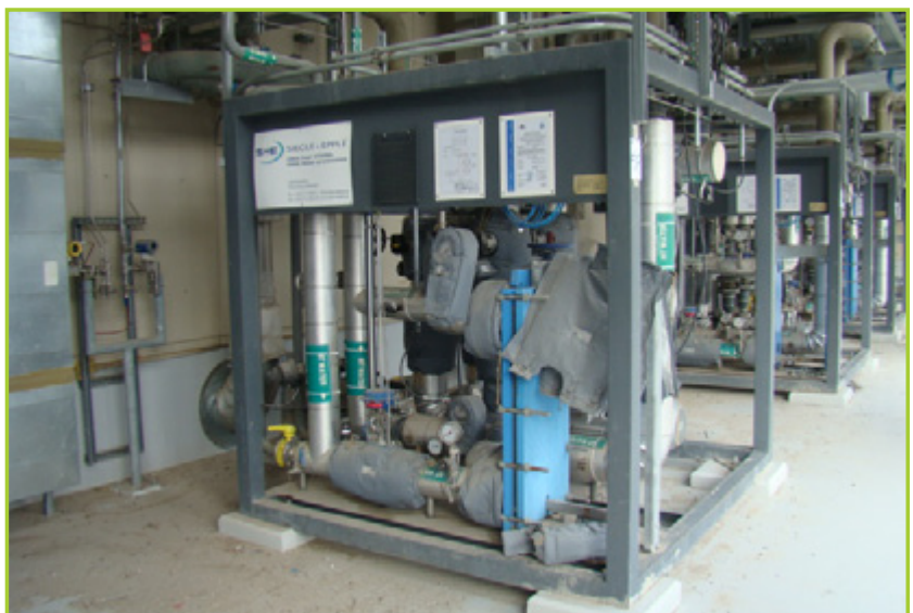
LIBIG HEAT EXCHANGER

4 – G & R Vapor Console, Mfg. Year 2008.