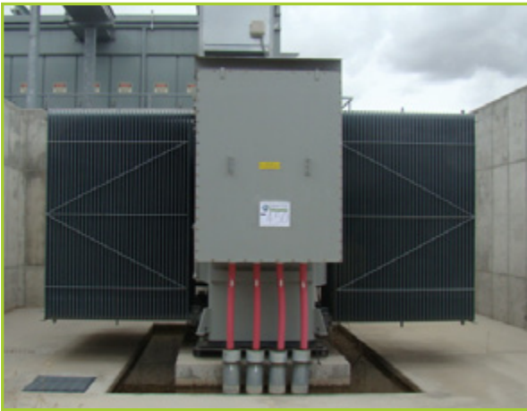
ABB STEP-DOWN TRANSFORMER

Large Quantities of Raw Materials Including: Cabling, Wiring, Scrap Metal and More Available Online.