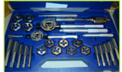
IRWIN HANSON TAP & HEXAGON DIE MASTER SET