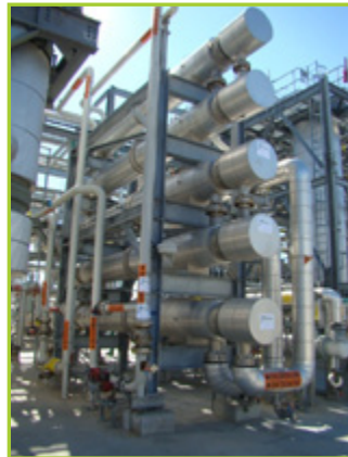
PERRY FTSS-20-1231 HEAT EXCHANGER, 22" X 22'