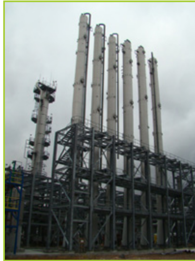
JETT WELD MB2025 DISTILLATION COLUMNS, 60" X 131'