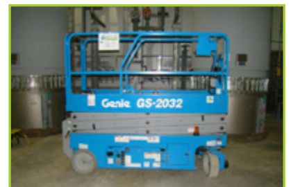
GENIE GS-2032 ELECTRIC MAN LIFT