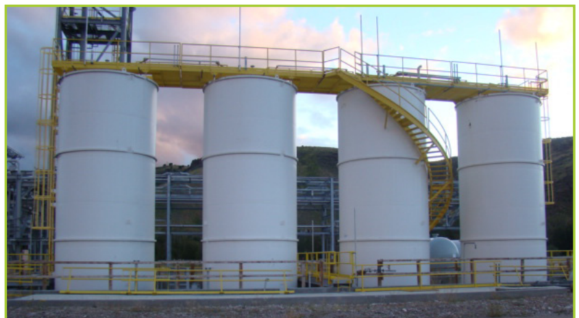
SUPERIOR STEEL PRODUCTS STORAGE TANKS, 40,000-GAL CAP., 12' X 45'

Large Quantities of Pumps, Motors, Valves, Centrifuges, Compressors, Controls and More Available Online.