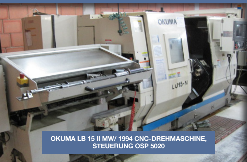
OKUMA LB 15 II MW/ 1994 CNC-DREHMASCHINE, STEUERUNG OSP 5020