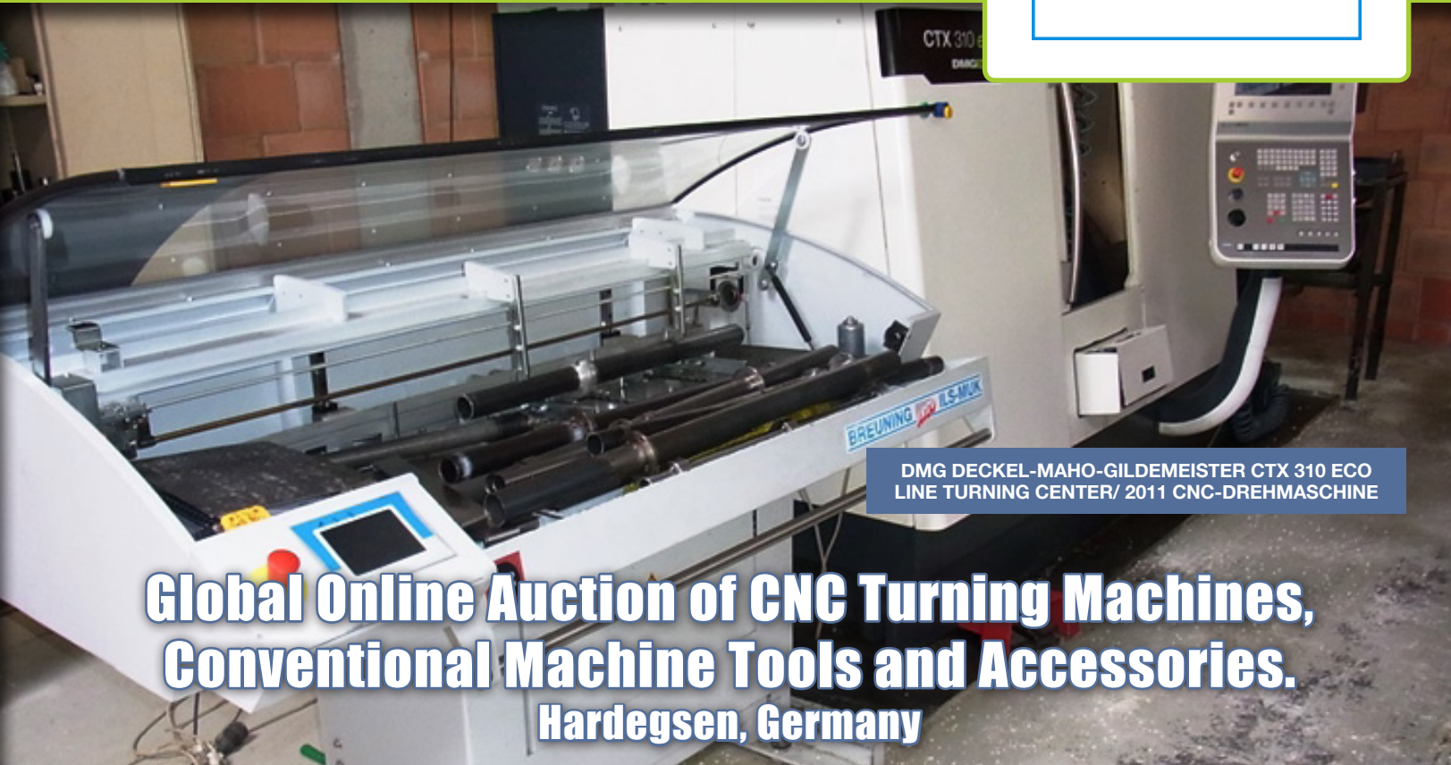
DMG DECKEL-MAHO-GILDEMEISTER CTX 310 ECO LINE TURNING CENTER/ 2011 CNC-DREHMASCHINE