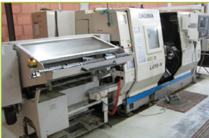
OKUMA LB 15 II MW/ 1994 CNC-DREHMASCHINE, STEUERUNG OSP 5020