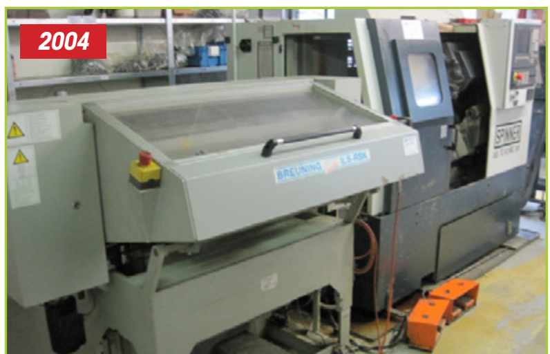
SPINNERTC 42-MC/ 2004 CNC-STANGENDREHMASCHINE

1 – OKUMA CNC Multi Station Turning Machine LU 15 M/2002 4 Achsen 4-Achsen CNC Drehmaschine , Steuerung OSP-U 100 L, S/N 2337, ca. 42 500 Betriebsstunden, oberer Revolverkopf mit 12 Stationen und angetriebenen Werkzeugen, unterer Revolverkopf mit 8 Aufnahmen, Stangenlademagazin BREUNING IRCO ILS RBK 10010, 80/200, div. Werkzeuge und Aufnahmen 4-Axis CNC Turning Machine, make OKUMA, type LU 15 M, year 2002, Control OSP-U 100 L, S/N 2337, approx. 42 500 hrs, revolver 1 with 12 tool stations and driven tools, revolver 2 with 8 tool stations, bar loader make BREUNING IRCO ILS RBK 10010, 80/200, various tools and tool holders.