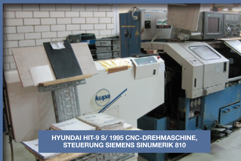
HYUNDAI HIT-9 S/ 1995 CNC-DREHMASCHINE, STEUERUNG SIEMENS SINUMERIK 810

Multiple Locations There Will Be A Live Public Preview September 5th, From 9:00am To 4:00pm, Local Time.