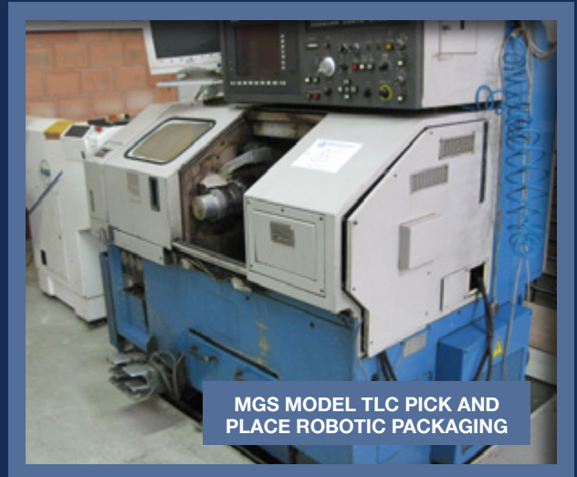
MGS MODEL TLC PICK AND PLACE ROBOTIC PACKAGING

Other Related Equipment Including: Grinding Machine, make SPINNER, type SM 100, year 2004 • Lathe, make GEMA, year 1970 • Automatic Saw, make KASTOtype HSS 210/240, year 1995 • Bandsaw, year 2004 • Column Drill, make FLOTT • Column Drill, make KNUTH Air Compressor make ATLAS COPCO, type GX 5, year 2007 • Various conventional machinetools such as column drills, lathes and grinders from SHAUDT, DECKEL and other major manufacturers • Air Compressors, racks, trolleys and office equipment • And Much More!