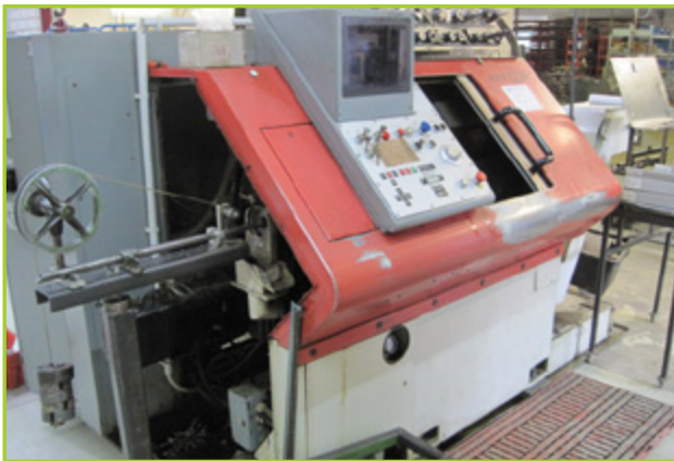
GILDEMEISTER NEF CT 20/ 1994 CNC DREHMASCHINE

1 – GILDEMEISTER NEF CT 20/ 1994 CNC Drehmaschine , S/N 320902/1994, Steuerung ELTRO PILOT L-2, Revolverkopf mit 16 Aufnahmen, Reitstock (demoniert) ca. 99210 Betriebsstunden CNC Turning Machine, make GILDEMEISTER, type NEF CT 20, year 1994, control ELTRO PILOT L-2, revolver with 16 tool stations, tailstock (dismantled), approx. 99210 hrs