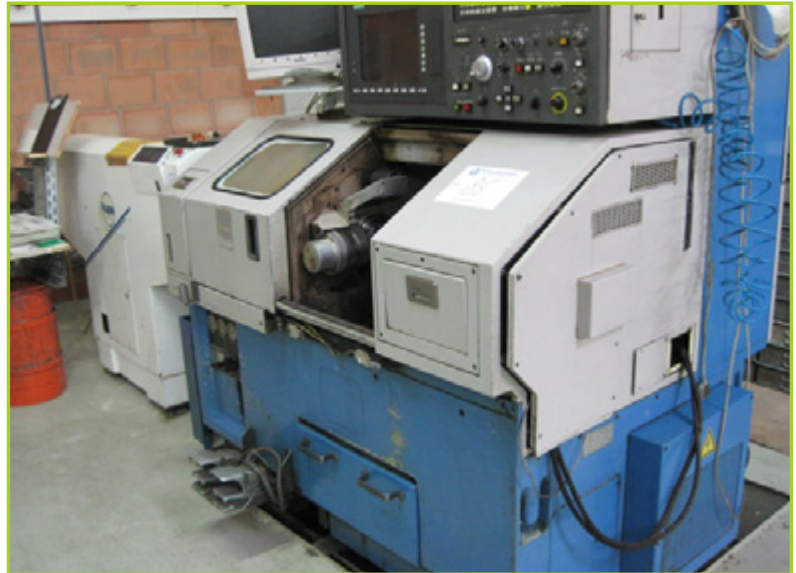
HYUNDAI HIT-9 S/ 1995 CNC-DREHMASCHINE, STEUERUNG SIEMENS SINUMERIK 810

1 – SPINNERTC 42/ 2005 CNC-Drehmaschine , S/N AL 01/8, Steuerung SIEMENS SINUMERIK 810 D, 54500 Arbeitsstunden, Revolver mit 16 Stationen, Stangenlademagazin SPINNER SERVO-LOAD 80/200, 2008, div. Stahlhalter und Werkzeuge CNC Turning Machine, make SPINNER, type TC 42, year 2005, S/N AL 01/8, control Siemens Sinumerik 810D, hrs approx. 54500, revolver with 16 stations, bar loader, make SPINNER Servo-Load 80/200, year 2008, incl. various tool holders and tools.