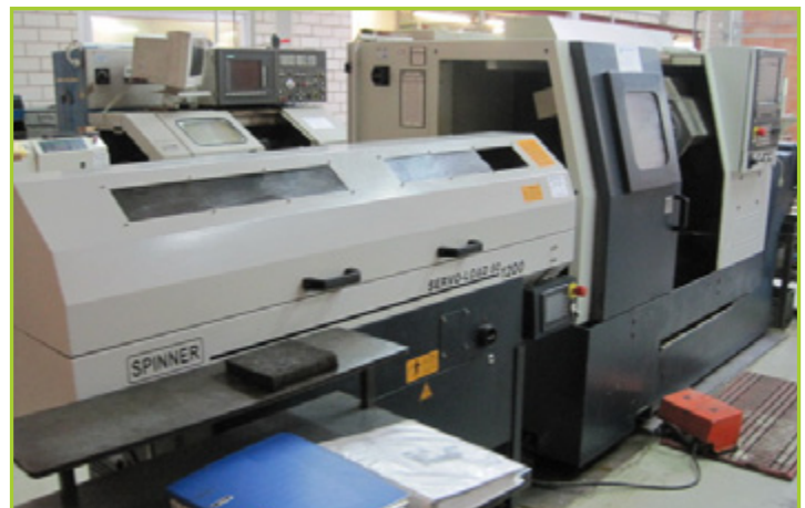
SPINNER TC 400 42 MC/ 2007 CNC-DREHMASCHINE