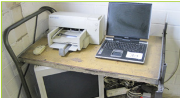
TOSHIBA PROGRAMMING STATION WITH LAPTOP, SCREEN AND HP PRINTER