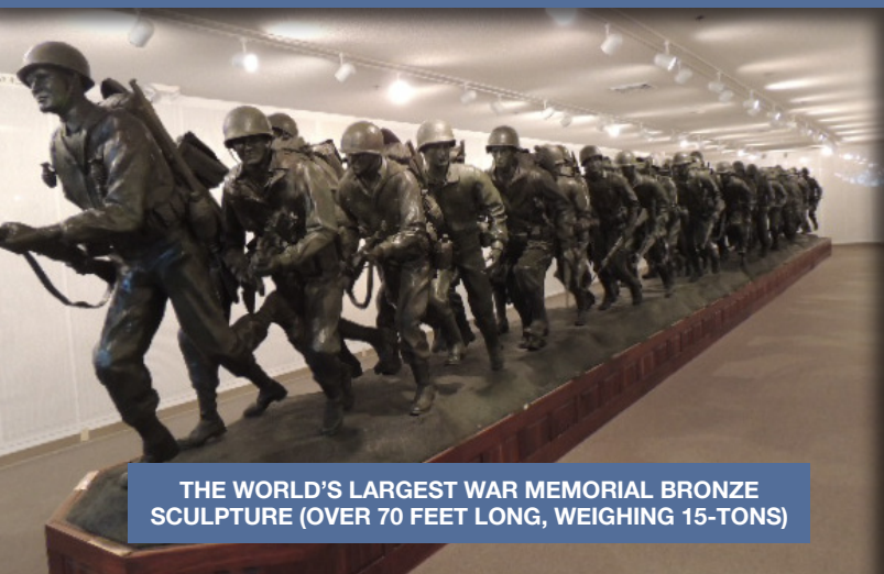
THE WORLD'S LARGEST WAR MEMORIAL BRONZE SCULPTURE (OVER 70 FEET LONG, WEIGHING 15-TONS)

Including: Prints, Paintings, Posters, Medals, Pendants, Uniforms, Equipment, Weapons, Memorabilia, and Much Much More.