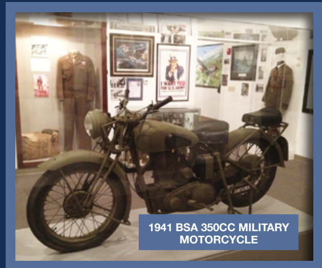
1941 BSA 350CC MILITARY MOTORCYCLE

The world's largest war memorial bronze sculpture (over 70 feet long, weighing 15-tons) is the hallmark of the museum and features 50 life-size statues storming a beach. The life-size figures were modeled after a combat soldier from each of the 50 states. The statue is surrounded by the names of those killed in action during WWII. **Seller Financing Available**