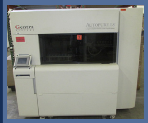
Scan this QR Code with your smartphone for More Information.

Applied Biosystems 7500 Fast Real-Time PCR System, Applied Biosystems Veriti 96 Well Thermal Cycler, Hybaid PCR Express System (4), Beckman Coulter HPLC System (5+), Beckman SPRI-TE Nucleic Acid Extractor System, Applied Cyto Fluor 4000 Multi-Well Plate Reader, Millipore Milli-Q Water Purification System, Qiagen Genra AutoPure LS large sample nucleic Acid Purification System, Beckman BioMek 2000 Liquid Handling System (3), Tecan Liquid Handling System (3), Savant UVS400, BBraun Sigma 2k15, Jun-Air Compressor, Pumps, Lab Benches, Ovens and Much More!!!