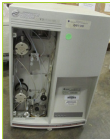
SYSTEM GOLD 125 NM SOLVENT MODULE