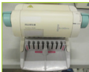
FUJIFILM QUICK GENE MINI80