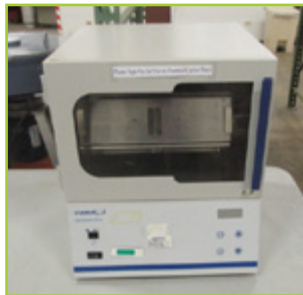
VWR HYBRIDIZATION OVEN