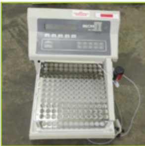
BECKMAN SC 100