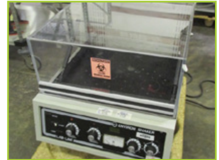
LAB-LINE ENVIRON SHAKER MODEL NO. 3527