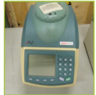
THERMO HYBAID PX2 THAMAL CYCLER