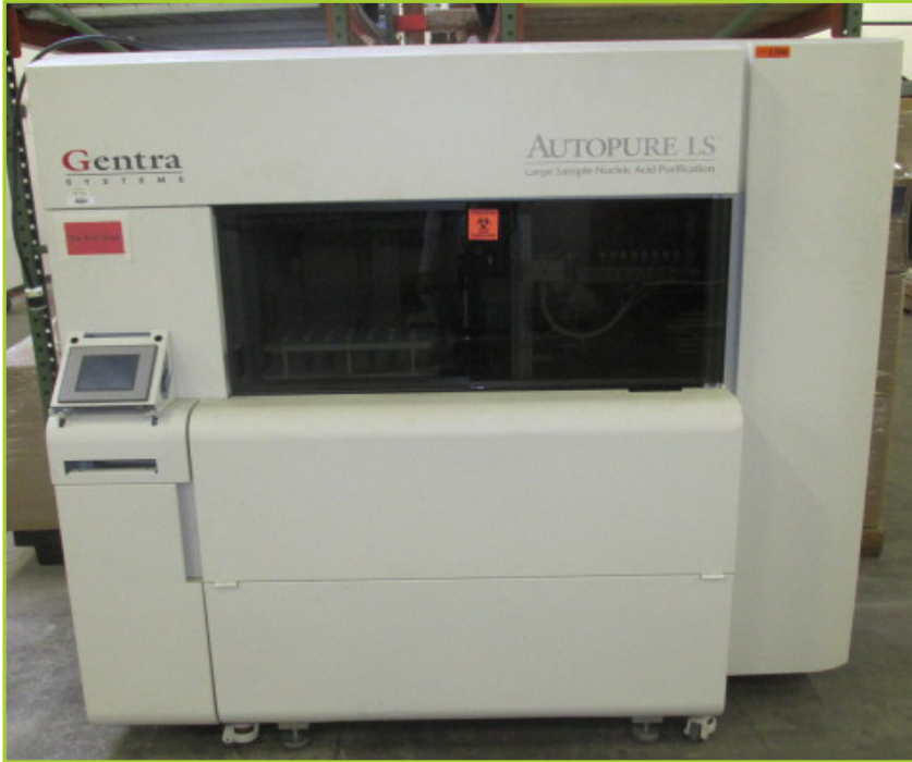
GENTRA SYSTEMS- AUTOCURE LS LARGE SAMPLE NUCLEIC ACID PURIFICATION