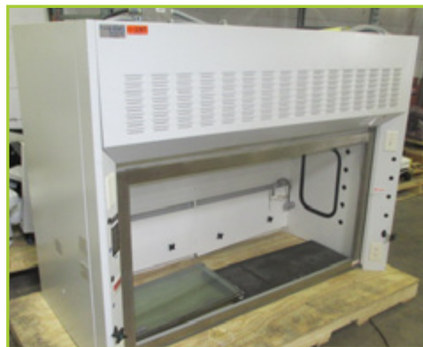
LABORATORY FUME HOOD