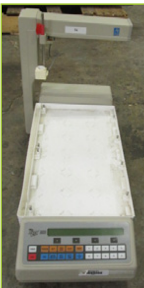
FOXY 200 LIQUID CHROMATOGRAPHY