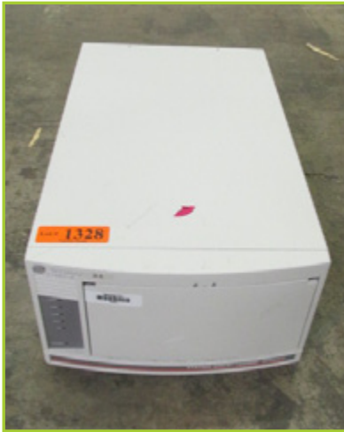
SYSTEM GOLD 166NMP DETECTOR