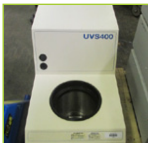
SAVANT VACUUM SYSTEM UVS400