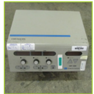
VWR SCIENTIFIC 3000 VORTEX MIXER