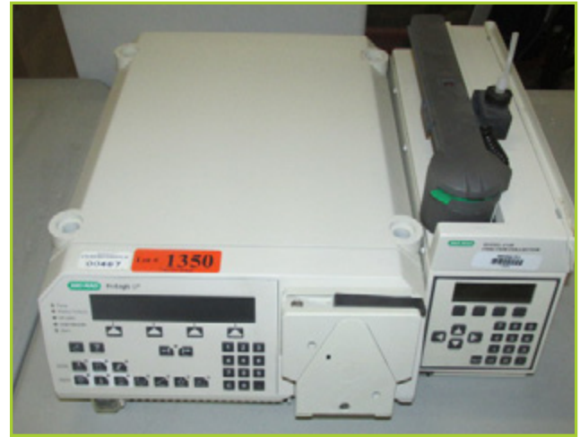
BIO RAD BIOLOGIC LP CHROMATOGRAPHY SYSTEM W/ BIO RAD FRACTION COLLECTOR