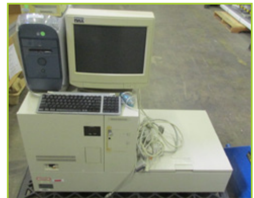
FMBO-100 FLUORESCENT METHOD BIO-IMAGE ANALYZER