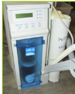
MILLIPORE BIOCELL WATER SYSTEM