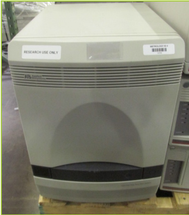
APPLIED BIOSYSTEM 7500 FAST REAL-TIME PCR SYSTEM

Monday, November 11th, 9:00am - 4:00pm Local Time