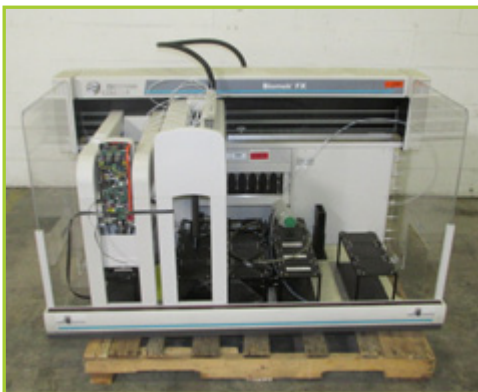
BIOMEK FX- MODEL-717013 BECKMAN COULTER