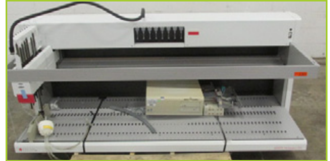
TECAN GENESIS WORKSTATION 200-MODEL- RWS