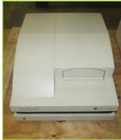
CYTOFLUOR MULTI- WELL PLATE READER SERIES 4000