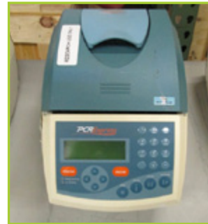
HYBAID PCR EXPRESS