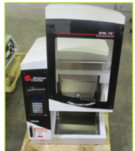
SPRI-TE NUCLEIC ACID EXTRATOR - MODEL NO. A50100