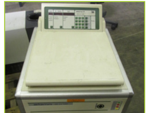
SIGMA LABORZENTRIFUGEN - MODEL 2K15