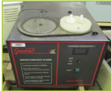
GENEVAC VAPOUR CONDENSER VC3000D