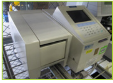
SHIMADZU MINI 1240 UV/VIS SPECTROPHOTOMETER

2 – Hanson Virtual Instruments 25-710-130 Dissolution Tester, 115V, 60 Hz, 10A, mfg. 2004 Lot – Vankel Lot Includes (2) Dissolution systems