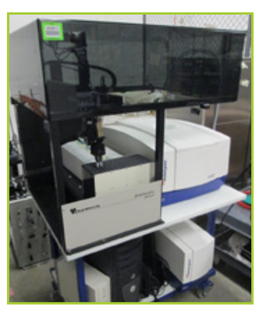
DURATECH ASP 960 AUTO SAMPLER