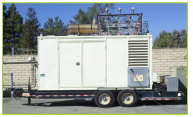
1991 MOBILE CAT MODEL SR4-400KW GENERATOR, 388HRS OF OPERATION

Monday, December 16th, 9:00 am - 4:00 pm Local Time.