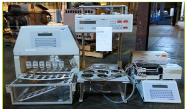
HPLC ELECTRONIC CONTROL CENTER

VANKEL LOT INCLUDES (2) DISSOLUTION SYSTEMS