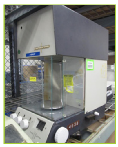
SARTORIUS PRECISION BALANCE TYPE 2602