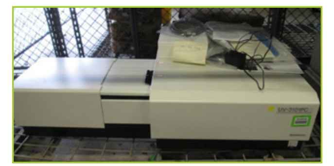
SHIMADZU UV-3101 PC UV-VIS-NFR SCANNING SPECTROPHOTOMETER