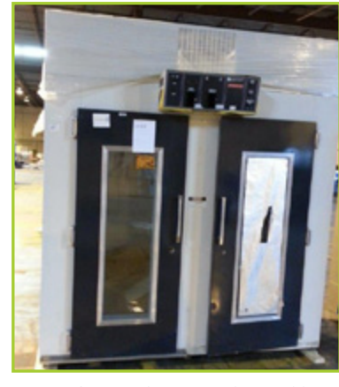
LAB LINE STABILITY CHAMBER (DOUBLE DOOR)