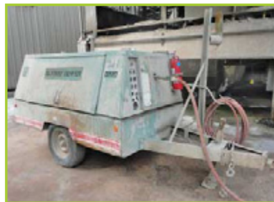
(3) VARIOUS PORTABLE AIR COMPRESSORS BY