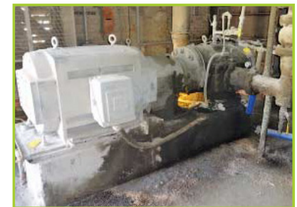
C.E. RAYMOND MODEL 593 COAL MILL