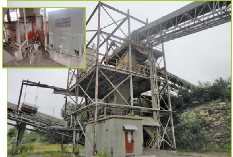
PENNSYLVANIA SIZE 18" X 68" HAMMER MILL SECONDARY QUARRY CRUSHER

Anyone who plans on entering the premises of Lafarge will be required to adhere to the safety policies which include wearing hard hats, steel toe boots and safety glasses, being over the age of 18 and execution of a hold harmless agreement. Other requirements may be presented to you upon arrival.