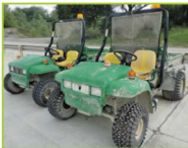
(2) JOHN DEERE 4X2 GAS POWERED GATORS