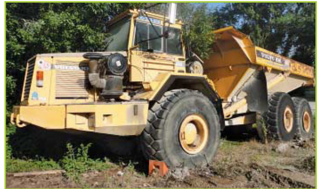
1996 VOLVO MODEL BM-A40 OFF ROAD DUMP TRUCK