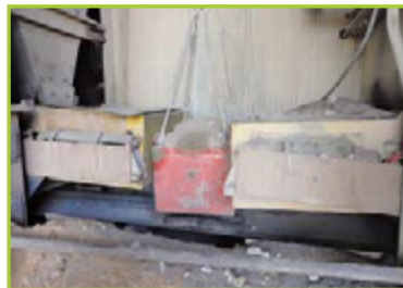
PARTIAL VIEW INLINE SCALE, METAL DETECTOR AND MAGNETIC SEPARATOR SYSTEMS