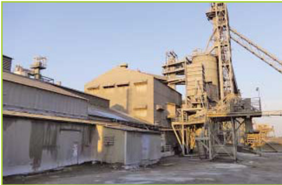
NORDBERG 9'6" DIA. X 34' L STEEL DRUM TWO-COMPARTMENT RAW MILL