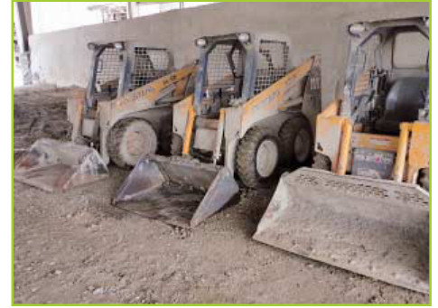
(3) MUSTANG COMPACT LOADER SKID STEERS