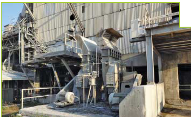
PARTIAL VIEW LARGE QUANTITY OF AGGREGATE CONVEYORS TO 60" WIDE AND 310' LONG