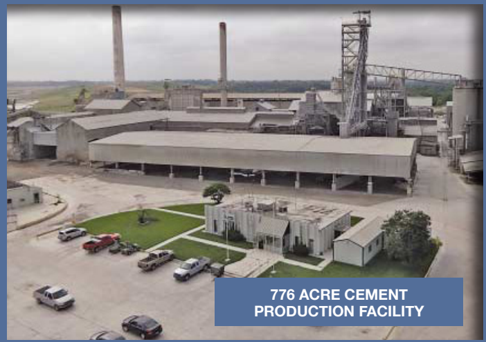
776 ACRE CEMENT PRODUCTION FACILITY

Approx. 6,000 Ton Steel Scrap • Huge Quantities Heavy Duty Electrical Wiring, Transformers and Switchgear • All Steel Building Structures are to be Sold • 800 HP Penn Hammer Mill Primary Crusher • 600 HP Penn Hammer Mill “Bulldog” Secondary Crusher w/ Vibratory Screens & Hoppers • Kiln Reclaim Hopper Systems to Include Conveyors Dust Collectors • 1,500 HP Norberg Raw Mill • 1,500 HP Norberg Finish Mill Hercules Primary Roll Mill Raymond Model 593 & 493 Coal Mills • (3) Ball Mill Finishers • (2) 10’ Dia. X 350’ Long Rotary Kilns with Drag Thru Chain Conveyors • Huge Quantities Rubber Belt Trough Conveyor & Steel Holding Bins • Weigh Belt Conveyor Systems, Air Compressors • 48” X 204” American Pacemaker Toolroom Lathe • Misc. Toolroom Machinery, Trucks, Skid Steer Loaders • Huge Quantity Spare Electric Motors to 1,000 HP • 1,500,000 Book Value Replacement Parts • Bridge Cranes & Many Other Related Items SHAUDT, DECKEL and other major manufacturers • Air Compressors, racks, trolleys and office equipment • And Much More!