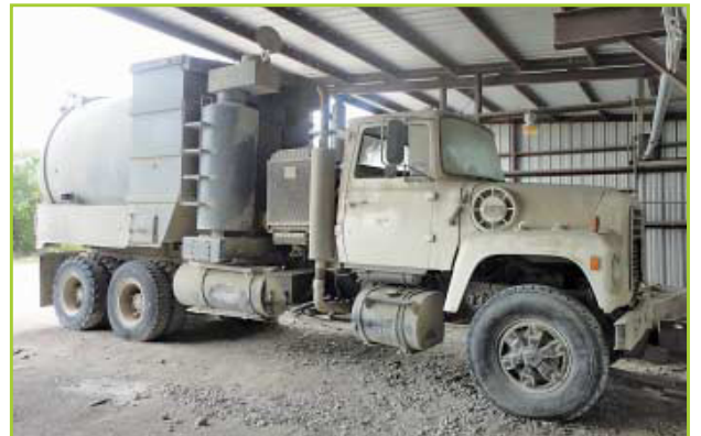
1980 FORD LT-8000 DIESEL DUAL TIRE TANDEM AXLE VACUUM TRUCK