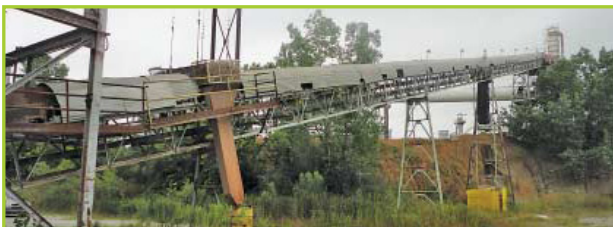
PARTIAL VIEW LARGE QUANTITY OF AGGREGATE CONVEYORS TO 60" WIDE AND 310' LONG

Anyone who plans on entering the premises of Lafarge will be required to adhere to the safety policies which include wearing hard hats, steel toe boots and safety glasses, being over the age of 18 and execution of a hold harmless agreement. Other requirements may be presented to you upon arrival.