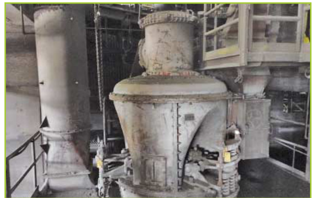
C.E. RAYMOND MODEL 593 COAL MILL