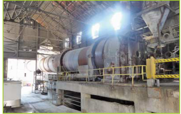
11'-3" DIA. DISCHARGE / 10' DIA. FEED END X 335' LONG (K-1)

» (7) Eriez Vibrating Above Conveyor Belt Feeders; 12" X 24" Dis-Charge Chutes.