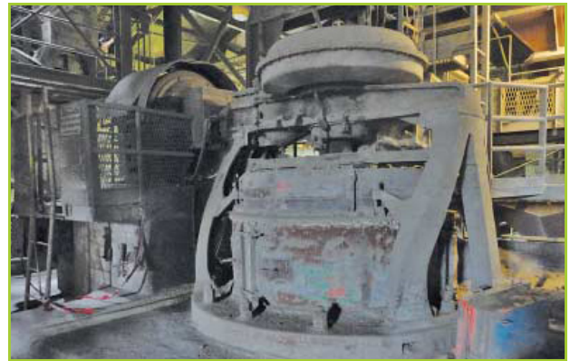
HERCULES (BRADLEY) MODEL 6000 ROLLER SCREEN TYPE PULVERIZER