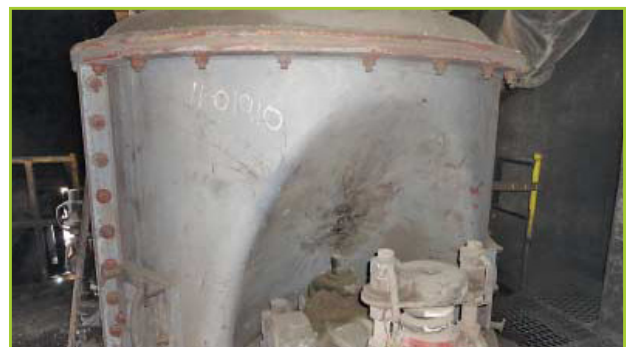
C.E. RAYMOND MODEL 593 COAL MILL