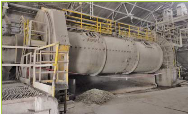
NORDBERG 9'6" DIA. X 34' L STEEL DRUM TWO-COMPARTMENT RAW MILL