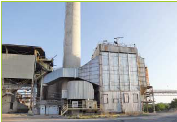
NORDBERG 9' DIA. X 34' L STEEL DRUM TWO-COMPARTMENT FINISH MILL