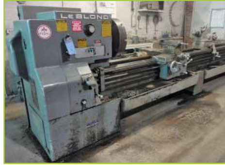
24" X 148" LEBLOND REGAL GEARED HEAD ENGINE LATHE