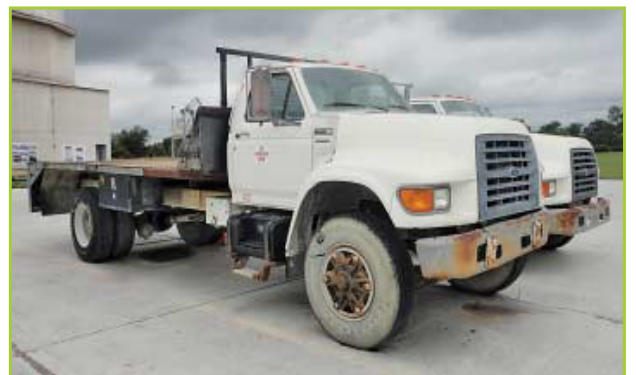
1995 FORD F700 GAS SINGLE AXLE DUAL TIRE FLAT BED TRUCK