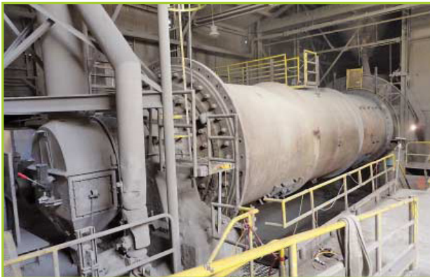
NORDBERG 9' DIA. X 34' L STEEL DRUM TWO-COMPARTMENT FINISH MILL