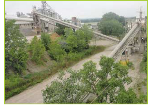
PARTIAL VIEW LARGE QUANTITY OF AGGREGATE CONVEYORS TO 60" WIDE AND 310' LONG