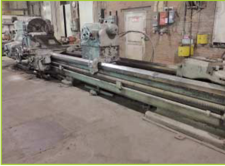
40" X 204" AMERICAN PACEMAKER STYLE J-6 GEARED

Monday, September 23rd & Tuesday, September 24th From 10:00 am - 4:00 pm