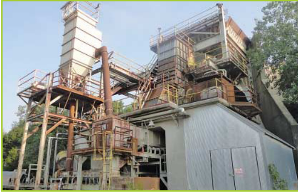
PENNSYLVANIA SIZE 72" X 60" HAMMER MILL PRIMARY QUARRY CRUSHER