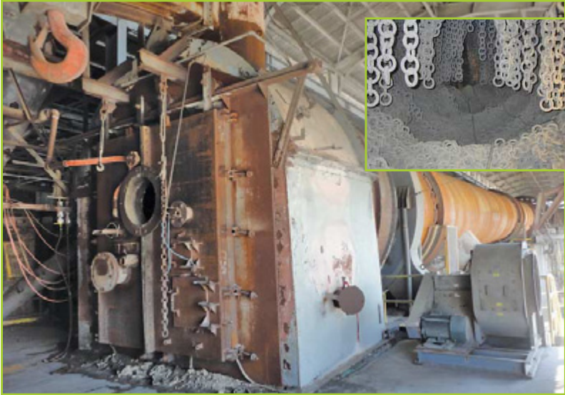
11' DIA. X 425' LONG (K-2) F.L. SMITH ROTARY KILN SYSTEM