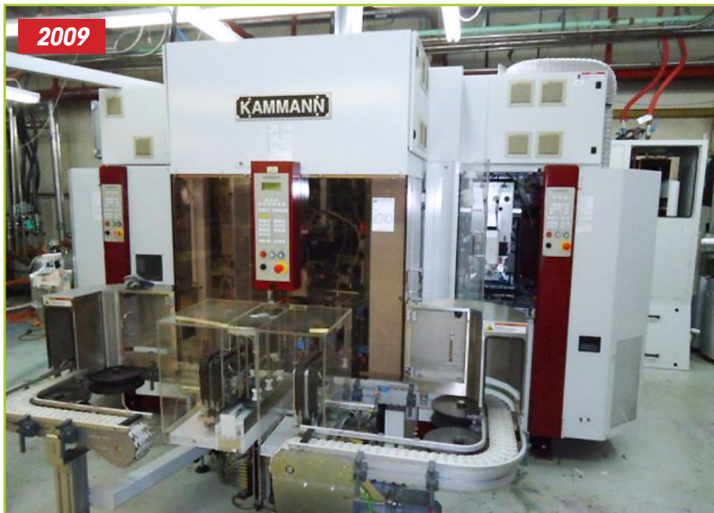
KAMMANN TYPE, 4, 15, 40 AUTOMATIC OFFSET PRINTER MFG YR. 2009