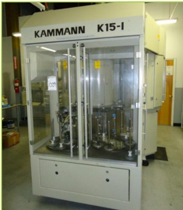
KAMMANN TYPE, 4, 15,09 HS K15-1 AUTOMATIC SILK SCREEN PRINTER MFG YR. 2004