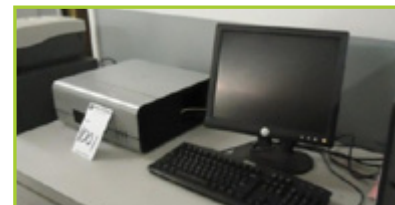
RIMAGE 480I RAS 10 RAS10, AUTOPRINTER II, LIBERTY INKJET PRINTER