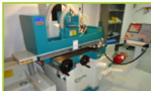
600 GROUP SURFACE GRINDER