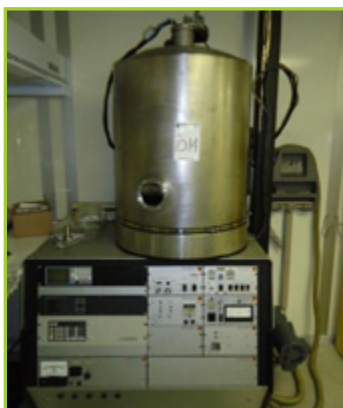
CHA INDUSTRIES VACUUM METALIZER