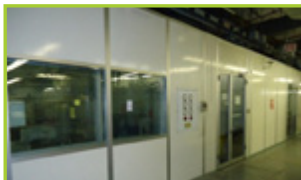
CLASS 1,000 CLEAN ROOM