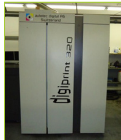
AUTOTEC AG DIGIPRINT 320 DIGITAL LASER PRINTER