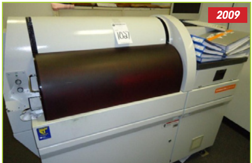
KAMMANN K 26 O-HS TYPE 4, 26, 15H, FUJITSU COMPUTERS SIEMANS, MFG. YR. 2009