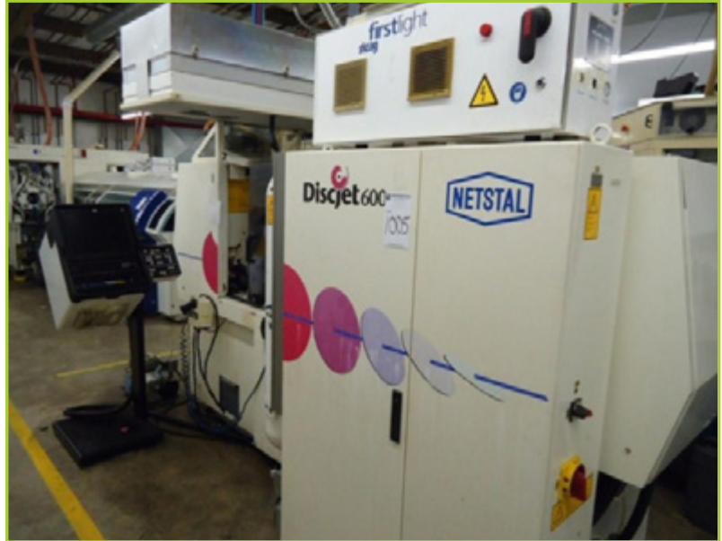
NETSTAL DJ 600/110, 60144 DISCJET HYDRAULIC INJECTION MOLDING MACHINE MFG YEAR 1999

1 – Record Products of America Stamper Punch Combination I.D. & O.D. Optical Stamper Punch, •Optically aligns CD Stamper & simultaneously punches the I.D. & O.D., Punches the center hole to data track within an average of 3.5 microns ECC . Quick Change I.D. Tooling now available. I.D. changes possible in minutes while O.D. remains stationary in tooling. with cross line generator IV 570 and Toshiba Monitor