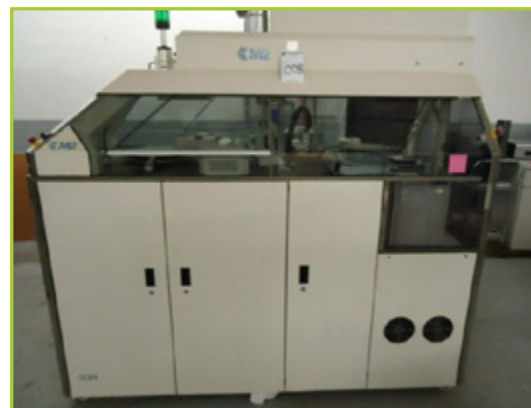
M2 SQ2 DVD/CD FINISHING MACHINE, FEATURING THE INNOVATION AND COMPACT FORMAT