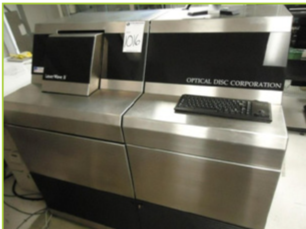
OPTICAL DISC CORP. LWII 2ND GENERATION LASER BEAM RECORDER