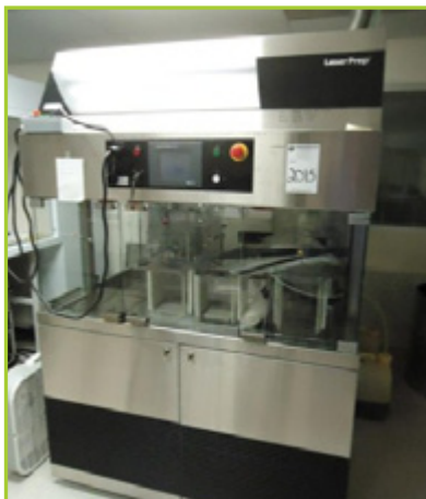
ODC NIMBUS LP4000 LASER PREP