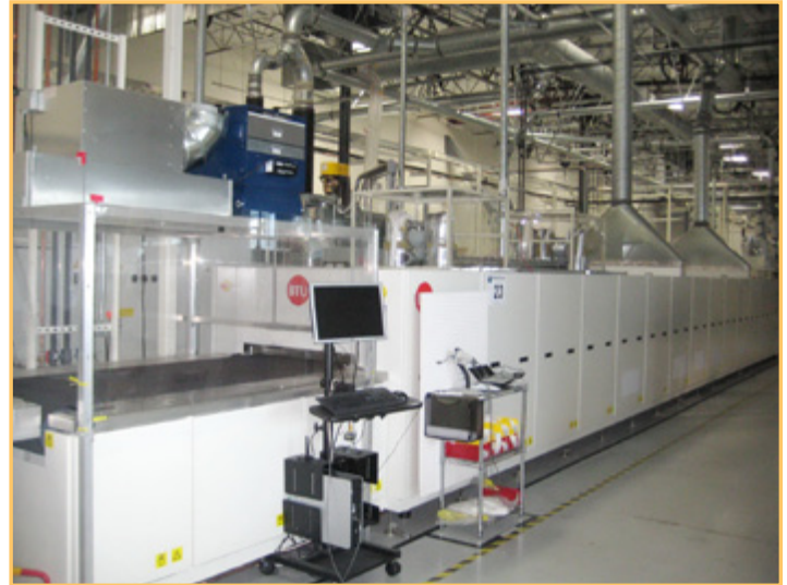
BTU INTERNATIONAL TFF 361-10-360N78GT COATING FURNACE