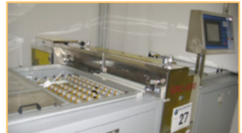
GP GROUP GRC-850 PHOTO RESIST ROLLER COATER