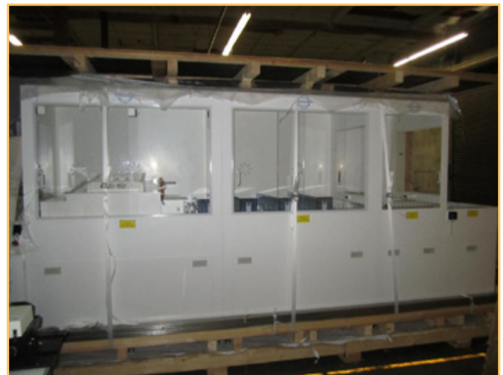
RAMGRABER GMBH INLINE STAR MODEL 2009 POLYPRO (LINE ETCH) 5 MODULE SYSTEM