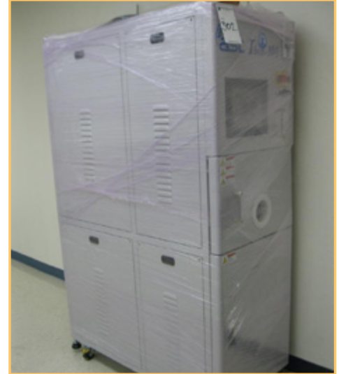
ADVANCED SYSTEM TECHNOLOGY TBN-100 BONDER, NEW