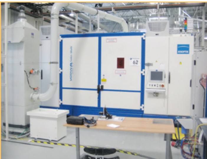
JENOPTIK VOTAN SOLAS MULTI AUTOMATED P1 - P4 LASER ABLATION, SCRIBE, AND EDGE MACHINE