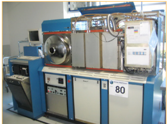
MATERIAL RESEARCH COMPANY 603 VACUUM COATER SPUTTER SYSTEM