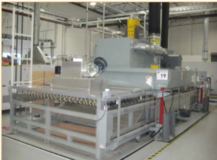
INFRARED HEATING TECHNOLOGIES, INC. (IHT) ITICBO1Z-110KVA-ASP-01 CDTE DRYER.