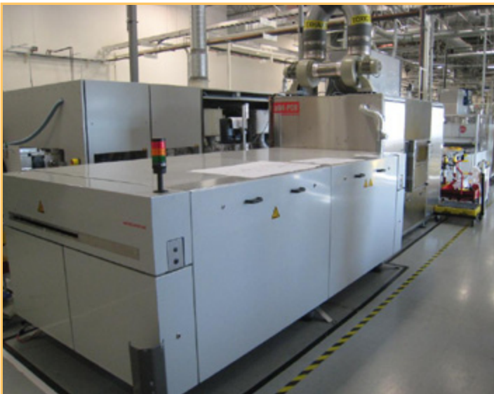
BTU INTERNATIONAL TFF-142-7-126N48GT BACK CONTACT BELT FURNACE