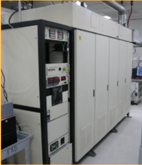
VEECO D180 VEECO D180 REACTOR