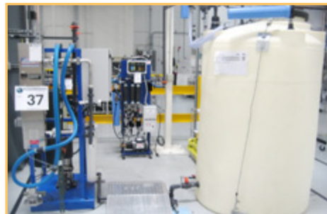
SIEMENS M21R004EA VANTAGE SERIES DI/RO SYSTEM