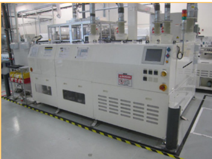
MANZ GCT-S 1100 CDCI2 LARGE PLATE WASHER