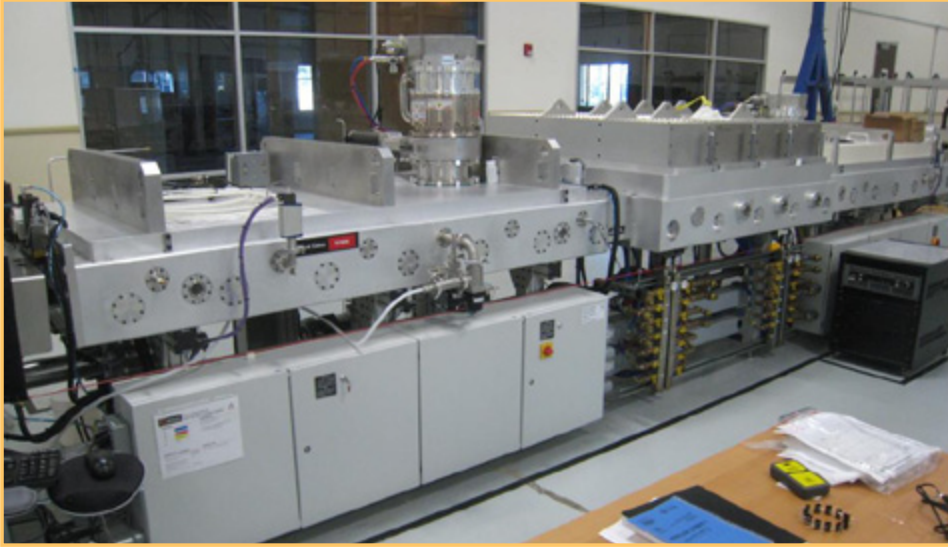
GENERAL PLASMA BACK CONTACT SPUTTER SPUTTERING SYSTEM