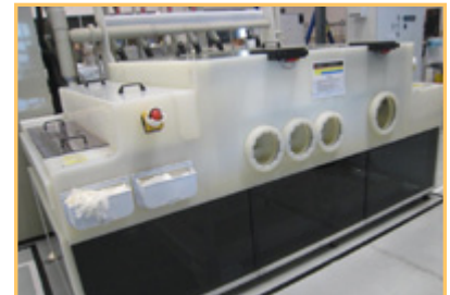
ALL4-PCB EDTA ETCH WET PV WET PROCESS STATION

BUYER'S PREMIUM: 15% cash buyers; 18% for credit card purchasers