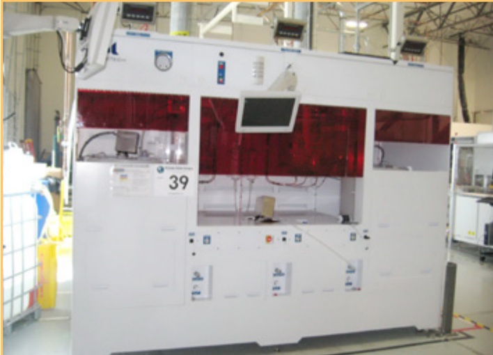
MICROTECH POLYPRO SINGLE STATION CHEM MIXING AND DISPENSING HOOD