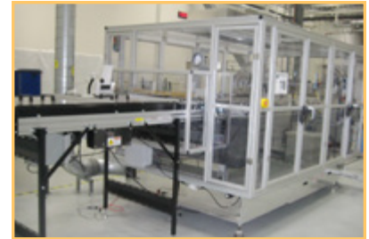
NTACT CDTE SLOT COATER, DIE COATER