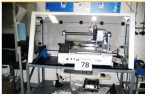
NIACT R-RAD EXTRUSION DEPOSITION SYSTEM / SLOT COATER