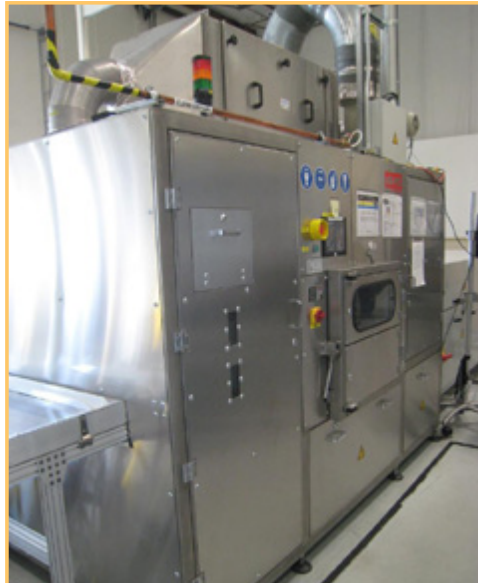
ALL4-PCB KU 455-CDCI CDCI2 SPRAY COATER