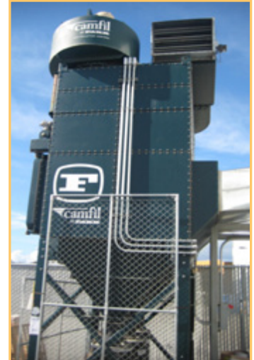
FARR CAMFIL GOLD SERIES DUST COLLECTION