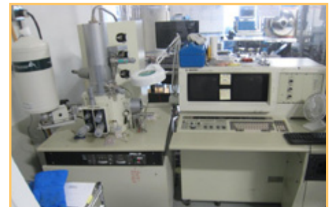
HITACHI S-4000 SCANNING ELECTRON MICROSCOPE