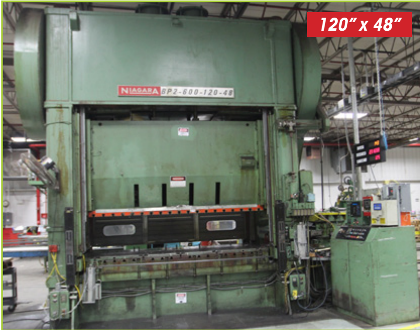
NIAGARA 600 TON SS PRESS