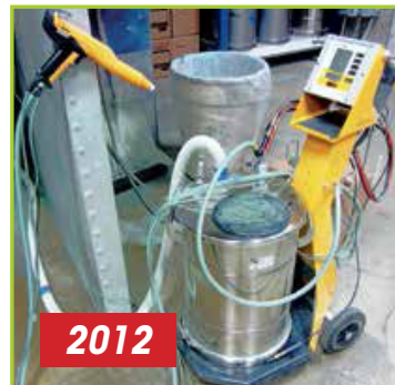
ITW GEMA POWDER COAT SYSTEM