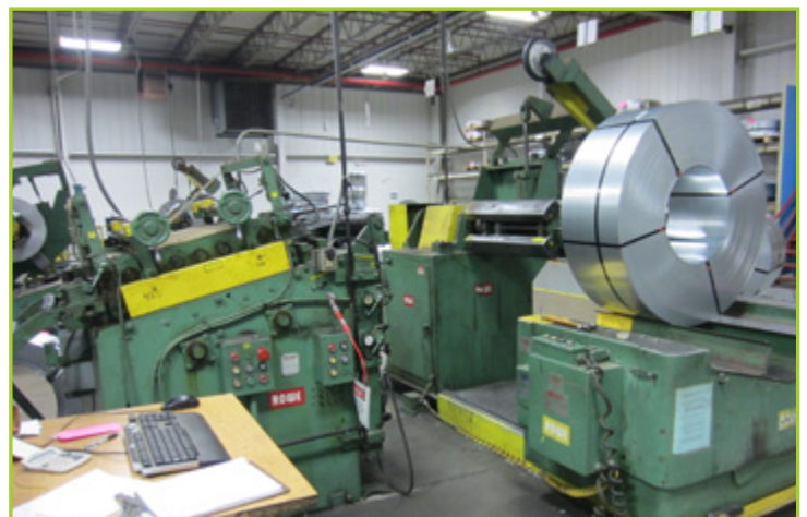
ROWE 30" X .150" X 10,000 LB SERVO COIL FEED SYSTEM

For additional information, Contact: Brandon Smith Tel: 973.265.4090 Email: bsmith@hgpauction.com