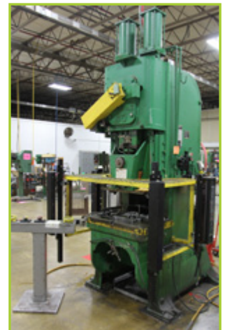
USI TORC-PAC 60 TON OBI PRESS

Sale Date: Wednesday, March 26 at 10:00 AM CST Location: 58155 240th Street, Mankato, Minnesota 56001 Inspection: Tuesday, March 25, 9:00 AM–4:00 PM CST