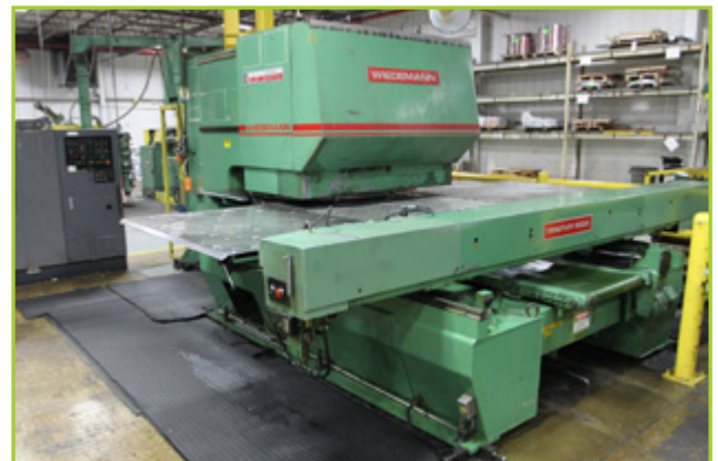
WIEDEMANN 45 TON TURRET PUNCH