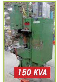
PEER SPOT WELDER