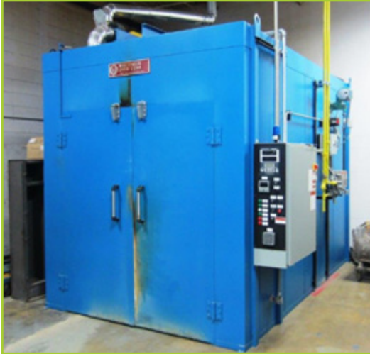
WISCONSIN BURN OFF OVEN