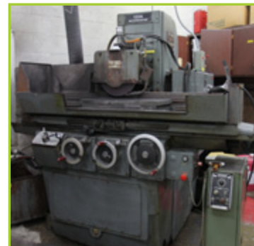
BROWN & SHARPE SURFACE GRINDER