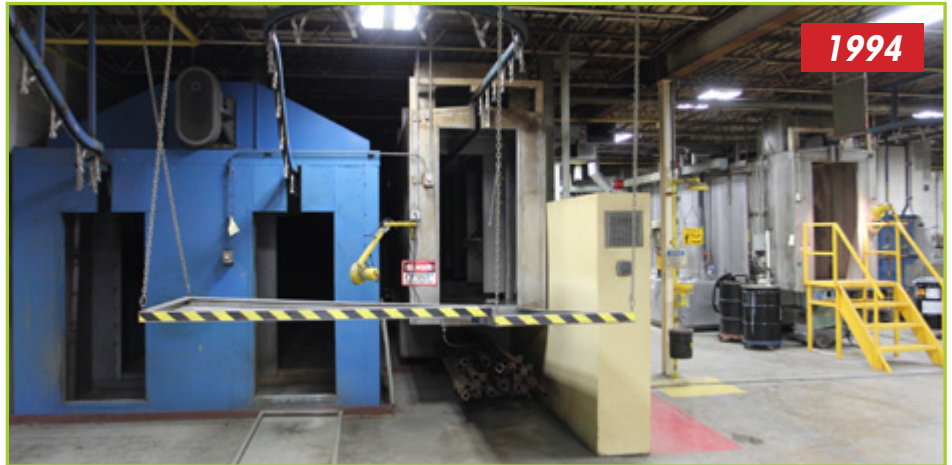
5-STAGE WASH AND DRY OFF OVEN