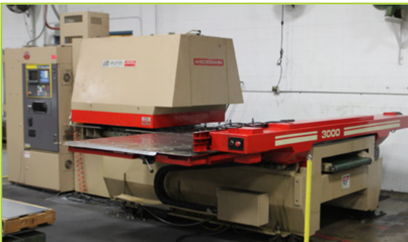
MURATA WIEDEMANN 33 TON TURRET PUNCH