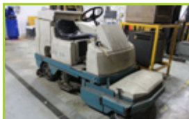
TENNANT FLOOR SCRUBBER