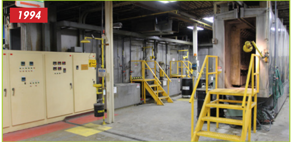
JAEGER & LIGHT STAINLESS STEEL 5-STAGE WASH

JBI E-COAT LINE , w/Stainless Steel E-Coat Dip Tank; 2009 CONTROLLED POWER CO. RECTIFIER ; STAINLESS STEEL PUMPS; 40' RINSE TUNNEL ; MIXING TANK; FILTERS; GRACO PNEUMATIC PUMP 1994 JAEGER & LIGHT STAINLESS STEEL 5-STAGE WASHER SYSTEM , w/72" x 32" Opening, "U" Shape Foot Print 1994 JAEGER & LIGHT DRY OFF OVEN , w/Natural Gas- Fired, 1.5 Mil BTU/Hour, Approx. 100' L, 72" x 30" Opening 2003 BDC Inc BAKE OVEN , w/Natural Gas-Fired, 1.5 Mil BTU/ Hour, 475 Deg. F; 32" x 56" Opening, Amniotic Set-Up E-Coat BINKS PAINT LINE , w/Approx. 80' L, 60" x 48" opening NORDSON POWDER COAT SMALL BATCH OPEN-FACE PAINT BOOTH , w/Filters and Lights 2012 ITW GEMA OPTIFLEX 2 POWDER COAT SYSTEM , w/ Gun, (7) Quick Change Canisters 2012 WISCONSIN EWN-612-7G/EP BURN OFF OVEN , S/N 02894A1012, w/Natural Gas-Fired, 500 Deg. F