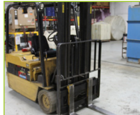
CATERPILLAR 4,500 LB FORKLIFT