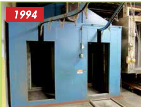
JAEGER & LIGHT DRY OFF OVEN

(3) PEER SPOT WELDER , w/Interlock Industries Microprocessor Control, Up to 150 KVA; LINCOLN WIREMATIC 255 MIG WELDER ; LINCOLN IDEALARC SP-100 WELDER , AIRCO HELI WELDER TIG WELDER ; THERMAL DYNAMICS CUTMASTER 38 PLASMA CUTTER ; ALSO : Welding Curtains; Welding Tables; Fume Exhausts; Down Draft Tables; Welding Wire and Rod; Chipping Hammers; Welding Supplies; Tips; Etc.