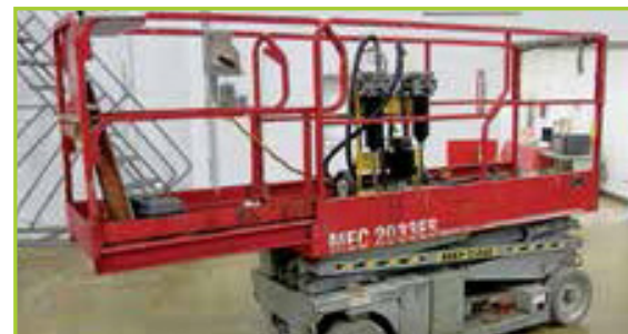
MEC AERIAL SCISSOR LIFT

CATERPILAR T500 4,500 LB ELECTRIC FORKLIFT, w/Triple Mast (2) RAYMOND 20 4,000 LB ELECTRIC REACH TRUCKS