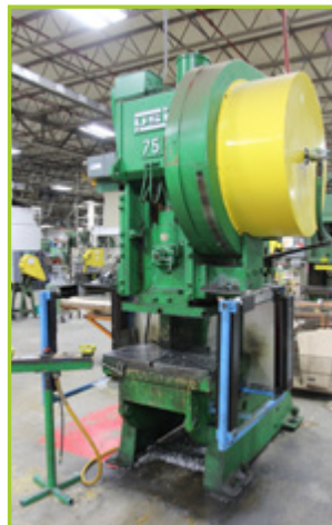
USI 75 TON OPI PRESS

WARCO 100 TON OBI PRESS , S/N NA, w/30" x 38" Bed w/Bolster, 22" x 24" Ram; FEDERAL 12-58 80 TON OBI PRESS , S/N 7-573; US INDUSTRIES 75 TON OBI PRESS , S/N 54-2089, w/25" x 36" Bed w/Bolster, 17" x 29" Ram; USI TORC-PAC 60T62019 60 TON OBI PRESS , S/N 57-8556, w/22" x 33" Bed w/Bolster, 12" x 24" Ram; NIAGARA AA4 60 TON OBI PRESS , S/N 34638, w/21" x 32" Bed w/Bolster, 6" Stroke, 11.5" SH, 3" Adjustment; SUMMIT 45 TON OBI PRESS , S/N NA; (2) L & J 27 TON OBI PRESSES , S/N 35412, NA, w/13" x 21.5" Bed w/ Bolster, 2.5" Stroke, 9" Shut Height, 2" Adjustment; ROCKFORD 30 TON OBI PRESS ; ROUSSELLE 3F 22 TON OBI PRESS , S/N 24; BLISS 20 TON OBI PRESS , S/N NA, w/4" Stroke, 2.25" Slide Adjustment, 8.25" Shut Height DURANT 10-251 UNCOILER , S/N 14956RP; (2) DURANT 40-251 UNCOILERS ; PRE 40-251 UNCOILER ; CWP 2RD