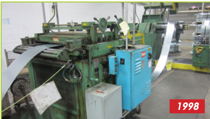
ROWE CUT-TO-LENGTH LINE – UNCOILER VIEW

(2) CINCINNATI 90FMIIX8 90 TON x 10' CNC PRESS BRAKES , S/N 48057, 47250, w/Cincinnati Form Master II Control, 103" Between Housings, 42" Backgauge, New as 1995 (2) STANDARD BM150 150 TON HYDRAULIC PRESSES , S/N 190115, 891185, w/30" x 50" Bed, 30" x 46" Ram, 16" Windows, New as 1991