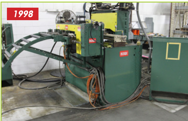
ROWE CUT-TO-LENGTH LINE – SHEAR VIEW

NOTE: OVER 3,000 PIECES OF TURRET TOOLING AVAILABLE