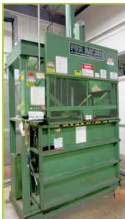
FOX CARDBOARD BALERGRINDER

Sale Date: Wednesday, March 26 10:00 AM CST Inspection: Tuesday, March 25 9:00 AM - 4:00 PM CST