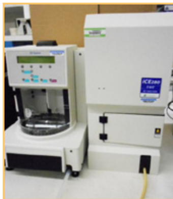
CONVERGENT BIOSCIENCES ICE280-FAST IEF(CIEF) ANALYZER