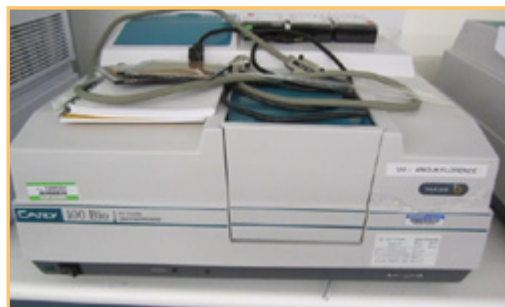
VARIAN CARY 100 BIO UV/VISIBLE SPECTROPHOTOMETER