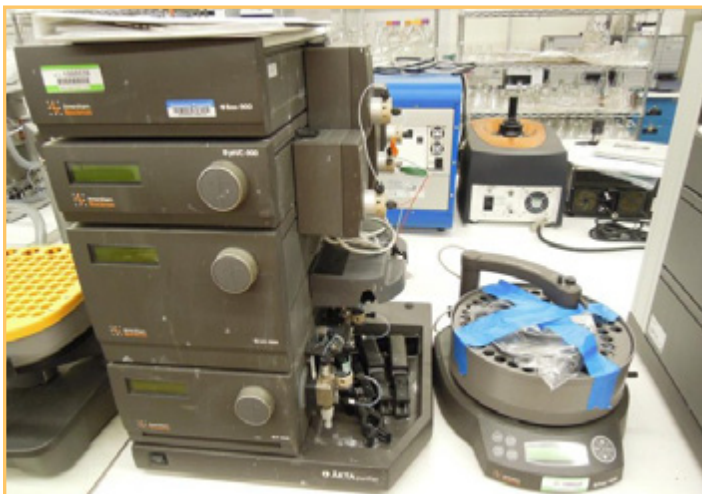
AMERSHAM BIOSCIENCES AKTA-PURIFIER