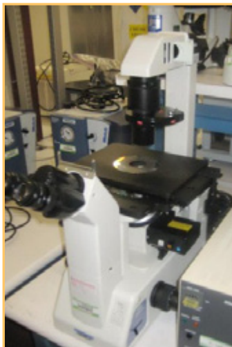
NIKON ECLIPSE TE200 INVERTED MICROSCOPE