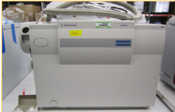
AGILENT G1956B MASS SPECTROMETER LC/MSD SL

1 – Amersham Biosciences AKTA-Purifier FPLC Purification System 5 – GE-Healthcare Biosciences AKTA-Purifier FPLC Purification System