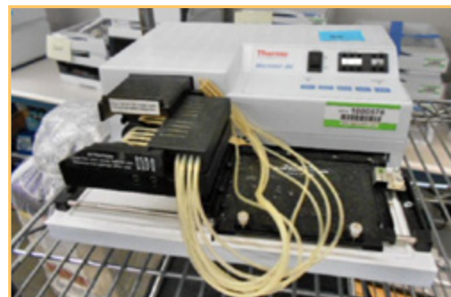
THERMO SCIENTIFIC MULTIDROP-384