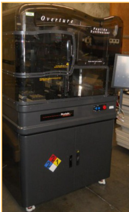
PROTEIN TECH 96-CHANNEL PEPTIDE SYNTHESIZER