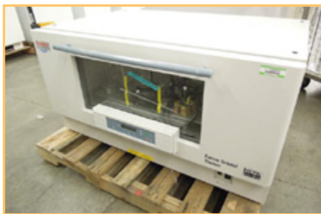
THERMO SCIENTIFIC 440 ORBITAL SHAKER