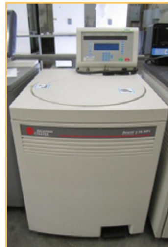
BECKMAN COULTER AVANTI J-26 XPI