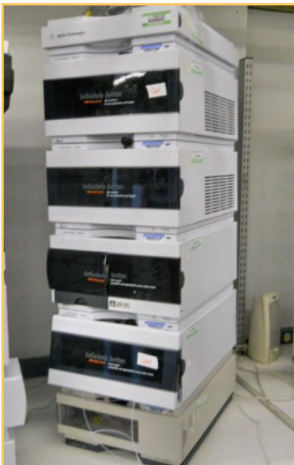
AGILENT HPLC 1100-SERIES