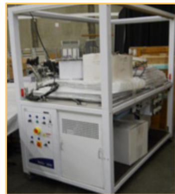
VELOCITY11 BIOCEL-1200(17718) ROBOTIC MICROPLATE-PROCESSING PLATFORM