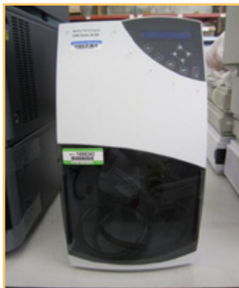
PERKIN ELMER ENVISION/2104-0010