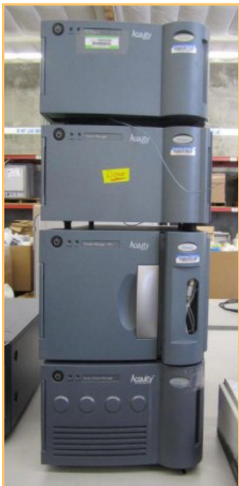
ALPHA INNOTECH FLUOCHEM SP IMAGING SYSTEM

1 – Life Technologies/Invitrogen iBlot Blotting System