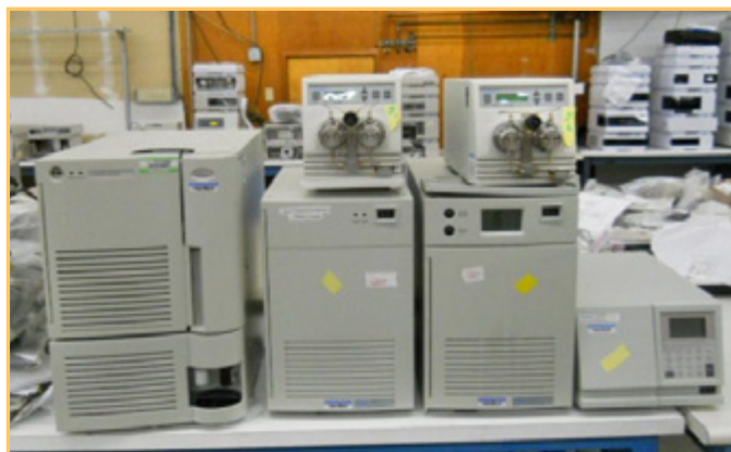
WATERS MICROMASS UPLC-MS SYSTEM WITH UPLC MODULES