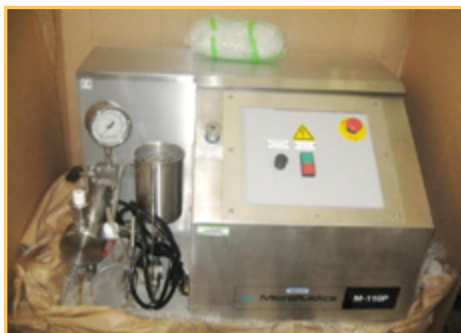
MICROFLUIDICS M1 10P MICROFLUIDIZER PROCESSOR