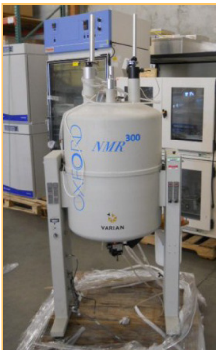
VARIAN / OXFORD NMR-300 300MHZ SPECTROMETER