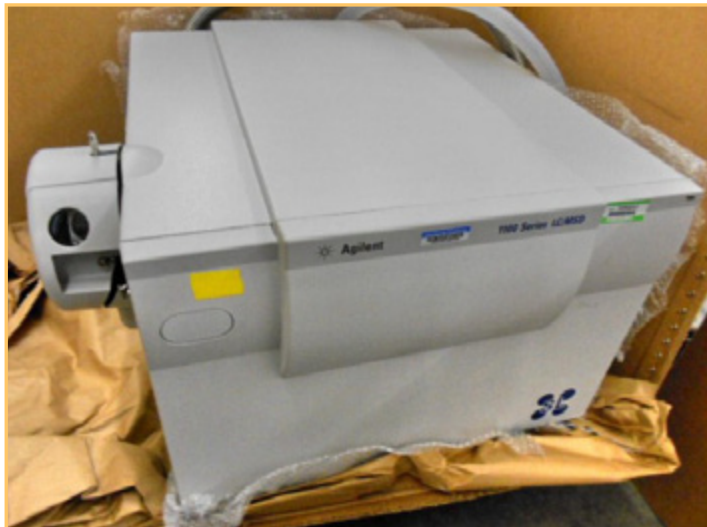
STRATAGENE MX3005P PCR SYSTEM