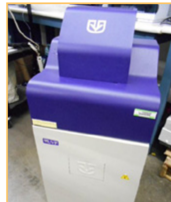
BIOSPECTRUM AC IMAGING SYSTEM