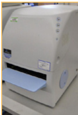
PERKIN ELMER ENVISION/2104-0010