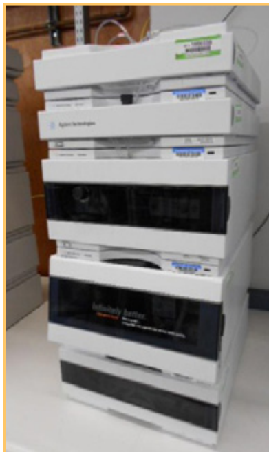
AGILENT HPLC 1260-SERIES