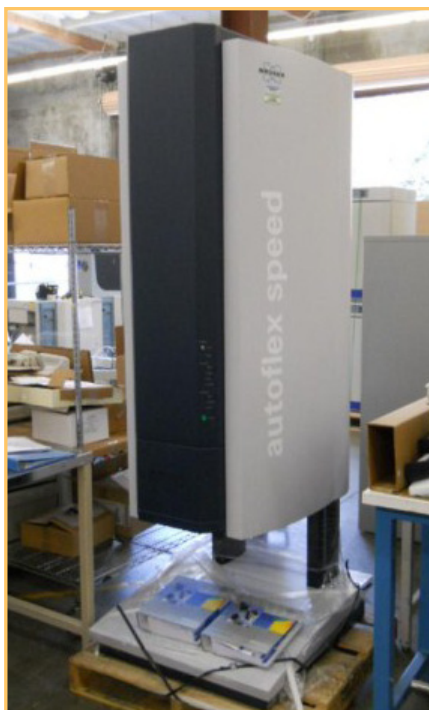
BRUKER DALTONICS LRF MALDI/TOF MASS SPECTROMETER