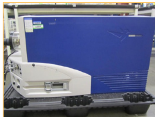
MICROMASS UK LIMITED Q-TOF MASS SPECTROMETER