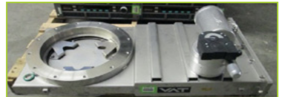
VAT A-960580 PNEUMATIC VACUUM GATE VALVE