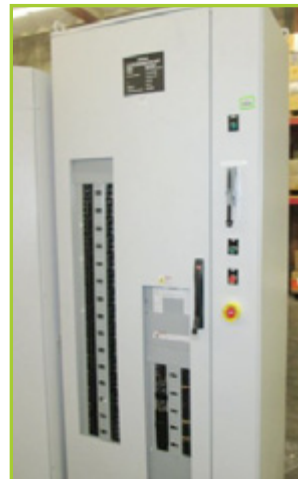
INTEVAC / SEIMANS POWER DISTRIBUTION UNIT