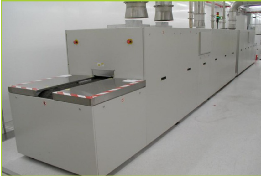
BIOPHARM ENGINEERED SYSTEMS/MILLIPORE 40 SQ-M-MF FILTER SKID SYSTEM