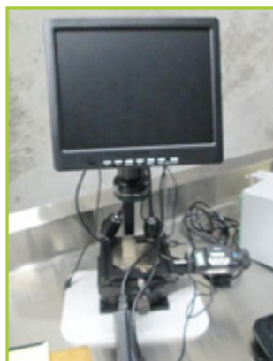
SUNLITE LASER INSPECTION MICROSCOPE