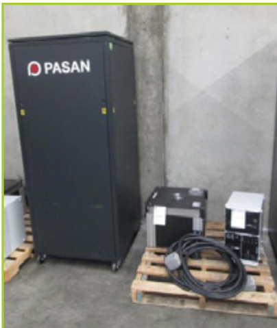
PASAN MEASUREMENT SYSTEMS SUN SIM 3B SUN SIMULATION UNIT

1 – Engotron SV31-31001 Data Cart, With / Veiwsonic # VG930m Flat Panel Monitor, With Microsoft Keyboard & Mouse, & Keyence Scanner