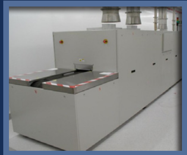
Scan this QR Code with your smartphone for More Information.

3D Printer, Turbo Pumps, Dry Pumps, Power Supplies, Gas Analyzers, Metrology Equipment, Sorting System and Mucn More!