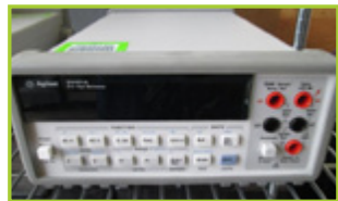
AGILENT 34401A 6 1/2" DIGIT MULTIMETER