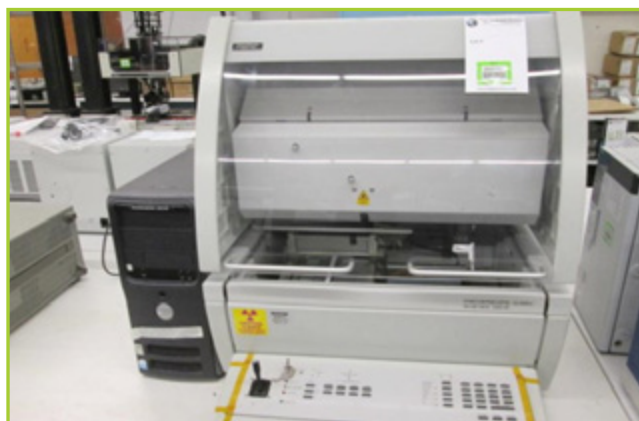
FISCHER XDAL-237 TYPE: XMDVM-17.1-W, FISCHERSCOPE X-RAY SYSTEM