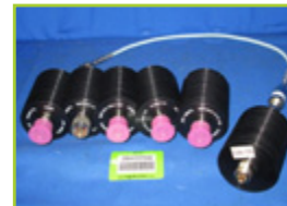
JFW FIXED ATTENUATORS