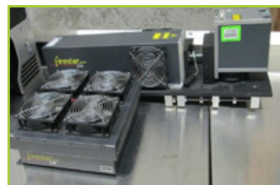
CO2 AIR COOLED LASER SYSTEM

To view a complete asset list, visit our website @ www.hgpauction.com