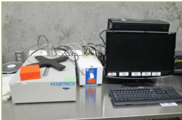
FILMETRICS F50 / 205-0051 THIN FILM MAPPING SYSTEM

1 – Filmetrics F50 / 205-0051 Thin Film Mapping System, Consisting of ( 1 ) Film Mapping System, ( 1 ) Hamamatsu # L7893 Series Fiber Light, ( 1 ) Dell Precision 390 Controller Computer & Samsung 22" Flat Panel Monitor