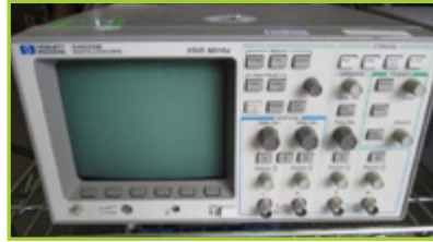
HEWLETT PACKARD 54602B OSCILLOSCOPE