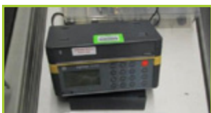
SYLVAC D100S INDICATING UNIT