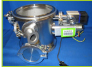
FELDMEIERS 2010 600 LITER STAINLES