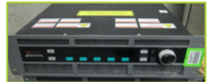
(20+) ADVANCED ENERGY PINNACLE POWER SUPPLY