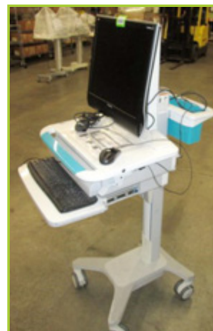
ENGOTRON SV31-31001 DATA CART