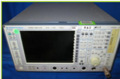
ROHDE & SCHWARZ FSIQ 7 SIGNAL ANALYZER