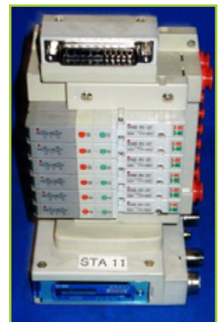
SMC EX261 PROFIBUS DP ( NPN )