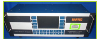
BARTEC 5673-10 IN LINE MOISTURE ANALYZER