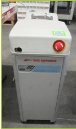
EDWARDS IGX6/100L 200V DRY PUMP