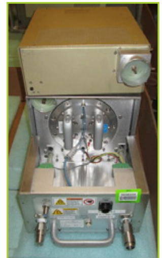
HEATER ASSEMBLY & CONTROL UNIT