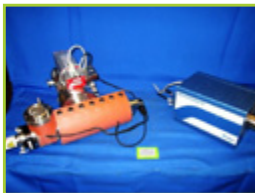
(5) RESIDUAL GAS ANALYZER UNIT