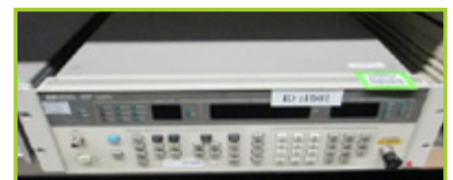
HP 8656B SIGNAL GENERATOR