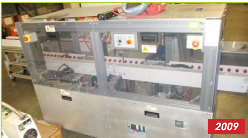
ADEPT LT1G30BOP101 ( 2 ) ADEPT # LT1 G30BOP101 ROBOTS STATION