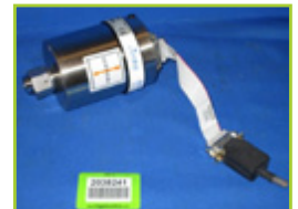
ABEC 2005 200L VESSEL

HGP will be hosting a one day open to the public inspection on 2/25/14 from 9:00am – 4:00pm PST