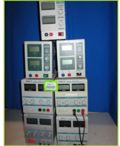
ASSORTED POWER SUPPLY'S