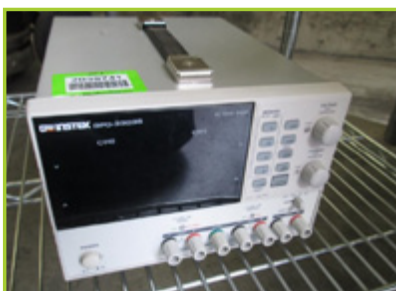
GW INETEK GPD-3303S DC POWER SUPPLY