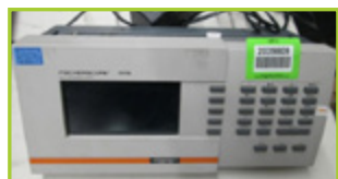
(2) FISHER MMS BETASCOPE