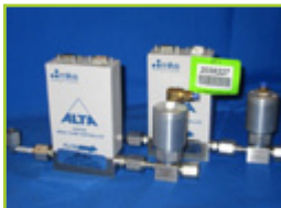
MASS FLOW CONTROLLERS