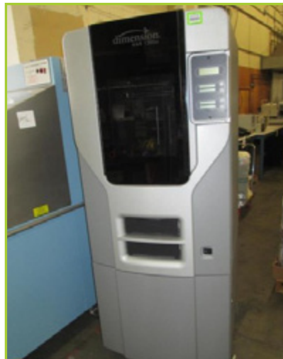
PALL CENTRASETTE C-5AT FILTER SKID