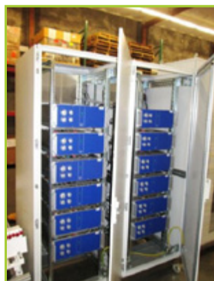
ELMASONIC MF4000 ( 12 ) ULTRASONIC GENERATORS