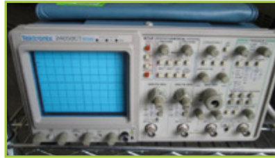
TEKTRONIX 2465 BCT OSCILLOSCOPE