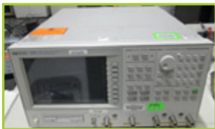
HP 4396B NETWORK/SPECTRUM ANALYZER

HGP will be hosting a one day open to the public inspection on 2/25/14 from 9:00am – 4:00pm PST