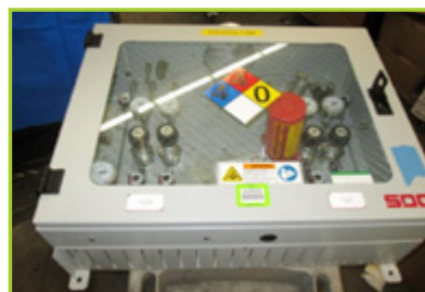
3 HP BUFFER PREP PUMP W/CONTROL PANEL

1 – Fischer XDAL-237 Type: XMDVM-17.1-W, Fischerscope X-Ray System, With / Fisher Win FTM Light+Super PDM X530, 0030 Flash Drive, 115volts, 120watts, 5060hz, With / Dell Dimension E310 Tower Computer, With / Windows XP Media Edition 2055