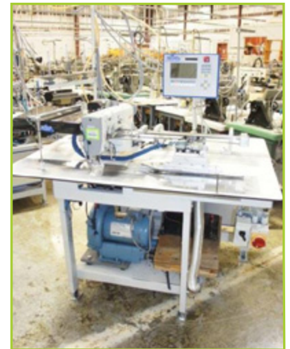
BEISLER 1912-4 PFAFF HEAD MODEL 901-1083-300/S016