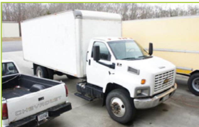
CHEVROLET C7500 CATERPILLAR C-7 DIESEL ENGINE . 183,700+ MILES . 6 SPEED

6 – SICO Inc TC Lunch Room Tables with Seats, Folding For Storage