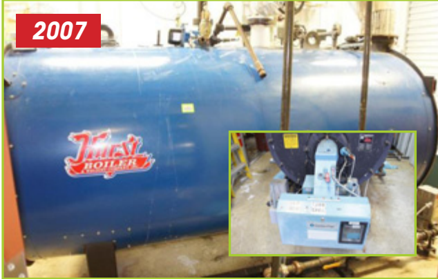
2007 HURST NATURAL GAS FIRED STEAM BOILER COMPLETE SYSTEM

1 – Hurst Boiler; Max Working Pressure 150, Heating Surface 250 Sq Ft. Steam Per Hour 1725. Zink Nat Gas Burner Mdl S8-g-07. Dual Pump Feed Miser Water Circulation System. (2) Chemical Feed Pumps And Tanks. Marlo Soft Water Tank. Barlow Water Softener. Year of Manuf. 2007