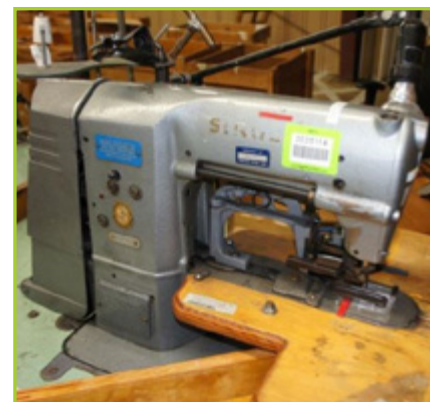
SINGER 269 X 56 TACKER, COVER STITCH