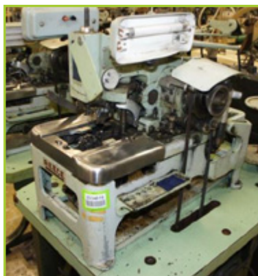
REECE 101 BUTTON HOLE EYELET END 5/8