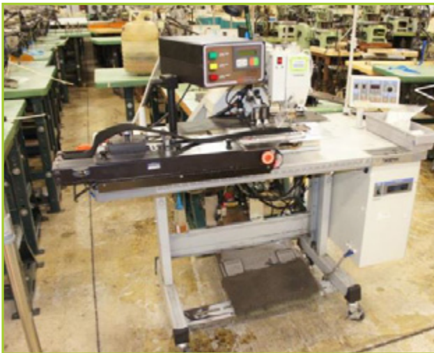
BROTHERS BAS 311A-111 PROGRAMMABLE TACKER EQUIPPED FOR VELCRO