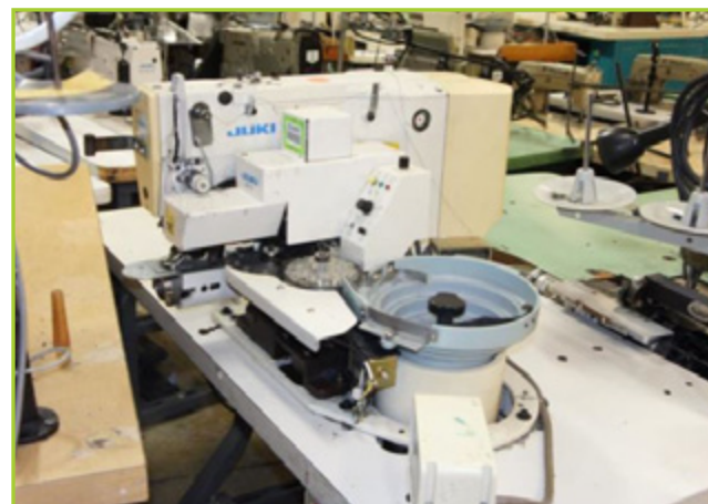
JUKI LK-1903 CLASS 312 BUTTON SEWER W/LOADER

BUYER'S PREMIUM: 16% cash buyers; 18% for credit card purchasers (Refer to Term 7 in the Auction Terms and Conditions for details)