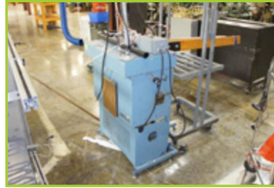
TRIMCO MODULAR OVERHEAD TRIMMER