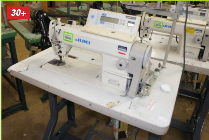
JUKI DDL-5550-6 WB AUTO POSITIONER, TRIMMER & FOOT LIFT