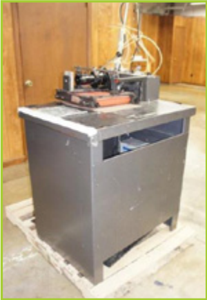
PSR 1200 FUSING MACHINE