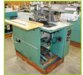
COMPO EAGLE 1005F POCKET WELT