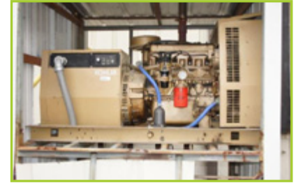
KOHLER 22.5RZ62 STANDBY GENERATOR