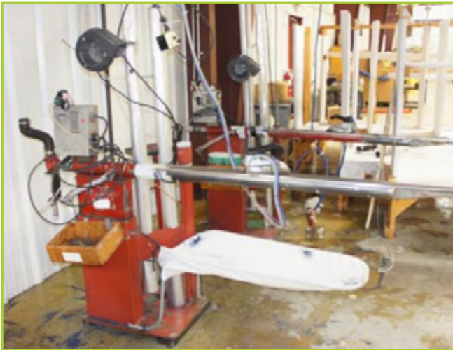
VEIT SEAM BUST STATION WITH STEAM IRON