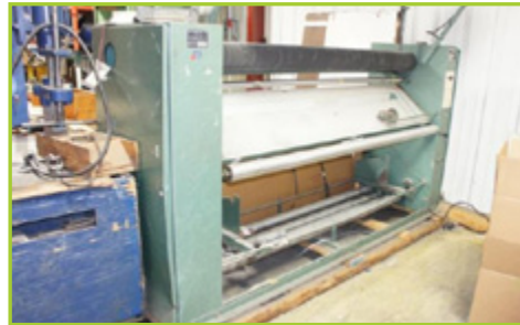
JOSEPH PERNICK I-800 FABRIC INSPECTION STATION