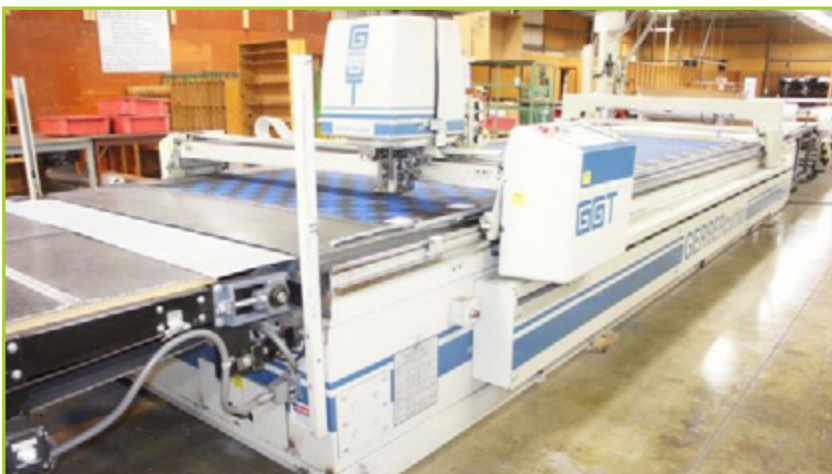
GERBER C100 SYSTEM 91 HIGH FLY FABRIC CUTTER & TAKE OFF TABLE