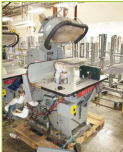
NEW YORK SEUT-11-1 TOP PRESS