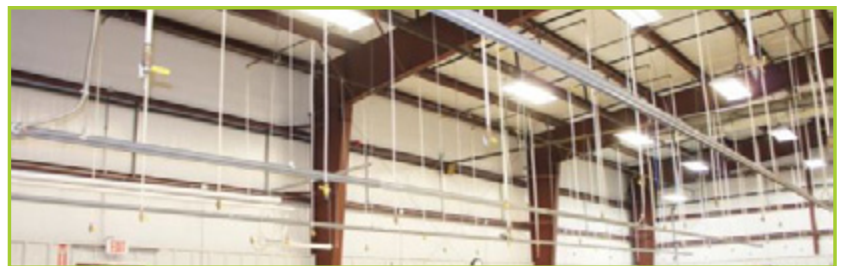
GE CAT # DLTGB422 FEED RAIL; 4 WIRE 50 AMP 240 VOLT

1 – Chevrolet C7500 Caterpillar C-7 Diesel Engine. 183,700+ Miles. 6 Speed Transmission. Cruise Control. Supreme 21' Aluminum Frame With Fiberglass Skin Box. New Breaks 2013. Seals 2013. 22.5 X 8.25bc Rims. 11r22.5 Tires. Year of Manuf. 2003