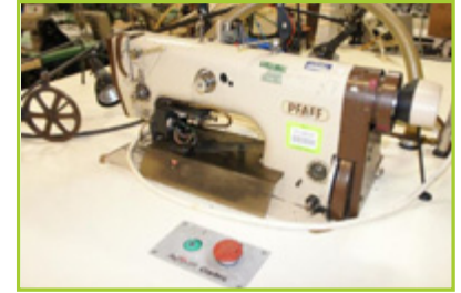
HOWDEN P123LG280/17 REGENERATION COMPRESSOR