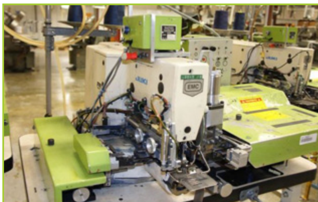
JUKI LK-1850 EASTLEX BL FEEDER MDL 7400 AUTO BELT LOOP TACKER