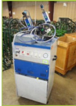
VEIT 2305 TYPE 123.053.001 PORTABLE STEAM CABINET