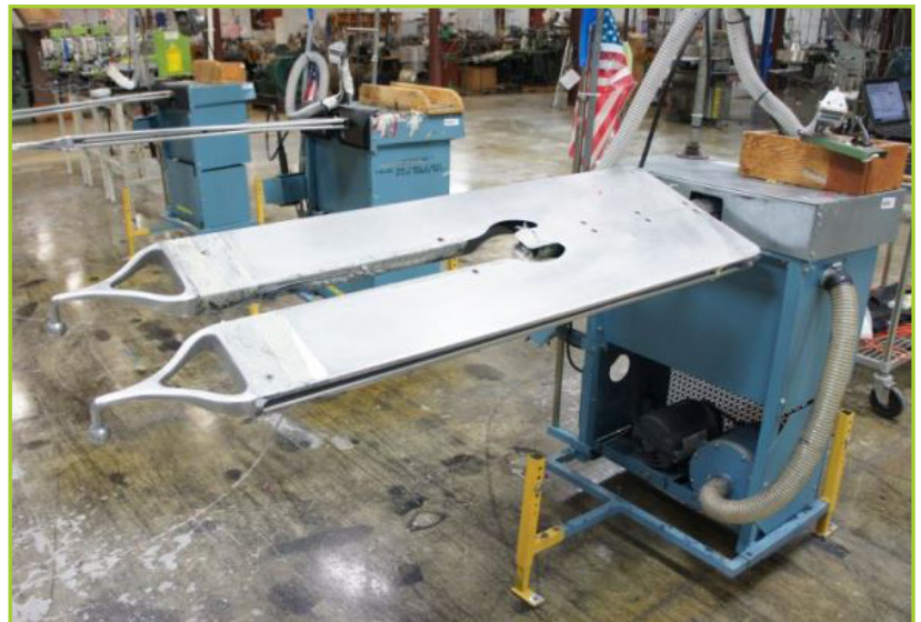
AMERSHAM 2002 UF/DF BIO PROCESS SYSTEM

Over 300 Industrial Sewing Machines From The Brands: Juki • Brother • Union Special • Pfaff Mitsubishi • Reece • Compo Eagle