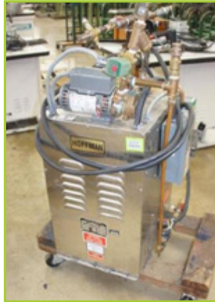
HOFFMAN NEW YORKER RHPG-15 BOILER