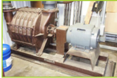
LAMSON 406-6-0-AD VACUUM