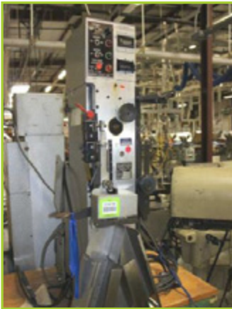
CUTTER 4902 BELT LOOP CUTTER WITH EASTLEX CUTTER