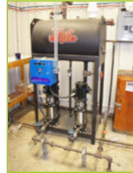
UNION SPECIAL 53100