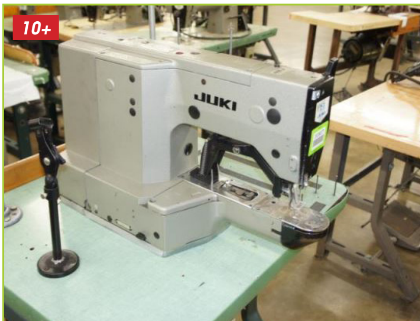
JUKI LK 1854 SUB CLASS 4 TACKER; 21 STITCH VELCRO CONVERSION