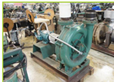
3 HP BUFFER PREP PUMP W/CONTROL PANEL