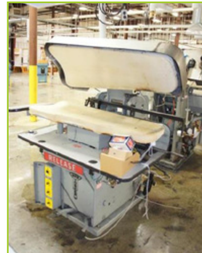
NEW YORK SEUL 4 LEG PRESS