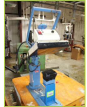
GEO KNIGHT 178S HOT PAD PRESS