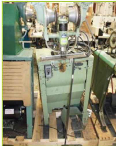
DOT MACHINERY M245 SNAP INSTALLING MACHINE