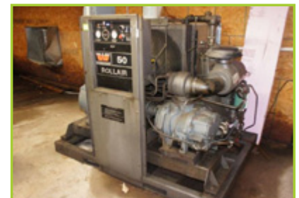
WORTHINGTON ROLLAIR 50 AIR COMPRESSOR