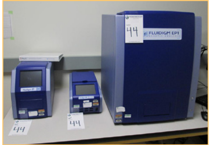
FLUIDIGM EP1 GENETICS ANALYSIS SYSTEM