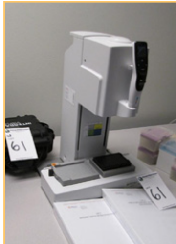
INTEGRA VIAFLO 96 ELECTRONIC PIPPETTOR