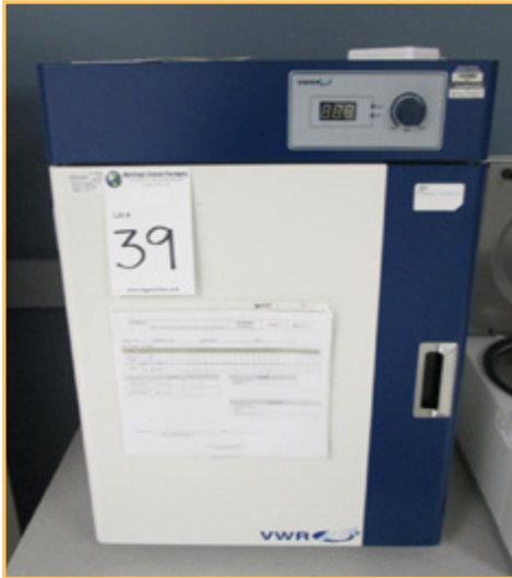
VWR SCIENTIFIC GRAVITY CONVECTION INCUBATOR