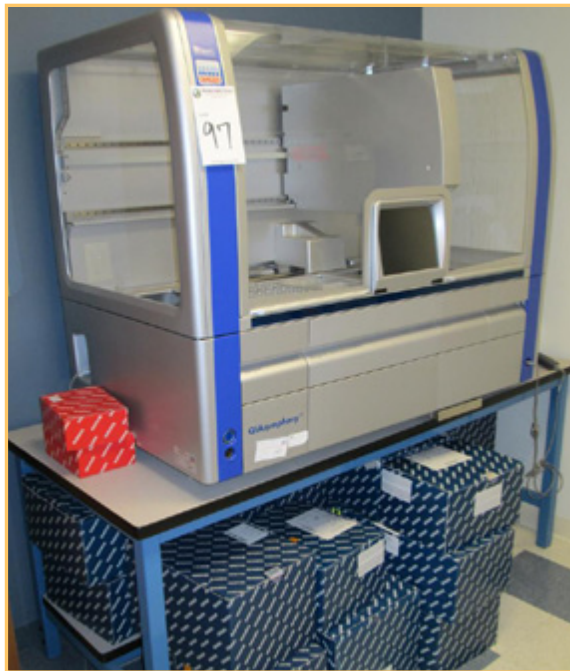
QIAGEN QIASYMPHONY QIAGEN QIASYMPHONY SP FULL AUTOMATION COMPLETE WORKFLOW STATION