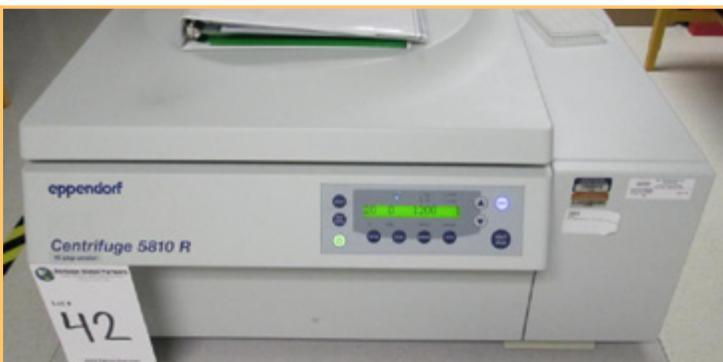
EPPENDORF 5811 CENTRIFUGE