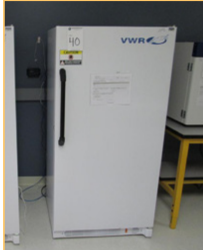
2 LOTS: (1) REFRIGERATOR (SCBMF-1720) AND (1) FREEZER (SCGP-1804)