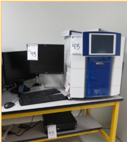
APPLIED BIOSYSTEMS VIIA7 REAL TIME PCR SYSTEM