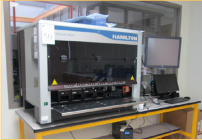
HAMILTON MICROLAB STARLET LIQUID HANDLER