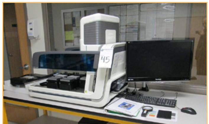
HAMILTON NIMBUS MICROLAB INDEPENDENT CHANNEL LIQUID HANDLING MACHINE