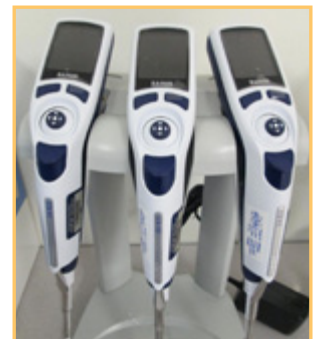
SUN/ ORACLE EXADATA CABINET