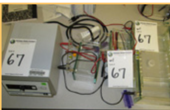
VWR SCIENTIFIC 300 ACCUPOWER