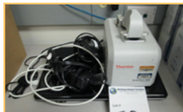
THERMO SCIENTIFIC NANO DROP 2000