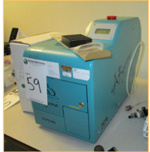
AB GENE ALPS 300 AUTOMATED LABORATORY PLATE SEALER