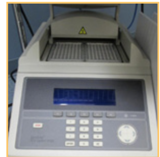
APPLIED BIOSYSTEMS PCR SYSTEM 9700