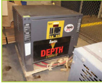
EXIDE GOLD D3G-18-680 FORKLIFT BATTERY CHARGER