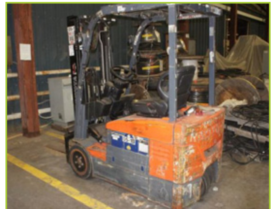
1,500 KG 3 WHEEL ELECTRIC FORKLIFT