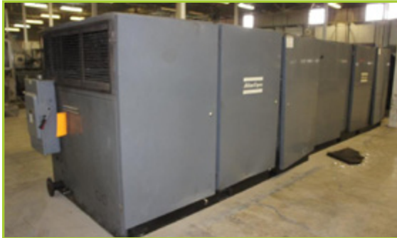
150 HP SECONDARY ROTARY SCREW AIR COMPRESSOR

LARGE SURPLUS OF VALVES, PRESSURE BLOWERS, PUMPS (including ultra-hygienic application bi lobe pumps), FEEDERS, FILLERS, LIFTS, SPIRAL CONVEYORS AND INCLINE CONVEYORS, STAINLESS STEEL SINKS, WORKSTATIONS, CROSSOVERS AND LADDERS, TRANSFER AND STORAGE TANKS