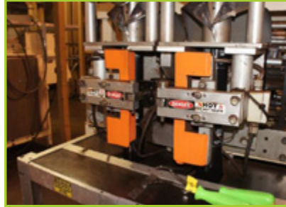
LABEL-AIRE 3115-1500 4/12" LH LABELER