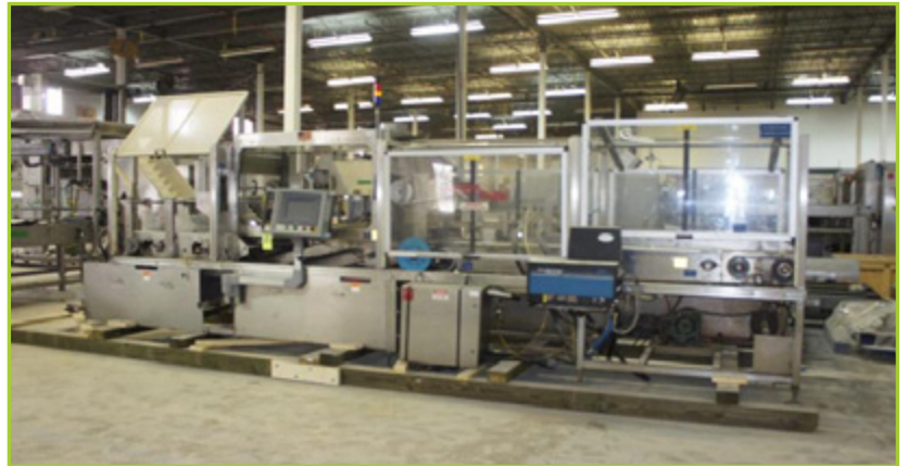
COMPLETE LIQUID JAR FILLING LINE