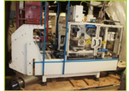
LES FABRICATION MAURICE RIOPEL PAIL WASHER