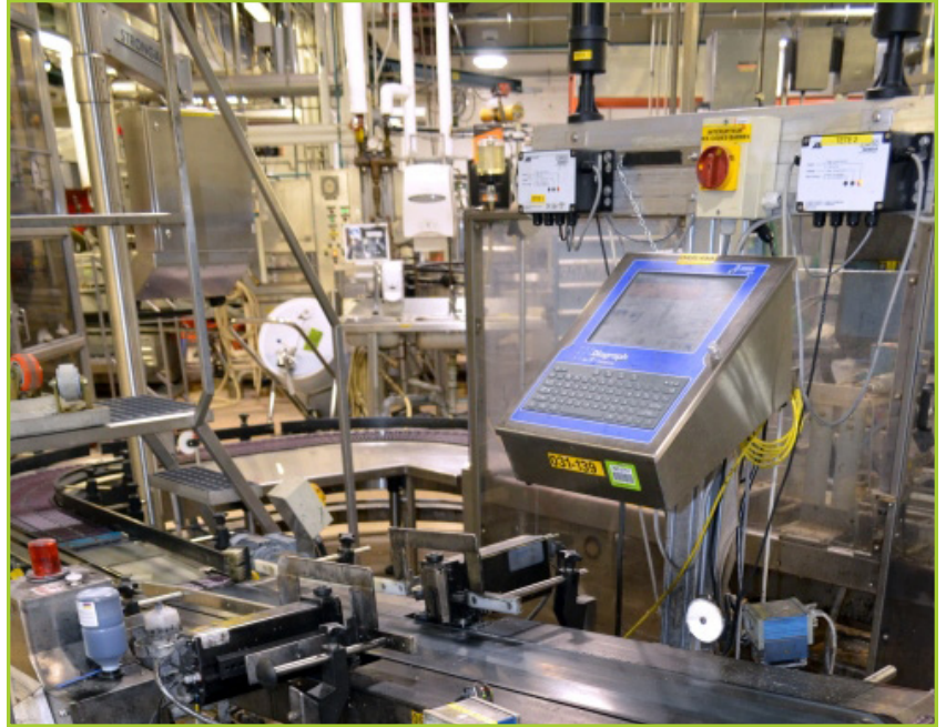
DIAGRAPH IJ3000XLS DUAL HEAD INKJET CODER

1995 I&H Engineering Pasteurizing Cooling Tunnel, Stainless Steel. Approximate 120" wide x 78' long belt. (3) Heating sections, (3) cooling sections. Includes a 6" wide x 11' long infeed, and discharge belts, (6) holding tanks with pumps, top mounted blower with air knife, and a control panel