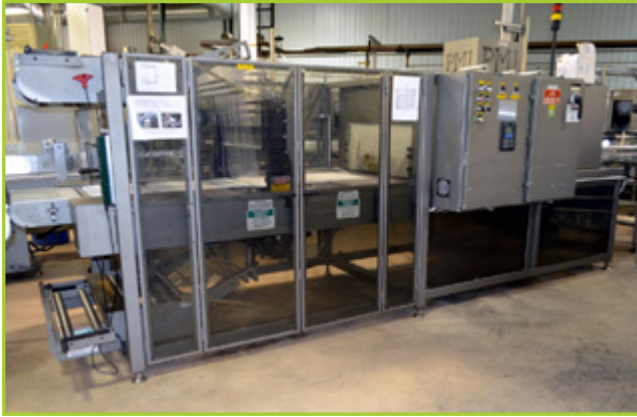
PMI CSI-30 SHRINK WRAPPER WITH TUNNEL