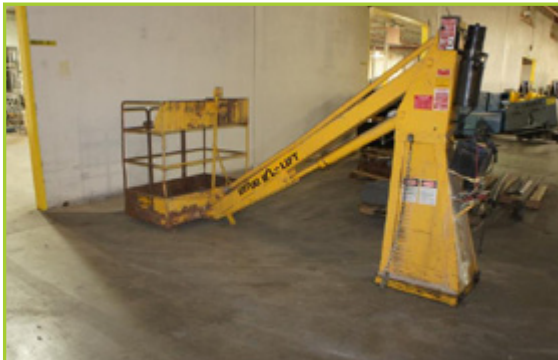
BENJU CORP LTL-LIFT 3000 FORKLIFT MOUNT MAN WORK PLATFORM

ALSO – FORKLIFT HOPPERS AND OTHER FORKLIFT ATTACHMENTS, TRANSFORMERS, FANS, CONVEYORS, MOTORS, PARTS, INVENTORY.