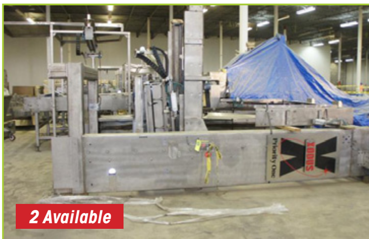
PRIORITY ONE XODUS DEPALLETERIZER; 57" X 44" PALLET

Urschel Slicer, Strip Cut, Dicer, Model RA-A, Stainless Steel. Consists of: feed hopper, rotating impeller, slicing knives, revolving drum, knife spindle, and discharge chute