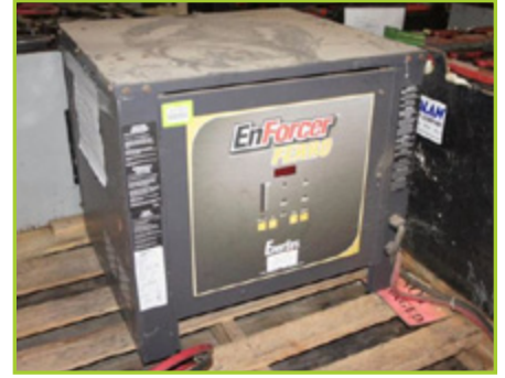
ENERSYSTEM EF3-18-1050 FORKLIFT BATTERY CHARGER