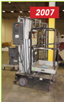
2007 JIB CRANE, 1/4 TON