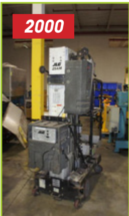
JLG 25 AM ELECTRIC MAN LIFT