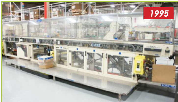
1995 KRONES RONDELLA WRAPAROUND LABELER. APPROXIMATE 24,000 LABELS PER HOUR