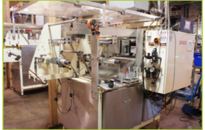
PMI CSI-30 SHRINK WRAPPER WITH TUNNEL