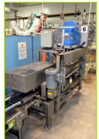
WEPACKIT MPTS 300 CASE SEALER

Sale Date: April 28, 2014 (9:00 am - 4:00 pm EDT) Starting: April 29, 2014 - 7:00 am EDT Ending: May 1, 2014 - 10:00 am EDT