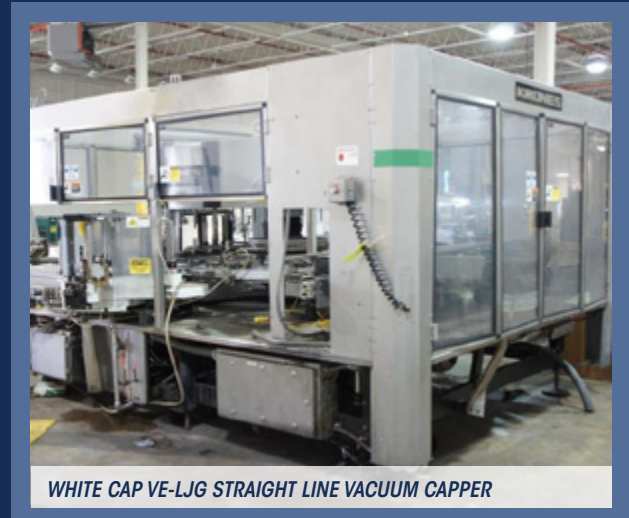
WHITE CAP VE-LJG STRAIGHT LINE VACUUM CAPPER

Tray Packers • Wraparound Glue Labeler • Rotary Labeling Machine Heat Shrink Tunnel & Turner • Depalletizers • Packaging Machine Bottle Rinser • Feeders • Bagging Machine & Fillers • Air Compressors Jacketed Kettle • Portable Pump System • And Much More