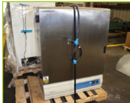
LINDBERG/BLUE M MO1450SA-1 MECHANICAL OVEN