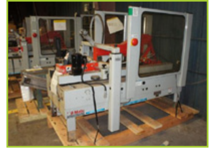
LABEL-AIRE 3115-1500 4/12" LH LABELER