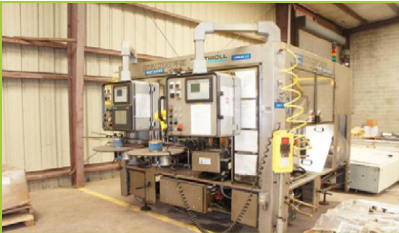
COMPLETE LIQUID JAR FILLING LINE