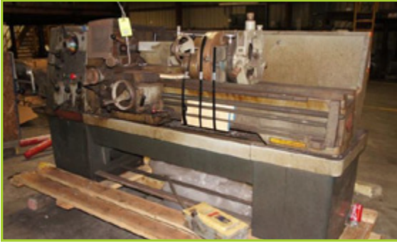
CLAUSING COLCHESTER 6 15" X 54" CC ENGINE LATHE