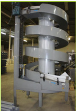
RYSON SPIRAL CONVEYOR

This sale includes surplus processing and packaging assets from the JMS Memphis, TN facility in addition to the assets from Folgers in New Orleans. Surplus assets from other locations may be added as well.