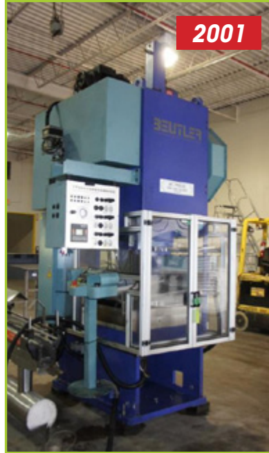
2001 STORCAN BOTTLE INVERTER AIR CLEANER