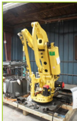
COMPLETE FORM FILL SEAL LINE

2005 Loma Systems IQ2 Pipeline Metal Detector. Aperture size 90 x 90, frequency 209 khz. Sensitivity Ferrous 2.0mm, Non-Ferrous 2.5mm, ST/ST 3.0mm Loma IQ3 Metal Detector. Aperture size 250 x 75