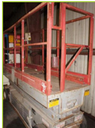
MAYVILLE ENGINEERING 2034 HT AERIAL WORK PLATFORM