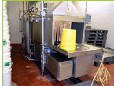
LES FABRICATION MAURICE RIOPEL PAIL WASHER