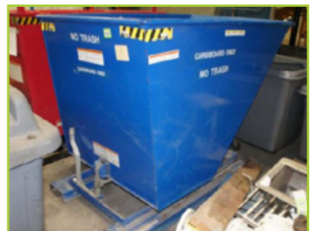
DAYTON/VISTEL 5PKG9 6,000# SELF DUMPING STEEL