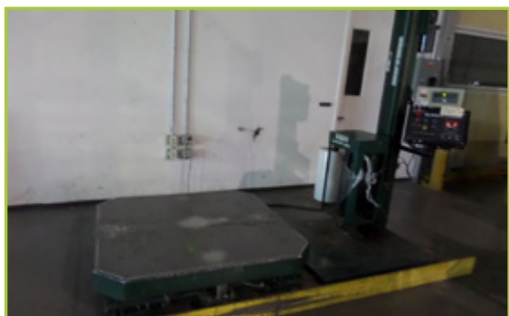
INFAPAK MDL: WRAP-N-WEIGH PALLET WRAPPER AND SCALE