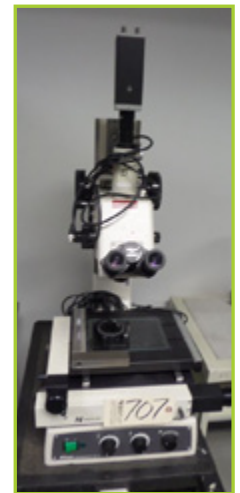
NIKON MDL: MM-22