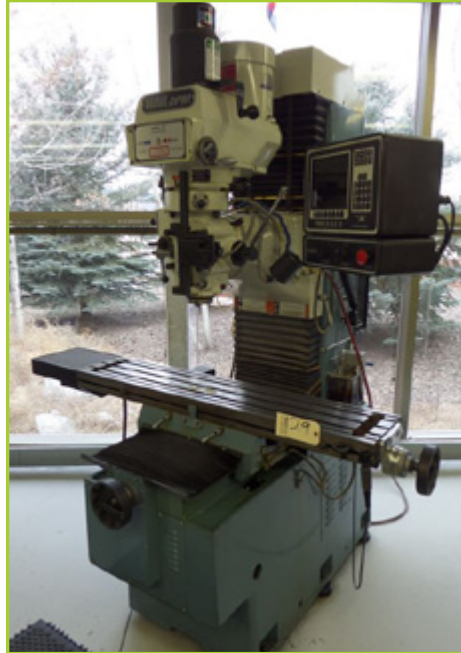
SWI MDL: TRAK DPM 3 AXIS CNC VERTICAL MILLING MACHINE