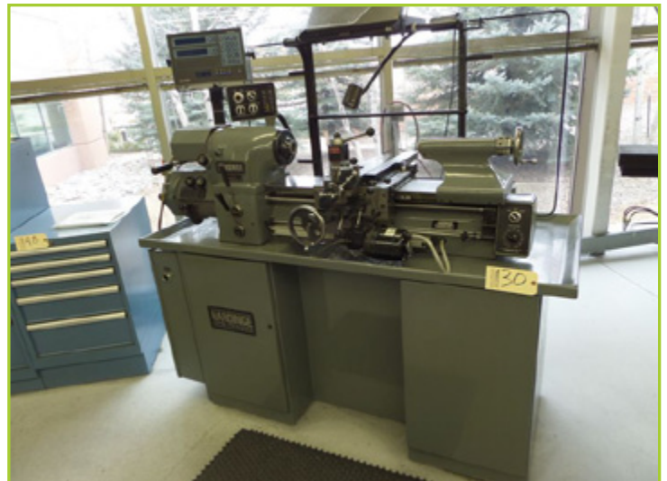
HARDINGE MDL: HLV-H PRECISION LATHE