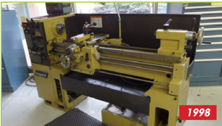
BRIDGEPORT MDL: ROMI 13-5 LATHE

HARDINGE MDL: HLV-H PRECISION LATHE - 11" SWING OVER BED, 9" SWING OVER CARRIAGE, 6" SWING OVER CROSS SLIDE, 18" BETWEEN CENTERS, 3" COMPOUND SLIDE TRAVEL, 5/16 TO 4 IPM CARRIAGE FEED RANGE, 3/16 TO 4 IPM CROSS SLIDE POWER FEED RANGE, 1 HP VARIABLE SPINDLE SPEED, WITH ACU-RITE MASTER-TP CONTROL PANEL 208 VOLTS, 3 PH