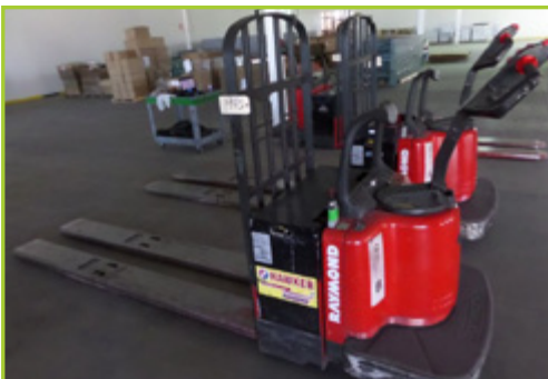
(2) RAYMOND MDL: 112TM-FRE80L PALLETTRUCK