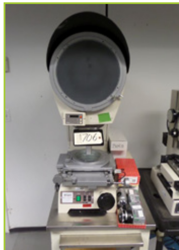
NIKON MDL: V-12BD OPTICAL COMPARATOR