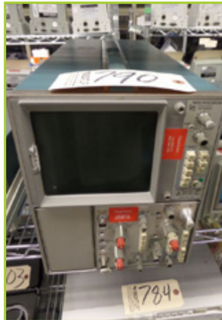
TEKTRONIX MDL: 7603 OSCILLOSCOPE