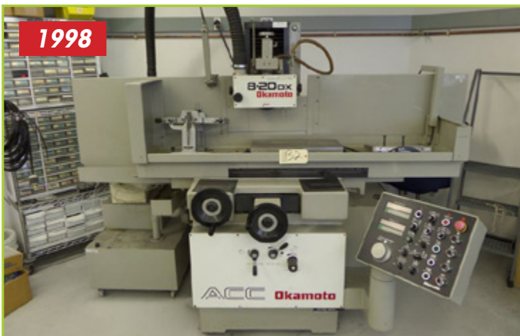
OKAMOTO MDL: ACC-8-20DX SURFACE GRINDER

(2) DI-ACRO MDL: 2 HAND OPERATED TAB NOTCHER - 16 GAUGE CAPACITY, MAX 90 DEGREE NOTCH 6"x6", WITH TABLE