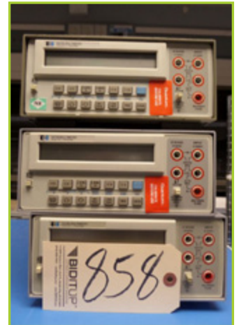
(3) HP MDL: 3478A MULTIMETERS