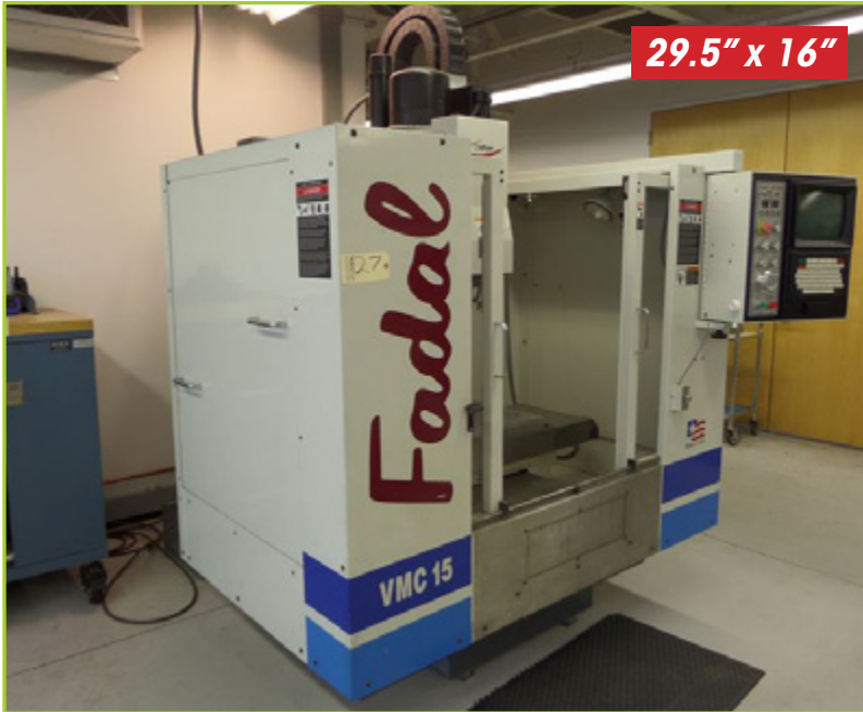
FADAL MDL: 914 VMC 15 3 AXIS VERTICAL MILLING MACHINE CENTER