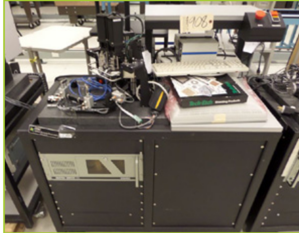
(4) OSC OPTICAL HEAD ALIGNMENT SYSTEM