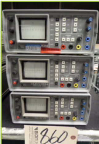
HUNTRON TRACKER 2000 PULSE GENERATORS