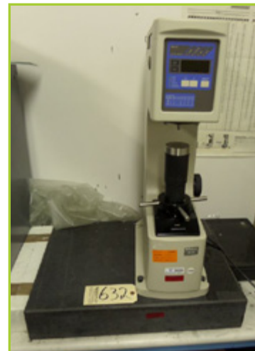
MITUTOYO MDL: ARK-600 HARDNESS TESTER