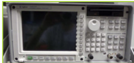
AGILENT MDL: 35670A DYNAMIC SIGNAL ANALYZER