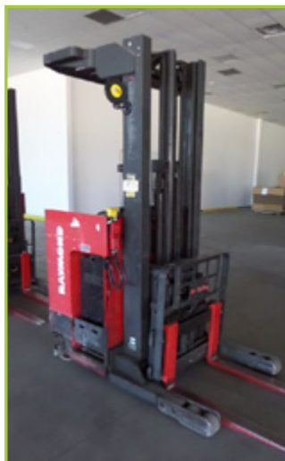
RAYMOND MDL: EASI R30TT STAND-UP

Sale Date: Wednesday, March 26 9:00 AM PDT Inspection: Tuesday, March 25 9:00 AM - 4:00 PM PDT