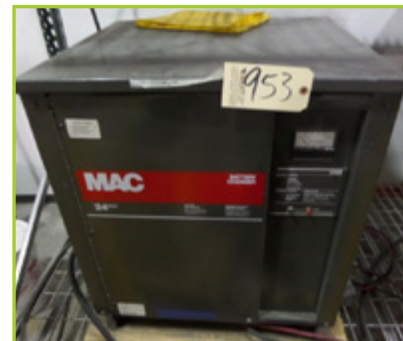
MAC MDL: 12MQ450C BATTERY CHARGER