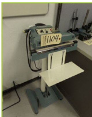
AIE MDL: AIE-300FI FOOT IMPULSE SEALER