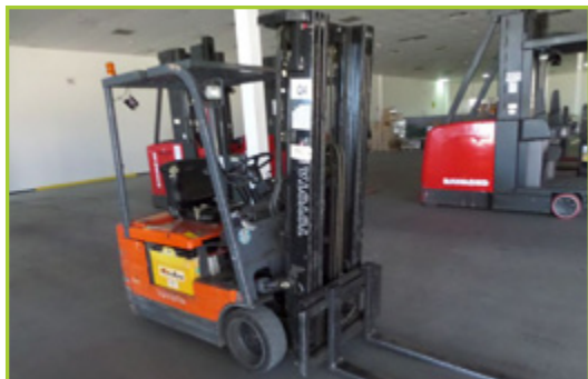
TOYOTA MDL: 5FBE15 FORKTRUCK