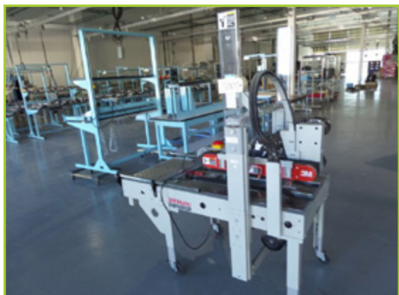
3M MDL: 700RKS CASE SEALING SYSTEM