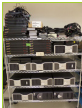
LARGE QUANTITY OF ASSORTED COMPUTER EQUIPMENT

Sale Date: Wednesday, March 26 9:00 AM PDT Inspection: Tuesday, March 25 9:00 AM - 4:00 PM PDT