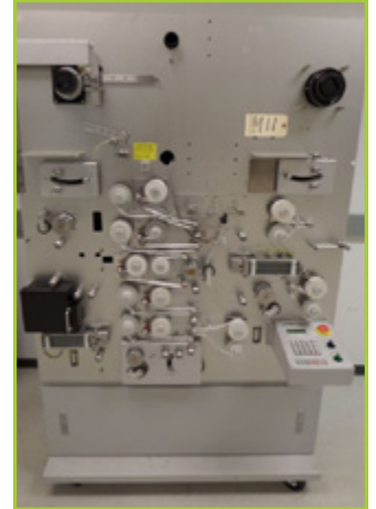
OTARI MDL:T-1329-2 TAPE TRANSPORT SYSTEM