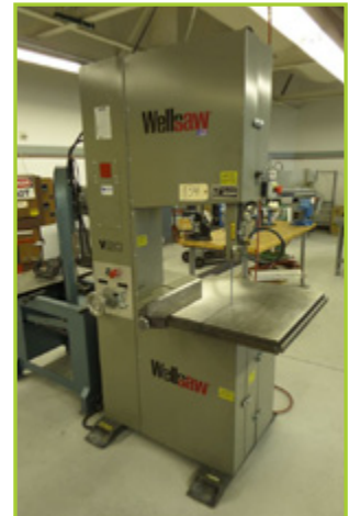
WELLSAW MDL: V20 VERTICAL BANDSAW

Starting: March 26, 2014 - 9:00 am PDT Ending: March 28, 2014 - 9:00 am PDT Location: 10125 Federal Dr, Colorado Springs, CO 80908