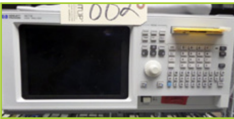
HEWLETT PACKARD MDL: 1671E LOGIC ANALYZER