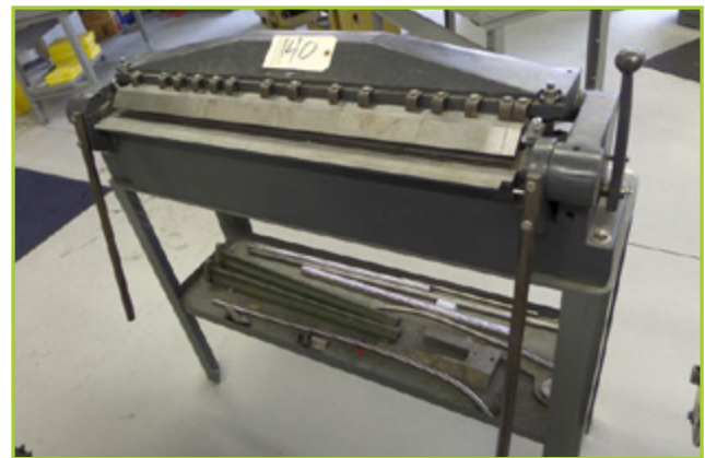
DI-ACRO MDL: 36 FINGER BREAK - 36"