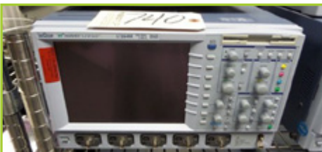
LECROY MDL: WAVERUNNER LT264M OSCILLOSCOPE