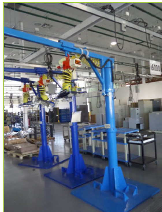
IP AUTOMATION JIB CRANE - 96" ARM WITH HARRINGTON ED125D HOIST