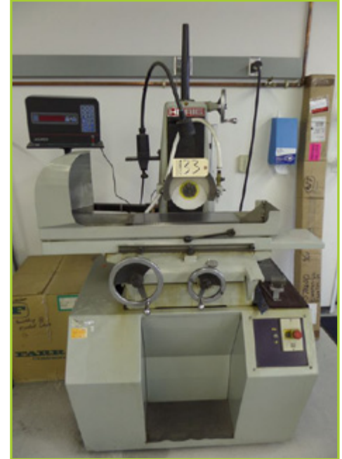
HARIG MDL: 618 SURFACE GRINDER