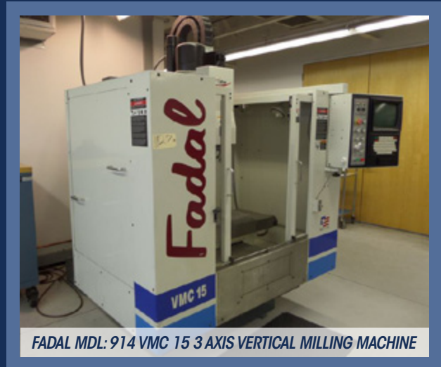
FADAL MDL: 914 VMC 15 3 AXIS VERTICAL MILLING MACHINE

Over 1,000 Lots Including - Machine Tools: Lathes, Mills, Machining Centers, Presses, Grinders, Shears, Saws, Sanders Lab Equipment: Microscopes, Generators, Analyzers, Probes, Borescopes, Meters & Indicators, Gauges and Much More