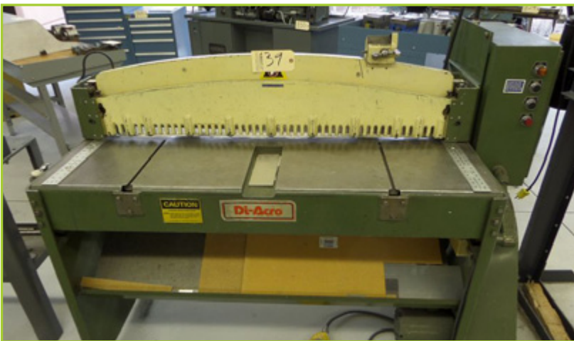
DI-ACRO MDL: 48 POWER SHEAR - 48"