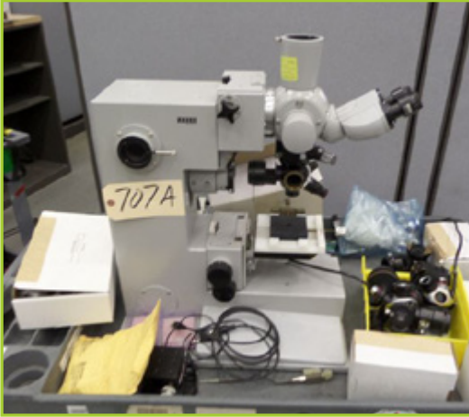
ZEISS MDL: 479901-9901 STEREO MICROSCOPE