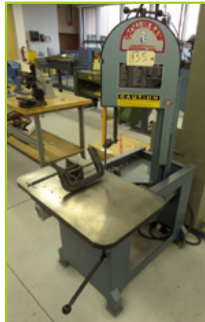
ROLLIN MDL: EF1459 VERTICAL BANDSAW

DI-ACRO MDL: 36 FINGER BREAK - 36" 16 GAUGE CAPACITY, WITH ASSORTED FINGERS