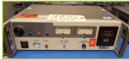
ROD-L MDL: 25 AMP GROUND TESTER