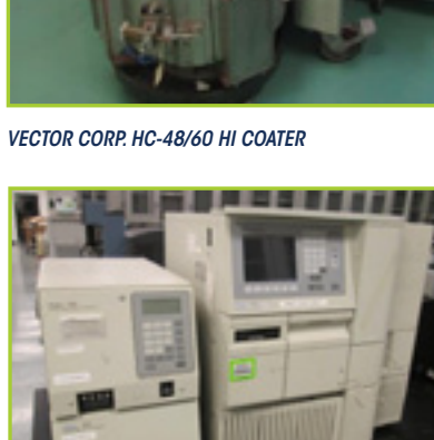
WATERS HPLC SYSTEM