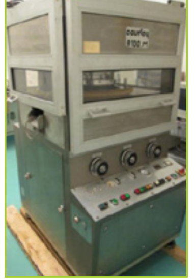
COURTOY TYPE R 100 30M 16 STATION TAB PRESS