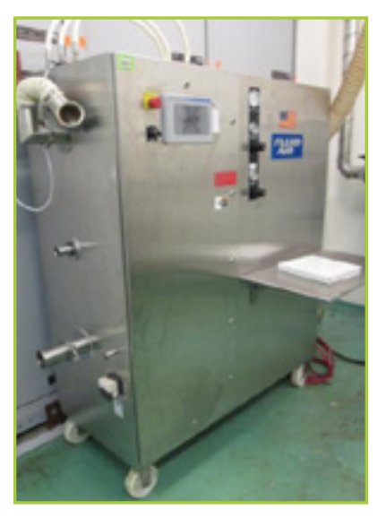
FLUID AIR MODEL 0002 XP FLUID BED DRYER WITH EXPLOSION PROOF ENCLOSURE DESIGN