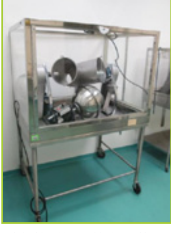
VECTOR CORP. 2216-16 COLTON PRESS