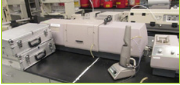
MALVERN INSTRUMENTS MSX HIGH PERFORMANCE PARTICLE CHARACTERIZATION