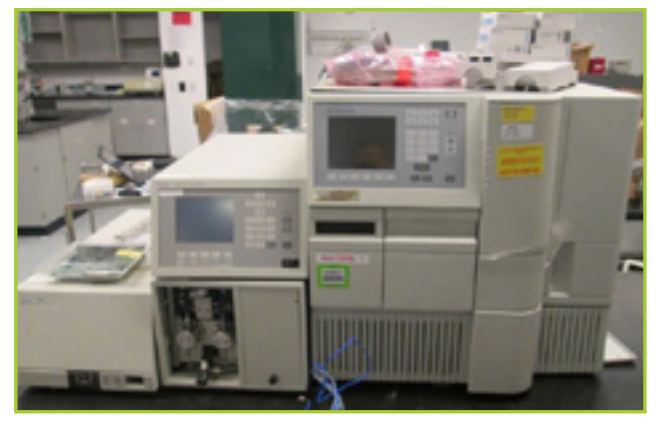
WATERS HPLC SYSTEM