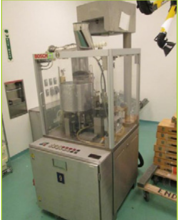
BOSCH GKF 400 CAPSULE FILLER