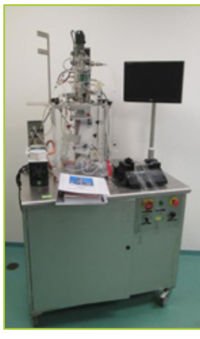
PRO-C-EPT MI-PRO VACUUM CAPPING SYSTEM

LAB EQUIPMENT: HPLC'S, CENTRIFUGES, METAL DETECTION, PUMPS, STIRRERS/ SHAKERS, HOTPLATES, BALANCES/SCALES AND MORE! LAB FURNITURE: TABLES & CHAIRS, CARTS, WORKSTATIONS, OVENS, REFRIGERATORS/FREEZERS, SHOP LADDERS AND MUCH MORE! FACILILITY SUPPORT: FORKLIFTS, PALLET RACKING, AIR HANDLING UNITS, WATER TANKS, AIR COMPRESSORS AND MUCH MORE!