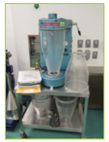
NIRO-AEROMATIC LTD. STREA 1 FLUID BED LABORATORY UNIT