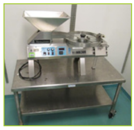
CAT DIESEL GENERATOR, 250 KW, 313KVA, NEW IN 2003, 2 PH, MDL 3306, DIESEL TANK, OUTDOOR ENCLOSURE