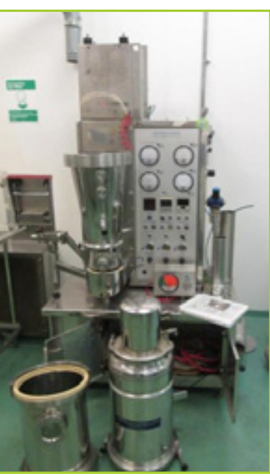
AEROMATIC MP-1 FLUIDBED DRYER