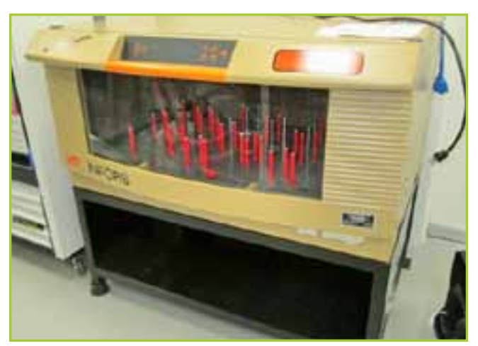
INFORS SINGLE/MULTITRON-AJ125H HIGH-TEMP INCUBATOR SHAKER