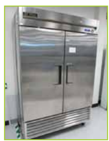
TRUE T-49 REFRIGERATOR