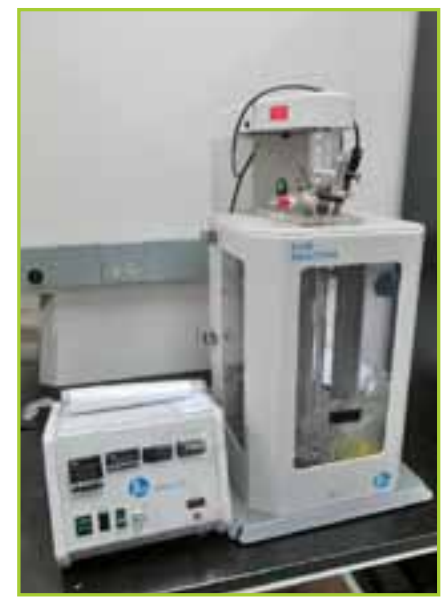
PARR 5104 LOW PRESSURE STIRRED REACTOR