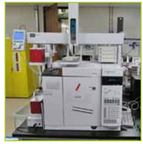
AGILENT 7890A(G3440A) GC SYSTEM