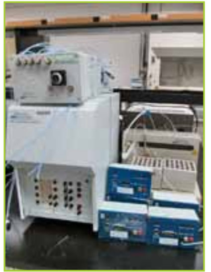
GROTON BIOSYSTEMS ARS-M SERIES-840 AUTOMATED REACTOR SAMPLING SYSTEM