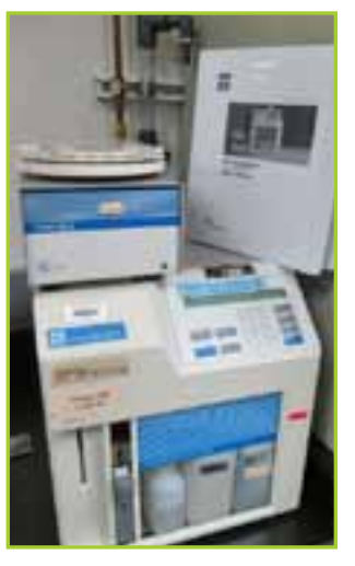
YSI 2700D-115 BIOCHEMISTRY ANALYZER