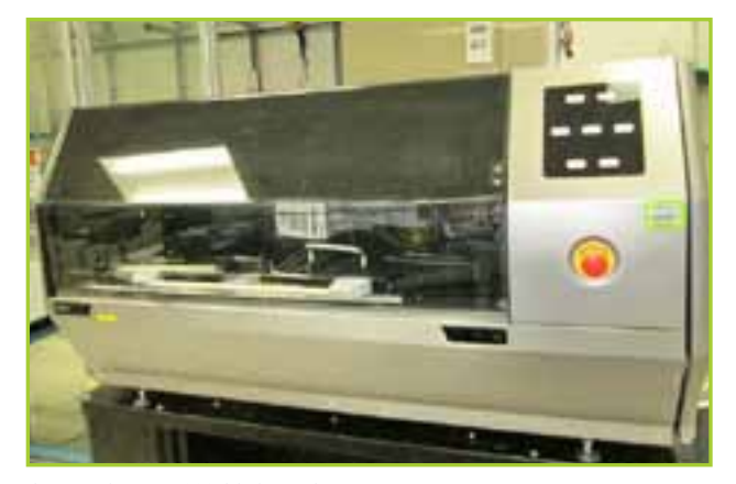
GENETIX QPIX2/X4000 COLONY PICKER