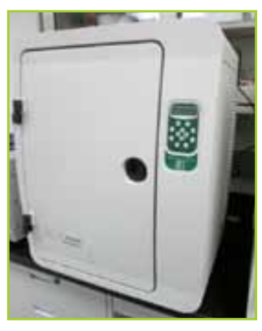
TORREY PINES SCIENTIFIC ECHO-THERM/IN45 PROGRAMMABLE, CHILLING INCUBATOR