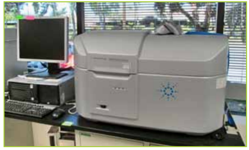
AGILENT G2505C HIGH-RES DNA MICROARRAY SCANNER