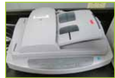
HP SCSANJET-5590 SCANNER