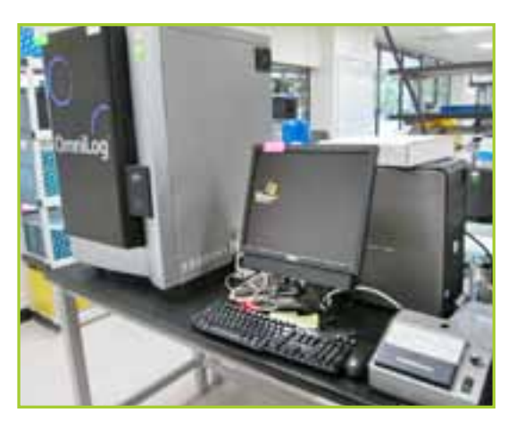
TORCON INSTRUMENTS 71000 BIOLOG OMNILOG INCUBATOR READER