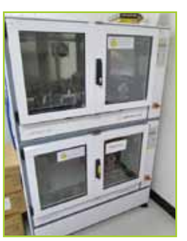
SARTORIUS STEDIM BIOTECH DUAL-STACK/ CERTOMAT-BS-1 UHK INCUBATOR SHAKERS