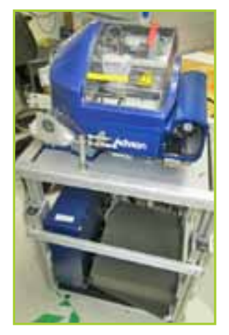
ADVION BIOSYSTEMS TRIVERSA NANOMATE FRACTION COLLECTOR/INFUSION SYSTEM