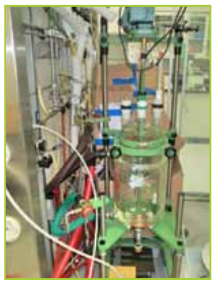
CHEMGLASS 19-LITER REACTOR SYSTEM