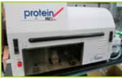
ADVANCED ANALYTICAL PROTEIN-PRO-24HT