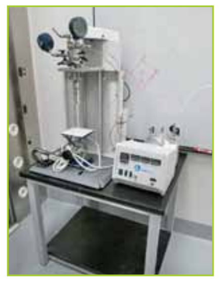
PARR 5115B LOW PRESSURE STIRRED REACTOR SYSTEM