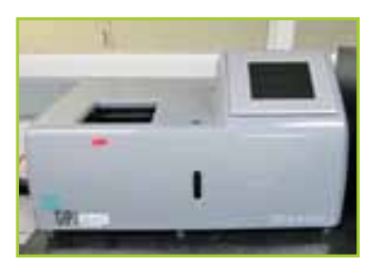
DAS-GIP BASIC MICROBIOREACTOR SYSTEM