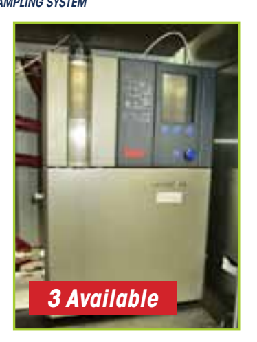
HUBER UNISTAT-405 TEMPERATURE CONTROL SYSTEM