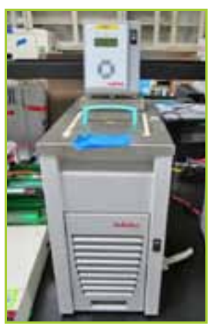
JULABO ED/F25 REFRIGERATED/ HEATING CIRCULATOR