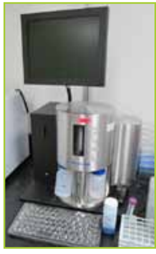
INNOVATIS CASY-TTC CELL COUNTER & ANALYZER SYSTEM