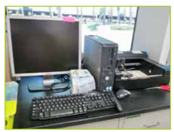
CALIFORNIA LABELING SYSTEMS TUBEWRITER(EK-64280) TUBE PRINTING