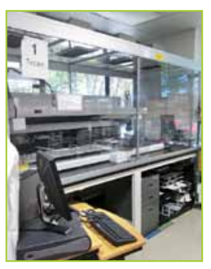
TECAN GENESIS-200 ROBOTIC 8-CHANNEL LIQUID HANDLING WORKSTATION