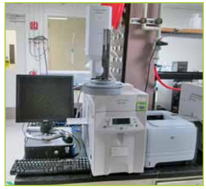
AGILENT 6850-SEIRES-II(G2630A) NETWORK GC SYSTEM