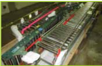
ASSORTED CONVEYORS AND PARTS