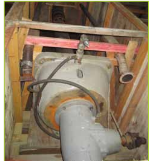
FIRE SUPPRESSION SYSTEM , MASTER CONTROL, DCFR-29 FIRE PUMP CONTROLLER, GMC 406/A DIESEL MOTOR, CENTRIFUGE S150A FIRE PUMP, TURBINE FIRE PUMP, FAIRBANKS MORSE 7000F PUMP