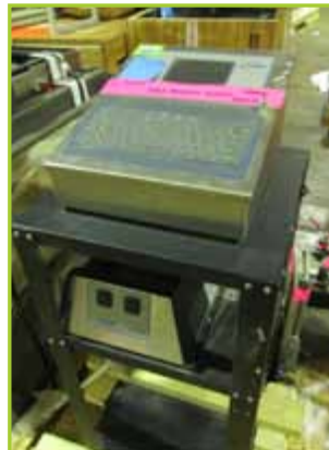
DIAGRAPH IDS3000 CASE PRINTING SYSTEM