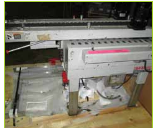
3M 800AB ADJUSTABLE CASE SEALER, TYPE 39600, 115V, 60 HZ, 440W, 3.8A