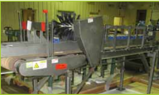
CLUSTER PACKER INFEEED/ CONVEYOR , 4' X 14' X 80" T