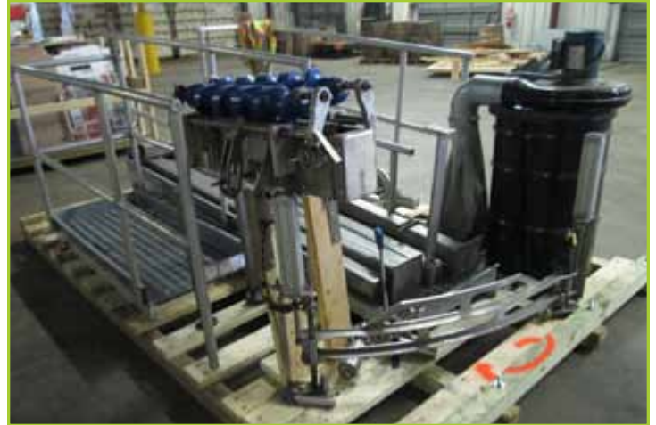
FEED SCREWS, DUST COLLECTOR LOT TO INCLUDE CONTENTS OF (1) SKID, 12' X 8' X 57" T TO INCLUDE CATWALK, DUST COLLECTOR AND FEED SCREWS.