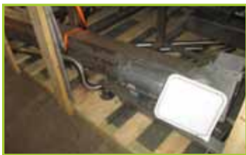
ELEVATOR 9 FEET LONG WITH .5 HP MOTOR.