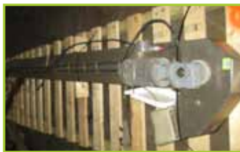
ELEVATOR WITH .5 HP MOTOR, (1) SKID - 17' X 4'