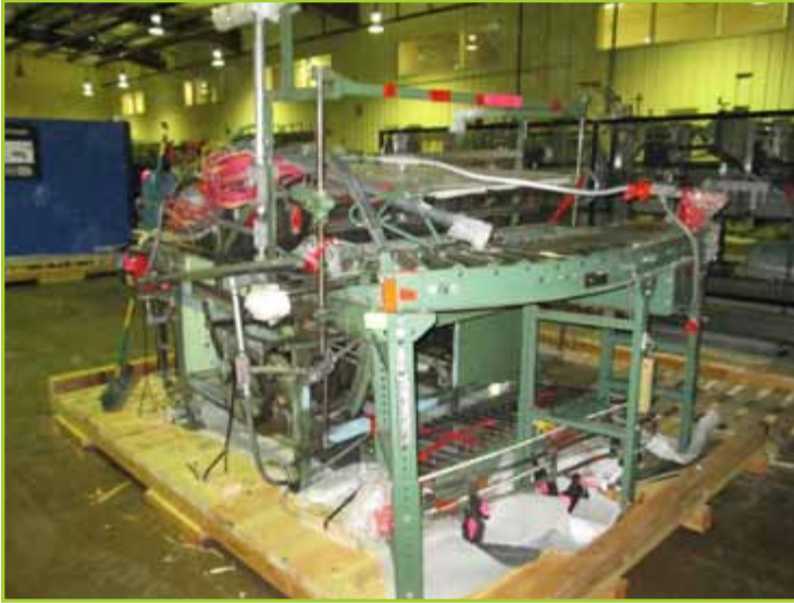
CONVEYOR AND MANUAL DUMP TABLE LOT TO INCLUDE CONTENTS OF (1) SKID - 8' X 11' X 7.5'T, ASSORTED ROLLING CONVEYOR, MANUAL PNEUMATIC DUMP TABLE