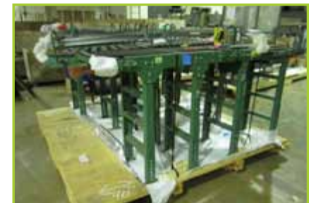
SIERRA CONVEYOR LOT TO INCLUDE (4) SECTIONS OF ASSORTED CONVEYOR