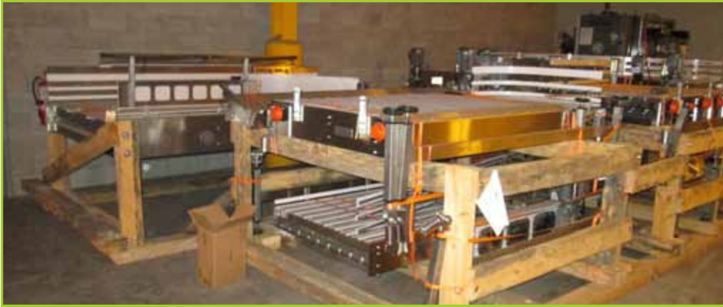
HARTNESS INTERNATIONAL 7100 ACCUMULATION TABLES. CONSISTING OF (7) SKIDS; (2) 69"X4'X21', (1) 5'X7'X12' WITH (6) PIECES, (1) 6'X6.5'X4', (1) 6'X7'X4', (1) 17'X6'X4', (1) 57"X10.5'X8' ALL AMOUNTING TO (17) SECTIONS. **UNIT HAS NEVER BEEN USED, DESIGNED FOR 300 BOTTLES PER MINUTE WITH APPROX. CAPACITY OF 6 MINUTES MAX**