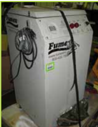
FUMEX FA2HDR FUME EXTRACTOR