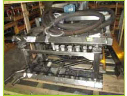
HARTNESS INTERNATIONAL FILLER BLOCK 480V, 3 PH, 60 HZ, 7.2 A FULL LOAD, S/N W2200192H