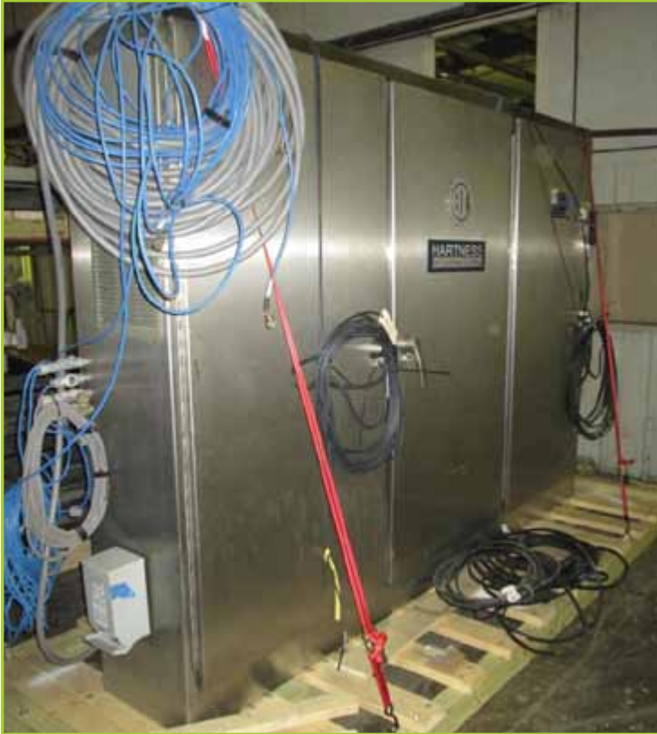
HARTNESS INTERNATIONAL MOTOR CONTROL CENTER 480V, 3 PH, 60 HZ, (3) DOORS AND 5 HP, (1) SKID - 12' X 58" X 94" T.