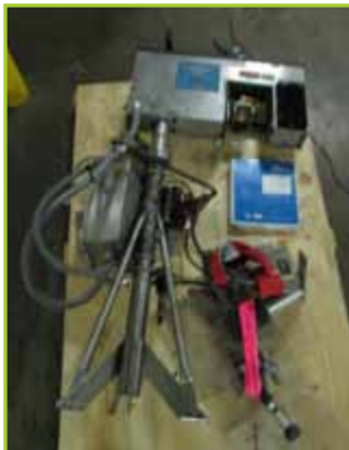
INDUSTRIAL DYNAMICS FT-75 FILTEC X-RAY FILL LEVEL INSPECTION SYSTEM MACHINE TYPE 82, WITH MANUAL