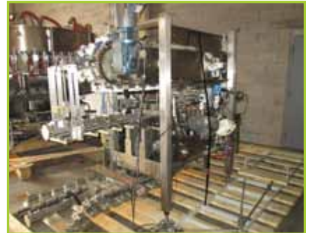
HARTNESS INTERNATIONAL 2200 LANER 480V, 3 PH, 60 HZ, 7.2 A FULL LOAD, S/N W2200192H