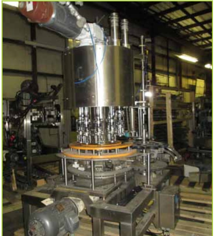
HARTNESS INTERNATIONAL CAPPER MACHINE CONTENTS OF (1) SKID - 91" X 146" X 106" T