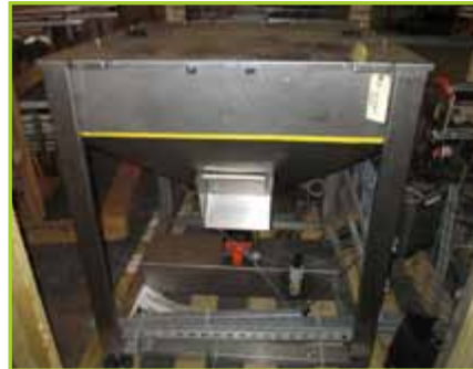
HARTNESS INTERNATIONAL 21 STATION BOTTLE RINSER WITH 1 HP MOTOR W2200192H