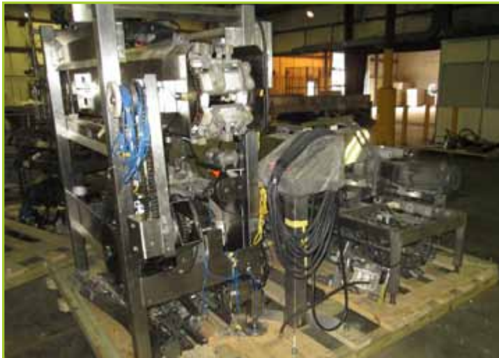
HARTNESS INTERNATIONAL LOT TO INCLUDE DISCHARGE STATION AND BASE FOR CLEANING STATION CONTENTS OF (1) SKID - 10' X 8' X 80" T.

HARTNESS INTERNATIONAL COMPLETE FRONT END BOTTLING LINE PROFESSIONALLY DECOMMISSIONED BY MANUFACTURER, 240 BOTTLES PER MINUTE CAPACITY FOR ANY SHAPE BOTTLE OF EITHER 750 ML OR 1 LITER. TO INCLUDE INFEED, RINSER, FILLER BLOCK, CAPPER, CAP HOPPER WITH ELEVATOR, DISCHARGE STATION, MASTER CONTROL CENTER, SAFETY DOORS.