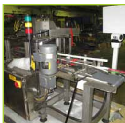
PAKTECH A2001 TWINPAK HANDLE APPLICATOR PACKAGING MACHINE WITH ALLEN BRADLEY CONTROLS