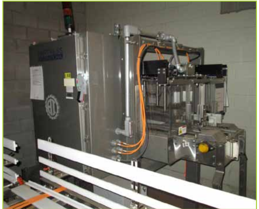
HARTNESS INTERNATIONAL 2200 LANER 480V, 3 PH, 60 HZ, 7.2 A FULL LOAD, S/N W2200192H