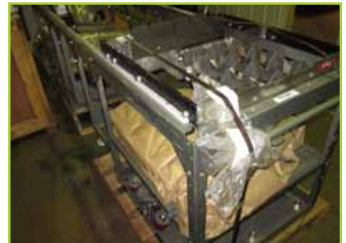
LIME AUTHENTICS LOT TO INCLUDE (3) PALLETS WITH (3) BOTTLE PACKAGING DEVICES, 57 LB. CAPACITY