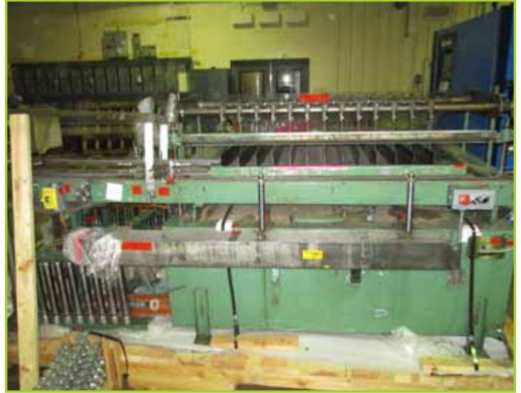
CONVEYOR, UNSCRAMBLER LOT TO INCLUDE CONTENTS OF (1) SKID - 7' X 11' X 64" T, ASSORTED ROLLING CONVEYOR, MANUAL DUMP TABLE AND UNSCRAMBLER