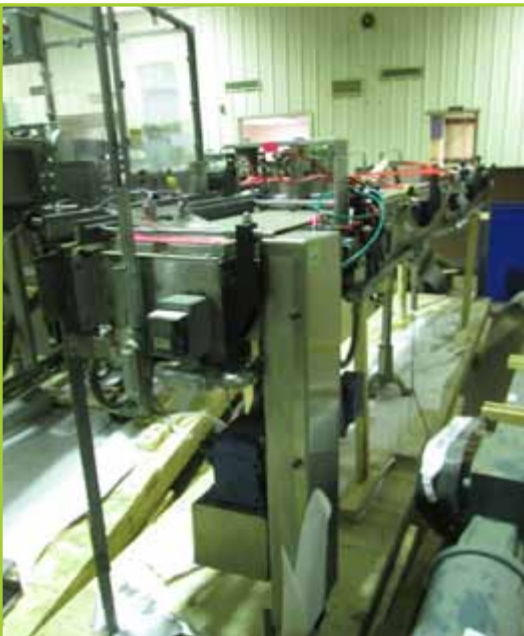
CLUSTER PACKER INFEEED / CONVEYOR , 4' X 14' X 80" T