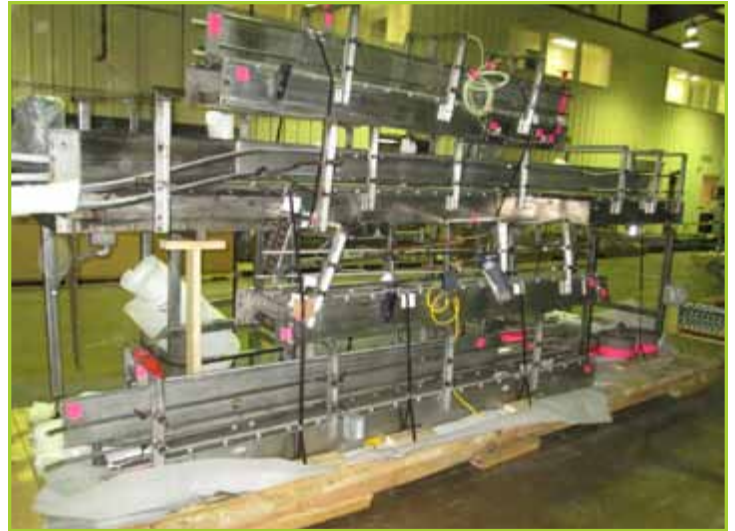
HUBBEL SPECTRUM TX STAND ALONE FINISHING SYSTEM AND PIONEER CONVEYORS TO BE USED FOR PARTS ONLY, INCOMPLETE SYSTEM