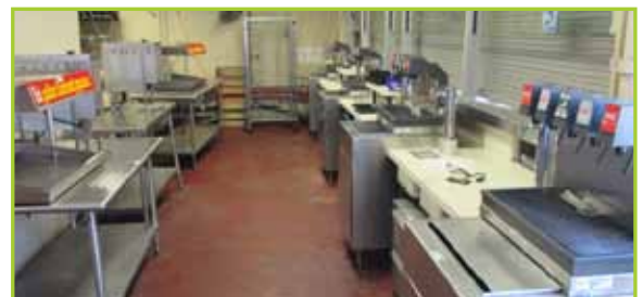
CONCESSION STAND LOT: ( 20 PCS ) CONCESSION STAND, FOOD & BEVERAGE. CONSISTING OF: ( 1 ) IFES # 3B80A TOASTMASTER TOASTER UNIT, 115VOLTS, 1 PHASE, ( 1 ) PORTABLE FOOD TRAY WARMER TRANSFER STATION ON WHEELS UNIT; ( 1 ) KOLPAK # ADT1040U WALK IN FREEZER, APPROX. 6'5" W X 8'5" D X 8'6" H; ( 2 ) J.J. CONNOLLY STEAMER ON WHEELS; ( 1 ) VOLLRATH # 38103 SERVE WELL STEAM TABLE; 120VOLTS, 17.5AMPS, 2100WATTS; ( 3 ) BEVERAGE-AIR # UR30G GLASS DOOR COOLERS; ( 1 ) BEVERAGE-AIR # 8848 REFRIGERATOR / FREEZER; ( 1 ) STAINLESS STEEL FOOD WASH SINK 2 TUB UNIT; ( 4 ) STAINLESS STEEL WORK TABLES; ( 5 ) TURBO TAP-STYLE BEER TAP STATION, NO HEAD TAP OR HANDLES; ( 1 ) METRO STYLE RACK