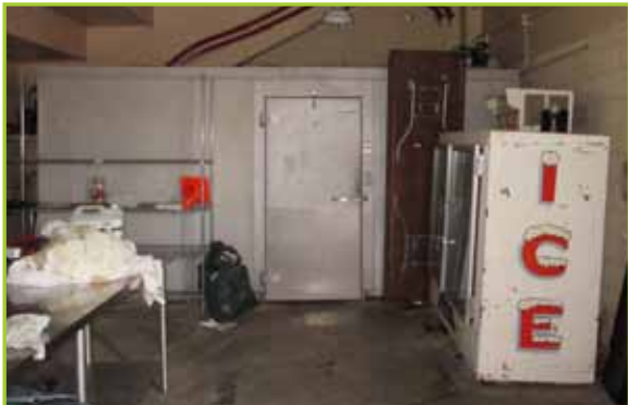
CONCESSION STAND LOT: ( 12 PCS ) CONCESSION STAND, FOOD & BEVERAGE. CONSISTING OF: ( 2 ) KOLPAK 2-COMPARTMENT WALK-IN REFRIGERATOR/FREEZER APPROX. 15.5'LX6'DX7.5'H ---ITEM HARDWIRED;( 1 ) SMALL STAINLESS STEEL HAND WASH SINK;( 1 ) ICE STORAGE CABINET 6'LX2.5'DX6.5'H;( 1 ) FOLDING TABLE ; ( 1 ) GREY METAL SHELVING UNIT ; ( 1 ) 6'H WOOD CABINET ON WHEELS ; ( 1 ) 5'L BLUE PLASTIC TUB/BIN ON WHEELS ; ( 2 ) ASSORTED STAINLESS STEEL WORK TABLES