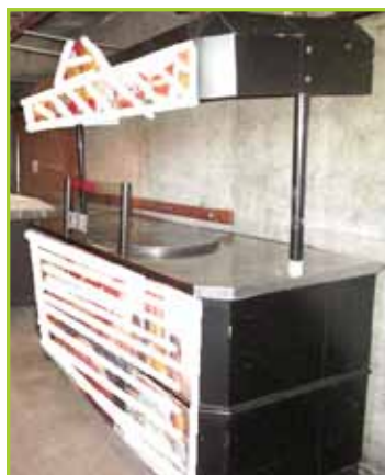
PORTABLE CONCESSION STAND TO BE USED FOR PARTS ONLY, INCOMPLETE SYSTEM

PORTABLE CONCESSION STANDS LOT ( 22 PCS ) PORTABLE CONCESSION STANDS. CONSISTING OF: PORTABLE BEER CONCESSION STAND ON WHEELS-- APPROX. 8'W X 3'D X 3'H; ( 2 ) CONCESSION CARTS ON WHEELS-- APPROX. 5'W X 2'1/2"D X 3'H; ( 1 ) FOOD TRAY TRANSPORTS CARTS 6'H ALUMINUM; ( 2 ) BEER CONCESSION CARTS APPROX. 7'1/2"W X 3'D X 3'H; ( 4 ) ASSORTED TRAILER PULL CARTS ; ( 1 ) FOLDING TABLE; ( 9 ) PORTABLE COOLER BOXES ICE TYPE, APPROX.: 5'W X 2'D X 3'H; ( 4 ) PORTABLE COOLER BOXES ICE TYPE, APPROX.: 4'W X 2'D X 3'H; ( 1 ) POTABLE SINK