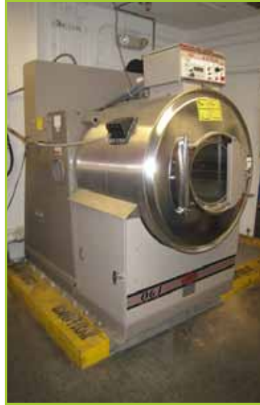
MILNOR Q6J/36026Q6J INDUSTRIAL CLOTHES WASHER WITH #E-P-PLUS CONTROLLER