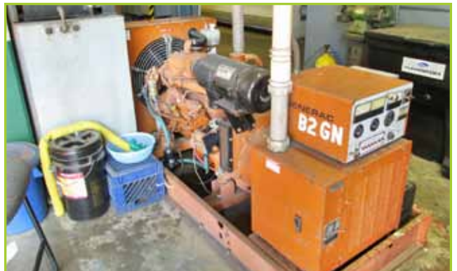
GENERAC 440FDR8021GG-T784 DIESEL GENERATOR SKID, 1800 RPM, TYPE FDR, 162 KVA, S/N ND-3057217. (ID# C3 - GN)