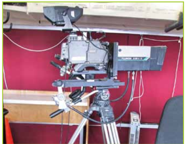
SONY BVP-7A VIDEO CAMERA WITH FUJINON A30 X 11 WITH TELEPHOTO LENS AND STAND