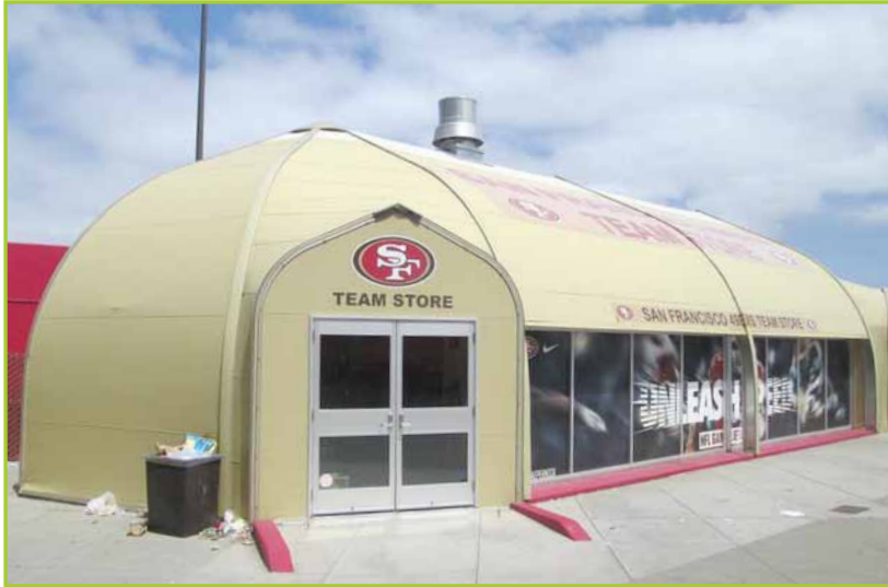
49ERS TEAM STORE , DOME STYLE TOP HEAVY TARP STYLE, ALUMINUM FRAMED, WITH / 2 SWING OPEN DOORS AT EACH, APPROX., 61' 8" LONG X 32' D X 20' H, WITH / CARRIER INDUSTRIAL AIR CONDITIONER UNIT # 50JS-060-301, 208/230VOLTS, 1 PHASE, 60HZ, 1.5 / 6.2AMPS