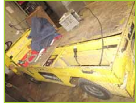
CLUB CART 25900 GOLF CART VEHICLE, WITH / LESTONIC 36EL-21-6 36VOLT CHARGER