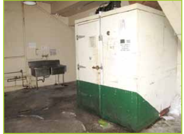
CONCESSION STAND LOT, FOOD & BEVERAGE: CONSISTING OF: ( 1 ) WALK IN FREEZER APPROX.: 6'W X 6'D X 8'H, ( 1 ) WALL MOUNT STYLE STAINLESS STEEL FOOD PREP STATION 9'5" LONG, ( 2 ) HATCO #GRSDS-360 FOOD DISPLAY WARMER, ( 2 ) SMALL GAS GRILLS, ( 1 ) STAINLESS STEEL CORNER STYLE WASH SINK 2 TUB UNIT