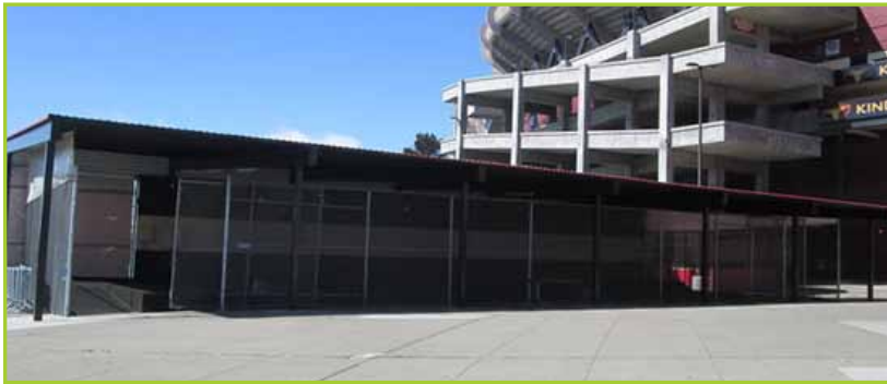
49ERS MUSEUM PAVILION STEEL FRAMED PAVILION , 75'LONG X 35'DEEP X ( 5 ) 12'HIGH SQUARE POLE FRONT SUPPORT, BACK IS WALL SUPPORTED, ALUMINUM CORRUGATED ROOF, POLES ARE CEMENTED IN GROUND, WITH / FLUORESCENT LIGHTS, LOCATED 49ERS MUSEUM PAVILION.