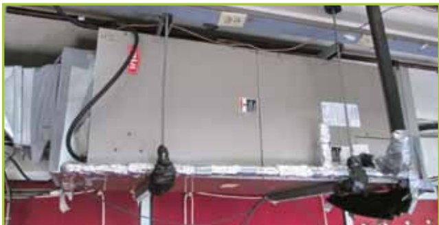
GAYLORD PACIFIC OVERHEAD VENTILATOR/HOOD WITH FIRE SUPPRESSION. STAINLESS STEEL ; FOOTPRINT APPROX. 156"LX51"WX36"H ; KIDDE FIRE SUPPRESSION SYSTEM WITH 4 OVERHEAD DISPENSER NOZZLES ; 3 OVERHEAD LIGHTS ; 2 DAMPER CONTROL HANDLES