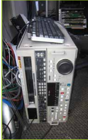
MAXINE - THE CHYRON CHARACTER GENERATOR WITH KEYBOARD