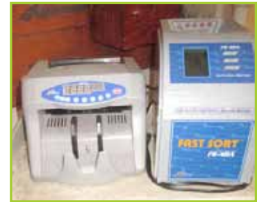
BANT AUTOMATIC CASH COMPANY 740 COIN & PACKAGE MACHINE WITH FEEDER