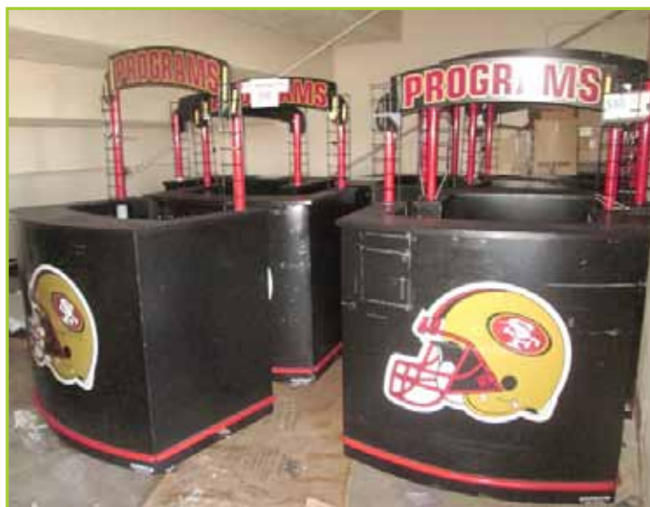
PORTABLE PROGRAMS STANDS

KITCHEN EQUIPMENT LOT: ( 5 PCS ) KITCHEN EQUIPMENT. CONSISTING OF: ( 1 ) VULCAN 6-BURNER STOVE/ -OVEN RANGE 34"L X 39"W. ( 2 ) BLODGETT DUAL-FLOW OVEN ON LEGS, OVERALL DIMS 38"L X 40"D X 60"H, GAS TYPE. ( 1 ) STAR ULTRAMAX GRIDDLE-GAS TYPE, 4'L ON STAINLESS STEEL TABLE STAND. ( 1 ) CRETORS & CC # TGS32GP-SS COMMERCIAL DUAL-STATION POPCORN MAKING TABLE, GAS TYPE, OVERALL 8' LONG