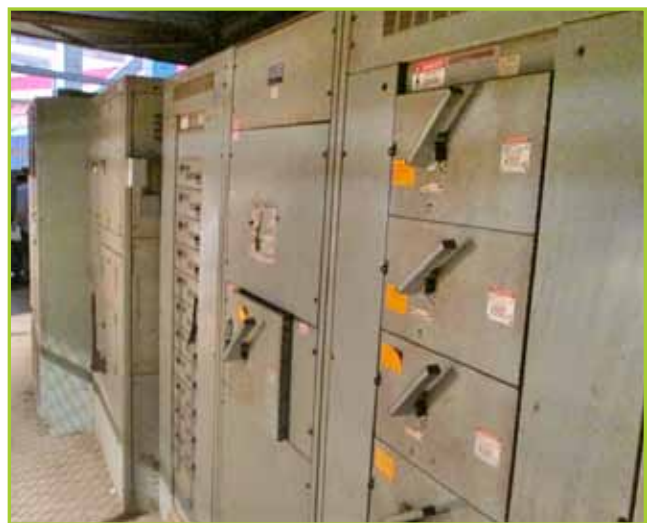
WESTINGHOUSE 300 KVA 3 PH TYPE SL POWERCENTER TRANSFORMER S.N 7371947, DISTRIBUTION CENTER WITH (14) SWITCHES, HAMMOND POWER 3 PH 112.5 KVA DRY TYPE TRANSFORMER. (ID# C-1 SUBSTATION). LOCATED: GROUND LEVEL, STADIUM EXTERIOR. NEAR VERIZON GATE/GATE-E/NORTH ESCALATOR.