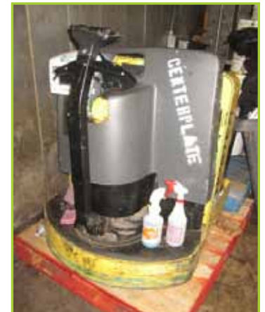
ASSORTED PALLET JACKS