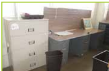
ASSORTED OFFICE FURNISHINGS