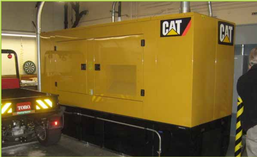
CAT DIESEL GENERATOR