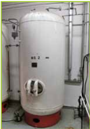
HEAT EXCHANGER WITH FIBERGLASS COATING