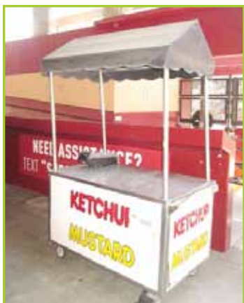
PORTABLE CONCESSION STAND ( 1 ) CONDIMENTS PORTABLE CONCESSIONS CART