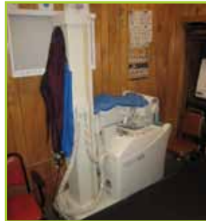
SHIMADZU MOBILE-ART-PLUS/MUX-100H MEDICAL X-RAY SYSTEM WITH INNOVATIVE CR COMPANY #ICR-3600 FLAT-SCREEN IMAGING SYSTEM