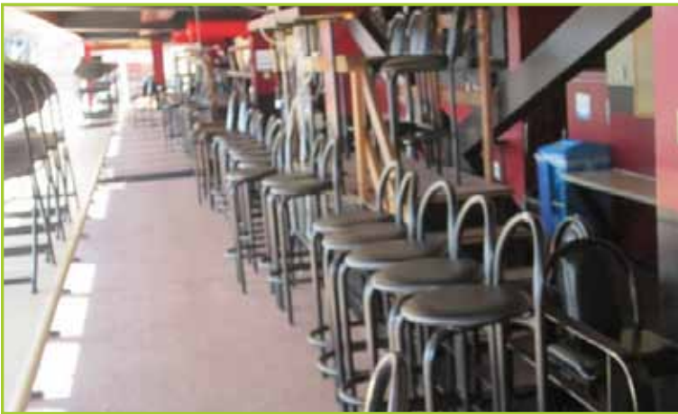
ASSORTED PRESS BLACK METAL FRAMED STOOLS