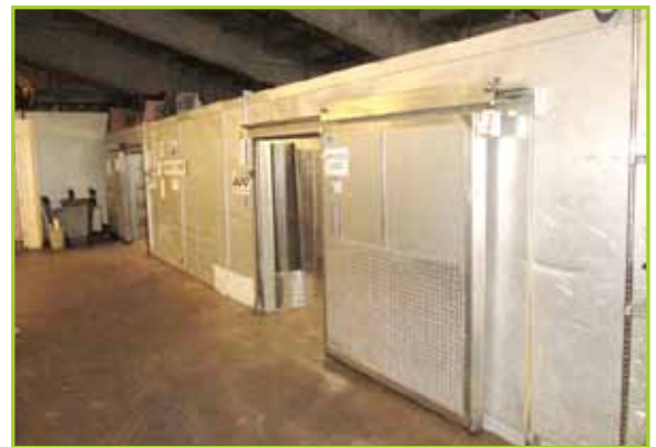
THERM-L-BOND WALK IN FREEZER: WITH 2 SLIDE DOORS. APPROX. 40'LONG X 15'D X 7'1/2"H

BIDDERS ARE WELCOME TO BID ON-SITE AT THE AUCTION OR ONLINE @ HGAUCTION.COM