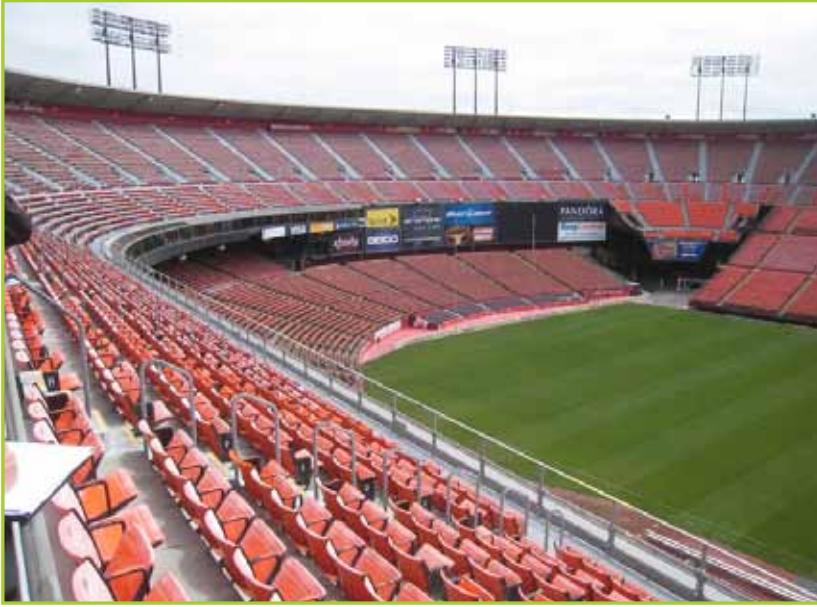
LARGE QUANTITY OF SPORT STADIUM SEATING