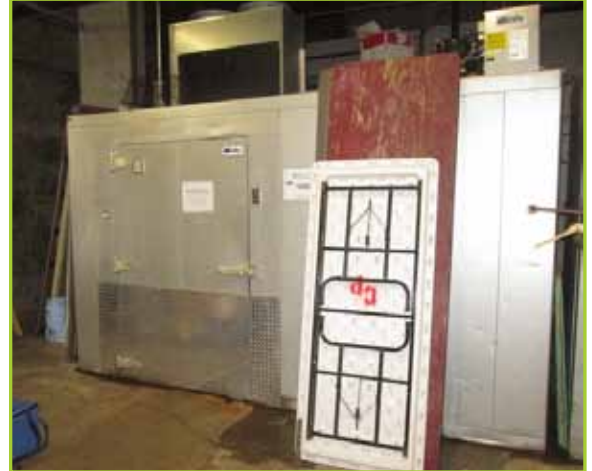
BALLY R SERIES WALK IN FREEZER WITH 1 DOOR. APPROX. 12"W X 10'D X 7'1/2"H

CONCESSION STAND LOT: ( 23 PCS ) CONCESSION STAND, FOOD & BEVERAGE. CONSISTING OF: ( 1 ) GOLD MEDAL 2004SLD ASTRO POP STAGING CABINET W/ SWING & SLIDING DOORS & 3-SHELF WARMER; ( 3 ) IFES # 3B80A TOASTMASTER TOASTER UNIT, 115VOLTS, 1 PHASE. ( 1 ) ALL METAL # 456-306 COUNTER STYLE REFRIGERATOR / FREEZER ( NO DOORS ); (1) STAINLESS STEEL WORK TABLE, STAINLESS STEEL FOOD PREP STATION 9'5" LONG, 2 TUB UNIT; ( 1 ) MANITOWOC # CY0804A ICE MACHINE; ( 1 ) TONKA WALK IN REFRIGERATOR / FREEZER APPROX. 14"W X 7'D X 7'8"H; ( 1 ) STAINLESS STEEL HAND WASHING SINK; ( 1 ) NESTLE HOT COCOA DISPENSER.