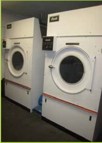
CISSELL C125C INDUSTRIAL CLOTHES DRYER (NATURAL GAS)