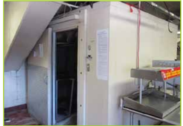
CONCESSION STAND LOT: ( 6 PCS ) CONCESSION STAND, FOOD & BEVERAGE. CONSISTING OF: ( 1 ) VOLLRATH # 38103 SERVE WELL STEAM TABLE ; ( 1 ) STAINLESS STEEL WASH SINK 1 TUB UNIT ; ( 1 ) NOR-LAKE # 20579R WALK IN FREEZER APPROX. 12'W X 9'D X 7'1/2"H; ( 1 ) NOR-LAKE WALK IN FREEZER APPROX.: 6'W X 6'D X 7'1/2"H ; ( 1 ) PORTABLE COOLER CART APPROX. 5'W X 2'1/2"D X 3'H; ( 1 ) SMALL STAINLESS STEEL HAND SINK.