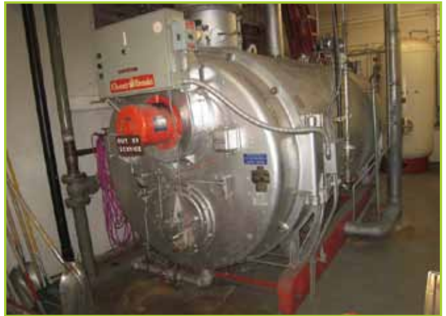
CLEAVER BROOKS CF720-L25 BOILER