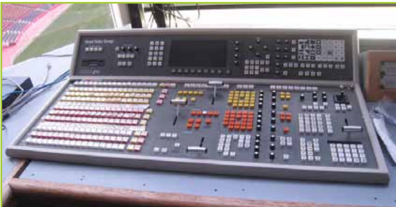
BEHRINGER VMX-100, PROFESSIONAL DJ MIXER