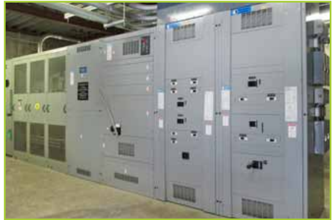
SUBSTATION TO INCLUDE FEDERAL PACIFIC 3 PH, 60 HZ, 500 KVA DRY TYPE TRANSFORMER CLASS AA S/N 11148-001, DISTRIBUTION PANEL WITH (8) SWITCHES, 1,000 AMPS, 3 PH DISCONNECT SWITCH TYPE LCB 15000 VOLTS. (ID# A1 SUBSTATION). LOCATED: GROUND LEVEL, STADIUM INTERIOR. NEAR MEDIA WILL CALL GATE/BY BUS DROP OFF AREA.