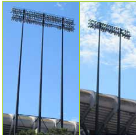
OUTDOOR SPORTS STADIUM LIGHT TOWERS WITH QTY-145 LIGHT FIXTURES. TOWER: CAGE PLATFORM STYLES ; 2 OR 3 POLE METAL TOWERS ; APPROX. 150'H - 200'H