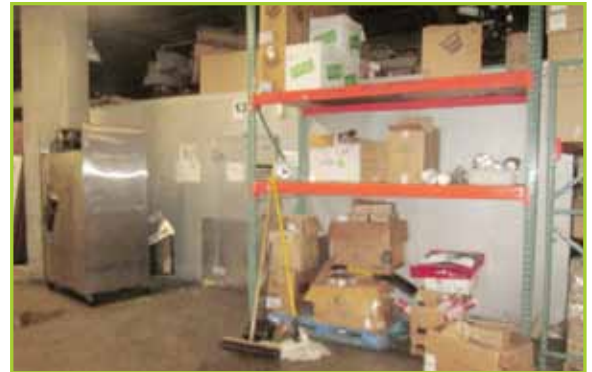
VOLLRATH 18815-5 WALK IN FREEZER WITH 1 DOOR. APPROX. 22'LONG X 10'D X 8'1/2"H