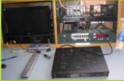
DBX 162SL STEREO COMPRESSOR/LIMITER FILTER