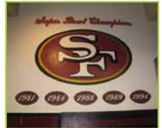
ASSORTED LOCKER ROOM FURNISHINGS