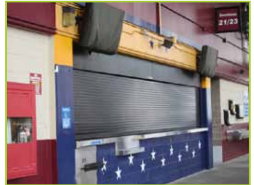
ASSORTED FULL SIZE METAL ROLL - UP DOORS