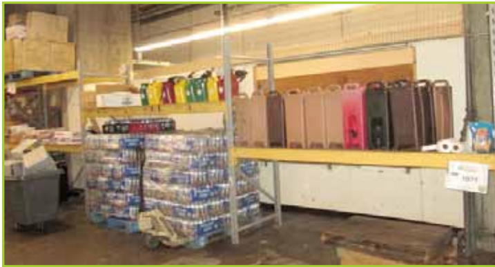
STOCK SHELVING & PALLET RACKING & FURNITURE LOT: ( 60+ PCS ) ASSORTED STOCK SHELVING & PALLET RACKING & FURNITURE, CONSISTING OF ( 8 ) FOLDING TABLES, ( 2 ) STORAGE CABINETS, ( 1 ) VERTICAL FILE CABINET, ( 2 ) BEVERAGE -AIR COOLERS, ( 1 ) MICROWAVE, ( 3 ) DESKS, ( 3 ) WOODEN FILE CABINETS, ( 1 ) 3 DRAWER, FILE CABINET, ( 1 ) 1 DOOR /2 DRAWER CABINET, ( 3 ) 4 DRAWER LATERAL FILE CABINETS, ( 3 ) VINTAGE WOODEN FILE CABINETS, ( 2 ) CHAIRS, ( 4 ) SECTIONS OF PALLET RACKING, ( 24 ) 8' WOODEN FILE CABINETS, ( 2 ) CHAIRS, ( 4 ) SECTIONS OF PALLET RACKING, ( 24 ) 8' UPRIGHTS