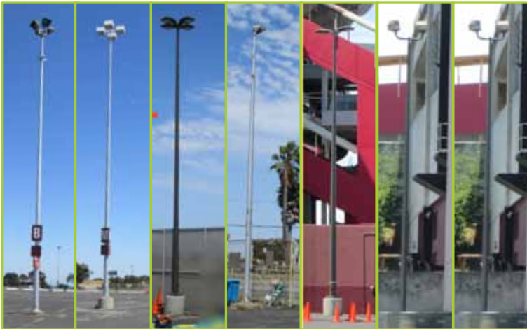
LOT: (32 TOTAL ASSORTED ) OUTDOOR, STRAIGHT, METAL LIGHT POLES WITH LIGHT FIXTURES. [MOSTLY FLOOD LIGHT STYLE ; MOSTLY APPROX. 60' HIGH AND MOSTLY 1000-WATTS