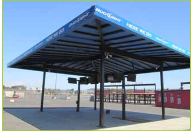
STEEL FRAMED PAVILION , CANVAS TOP, APPROX., 36'W X 31'D, WITH / 6" STEEL BEAMED UPRIGHTS, 12" SQUARE CROSS OVER BEAMS, SLANTED ROOF, WITH ( 4 ) LIGHTS, LOCATED BUD LIGHT PLAZA PAVILION.