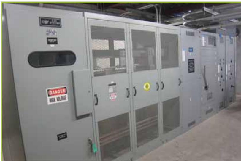
SUBSTATION TO INCLUDE FEDERAL PACIFIC DRY TYPE CLASS AA TRANSFORMER, 3 PH, 300 KVA, S/N 11147-001, GENERAL ELECTRIC 3200 AMPS DISTRIBUTION STATION WITH (7) SWITCHES, HAMMOND POWER 3 PH DRY TYPE TRANSFORMER 208V, 112.5 KVA, P/N NNM112BK