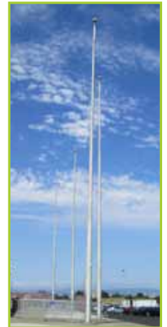
LOT: (QTY-4) OUTDOOR METAL FLAG POLES, APPROX. 50'H