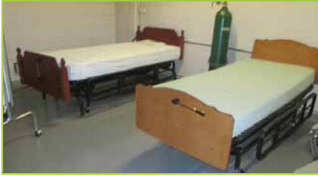
FIRST AID STATION CONSISTING OF ( 2 ) HOSPITAL BEDS, ( 1 ) COMPACT REFRIGERATOR, ( 1 ) ICE MACHINE, STAINLESS STEEL SINK TOILET & STALLS, ( 1 ) EMERGENCY STATION # 14, ( 1 ) HOT WATER HEATER, ( 10 ) STACK CHAIRS