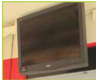
LARGE QTY OF ASSORTED SHARP / VIZIO / SAMSUNG / SONY 20" - 42" TELEVISIONS