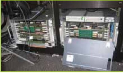
FURMAN PL-PLUS/SERIES-2 POWER CONDITIONER