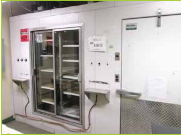
CONCESSION STAND LOT: ( 1 ) CONCESSION BEVERAGE STAND. CONSISTING OF: KOLPAK # ADT1040U WALK IN FREEZER APPROX. 13'8"W X 'D X 8'H , 115VOLTS, 4.2AMPS, 1PHASE. WITH BUILT IN SIDE COOLER & 10 SHELF UNIT & BEER TAP INSTALLED AND WITH ( 1 ) SMALL SINK & COUNTER TABLE