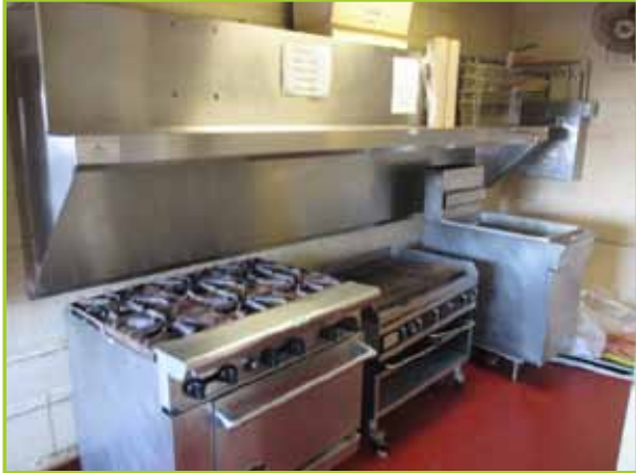
CONCESSION STAND LOT: ( 1 ) CONCESSION BEVERAGE STAND. CONSISTING OF: KOLPAK # ADT1040U WALK IN FREEZER APPROX. 13'8"W X 'D X 8'H , 115VOLTS, 4.2AMPS, 1PHASE. WITH BUILT IN SIDE COOLER & 10 SHELF UNIT & BEER TAP INSTALLED AND WITH ( 1 ) SMALL SINK & COUNTER TABLE