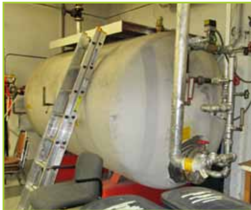
PUMP CRANE CO, CHEMPUMP DIV GB-3K-1S PUMP