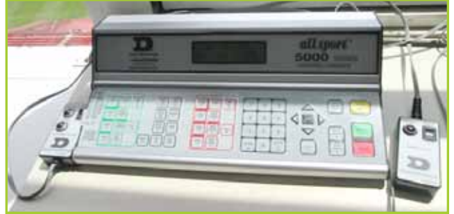
DAKTRONICS ALL SPORT 5000 SERIES CONTROL CONSOLE