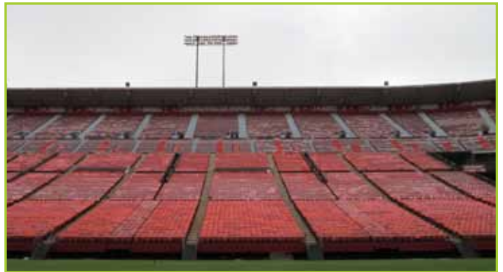
SPORT STADIUM FOLD-OUT SEATING PLATFORMS (SEATS NOT INCLUDED) (PULLEY-CABLE/HYDRAULIC-DRIVE OPERATED). [QTY-4 STEEL PLATFORM STRUCTURES; EACH PLATFORM APPROX 145'L X60"W MOUNTED ON BAR-TYPE FRAMEWORK; EACH OF THE 4 SECTIONS WITH CABLE-PULLEY/HYDRAULIC SUPPORT EQUIPMENT]