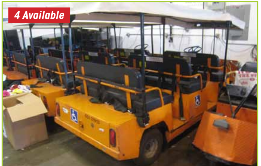
TAYLOR-DUNN BT-80 ELECTRIC, 6-PERSON, UTILITY VEHICLE/CART (3000-LBS CAPACITY)