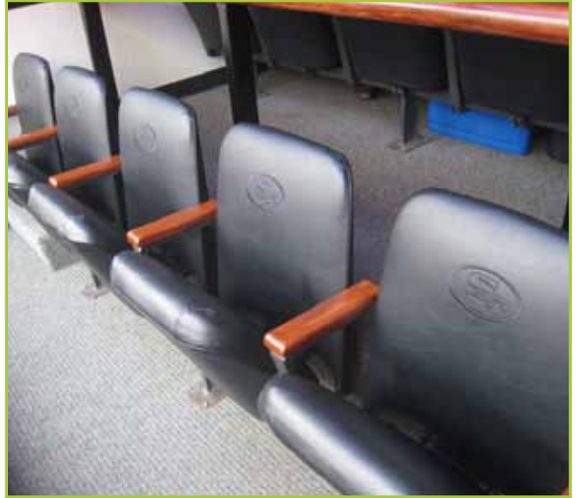
ASSORTED LUXURY SUITES FURNITURE INCLUDING CLOTH PADDED CHAIRS, BLACK METAL FRAMED STOOLS, COAT RACKS, ICE MACHINES & SMALL REFRIGERATORS, WALL LIGHTS, OVAL 1" ROUND STAINLESS STEEL SINKS