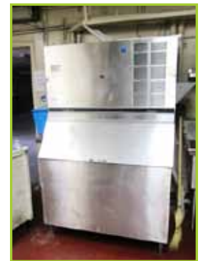
CONCESSION STAND LOT: ( 8 PCS ) CONCESSION STAND, FOOD & BEVERAGE: CONSISTING OF: ( 1 ) TRAUlsen # 020010 2 DOOR STAINLESS STEEL REFRIGERATOR / FREEZER, 115VOLTS 60HZ ; ( 1 ) TRUE # QT-45 DELI STYLE 2 GLASS SLIDE DOOR COOLER; ( 1 ) TRUE # G10010 SINGLE DOOR REFRIGERATOR / FREEZER; ( 2 ) TURBOTAP-STYLE BEER DISPENSE STATIONS, 2 & 1 TURBO TAP PER STATION, NO TAP HEADS OR HANDLES; ( 1 ) SMALL SINK; ( 1 ) TOPPO HOOD; ( 1 ) RACK