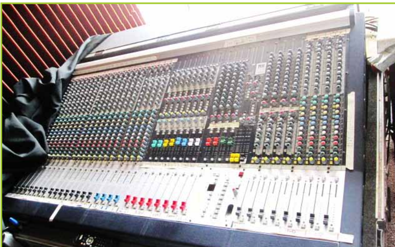
SOUNDCRAFT MH3 SOUND MIXING CONSOLE (MOUNTED IN CARGO/FLIGHT CASE). WITH (QTY-2 SOUNDCRAFT CPS-800 POWER SUPPLIES

LOT: ( 17 ) ASSORTED A /V EQUIPMENT CONSISTING OF: ( 1 ) PANASONIC # WJ-225R VIDEO SWITCH, SOCKET PLUS MULTIABLE OUTLET STRIP, ( 1 ) TEKTRONIX TSD-200 NTSC GENERATOR, ( 1 ) GRASS VALLY GROUP # 9505 SOURCE SYNCHONIZING GENERAOTOR, CISCO # CATALYST XL 3500 24 PORT NETWORK SWITCH, ( 1 ) AXIS COMMUNICATION # 291 1U VIDEO RACK MOUNT MONITORS, ( 2 ) 2 SET OF SONY # BM5310 ( 3 ) VIDEO RACK MOUNT MONITORS, ( 1 ) SONY # HR 14" RACK MOUNT MONITOR, ( 1 ) SONY CCU-355 CAMERA CONTROL UNIT, ( 1 ) TEKTRONIX # 1740 WAVEFORM VECTOR MONITOR, ( 2 ) HEDCO # RCP-16X SERIES VIDEO ROUTER SWITCH, ( 1 ) LEITCH # 16 X 2 VIDEO ROUTER SWITCH, ( 1 ) ENSEMBLE DESIGNS # AVENUE SIGNAL INTERGRATION SYSTEM, WITH / ( 1 ) 5350 4 CHANNEL ADC /TBC MODULE BOARD, ( 5 ) 5130 SERIES DA MODULE BOARD, ( 1 ) GRASS VALLY GROUP # 2RU ( 3 ) DISTRABUTION AMALIFIER, WITH / ( 9 ) 8501 MODULE, ( 3 ) 8503 STEP 0.5 DB / DIR & ( 1 ) GRAIN 8502 / 8302 FQ MODULE, ( 1 ) 8520 GRAIN, ( 2 ) MINI BLOX'S, WITH / ( 1 ) A/V COMPOINET CABINET, 19" BY 7" TALL