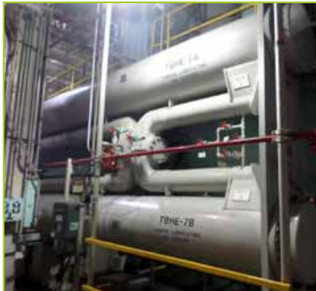
TURBINE LUBRICATING OIL COOLER HOLTEC INTERNATIONAL TURBINE LUBRICATING OIL COOLER FOR TUBE BUNDLES, HEAT EXCHANGERS WITH NEW HEADS AND NEW COILS