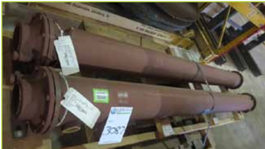
HEAT EXCHANGER API HEAT TRANSFER 1503-06-078-001 LOT CONTAINS 2 HEAT EXCHANGERS, BASCO, SPECIAL TYPE 500, 1 PASS ASSEMBLY, 3/8" TUBES, 3" SPA, DATE OF MFG. 6/2011