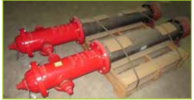
FIRE HYDRANT CLOW CORP 2545 LOT CONTAINS 2 FIRE HYDRANT: ASSEMBLY, UL/FM APPROVED, CLOW MEDALLION 2545, 5 1/4" WITH 4'6" BURY