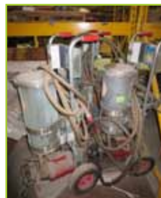
FILTER SYSTEM HARVARD CORPORATION 87T LOT CONTAINS 3 FILTER SYSTEMS