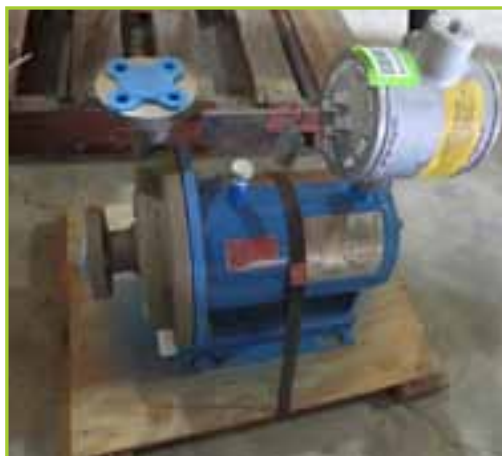
PUMP CRANE CO, CHEMPUMP DIV GB-3K-1S PUMP