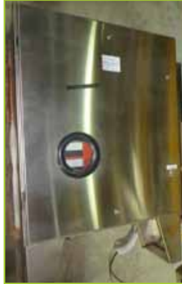
RECTIFIER INTEGRATED RECTIFIER TECH ADASET12100BLPC13W RECTIFIER, ASSEMBLY, CATHODIC PROTECTION, AIR COOLED, 480V, 60 HZ, 3 PH AC INPUT