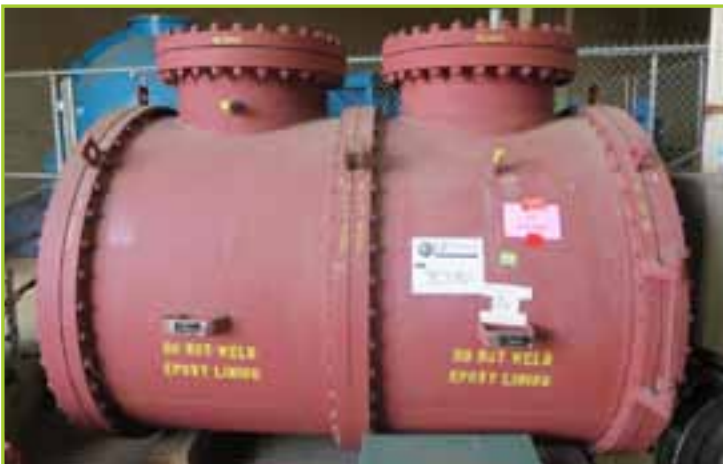
HEAT EXCHANGER YUBA HEAT TRANSFER DIV INLET CHANNEL HEAD, HEAT EXCHANGER, TYPE AEL