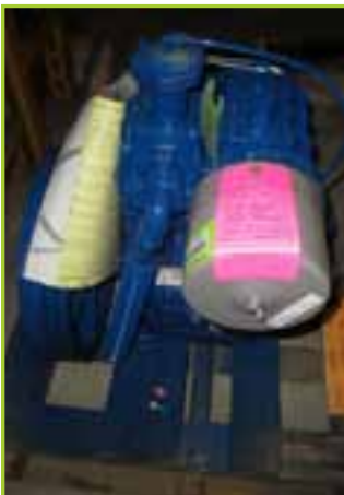
QUINCY 325L AIR COMPRESSOR