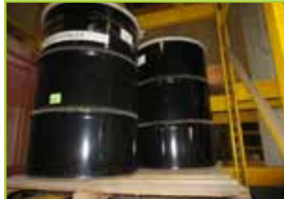
HOSE 2 BARRELS OF HOSE, DRAIN, 600 FT, BLUE LAY FLAT, OP-209B SECONDARY DRAIN DOWN.