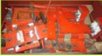
LIFTING WESTINGHOUSE BYDESCRIPTION LIFTING DEVICES TBTG-1