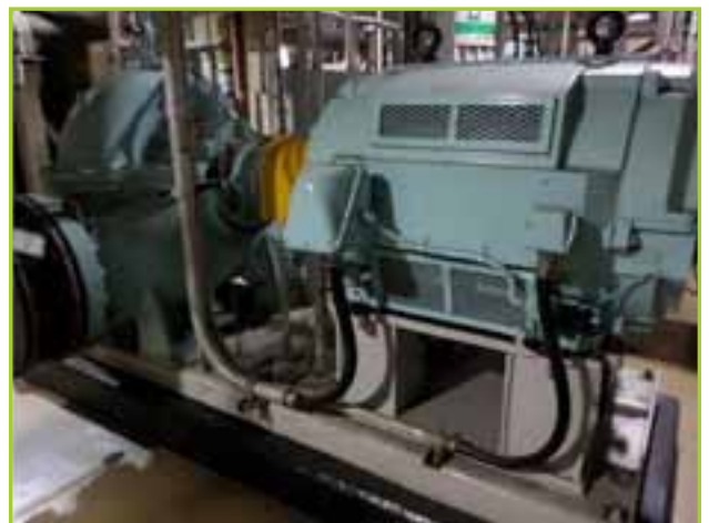
PUMP SKID INGERSOL RAND LOT TO INCLUDE (2) 600 HP RELIANCE ELECTRIC MOTORS, 5808S FRAME, 1192 RPM, 4000V, WEIGHING APPROX. 5100 LBS. EACH, SCP 1A AND 1B, SECONDARY COOLING UNITS