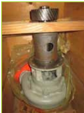
WATER PUMP COLT IND. P/N-16602931