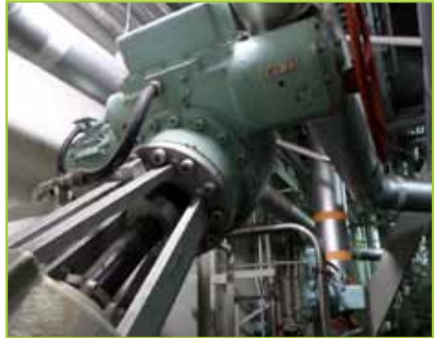
LITTORQUE SMB-5 LOT TO INCLUDE (2) MOTOR OPERATORS, FWV-22 AND 23 SMB-5, EL 119