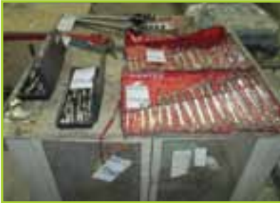
LOT TO INCLUDE (1) CART W/ ASSORTED HAND TOOLS