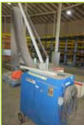
SMOG-HOG PIONEER STANDARD ELECTRON 515156-1187 INDUSTRIAL AIR CLEANER