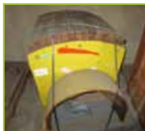
WESTINGHOUSE FIXTURE, TURBINE RIGGING