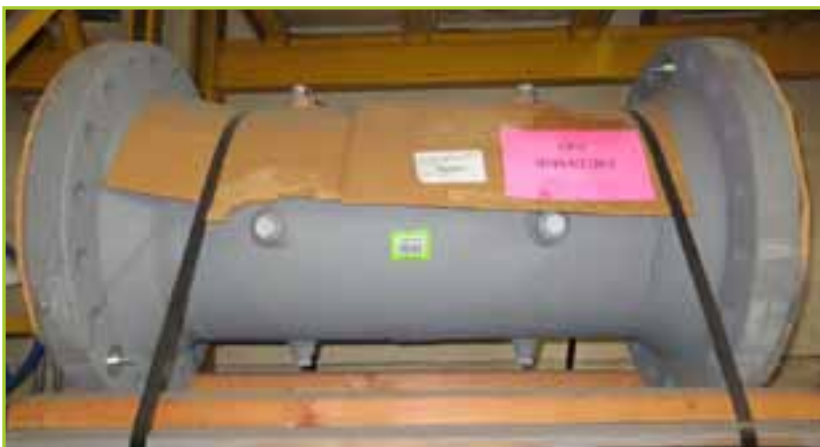
VANE FLUIDIC TECHNIQUES INC VANE, STRAIGHTENING, SPOOL PIECE, FLANGED BOTH ENDS, 16 IN, 300 LB, ASTM A106