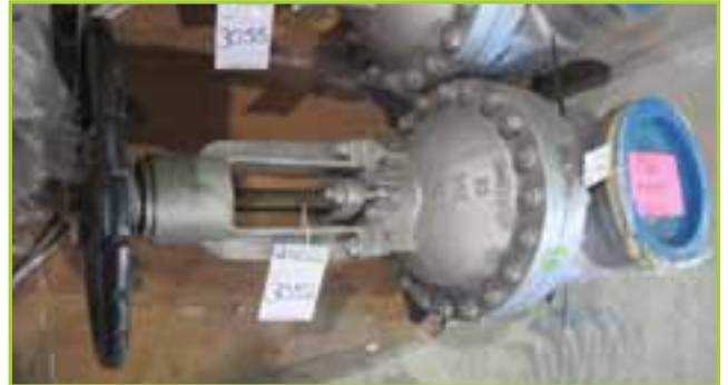
GATE VALVE WILLIAMS 30W-2 C5 60 (12") GATE VALVE, FLEXIBLE WEDGE, 12 IN, BUTT WELD, SCHEDULE 40, ANSI CLASS 300, CHROME-MOLY, ASTM A217, GR C5, TRIM 8, MANUAL, OS&Y