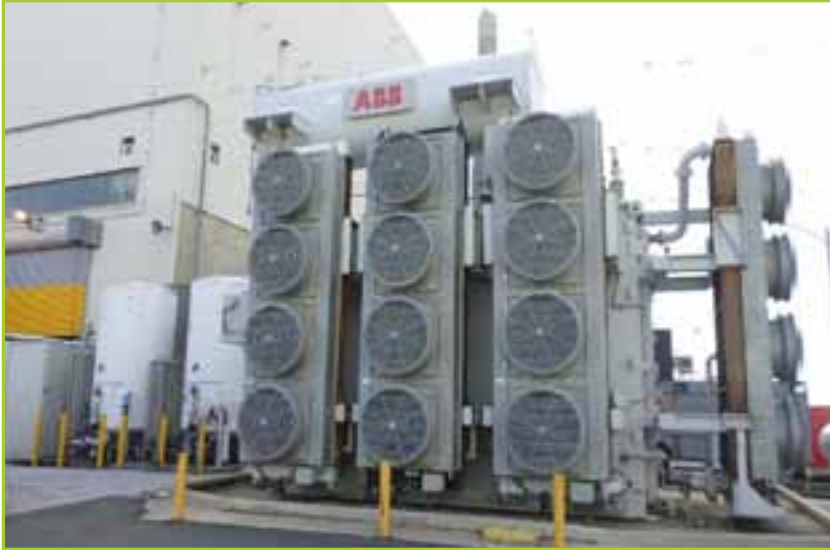
ABB TRANSFORMER ABB 400 MVA GSU STATION TRANSFORMER, SINGLE PHASE, 60 HZ, OIL IMMERSED OFAF, 500KV-21KV, DWG XV12165004-D, YEAR BUILT 2007, SHIPPING MASS 400,000 LBS