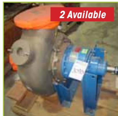
PUMP WEMCO F10K-SS PUMP, COMPLETE ASSEMBLY, 10 X 10 WEIR / HIDROSTAL F10K-SS-F2W PUMP