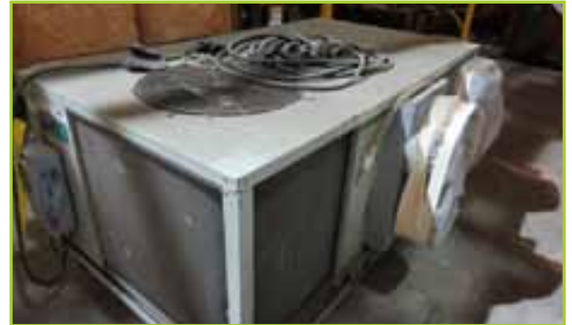
PORTABLE AC UNIT TRANE TCH060C400BC, SELF CONTAINED, 5 TON, 460 VOLT