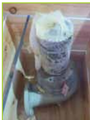
FAIRBANKS MORSE 16 602 931 PUMP