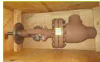
VALVE CRANE-ALOYCO INC CA00705 VALVE, AC 3"600 180-1/2U.A216 WCB BODY, BWE