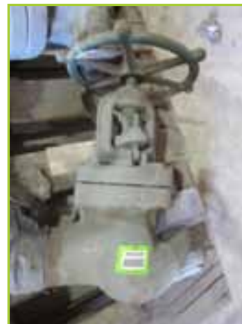
ROCKWELL LOT, 5 CARBON STEEL VALVES