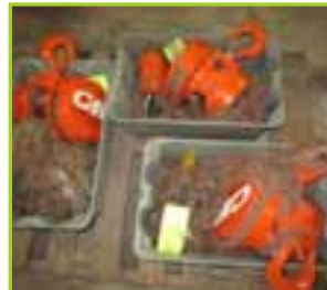
CHAIN HOIST CM HOIST 646-4627 LOT CONTAINS 3 CHAIN HOIST, CM HOIST SERIES 646, 3 TON, 20' LIFT, WITH LOCKING FINGER ON HOOK