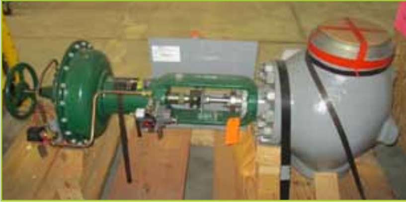
VALVE ASSEMBLY FISHER VALVE ASSEMBLY, 3 WAY, 3 IN, BW, SCH 40, ANSI CL 150, SA351, GR CF8M, TYPE 667, SIZE 60 PNEUMATIC ACTUATOR, ONE 3 IN INLET, TWO 3 IN OUTLETS