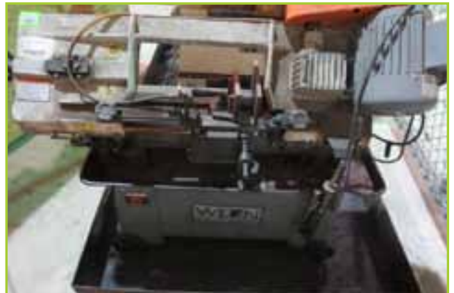
HORIZONTAL BAND SAW WILTON 3410 HORIZONTAL BAND SAW 8/12