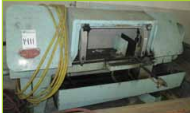
KALAMAZOO 13AW HORIZONTAL BANDSAW 13" ROUND CAP