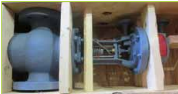
VALVE RUGGLES-KLINGEMANN MFG CO FIG K62526 VALVE, REGULATING, RELIEF / GOVERN, 4 IN, 300 LB, CS BODY, RUGGLES KLINGMANN FIG K80510