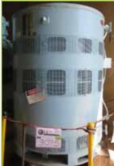
SQUIRREL CAGE INDUCTION MOTOR ELECTRIC MACHINERY HEAVY DUTY MOTOR, PUMP, 2000 HP, 3 PH, 4000V, 60 HZ, 1185 RPM, 5523V FRAME, CL B NS, 1.15 SF, 250 AMP