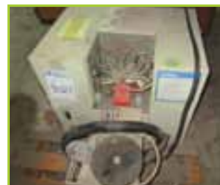
SPECTROMETER PERKIN-ELMER ZEEMAN 5000 SPECTROMETER