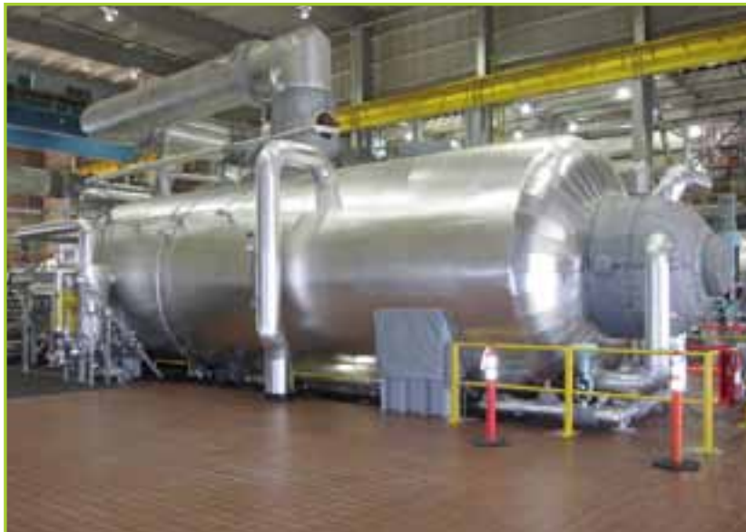
MOISTURE SEPARATOR REHEATER THERMAL ENGINEERING INTERNATIONAL LOT TO INCLUDE (4) 390-INCH BY 15-INCH MOISTURE SEPARATOR REHEATERS (MSRS)