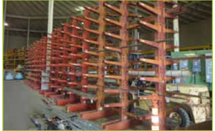
CANTILEVER RACKS LOT CONTAINS 14 CANTILEVER RACKS UPRIGHTS WITH 252- 24" ARMS & 48 CROSS MEMBERS