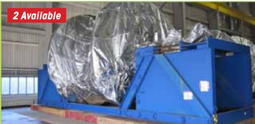
SIEMENS ROTARY AND STATIONARY BLADES, LOW PRESSURE TURBINE