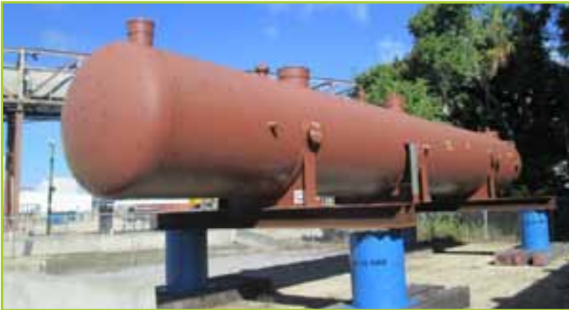
HEAT EXCHANGERS YUBA, SPX HEAT TRANSFER LOT TO INCLUDE (2) HEAT EXCHANGERS, TEST PRESSURE PSI SHELL 445, TUBES 650, TEST TEMPERATURE MIN DEGREE F SHELL 70, TUBES 70, CUSTOMER ITEM EH-5A, MFG. S/N 10-H-468-1A, FEEDWATER HEATERS