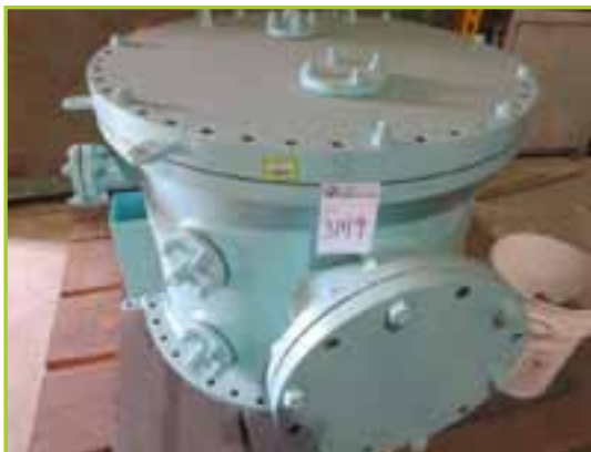
CHANNEL CAROLINA ENERGY SOLUTIONS CHANNEL, HEAT EXCHANGER, FRONT INLET/OUTLET