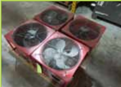
SMOKE EJECTOR NEWTONS FIRE & SAFETY EQU P164SE LOT CONTAINS 4 SMOKE EJECTORS, SUPER VAC, 110V, 16"