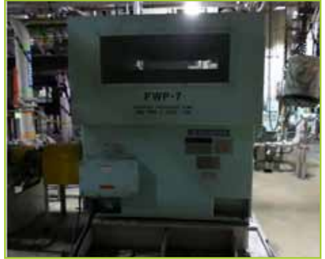
AUXILIARY FEEDWATER PUMP, 900 HP MOTOR, 3510 RPM, 4000V, 800 GPM AT 3300 TDH - TOTAL DESIGNED SPEED