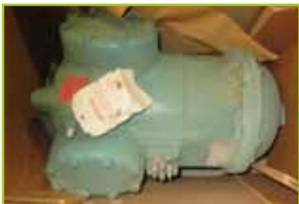
COMPRESSOR CARRIER CORP MDL06DM8186AC0600 LOT CONTAINS 2 COMPRESSORS