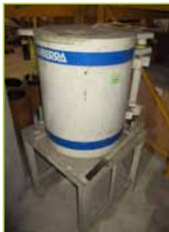
CANBERRA STORAGE MODULE