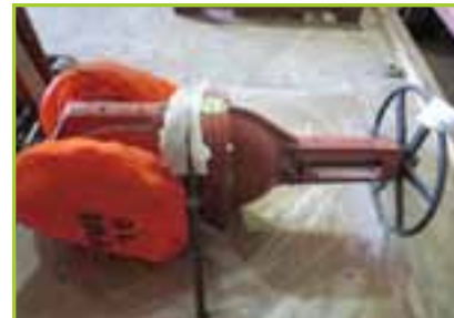
GATE VALVE CLOW CORP F6136 GATE VALVE, 10", 200 PSI WORKING PRESSURE, RESILIENT WEDGE OS&Y DESIGN. CI BODY FLGD ENDS