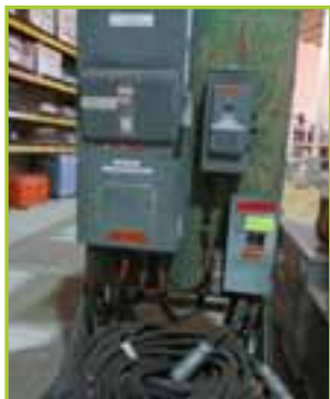
TEMPORARY POWER CART TEMPORARY POWER CART WITH 480V 600AMP 1 MAIN SWITCH, AND 6 DISCONNECTS