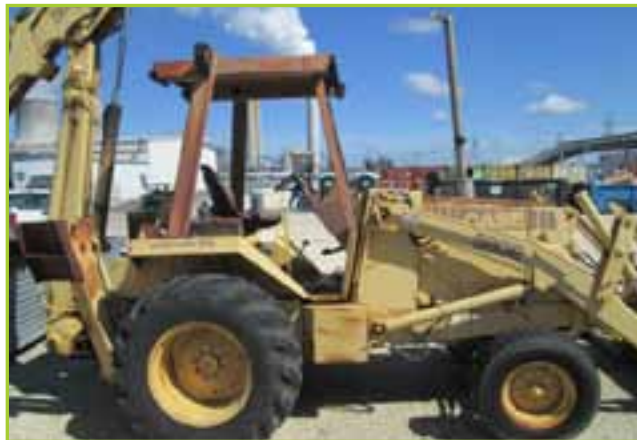
CASE 580 SUPER E BACKHOE, 580 SUPER E, 4,526 HOURS