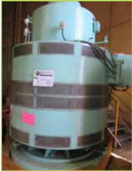
INDUCTION MOTOR GENERAL ELECTRIC 5KV85573446501 INDUCTION MOTOR, PUMP, 2500 HP, 3 PH, 4000V, 60 HZ, 1186 RPM, 8557P70 FRAME, WPII ENCLOSURE, CLASS F INSULATION, 1.15 SF, 315A, NEMA CODE F