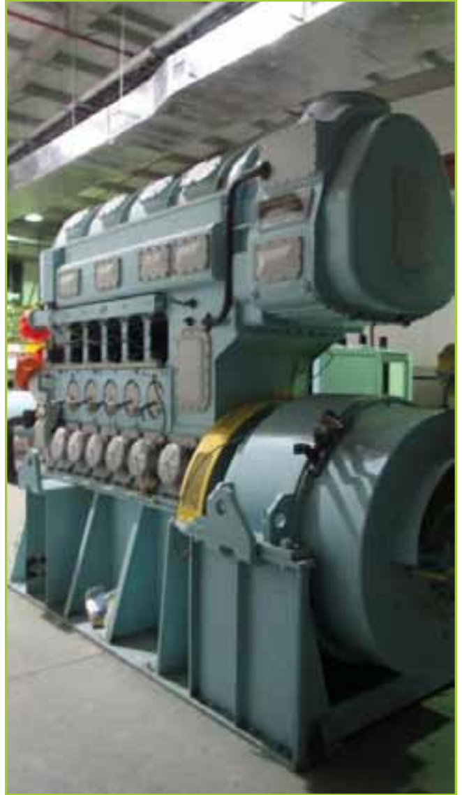
FAIRBANKS MORSE AND CO. 38 N-D8 1/8 DIESEL ENGINE BLOCK WITH GENERATOR, 713 HP, 720 RPM