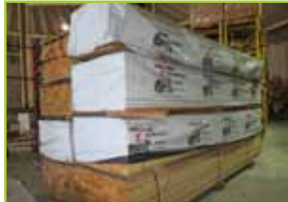
LUMBER LOT CONTAINS 10 BUNDLES OF LUMBER: (9 -BUNDLES 2 X 6 X 16' LUMBER), & ( 1-BUNDLE OF 2 X 4 X 16' LUMBER)