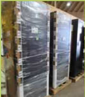
HOFFMAN ENC2178S LOT CONTAINS 3 NETWORK CABINETS