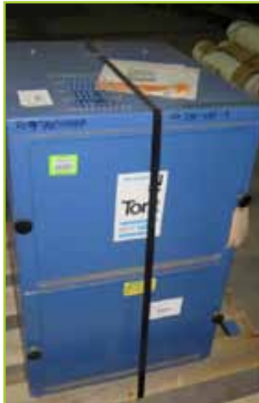
TORIT 64 DUST COLLECTOR, TORIT 3/4HP