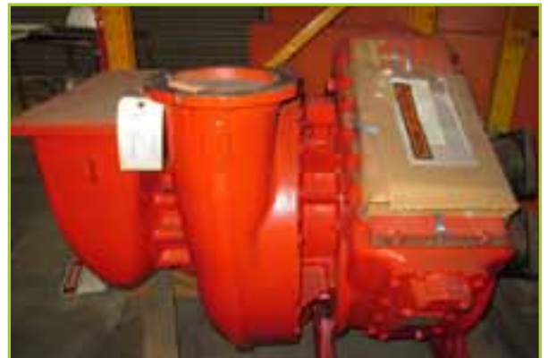
COLTEC IND. INC, ABB 16706850 TURBOCHARGER, ABB TURBO SYSTEMS LTD. TYPE VTC304-13, HZTL 428 765 P2