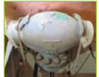
OPEN MARKET 4-MSR-V-145 SWING CHECK VALVE, A216WCB, BWE, DC 6"900 HIRA CS BWYR 1979