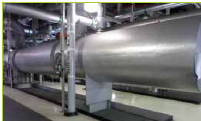
HEAT EXCHANGERS YUBA LOT TO INCLUDE (2) HEAT EXCHANGERS/ FEEDWATER HEATERS