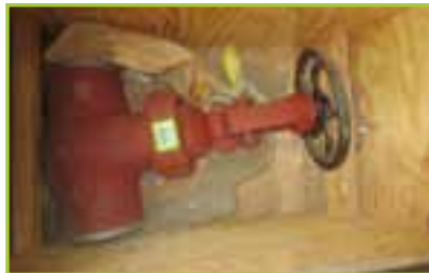
GATE VALVE CRANE-ALOYCO INC 47-1/2-XU-F VALVE, GATE 6"150 47-1/2XU-F .A216 WCB BODY, BWE