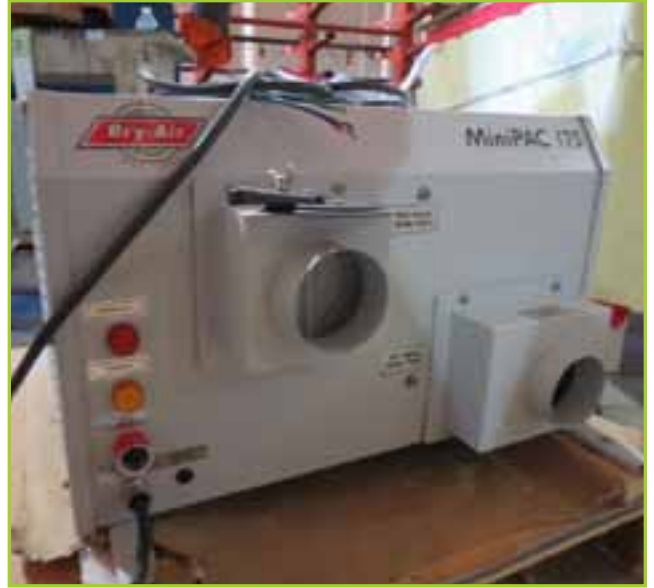
BRY-AIR MP-175 DEHUMIDIFIER, 175 CFM, 208-240V / 1PH / 60 HZ, 5.9 LB/HR, WITHOUT WEATHERPROOFING