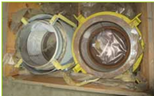
EXPANSION JOINT TEMP FLEX LOT CONTAINS 2 EXPANSION JOINTS, 12"