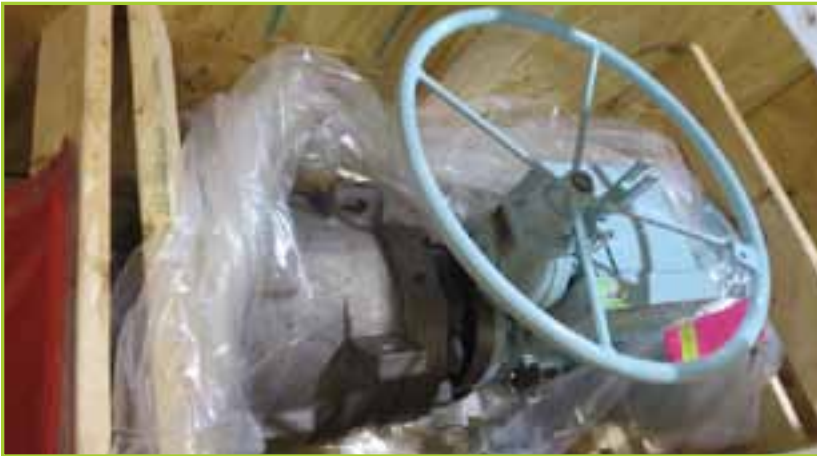
VALVE ASSEMBLY MASONELAN 88N-41445A VALVE ASSEMBLY , ANGLE, 8 IN SCH 80 INLET X 12 IN SCH 60 OUTLET, ASME SA-216, GRADE WCC, MFG. 2011