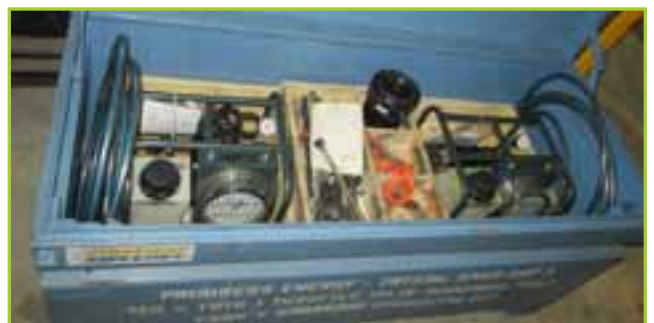
HYDRATIGHT SWEENEY PUMP WITH CASE , HYDRAULIC SYSTEM PUMP