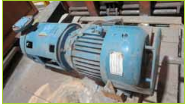
PUMP INGERSOLL-DRESSER PUMP PUMP, WITH 7.5 HP MOTOR, 3X1.5X6 VOC2 3600RPM.