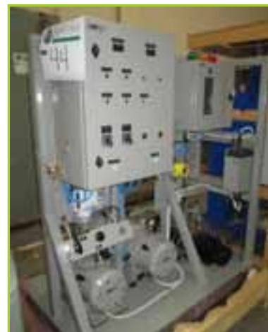
MGP INSTRUMENTS MONITORING SYSTEM SKID, (2) PUMPS, (2) 1/2 HP BALDOR MOTORS