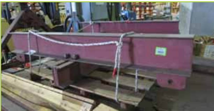
LIFTING RIG ASSEMBLY LIFTING RIG ASSEMBLY 10,000LB CAPACITY.