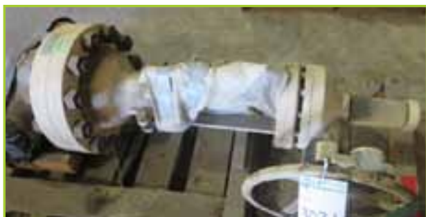
HIRATA VALVE CO. 4CSV-V-700 GATE VALVE, 6"900 HIRA BW HW, A216WCB BODY