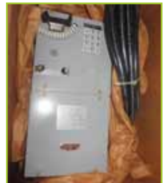
PHONE GAI-TRONICS 770-101-K91-020 LOT CONTAINS 4 PHONES WITH PORTABLE W/AMP SPEAKER, 3 IN ORIGINAL BOX