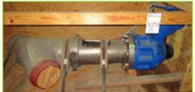
GLOBE ANGLE VALVE EDWARDS VALVE CO 735277 GLOBE ANGLE VALVE, 10 IN, BUTT WELD, CLASS 2, 2500 PSIG, SA351, GRADE CF8M, MANUAL, OS&Y, STANDARD OR FULL PORT, DATE OF MFG: 8/2011