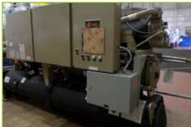
CHILLERSTRANE RTWD200F2A03 LOT TO INCLUDE (2) 200T HELICAL ROTARY CHILLERS, 460V, (2) PASS CONDENSER WITH 8" FLG CONN, (2) 18 X 18 ELASTOMERIC ISOLATION PADS