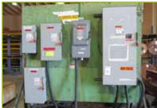
TEMPORARY POWER CART TEMPORARY POWER CART, TPBD-42, 1 MAIN SWITCH AND 9 DISCONNECTS