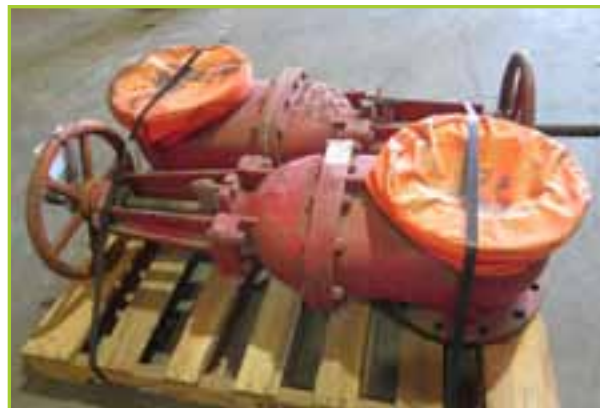
GATE VALVE M & H VALVE CO. LOT CONTAINS 2 GATE VALVES, 10"175 MH HW BB