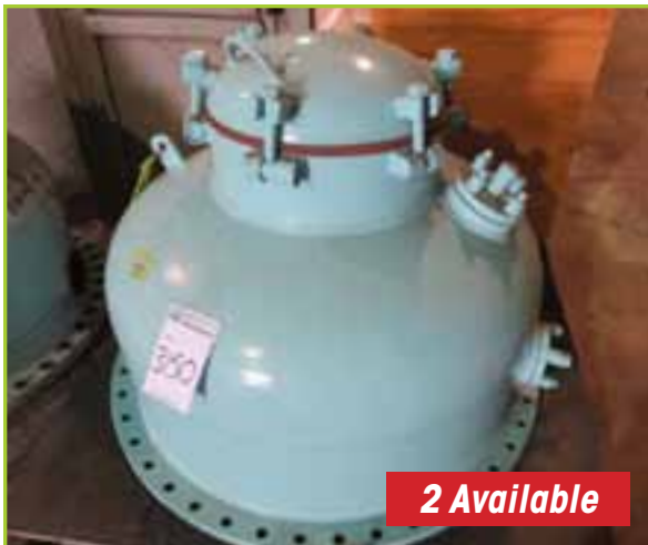
CHANNEL CAROLINA ENERGY SOLUTIONS CHANNEL, HEAT EXCHANGER, RETURN REAR ASSEMBLY, SERVICE WATER HEAT EXCHANGER MFG DATE 2011