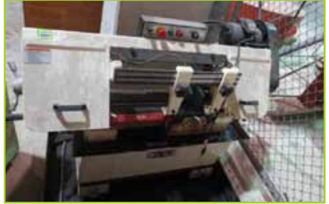
HORIZONTAL BAND SAW JET J7015 HORIZONTAL BAND SAW 1 1/2" HP MOTOR