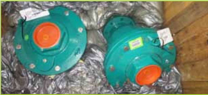
VALVE CRISPIN VALVE AL41 LOT CONTAINS 2 VALVES, COMPLETE, AIR & VACUUM SERVICE, 4"-125#, CAST IRON