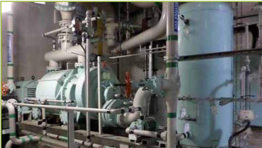
AIR REMOVAL SKID TO INCLUDE CONDENSER VACUUM PUMP AND MOTOR, 150 HP AND NASH 3004 VACUUM PUMP AND AIR HOLDING TANK