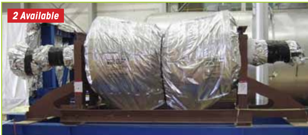
SIEMENS HIGH PRESSURE TURBINE EQUIPMENT: ROTORS, UPPER AND LOWER HP INNER CYLINDERS, UPPER AND LOWER HP GUIDE BLADE CARRIERS, ASSEMBLY HARDWARE, HP GLAND CASINGS, ASSEMBLY PARTS, INLET SEALS, THREADED RINGS AND TURBINE HARDWARE