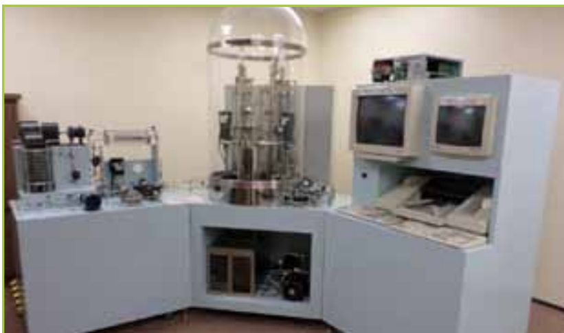
EOF TRAINING EQUIPMENT FLOW LOOP MODEL SIMULATOR OF REACTOR BUILDING WORKING COMPONENTS