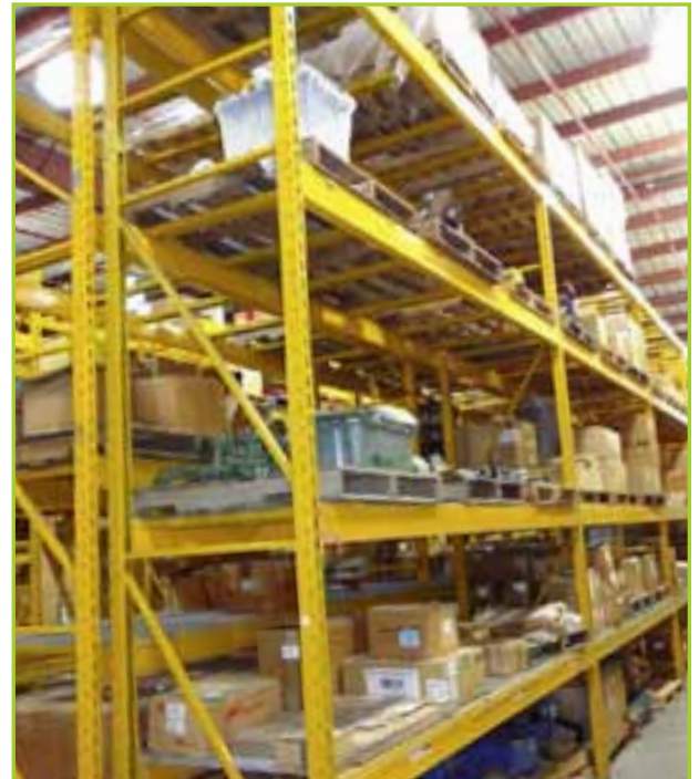
PALLET RACKING LOT CONTAINS 64 SECTIONS WITH MINIMUM 3 SHELVES EACH AND 1 SECTION 8FT WIDE WITH 4 SHELVES