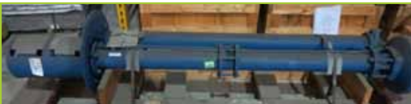
PEERLESS PUMP, SEPTIC SEWAGE VCS LLC4B