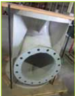
HEAD SULZER BINGHAM PUMP INC. 5110118 HEAD 75, DISCHARGE, FOR BW PUMP 18 X 34B TYPE VCM