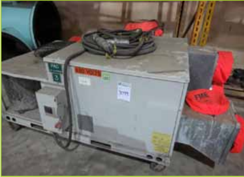
CARRIER 50TJ-006-601 PORTABLE AC UNIT, AIR CONDITIONER, SELF CONTAINED, 5 TON, 460 VOLT