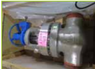
GATE VALVE ANCHOR DARLING 4002221 GATE VALVE, 10 IN, BUTT WELD, CLASS 2, 2500 PSIG, SA351, GRADE CF3M, MANUAL, OS&Y, STANDARD OR FULL PORT DATE OF MFG: 8/2011