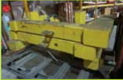
J HOOKS FOR D RING WALLS LOT CONTAINS 5 PALLETS CONTAINING (11) 'J' HOOKS FOR 'D' RING WALLS