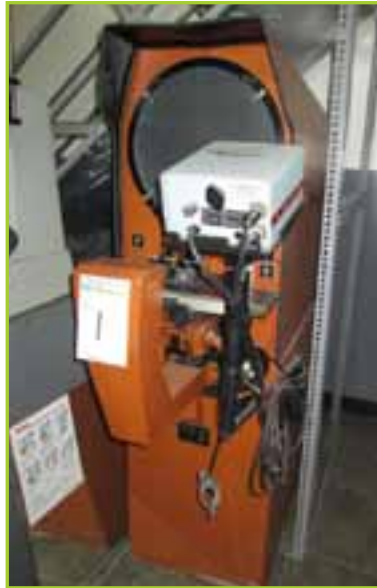
MICRO VU M14 OPTICAL COMPARATOR