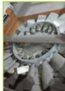
JOY MFG CO NPR 85766 LOT CONTAINS 2 BLADES