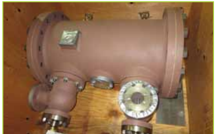
REGULATOR VALVE WESTINGHOUSE 90694 REGULATOR VALVE, P/N-4918D99G01 COMPLETE ASSEMBLY