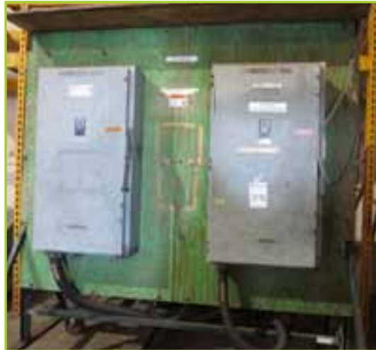
TEMPORARY POWER CART TEMPORARY POWER CART, TPBD-32, 3- 400AMP DISCONNECTS & 1 - 200AMP DISCONNECT