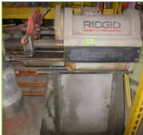
PIPE THREADER RIDIG 1224 ELECTRIC PIPE THREADER