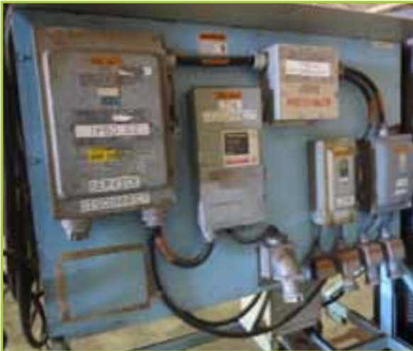
TEMPORARY POWER CART TEMPORARY POWER CART, TPBD-52, 1 MAIN SWITCH, 4 DISCONNECTS & TRANSFORMER