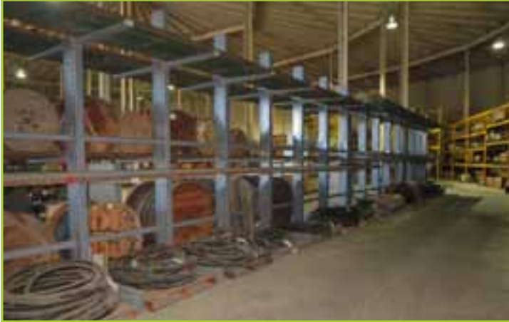
CANTILEVER RACKS LOT CONTAINS 18 CANTILEVER RACKS UPRIGHTS WITH 72 - 36" ARMS AND 48-CROSS MEMBERS