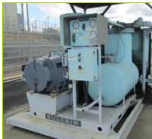
SULLAIR 32-25014 AIR COMPRESSOR SKID, MFG 1980, P/N 41503 WITH 250 HP MOTOR AND INTAKE STATION AIR COMPRESSOR TANK