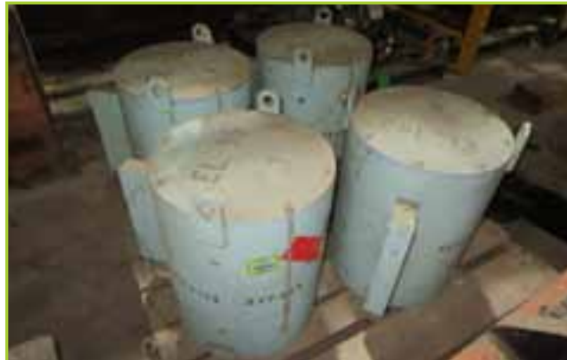
CASK LOT CONTAINS 4 CASKS, LEAD PASS EQUIPMENT