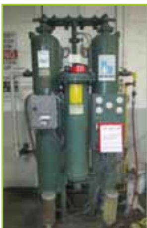
HANKISON 1915 BREATHING AIR PURIFIER