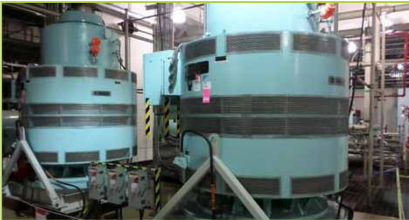
INDUCTION MOTORS GENERAL ELECTRIC 5KV85573446501 LOT TO INCLUDE (2) 2500 HP VERTICAL INDUCTION MOTORS TO INCLUDE MOBILE STANDS