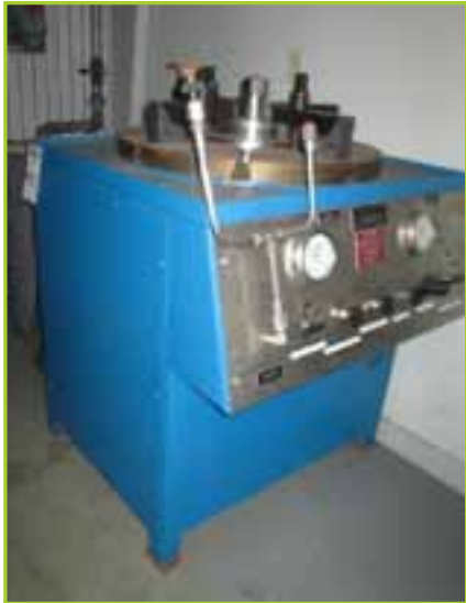
TYCO TB-3000-1 TYCO TB-3000-1 VALVE RESURFACING MACHINE WITH PRESSURE TESTING CAPABILITIES, SINGLE STATION TEST BENCH