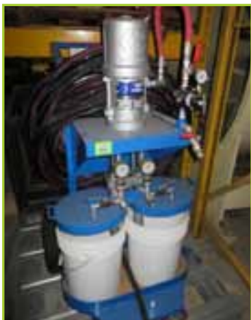
FLUID PUMP L12F 120 PSI MAX PRESSURE 1.5 PPM