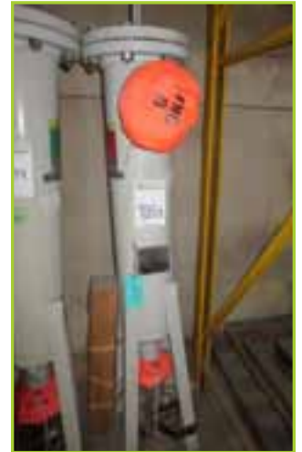
FILTER SYSTEM COMPONENTS CORP PCC112001HT49 LOT