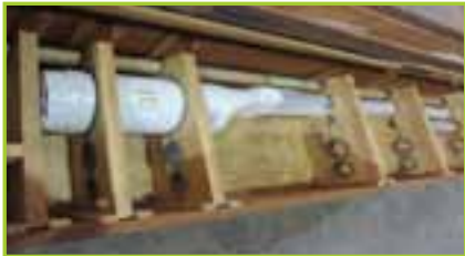
FLOW METERS RADECO LOT CONTAINS 5 FLOW METERS