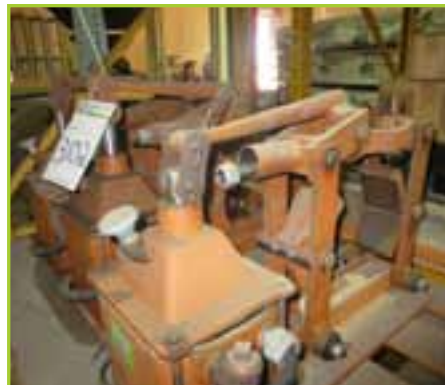
8" SESA BRAKE WHITING CORP 300482C LOT CONTAINS 4 BRAKES, 8" SESA BRAKE, W/SOLENOID