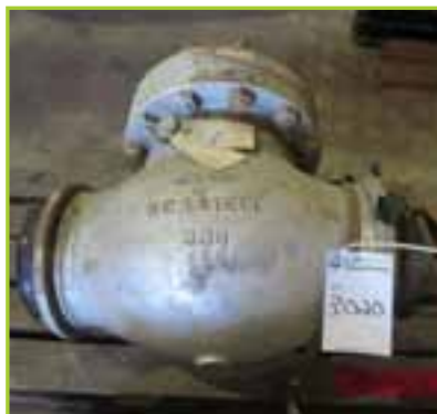
CRANE-ALOYCO INC 175-1/2X VALVE , DC 8"600 175-1/2X CS.