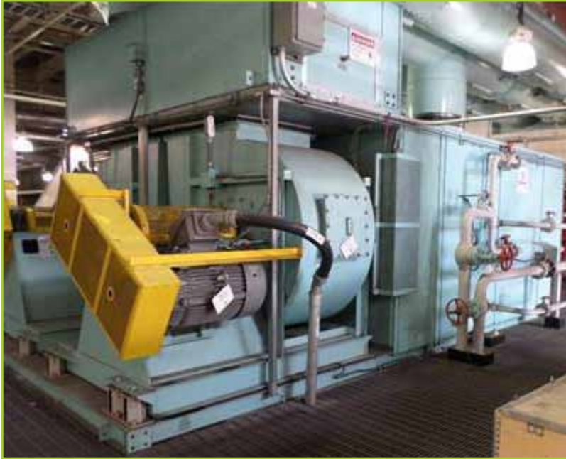
ISO PHASE BUSS DUCT COOLING SKID