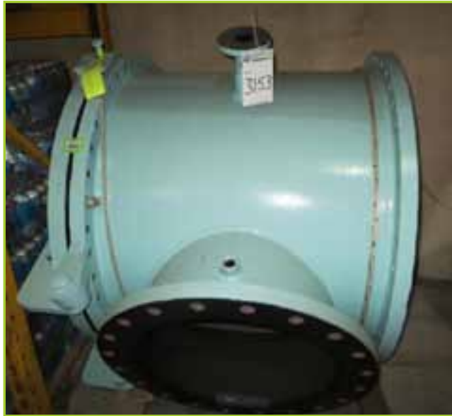
HEAD STODDARD HEAD, CHANNEL, INLET OR OUTLET, WITH HINGED COVER AND 12" INSPECTION PORT