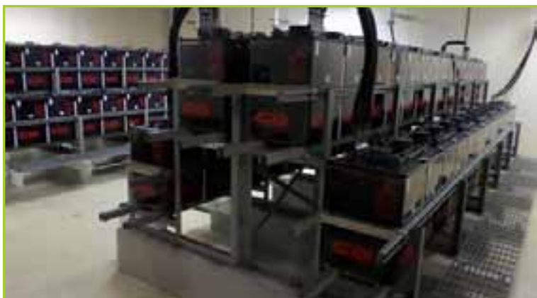
C+D BATTERIES LOT TO INCLUDE (116) C+D BATTERIES TO INCLUDE CHARGING STATION, 125V DC, 3 PH, 60 HZ, MODEL ARR130K300K