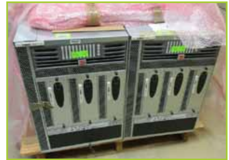
BROCADE 80020207610 SILKWORM 48000 FIBRE CHANNEL (2) SAN SWITCHES