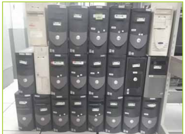
ASSORTED COMPUTER EQUIPMENT INCLUDING: DELL LOT (23) DESKTOP UNITS