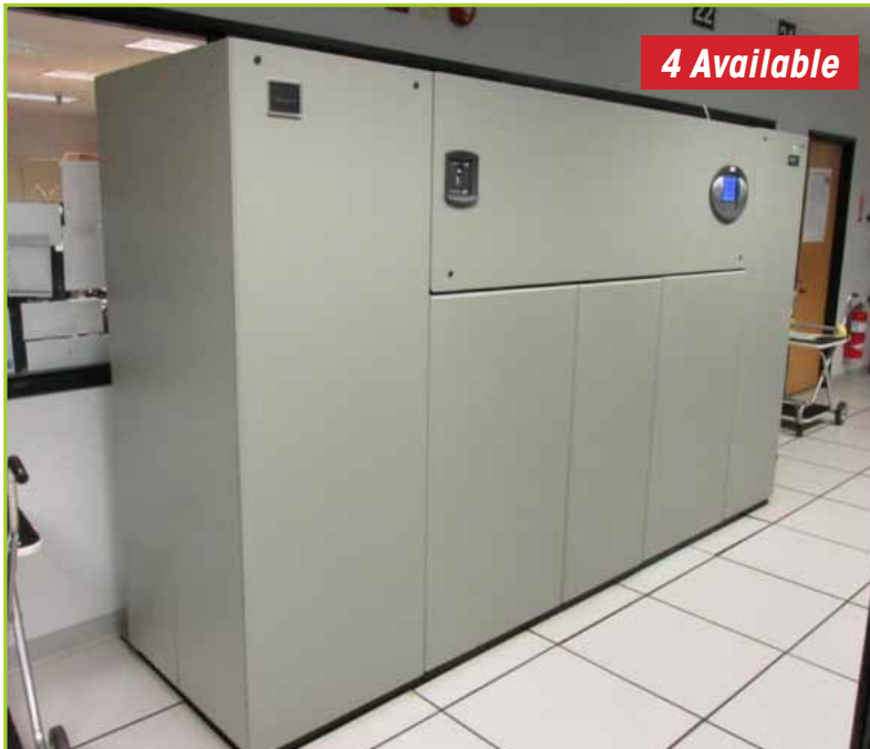
LIEBERT CRAC UNIT W/ CONDENSER