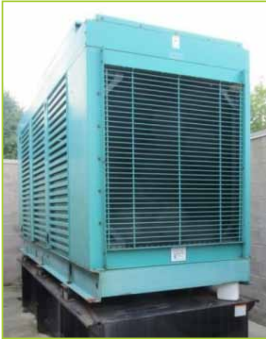
CUMMINS MODEL DFED-500 500KW BACKUP GENERATOR, IN SERVICE SINCE 1/19/02, 484.2 HOURS; 625 KVA; 60 HZ; DIESEL FUEL TANK INCLUDED

ROUTERS, FIREWALLS, CISCO & BROCADE SWITCHES, LAPTOPS, PRINTERS, CABLES, POWER SUPPLIES AND REDUNDANT POWER SYSTEMS, BLADE ENCLOSURES, BLADE SERVERS, PLUS MUCH MORE!