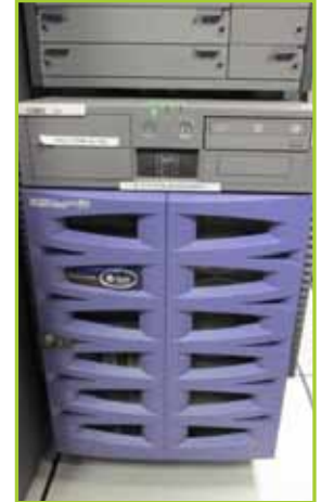
SUN MICROSYSTEMS SUN FIRE V890 SERVER