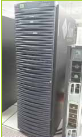
SUN MICROSYSTEMS SUNFIRE 6800 SERVER