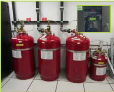
CHEMETRON FM200 FIRE SUPPRESSION SYSTEM