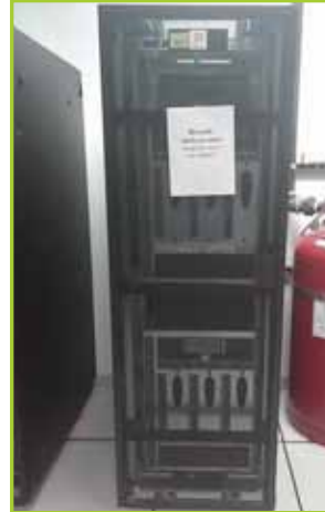
BROCADE SILKWORM 48000, FC512-3 SAN SWITCH