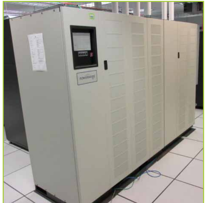
EATON/POWERWARE 9315-300 225 PWHR12390W4FR KVA300, KW240, UPS SYSTEM BATTERIES, 2 STRINGS, 10 TRAYS, 4 JARS