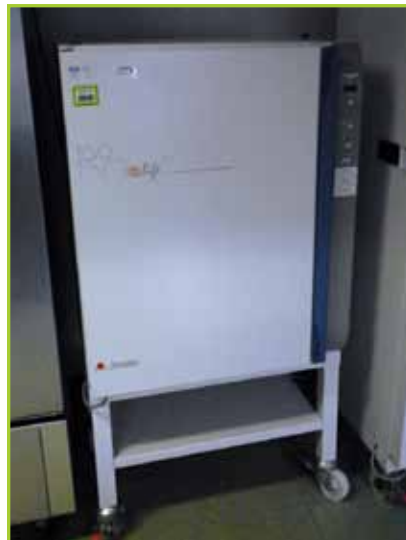
JOUAN I60 150 CELL LIFE SINGLE DOOR CO2 INCUBATOR