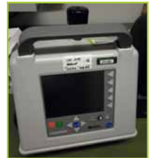
LASAIR III 310A PARTICLE MEASURING SYSTEM