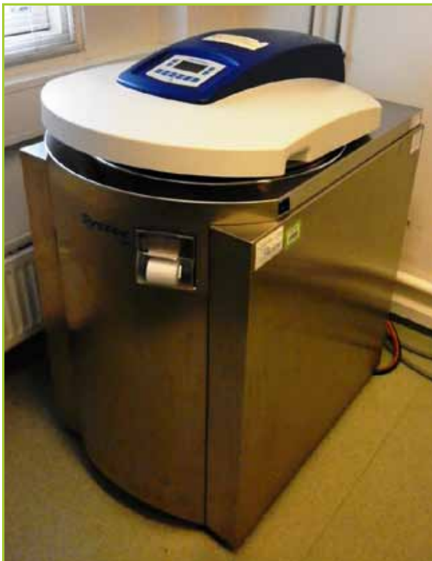
SYSTEC V-150 AUTOCLAVE MAX TEMPERATURE 150C, BASKET DIA 470MM, 3 PHASE WITH DIGITAL CONTROLS