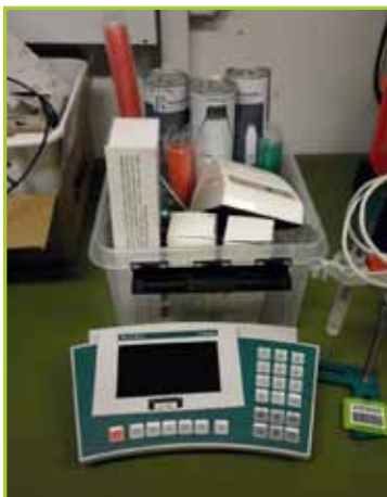
METROHM 780 DIGITAL PH METER WITH ASSOCIATED EQUIPMENT