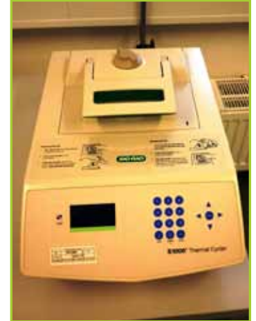
BIO-RAD S1000 THERMAL CYCLER PCR SYSTEM