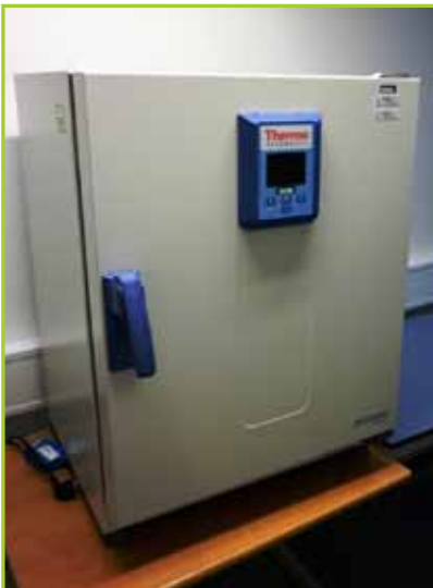
THERMO SCIENTIFIC HERATHERM 16S 1000 SINGLE DOOR COMPACT INCUBATOR