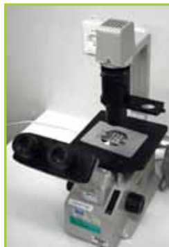
NIKON ECLIPSE 551 MICROSCOPE WITH 10X/0.25, 0.08 160/- LENSES