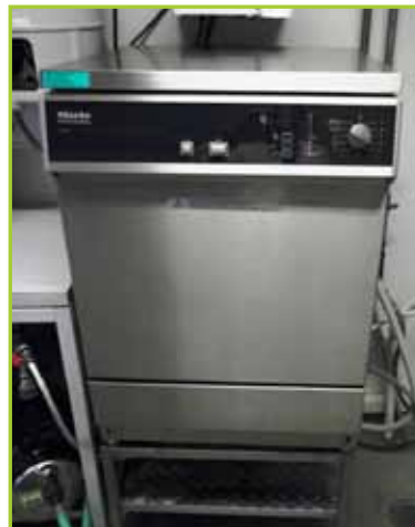
MIELE G7893 PROFESSIONAL LABORATORY WARE WASHER WITH 2 RACKS