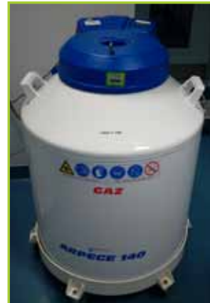
AIR LIQUIDE ARPEGE 140 MOBILE LIQUID NITROGEN CRYOVESSEL