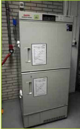
SANYO MDF-U537 2-DOOR BIOMEDICAL UPRIGHT FREEZER, 482L