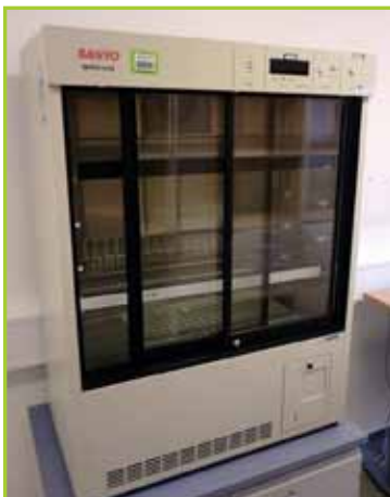
SANYO MPR-161D H GLAZED LAB REFRIGERATOR