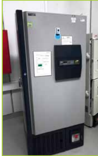
ILSHIN DF8517 C69 SINGLE DOOR UPRIGHT ULTRA LOW TEMPERATURE FREEZER