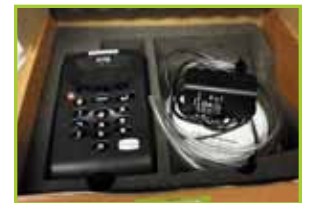
GEOTECH G100 CO2 RANGE ANALYSER