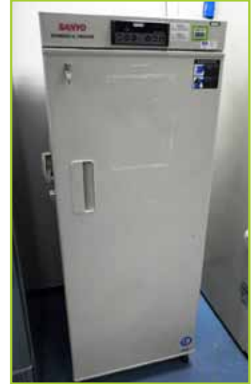
SANYO MDF-U333 MOBILE SINGLE DOOR UPRIGHT BIOMEDICAL FREEZER, 274L