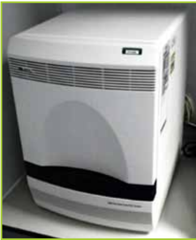
APPLIED BIOSYSTEMS 7500 FAST REAL-TIME PCR SYSTEM, YEAR 2010