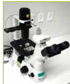
NIKON TMS-F MICROSCOPE WITH NIKON DIGITAL SIGHT D5-5M NET CAMERA