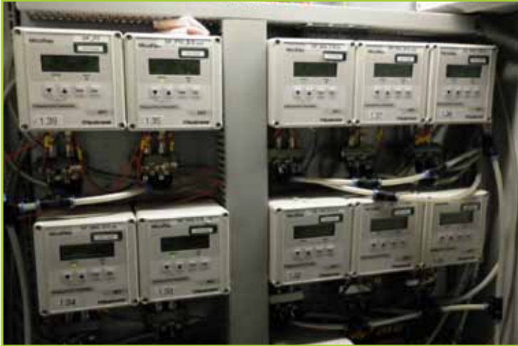
MICA FLEX MF-PFT (13) DIFFERENTIAL PRESSURE TRANSMITTERS IN CONTROL CABINET