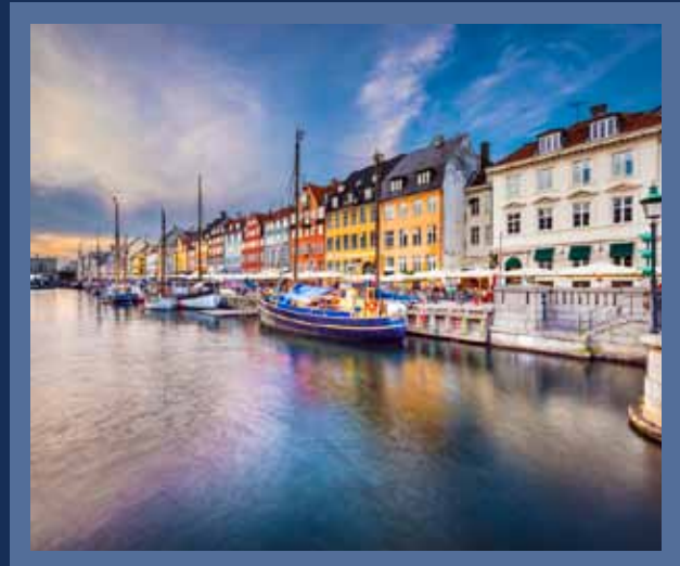
Scan this QR Code with your smartphone for More Information.

BioMerieux 43003-01 BacTAlert 3d MDS • Applied Biosystems 7500 PCF • BioRad Thermal Cycler S1000 TM • Systec V-150 Autoclave • AeroTrak 7510-01F Particle Sensors • Charles River Endosafe MCS Endotoxin Reader • Multiple Binder C-150 Inkubator CO2 • Spectramax MS Spectrophotometer • Microscopes • Freezers • Balances • Mixers • Shakers • Pipettes • Air Samples • Dish Washers • Label Printers • Bio Safety Cabinets • Fume Hoods • Vacuum Pumps • & Much More!