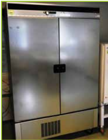
MEMMERT ICP 800 2 DOOR MOBILE COOLED INCUBATOR