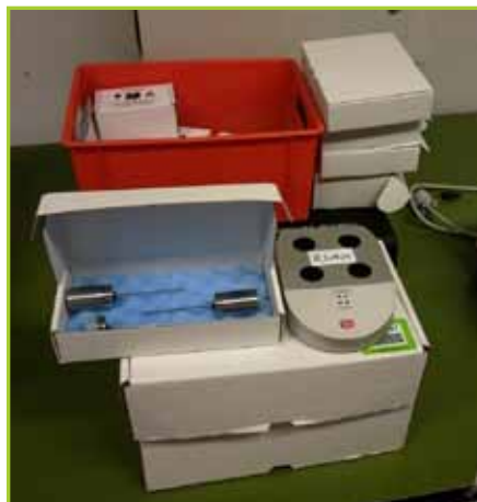
ELLAB TRACKSENSE PRO COMPLETE WITH 23 PROBES, 3 DOCKING STATIONS AND BATTERIES