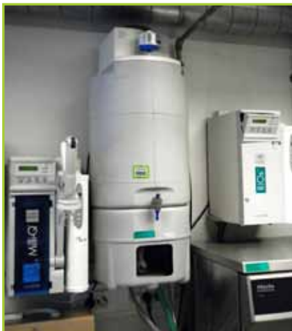
MILLIPORE WITH MILLI Q ACADEMIC UNIT, RIOS UNIT AND SANITISATION UNIT