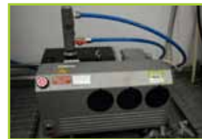
RIETSCHLE VC 50 MOTORISED VACUUM PUMP