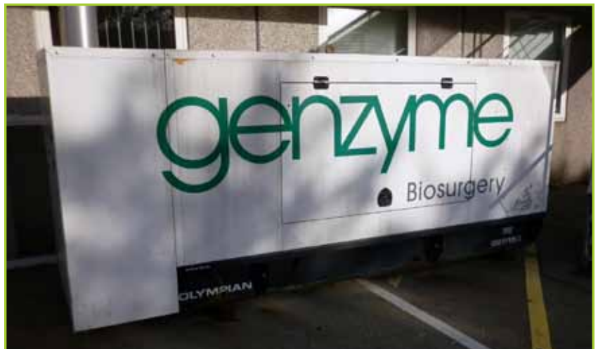
CATERPILLAR OLYMPIAN GEP 150 RECORDED HOURS 22.7, 1500RPM 50HZ WITH PERKINS TYPE 2332/1800 6 CYLINDER DIESEL ENGINE AND POWER WIZARD 1.0 CONTROLS