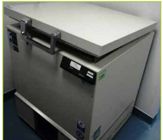
SANYO MDF-192 MOBILE CHEST FREEZER, -80C, EFFECTIVE CAPACITY 86L