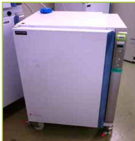
THERMO ELECTRON JOUAN IGO 150 CELL LIFE INCUBATOR