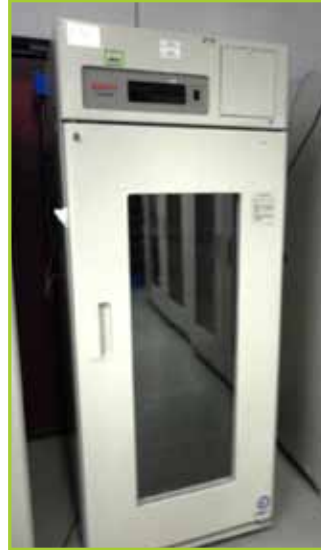
SANYO MPR-721 LABCOOL SINGLE DOOR UPRIGHT REFRIGERATOR, 684L