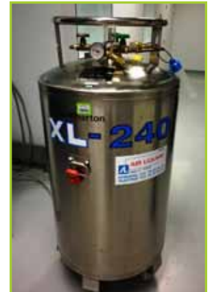
TAYLOR WHARTON LIQUID NITROGEN STORAGE TANK, 250L