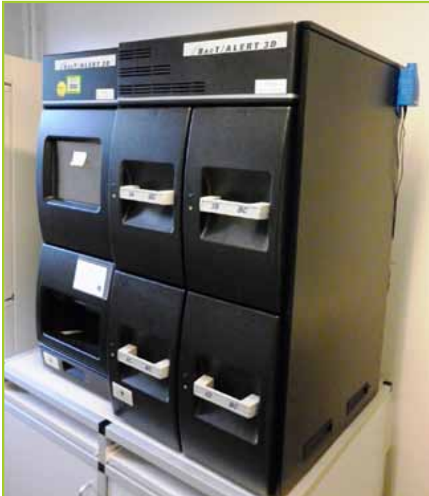
BIOMERIEUX BACT/ALERT 3D MICROBIAL ANALYSING SYSTEM WITH 4 COMPARTMENT INCUBATION MODULE, CONTROL MODULE, REFLECTIVE STANDARDS A/B (EXPIRATION DATE 30 MAY 2015), INSTRUCTION MANUALS, LEXMARK PRINTER, SMART 1500 UPS