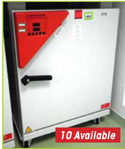
BINDER C150 SINGLE DOOR CO2 INCUBATOR 190C/374F, WITH DIGITAL CONTROLS