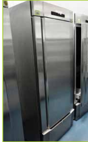
GRAM BIOMIDI 625 SINGLE DOOR MOBILE UPRIGHT REFRIGERATOR