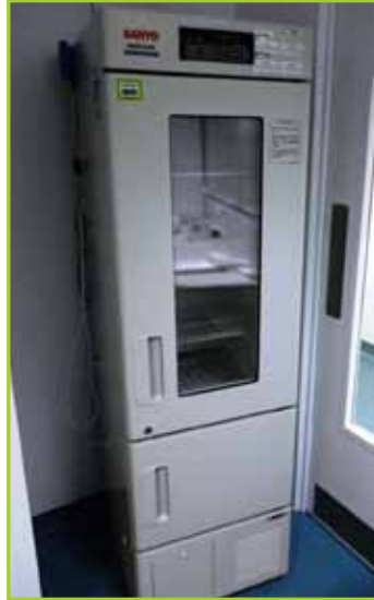
SANYO MPR-215F MEDICOOL FRIDGE 176L/ FREEZER 39L