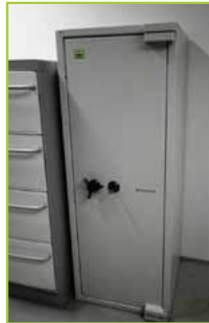
ROSENGRENS SINGLE DOOR BENT STEEL SAFE, 650 X 630 X 1750MM