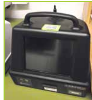
LASAIR III 310C PARTICLE MEASURING SYSTEM