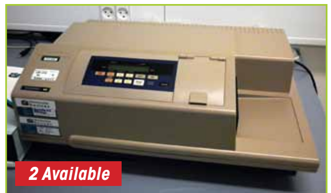
MOLECULAR DEVICES SPECTRAMAX M5 MULTI MODE MICROPLATE READER