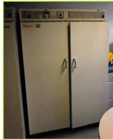
THERMO SCIENTIFIC B760 70C WITH TOP MOUNTED CONTROL