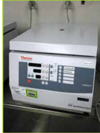
JOUAN B41 BENCH TYPE MULTI FUNCTION CENTRIFUGE, MAX LOAD 2KG AT 4000RPM