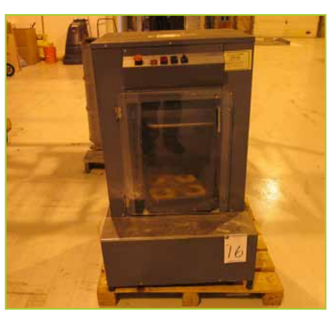
SCOTT EQUIPMENT CO. SHRM384 RIBBON BLENDER WITH HARD WIRED ELECTRIC MOTOR AND SHAFT MOUNTED SPEED REDUCER