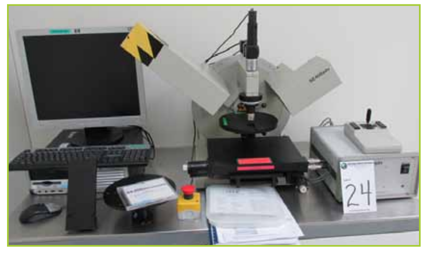
SENTECH SE400ADV ELLIPSOMETER W/ SE400 ADVANCE SOFTWARE