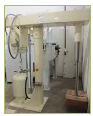
ROSS HSD-30 HIGH SPEED DISPENSER