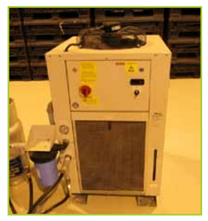
KOOLANT KOOLERS SV2000-W CHILLER, YEAR: 2010