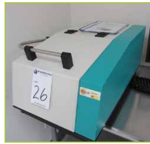
SUNLAB SCRA109001 CORESCANNER