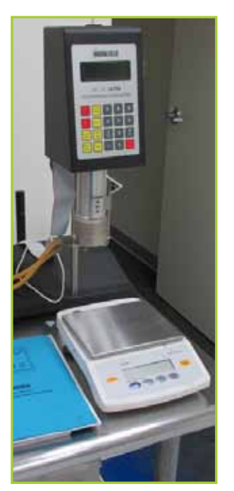
BROOKFIELD RVDV-III ULTRA RHEOMETER/ VISCOMETER W/ CIRCULATING BATH