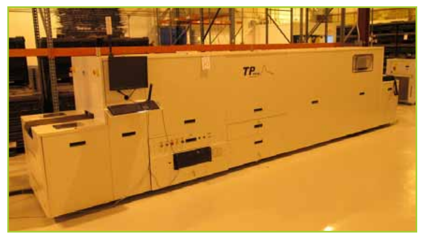
TP SOLAR D-225L INFRARED FURNACE, 480V 3 WIRE/NEUTRAL/GROUND, 50/60 HZ, 85 KW, 101 AMPS, 75 PSI, 19 LPM@ 4 BAR, 1500 SCFH, PROCESS EXHAUST 350 SCFH, CABINET EXHAUST 500 SCHF, 10" X 238" WIRE CONVEYOR. SN# 2011189. YEAR: 2010