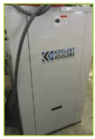
KOOLANT KOOLERS SV5000-S CHILLER