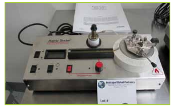
ERDCO RT-1 RAPID TESTER, 120V, 60HZ