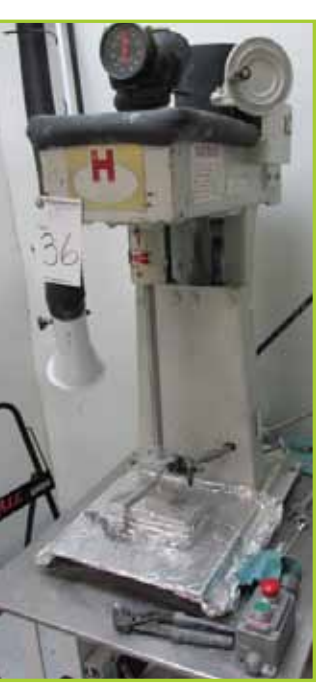
HOCKMEYER 2L SHEAR MIXER