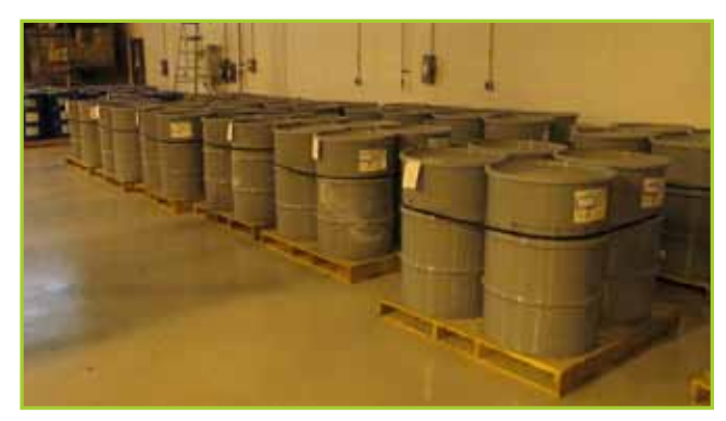
BULK SALE OF RAW MATERIALS AND PIPING INCLUDING: SPHERICAL ALUMINUM PASTE, GLASS FRIT, REAGENTS, ETC.