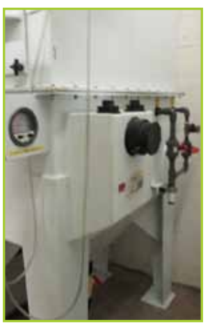
TRI-MER 18H SCRUBBER SYSTEM