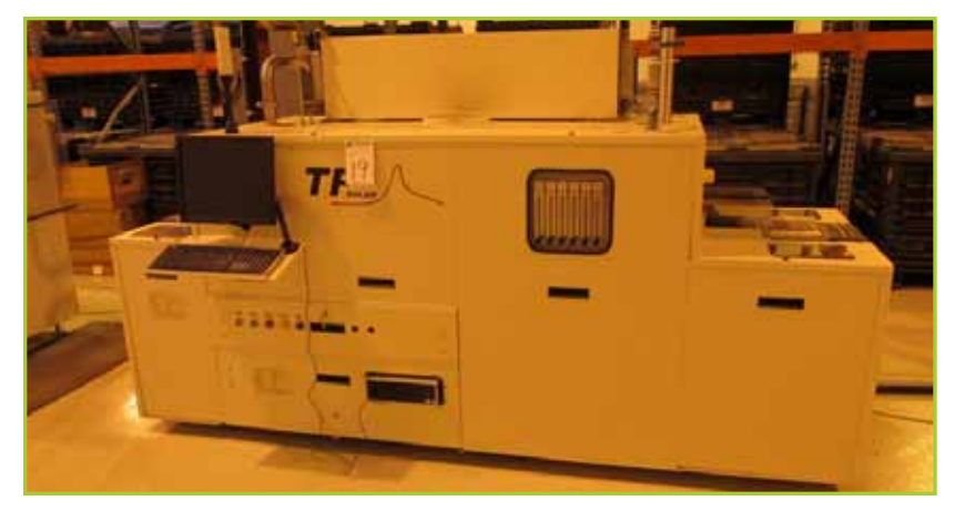
TP SOLAR D-225 INFRARED FURNACE, 480V 3 WIRE/NEUTRAL/GROUND, 50/60 HZ, 40 KW, 75 PSI, PROCESS EXHAUST 350 SCFH, CABINET EXHAUST 500 SCHF, 10" X 110" WIRE CONVEYOR, W/TP SOLAR VOC CONDENSER . SN# 2011190.YEAR: 2010