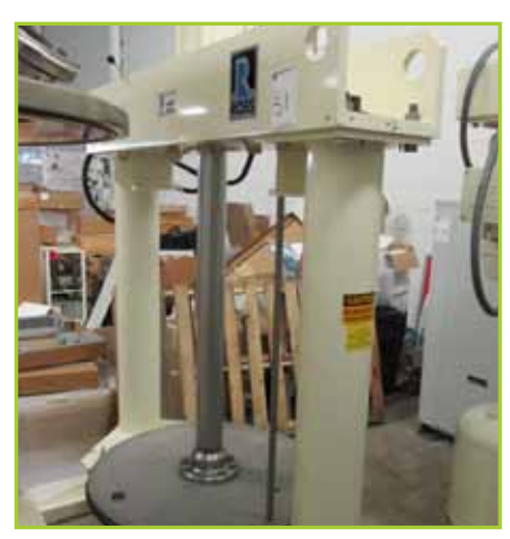
ROSS CDA-200 DUAL SHAFT MIXER