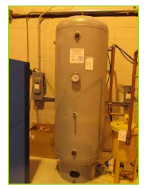
STEEL FAB AIR RECEIVING TANK, MAWP 200 PSI AT 400 DEGREE F, MDMT -20 DEGREE F AT 200 PSI, YEAR: 2011