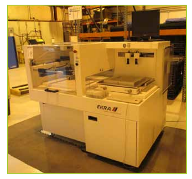
ASYS EKRA X1-SL CELL SCREEN PRINTER, 120V, 60 HZ, 24/42 V DC, 1 PHASE, 12 KW, 10 AMPS, 6 BAR W/ EXTRA CELL PLATES, YEAR: 2010