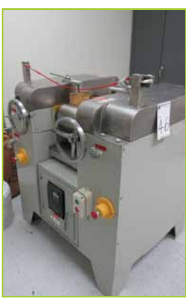
TORREY HILLS TECH 6 X 12 THREE ROLL MILL