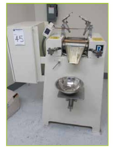
ROSS TRM-4 X 8 THREE ROLL MILL