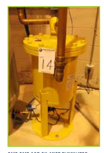
CME CME-125 OIL MIST ELIMINATOR