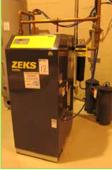
ZEKS HEAT SINK 250HSGA400 TRUE CYCLING AIR DRYER, 300 PSIG, YEAR: 2011