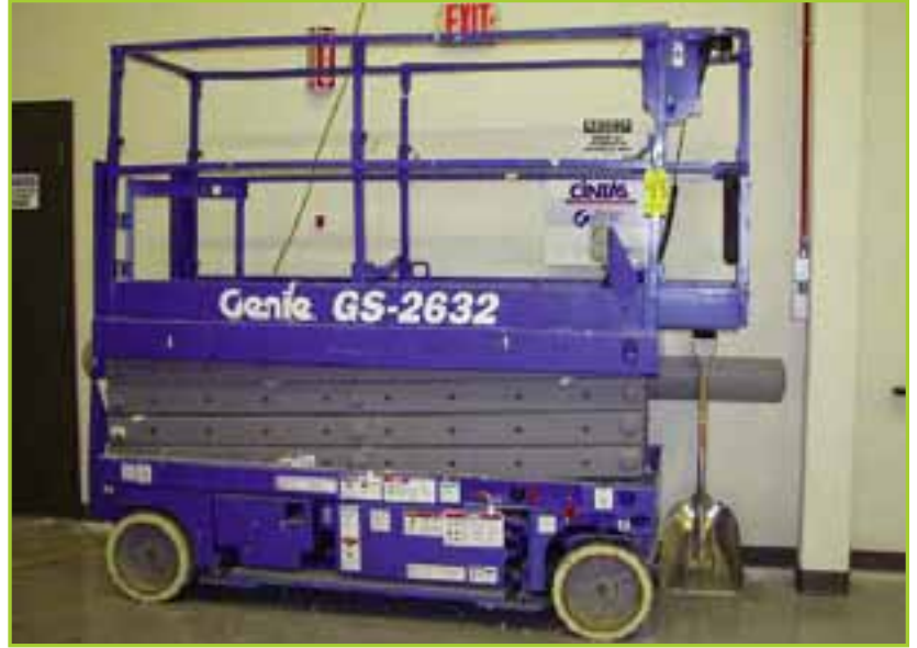
GENIE GS-262 SCISSOR LIFT