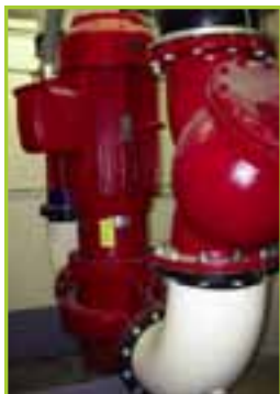
(2) ARMSTRONG PUMPS