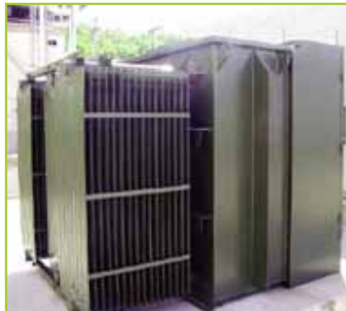
3 PHASE PAD MOUNTED TRANSFORMER