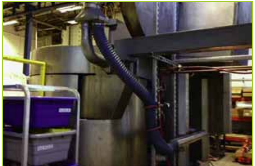
MEYER BURGER MDL. BS 805/2 BAND SAW