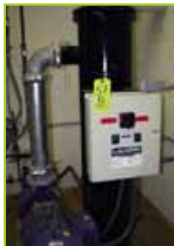
AMT SUBMERSIBLE PUMP