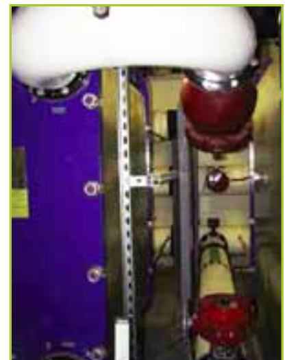
(3) 2011 SONDEX HEAT EXCHANGERS