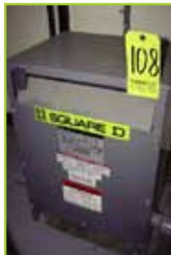
SQUARE D TRANSFORMER