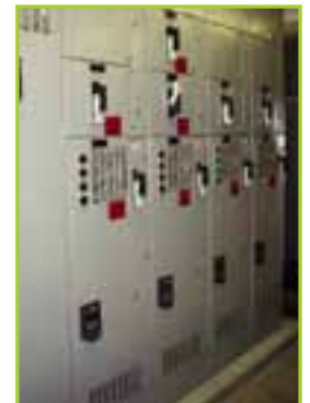
SIEMENS TRISTAR MCC