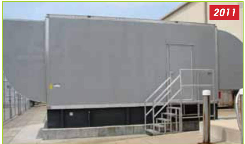
CATERPILLAR DIESEL GENERATOR