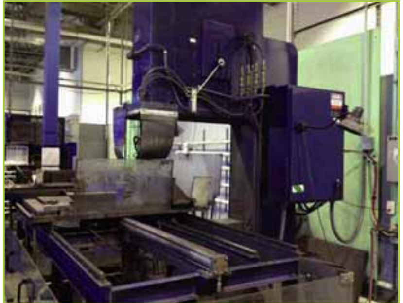
36" TANNEWITZ MDL. G1NE BAND SAW