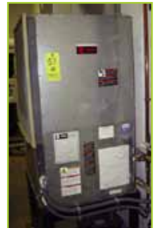
(4) TRANE AIR CONDITIONERS