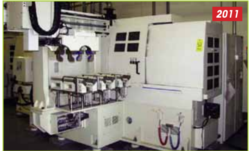
OKOMOTO HIGH PRECISION PV INGOT SQUARING MACHINE

CAMFIL/FARR DUST COLLECTOR SYSTEM w/Smoot Filter & Controls