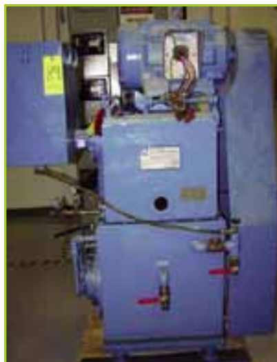
(2) TUTHILL VACUUM & BLOWER SYSTEMS