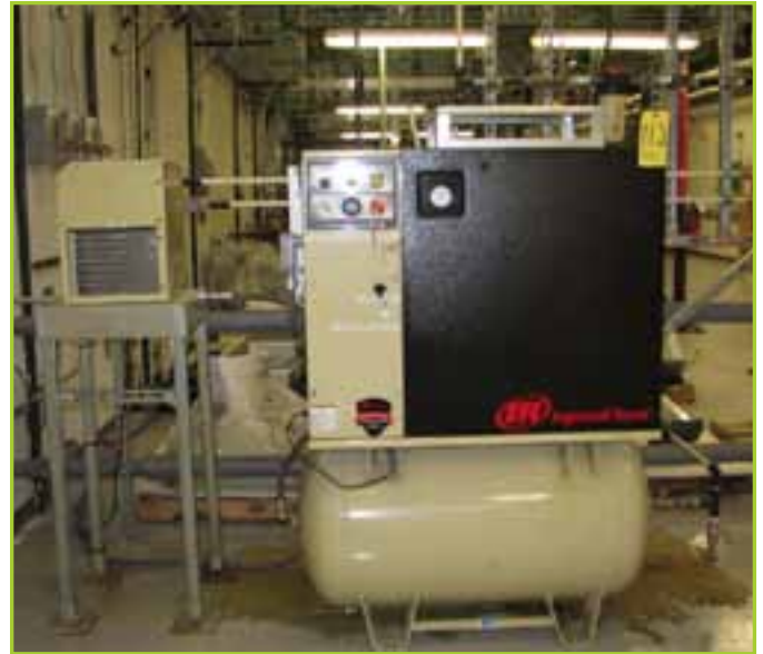
INGERSOLL RAND AIR COMPRESSOR