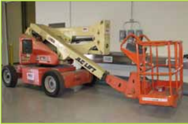
JLG MAN LIFT