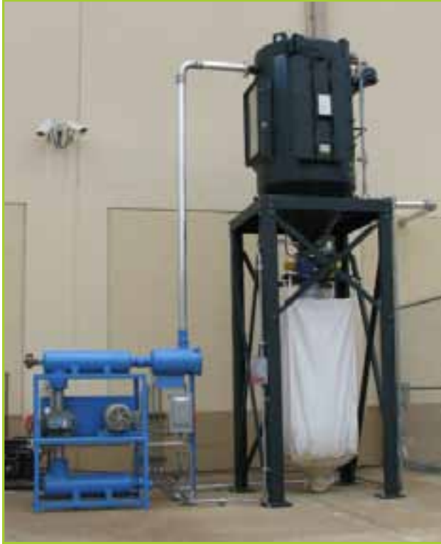
HURCO MB1 VERTICAL MILLING MACHINE