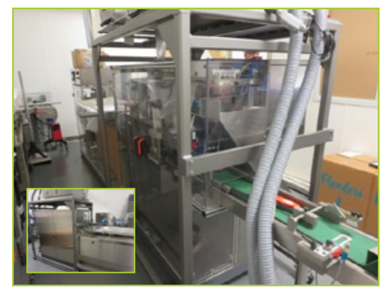
IMA / PRECISION GEARS LTDTR 100 XL BLISTER PACKER. STAND ALONE BLISTER MACHINE (UP TO 150 BLISTERS/MIN) FLEXIBLE FEATURES, FOR SMALL TO MEDIUM PRODUCTION RUNS, MADE ENTIRELY OF STAINLESS STEEL, THIS INTERMITTENT WORKING & PLATEN-SEALING MACHINE CAN WORK WITH ALL KINDS OF MATERIALS ON A SINGLE OR MULTI- LANE BLISTER PRODUCTION. INCLUDES ENTRY CONVEYOR & (1-HASKRIS R050 CHILLER S/N-HB21949). APPROX 15FT L X 4FT W X 5FT HIGH. YEAR NEW: 2006