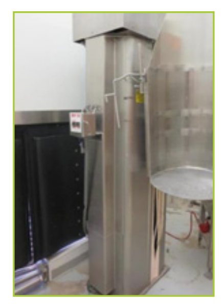
BULK CONTAINER SYSTEM 610001 BARREL DUMPER. STAINLESS STEEL DESIGN FOR 30 GAL BARRELS