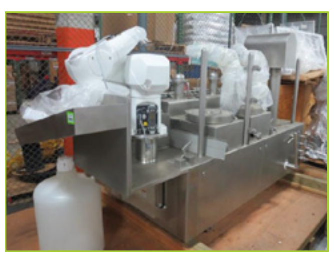
BAUSCH TYPE 534 THE BAUSCH TYPE 534 FILLING MACHINE IS PRIMARILY DESIGNED FOR DOSING CONTAINERS. THE CONTAINER TRANSPORT SYSTEM CONSISTS OF A ROTARY INFEED TABLE, A WALKING BEAM TRANSPORT, AND A ROBOT ASSISTED DISCHARGE. EXPOSED SURFACES OF THE EQUIPMENT ARE COMPOSED OF 316L STAINLESS STEEL OR OTHER CORROSION RESISTANT MATERIALS (NON-METALLIC). AN ALLEN BRADLEY CONTROL LOGIX PLC CONTROLS THE TYPE 534. ENTERING PARAMETERS AND MACHINE SPEEDS, VIEWING FAULT MESSAGES, AND OPERATING OF THE MACHINE ARE PERFORMED USING THE AB VERSAVIEW TOUCH SCREEN.THE MACHINE IS CURRENTLY CONFIGURED TO FILL 10ML SERUM VIALS WITH FILL RANGES OF 1.1 ML TO 9.9ML VIA A FLEXICON PD12I PUMP.

BAUSCH TYPE 534 THE BAUSCH TYPE 534 FILLING MACHINE IS PRIMARILY DESIGNED FOR DOSING CONTAINERS. THE CONTAINER TRANSPORT SYSTEM CONSISTS OF A ROTARY INFEED TABLE, A WALKING BEAM TRANSPORT, AND A ROBOT ASSISTED DISCHARGE. EXPOSED SURFACES OF THE EQUIPMENT ARE COMPOSED OF 316L STAINLESS STEEL OR OTHER CORROSION RESISTANT MATERIALS (NON-METALLIC). AN ALLEN BRADLEY CONTROL LOGIX PLC CONTROLS THE TYPE 534. ENTERING PARAMETERS AND MACHINE SPEEDS, VIEWING FAULT MESSAGES, AND OPERATING OF THE MACHINE ARE PERFORMED USING THE AB VERSAVIEW TOUCH SCREEN. THE MACHINE IS CURRENTLY CONFIGURED TO FILL 10ML SERUM VIALS WITH FILL RANGES OF 1.1ML TO 9.9ML VIA A FLEXICON PD12I PUMP. CHANGE PARTS ARE AVAILABLE FROM BAUSCH FOR OTHER VIAL SIZES. THE SEQUENCE OF THE INDIVIDUAL STEPS IS AS FOLLOWS: CONTAINER REGISTRATION; GAS FLUSHING WITH VACUUM EXTRACTION; CHECKING FOR SUFFICIENT GAS AND VACUUM LEVELS; CONTAINER DOSING; CONTAINER CLOSING WITH STOPPER AND CHECKING FOR THE PRESENCE OF A CAP; CAPINTEC TRANSFER; CONTAINER DISCHARGE/REJECT/SAMPLING