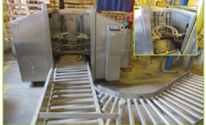
FRYMA CUSTOM FRYMA COLLOID MILL. WITH MIXER & 65 LITER TANK, HAKKE HEATER, HAKKE WATERBATH, MIXING TANK, CLEAN IN PLACE SKID WITH SCALE SKID