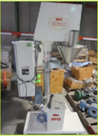
BULK CONTAINER SYSTEM 610001 BAR-REL DUMPER. STAINLESS STEEL DESIGN FOR 30 GAL BARRELS