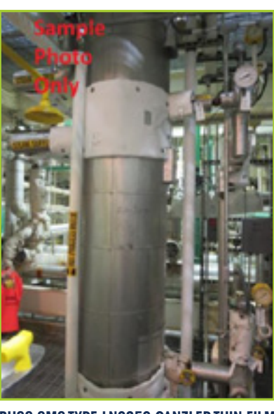
BUSS SMS TYPE LN0350 CANZLER THIN FILM EVAPORATOR