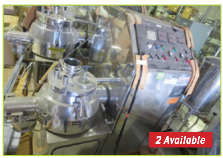
POWREX FM-VG-25 HI SHEAR VERTICAL GRANULATOR. STAINLESS STEEL CON-STRUCTION15L NET CAPACITY, WITH VARIABLE SPEED IMPELLER FROM 60-500 RPM AND CROSS-SCREW SPEED FROM 360-3600 RPM, 120/220V. YEAR NEW: 1997