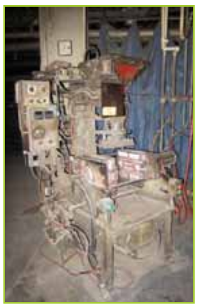
REDFORD SHELL CORE MACHINE MODEL# HP43