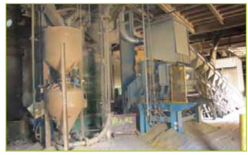
KINEMATICS MDL.TMTM90X11.0 9'X 11'SHAKEOUT S/N C8178-1,GENERAL KINEMATICS MDL.TMSM37,46 X 15.0 36/48"X15'SHAKEOUT CONVEYOR S/N C8178-2,GENERAL KINEMATICS MDL. SCRLSV 36X22X50.0 36"X50' HOODED INCLINE OSCILLATING CONVEYOR S/N C8178-3, GENERAL KINEMATICS MDL. VM64 VIBRAMILL S/N C8178-4, UNIVERSAL MDL.U2-800 APPROXIMATELY 40' BUCKET ELEVATOR, SURGE HOPPER, 1994 SIMPSON 2 CELL PROCLAIM S/N E-9402003 WITH 75HP BLOWER, UNIVERSAL MDL. UN-800 20' BUCKET ELEVATOR, DYNAMIC AIR SYSTEM 400 TRANSPORTER&PIPING WITH ALLEN BRADLEY PLC CONTROLS,(2) 4438 C.F. SAND SILOS 12' DIAMETERX58'HIGH MDL.45-90 S/N 16048-1,16048-2WITH SUPPORT STRUCTURE,(2) DYNAMIC AIR MDL. 8J-30 & 10J-300 SAND TRANSPORTERS WITH PIPING