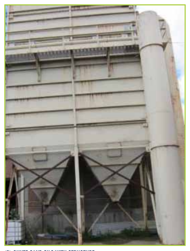
(2) CHUTE SAND SILO WITH STRUCTURE