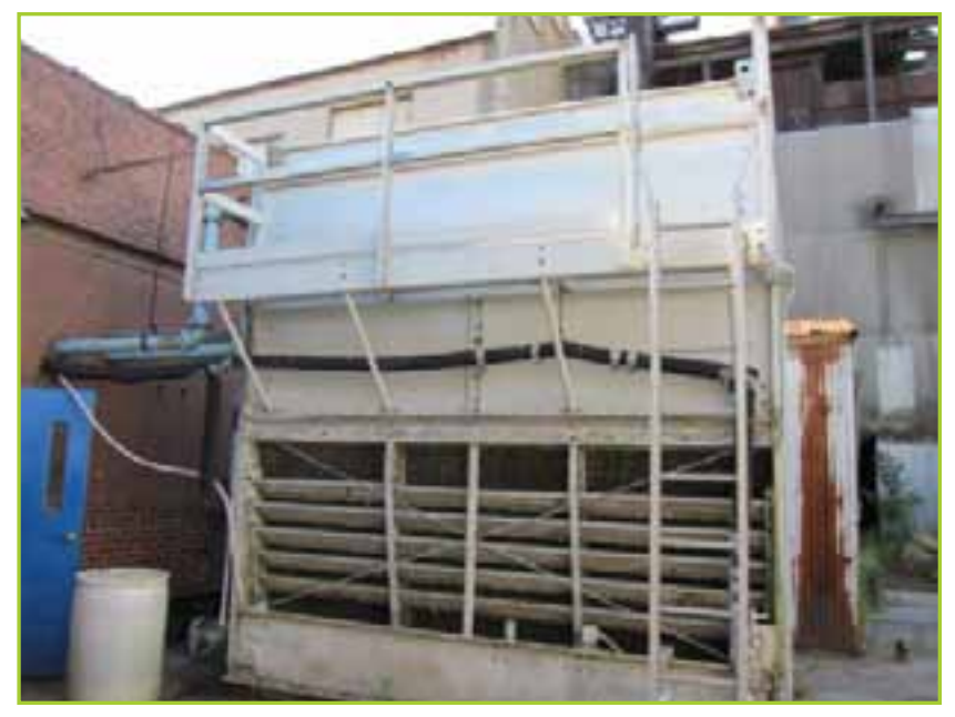
144" WIDE X 101" DEEP MODEL# FXV-443-R