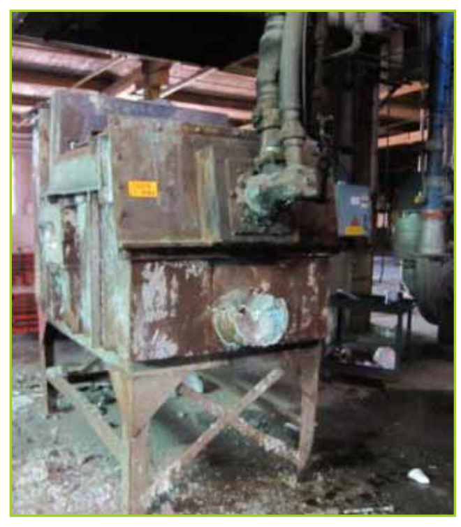
LIQUID NITROGEN TANK, 10626