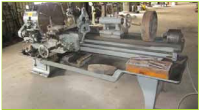
LATHE WITH 12" GAP,20-670 RPM SPINDLE SPEEDS,20" FACE PLATE,TOOL POST,TAPER ATTACHMENT,THREADING DIAL,TAILSTOCK