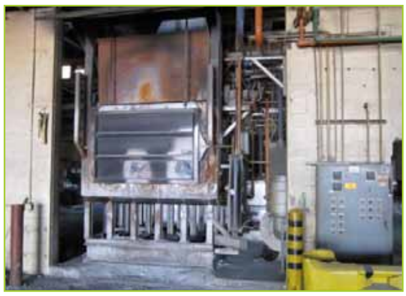
HEARTH ALUMINUM MELTING FURNACE WITH 15HP BLOWER (3) BURNERS,GAS SYSTEM AIR DOORS,WET PUMP SYSTEM, RATED AT 2000# PER HOUR