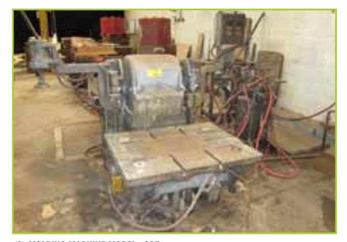
(2) MOLDING MACHINE MODEL# 815