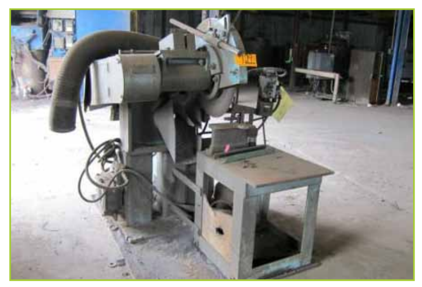
4PMCD S/N 6784656