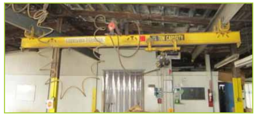
APPROXIMATELY 14' SPAN UNDER RUNNING BRIDGE CRANE WITH PNEUMATIC HOIST