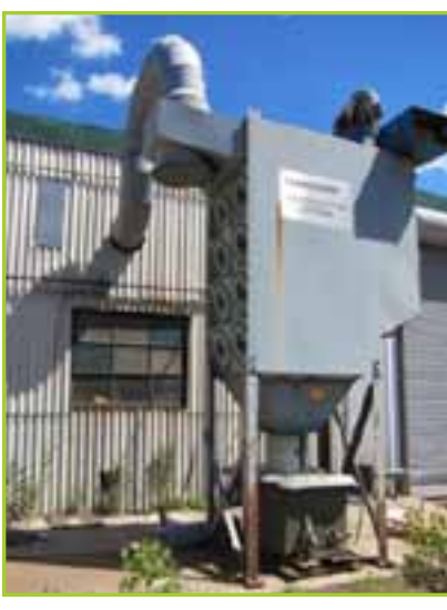
PANGBORN DUST COLLECTION SYSTEM MODEL# PC4-16