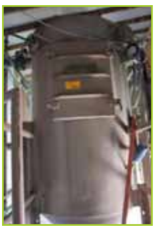
DYNAMIC AIR MODU-KLEEN DUST FILTER