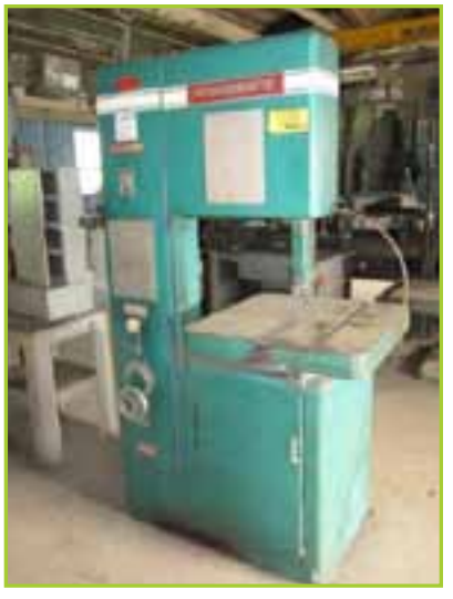
POWERMATIC BANDSAW MODEL# 87 WITH 24"X24" WORK TABLE, BLADE WELDING & GRINDING ATTACHMENT