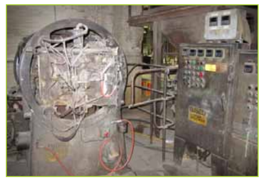
HONEYWELL PLC CONTROLS, MODEL# U-180, DUAL GAS, GUN DRILLED HEATER PLATES