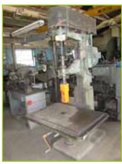
DRILL PRESS MODEL# 3B15 WITH 2HP MOTOR