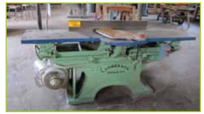
L.POWER & CO. GUIDE FENCE S/N 1-1219