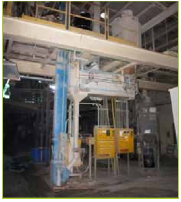
OF:SURGE TANK, KLOSTER 9 TPH SAND HEATER/COOLER S/N 7478 (NEW 1997), WITH BOILER & BLOWER ,UNIVERSAL BUCKET ELEVATOR, KLOSTER TYPE 1300# SAND MIXER S/N MS7321, CORE DELIVERY SYSTEM S/N MS7500, ALLEN BRADLEY DTAM PLUS PLCCONTROLS & PANGBORN MOD. PC486 DUST COLLECTOR