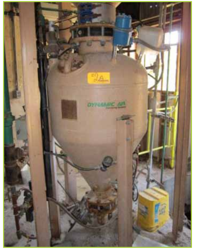
DYNAMIC AIR 10J-100 TANK