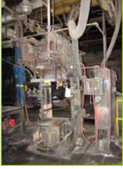
COLD BOX CORE / MOLDING MACHINE MODEL# CB-15-GF