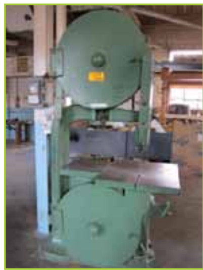
BANDSAW MODEL# 950 WITH 26"X30" WORK TABLE & EXTENSION