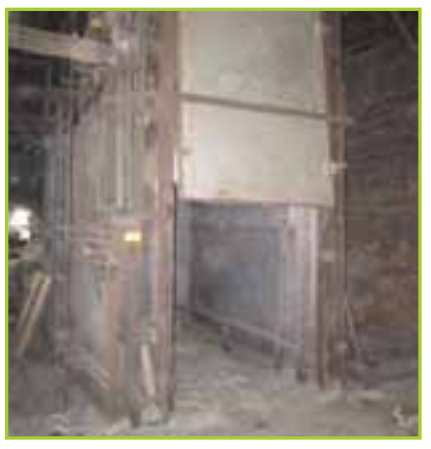
WALK IN OVEN 59" WIDE X 82" HIGH X 140" LONG, WITH (12) BURNER, 30" DIAMETER, 22" DEEP PLC CONTROLS & CHART RECORDER