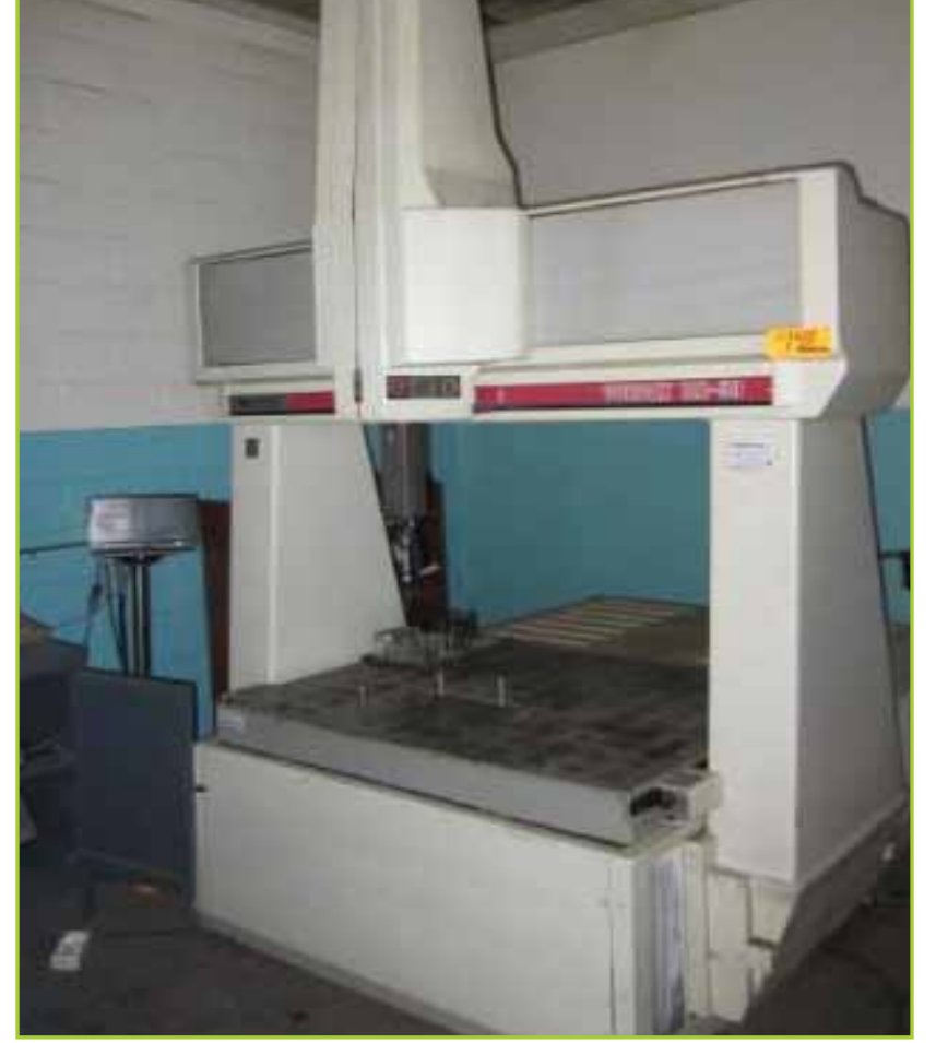
COORDINATE MEASURING MACHINE WITH 51"X43"X6" DRILLED & TAPPED WORK TABLE, TRAVELS; X-AXIS 60", Y-AXIS 54", Z-AXIS 7" SHEFFIELD MEASUREMENT PROCESSOR, 3-AXIS READOUT, HEWLETT PACKARD MDL.86B CPU, MONITOR & KEYBOARD MODEL# RM-50