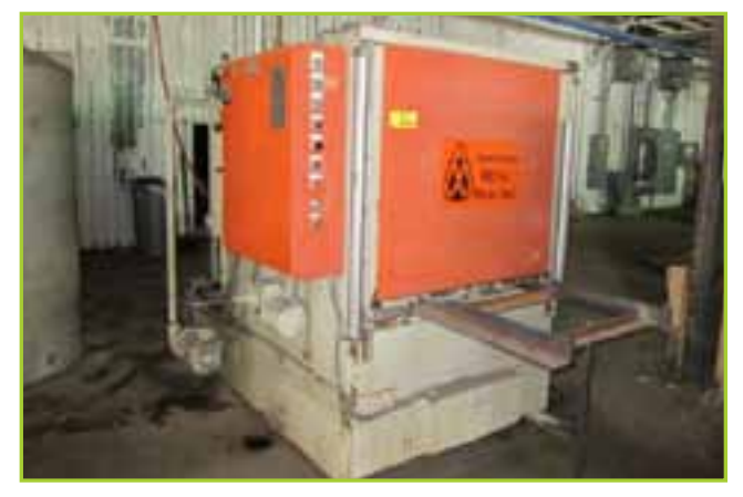
46"X40" OPENING HYDRAULIC DOOR, 7.5 HP PUMP, 100 GALLON TANK 45HP HYDRAULIC SYSTEM91-425 MODEL# 1000