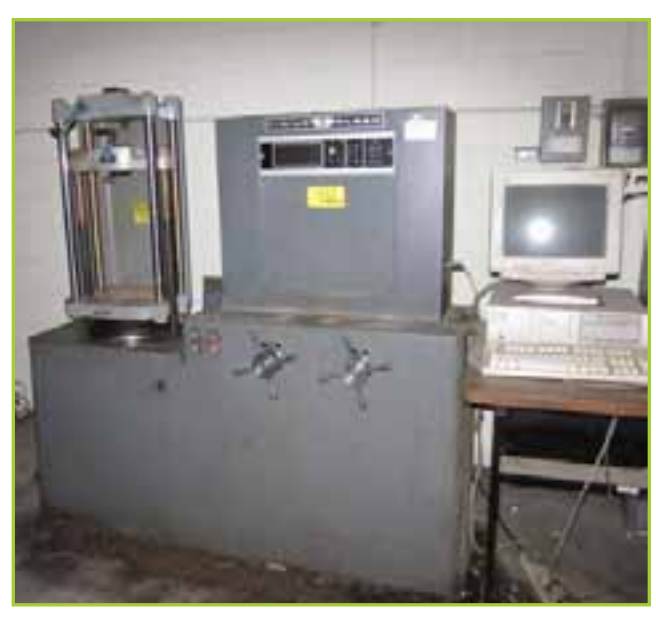
TENSILE TESTER WITH MDL.290 PLC CONTROLS,HEWLETT PACKARD PRINTER & EXTENIOMETER