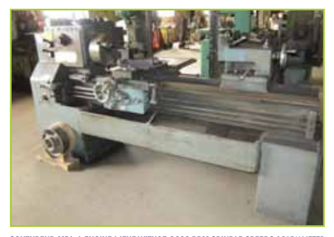
SOUTHBEND MDL.A ENGINE LATHE WITH25-1000 RPM SPINDLE SPEEDS , 10" DIAMETER 3 JAW CHUCK, TOOL POST, CROSS SLIDE, TAPER ATTACHMENT, TAIL STOCK, 4 JAW CHUCK