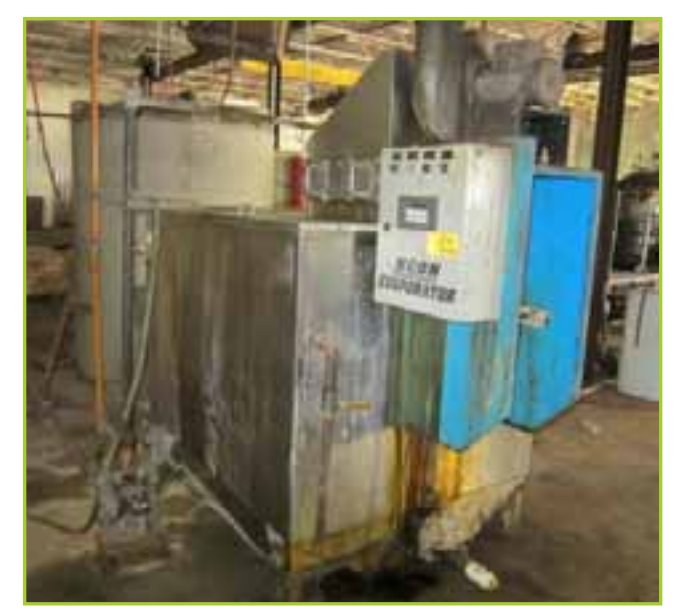
STEEL CONSTRUCTION MODEL# N33Y-35