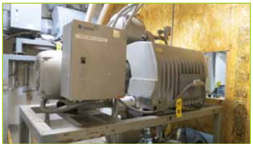
(3) BUSCH VACUUM PUMP, MODEL: 0630CA2A1, 24 HP