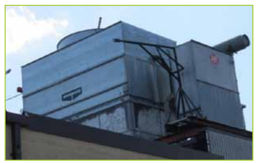
EVAPCO EVAPORATIVE CONDENSER, MODEL: ATC-442B S/N: 8-384012