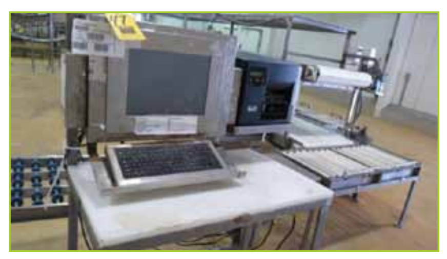
(2) RICE LAKE 10,000 LB CAPACITY DIGITAL OVER UNDER UNITS, MODEL: CW801-2A