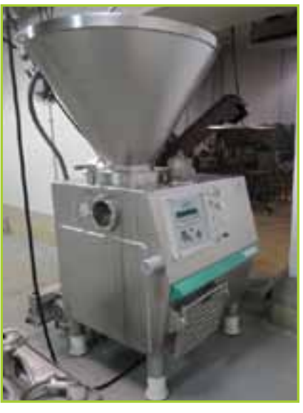
TRIANGLE VEMAG STUFFER, MODEL: HP-10C,W/ BUSCH VACUUM PUMPS & DUMPER. FILL & SEAL MACHINE