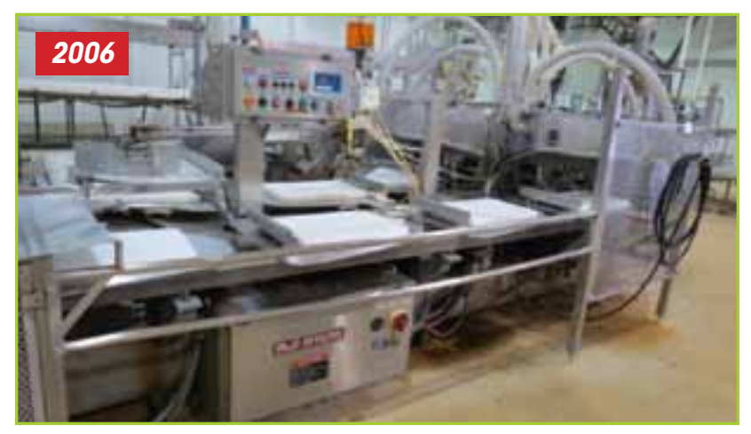
2006 CRYOVAC OLD RIVERS 6-HEAD VACUUM PACKAGER, MODEL: 8600B-18-264, WITH VACUUM PUMP