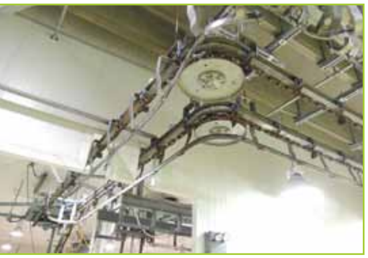
APPROXIMATELY 450' MEAT RAIL SYSTEM, WITH INCLINE, SWITCHES, DRIVE CHAIN, LOWERATOR AND DRIVES