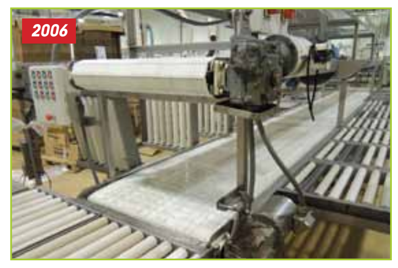
S/S FRAME CONVEYOR SYSTEMS - NEW 2006