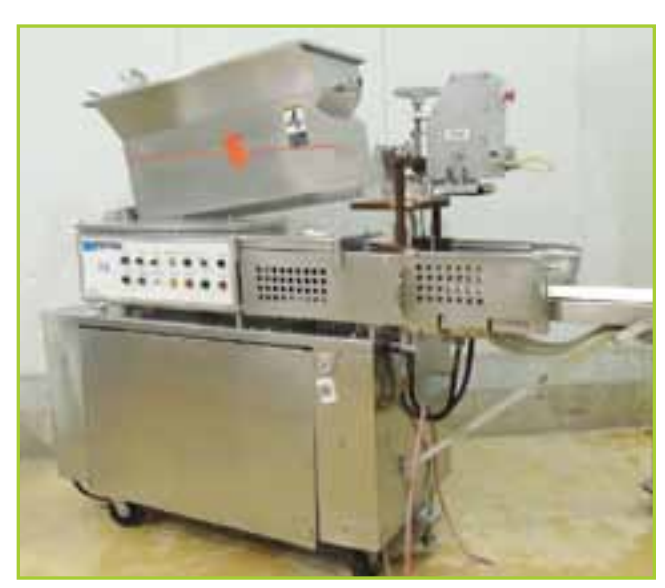
FORMAX PATTY FORMER, MODEL: PFM-6, S/N: 123, WITH ACCESSORIES.