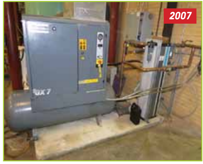
2007 ATLAS COPCO AIR COMPRESSORS