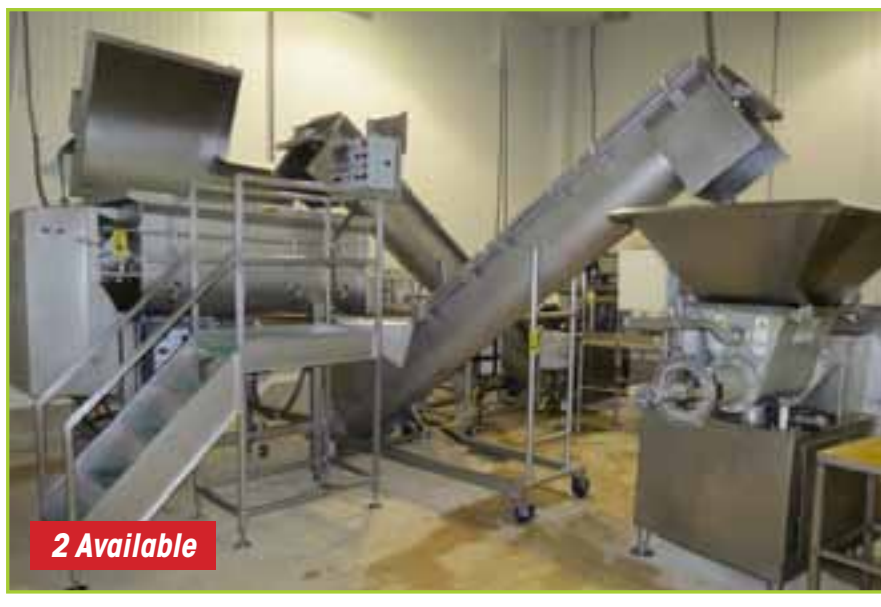
(2) 2006 AMFEC APPROXIMATELY 15' S/S INCLINED AUGER, WITH 18" FLIGHTS, HOPPER, AND DRIVE, MODEL: 150