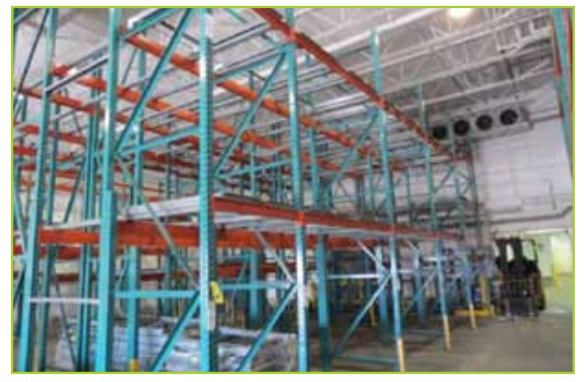
SECTIONS PALLET RACKING, APPROXIMATELY 18' HIGH, WITH (5) UPRIGHTS, (22) CROSS BRACES, AND (22) WIRE BEDS