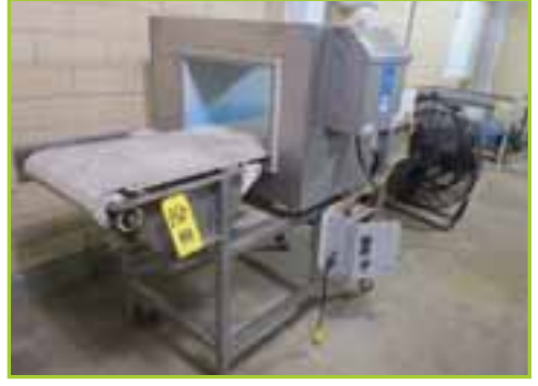
LOMA IQ2 METAL DETECTOR, WITH CONVEYOR AND 19 1/2" X 12" WESTON ELECTRIC MEAT GRINDER, MODEL: 08-2201-W