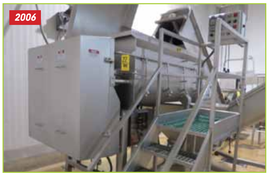
2006 AMFEC 2,000 LB CAPACITY S/S DUAL PADDLE BLENDER, MODEL: 510, S/N: 070406, WITH CO2 INJECTION MOUNTED ON LOAD CELLS, WITH PLATFORM, STARTERS, AND CONTROLS