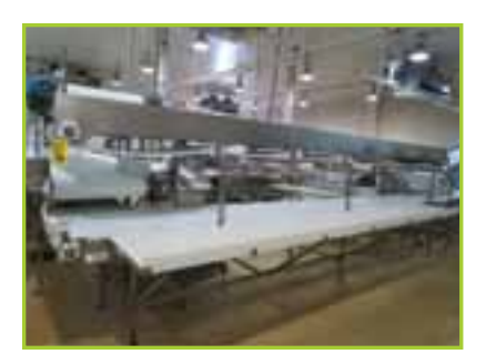
APPROXIMATELY 41' X 30" S/S BI-LEVEL TRIM TABLE, WITH INTERLOX BELT. CUTTING BOARDS. AND DRIVES

Assorted Weiler Grinder Plates and Knives