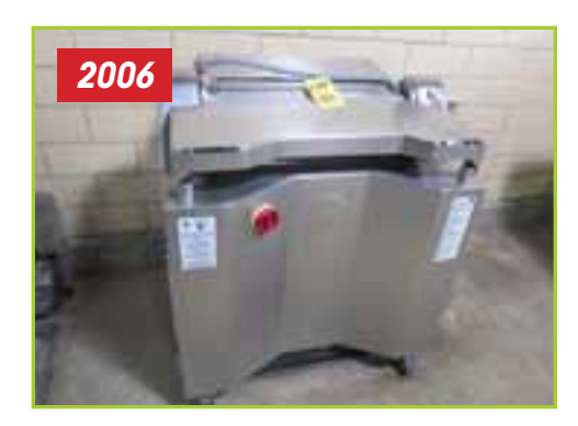
2006 TOWNSEND SKINNER