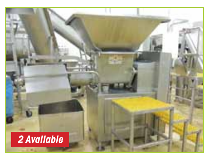
2006 WEILER GRINDER, MODEL: 878