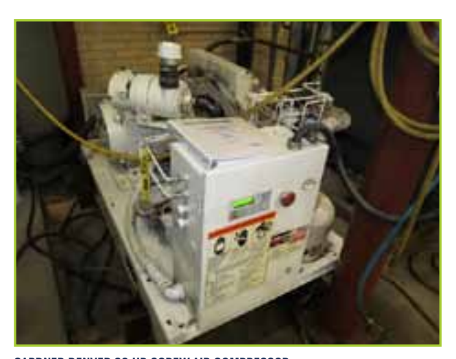
GARDNER DENVER 30 HP SCREW AIR COMPRESSOR

(60) Pallet Rack Cross Braces; (18) 2-Deep Roller Beds; Assorted Pallet Rack Rollers and Bed Components