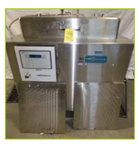
COZZOLI GW-24 VIAL/STOPPER WASHER, S/N GW24-228, MMI-240 CONTROL, (4) SPARE HOLDERS