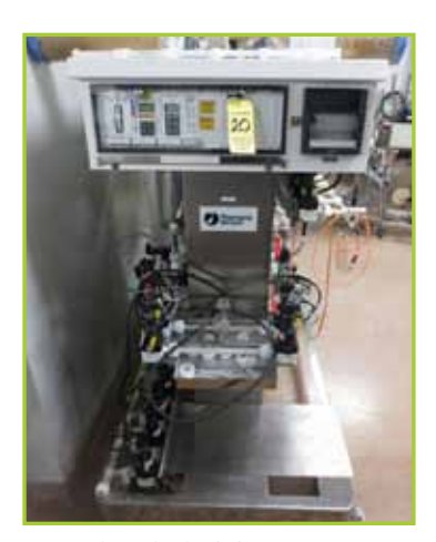
PHARMACIA BIOTECH SYSTEM 255 Purification Skid, PC, Panels