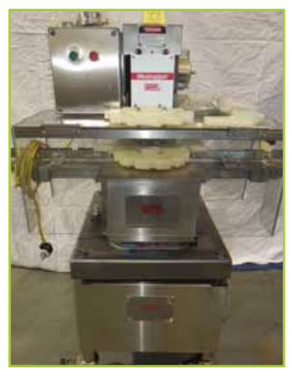
GENESIS PW500 2006 WEST CAPPER