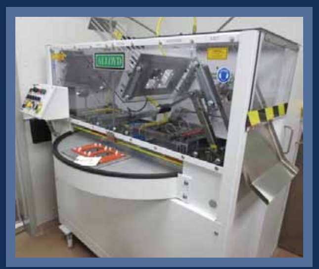
Scan this QR Code with your smartphone for More Information.

Purification Skids • DCU Systems • Comminutors • Explorer • Digital Scales Magnetic Separators • Sieve Shakers • Blister Packaging Machines • Accumulation Tables • Westcappers • Sealer • Vial/Stopper Washers • Liquid Filler • Reactor Vessels • Teflon Coated SSPV • Hazardous Location Vacuum Cleaners • Particle Analyzer • Fluorescence Detector • Freezer • And Much More