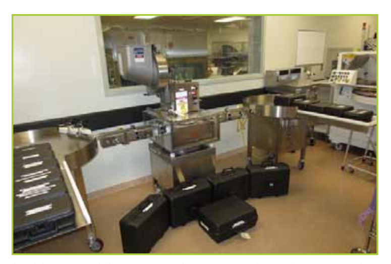
GENESIS PW-500 WESTCAPPER 2001 AUTOMATED PHARMA CAPPER, S/N P-1178, (2) US243 ROTATING TABLES, TOOLING

LOCATION: 16 DEER RUN RD. CANDIA, NH 03034