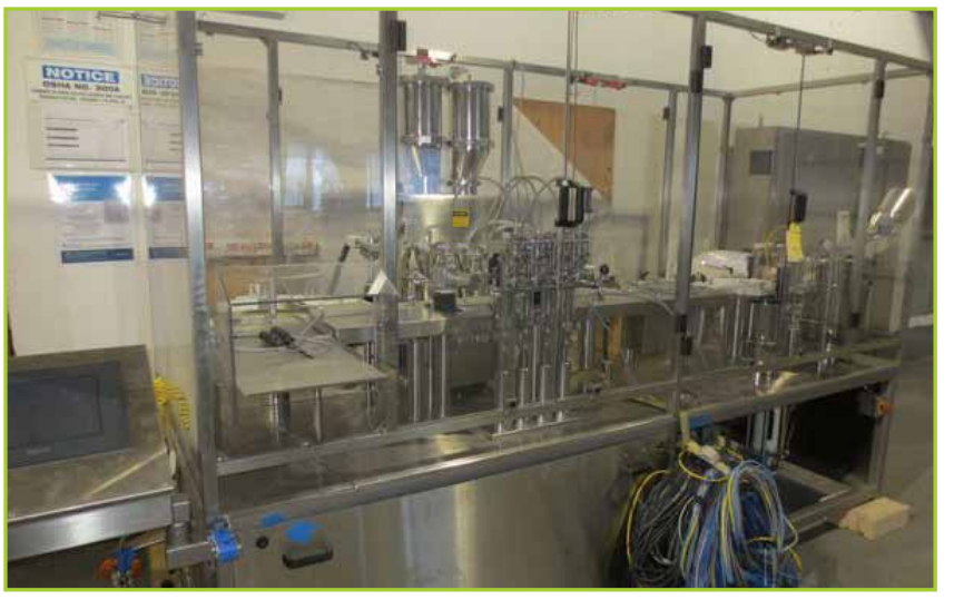
M&O PERRY CU-1013 FORM FILL AUTO FILLER, S/N P-791, POWDER & LIQUID FILLING, STOPPER INSERTION, CHECKWEIGH, 20 ML VIAL, HEPA FILTERS, (4) NEEDLE, VIAL REJECTION