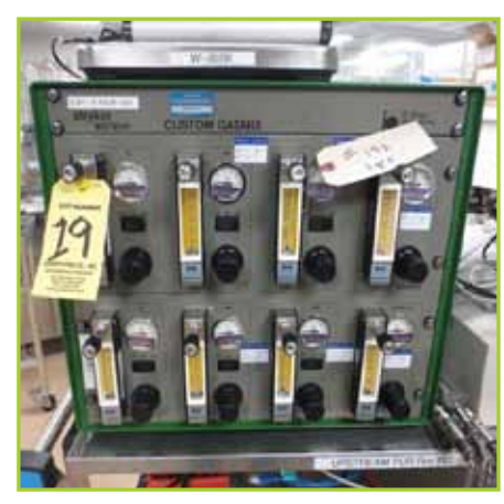
B. BRAUN BIOTECH DCU BENCHTOP FERMENTER