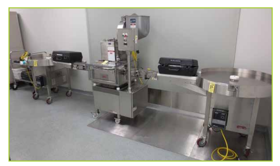
GENESIS NPW-500 WESTCAPPER 2004 AUTOMATED PHARMA CAPPER, S/N XC-31717, (2) GENESIS RU-36 ACCUMULATION TABLES, 20ML STAR WHEEL, 100ML STAR WHEEL, 10ML STAR WHEEL