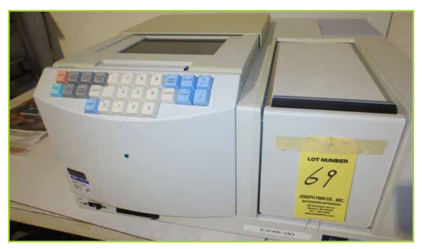
PERKIN ELMER LAMBDA EZ-201 UV/VIS SPECTROMETER