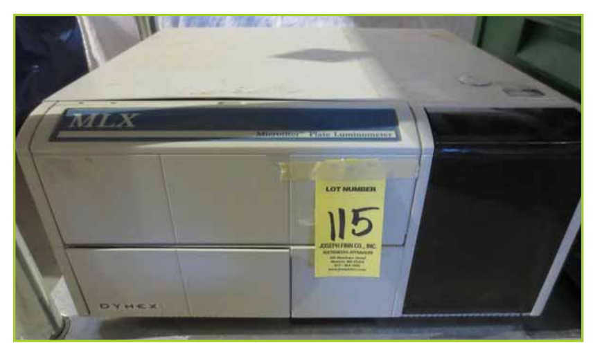
DYNEX MLX MICROTITER PLATE LUMINOMETER, S/N 112A-1066