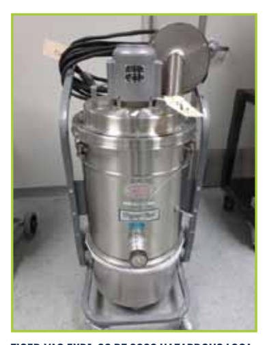
TIGER-VAC EXP1-20 DT 2009 HAZARDOUS LOCA-TION VACUUM, EXPLOSION & DUST IGNITION PROOF