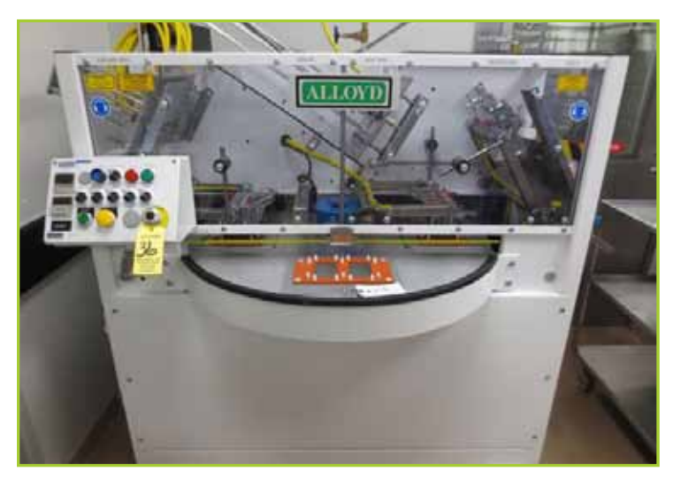
ALLOYD 4SC 2004 6X9 ROTARY BLISTER PACK MACHINE