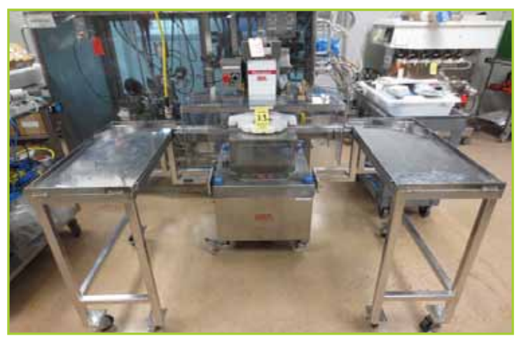
GENESIS PW-200 WESTCAPPER 1997 AUTOMATED PHARMA CAPPER, S/N 1158, (2) SS TABLES, 20ML, SMALL VIALS, 20Z VIAL, 100ML STARWHEELS