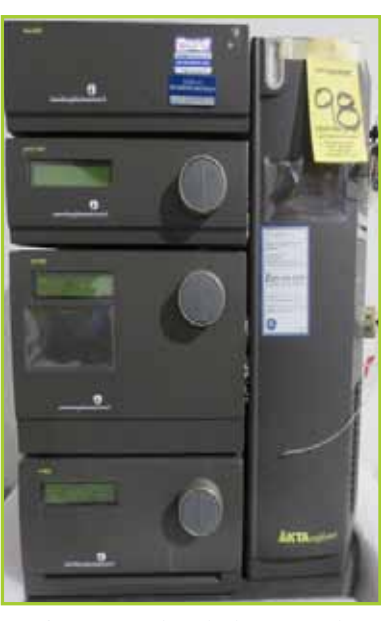
AMERSHAM PHARMACIA BIOTECH AKTA EXPLORER, S/N 01024572