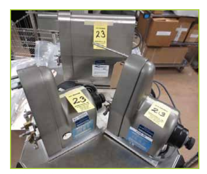
COZZOLI F400X LOT -- (3) LIQUID FILLERS, S/N 2098, 1997, CE2186, (3) 60CC FILL HEADS, (3) 20CC FILL HEADS, (4) 10CC FILL HEADS, 2CC FILL HEAD, CAP ASSEMBLIES