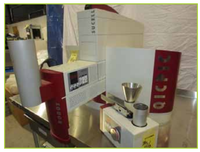
SYMPATEC QIC PIC 2007 PARTICLE SIEVE ANALYZER, S/N 164C, SU CELL/L, S/N 119B, RODOS/L, S/N 157C, VIBRI-L