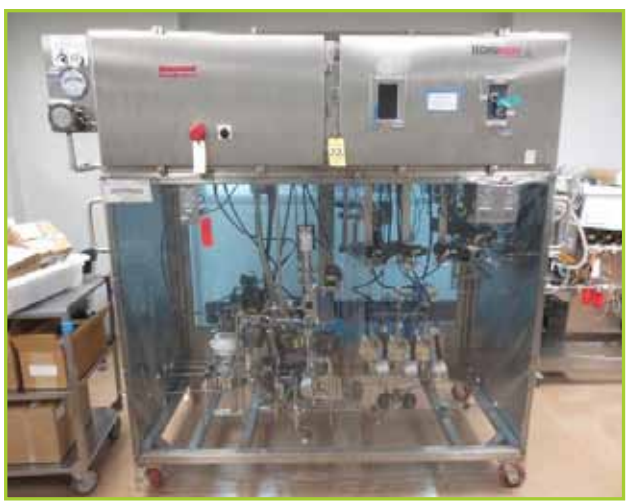
TECHNIKROM 3000-WPS-CI HPLC PURIFICATION SKID, TYPE Y OR Z