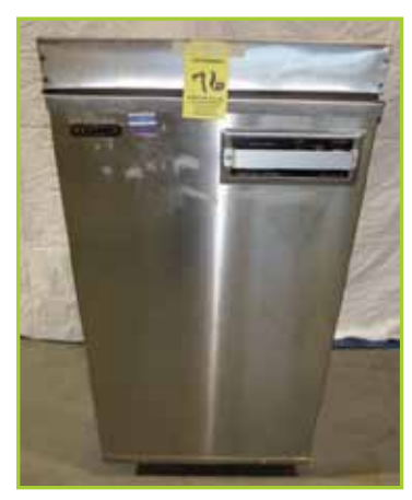
RYOMED CMS-86 LL450 CRYO FREEZER