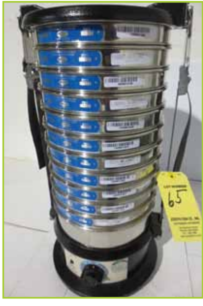
(2) VWR 1545 LOT -- DUAL INCUBATOR