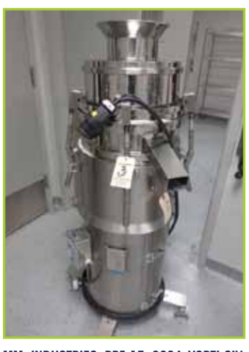
MM INDUSTRIES RBF-15 2004 VORTI-SIV, 316 STAINLESS STEEL