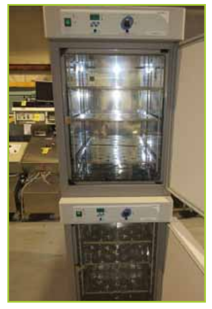
(2) VWR 1545 LOT -- DUAL INCUBATOR

100'S COLUMNS, SCALES, PUMPS, HEATERS, FREEZERS, REFRIGERATORS, HOODS, FILLERS, DRIVES, CHART RECORDERS, PUMPS, SHAKERS, OVENS, TRAYS, CARTS, TEST EQUIPMENT AND MUCH MORE!