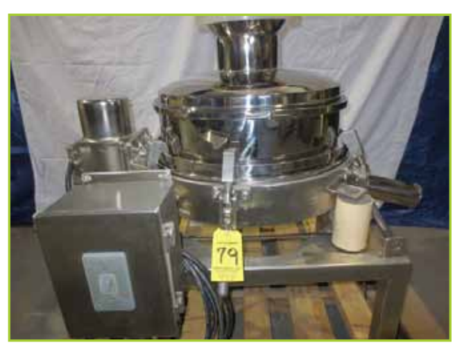
VORTI-SIV RVM-22E SS POWDER SIEVE