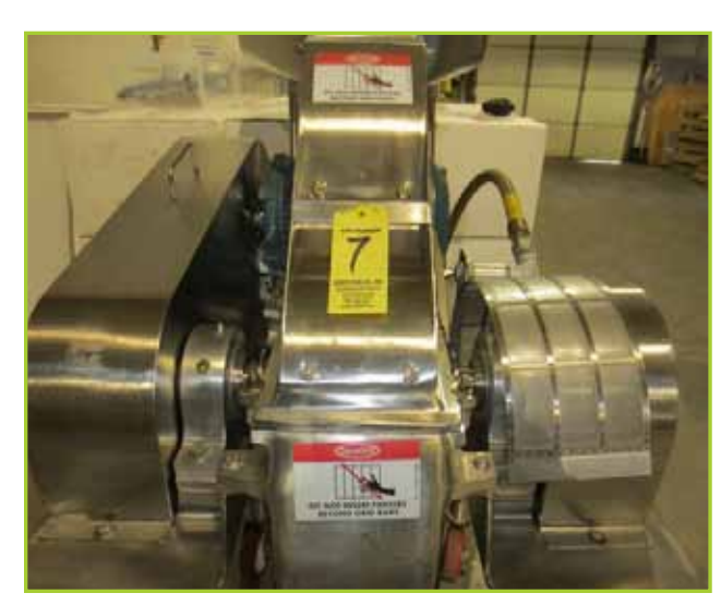
FITZPATRICK SDASO6 2005 PHARMACEUTICAL COMMINUTOR FITZ MILL

3 – Auto Labe 280 Labelling System, Model 550 Base, Inspection Gage